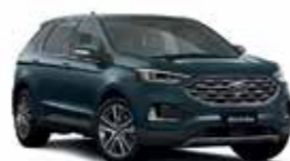
Baltic Sea Green**