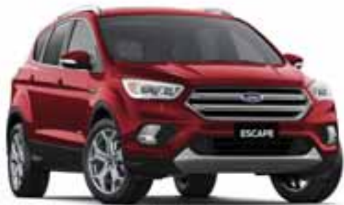
Ruby Red 1