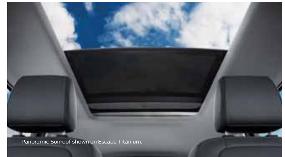
Panoramic Sunroof shown on Escape Titanium!