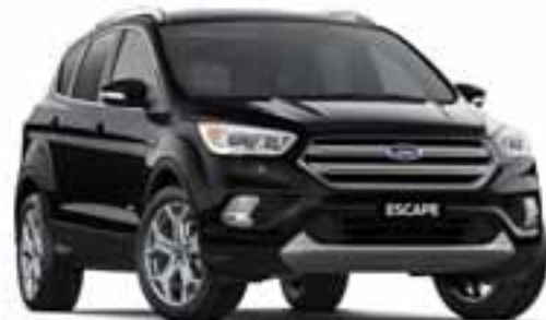
Shadow Black 1