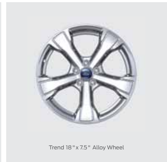
Trend 18" x 7.5" Alloy Wheel