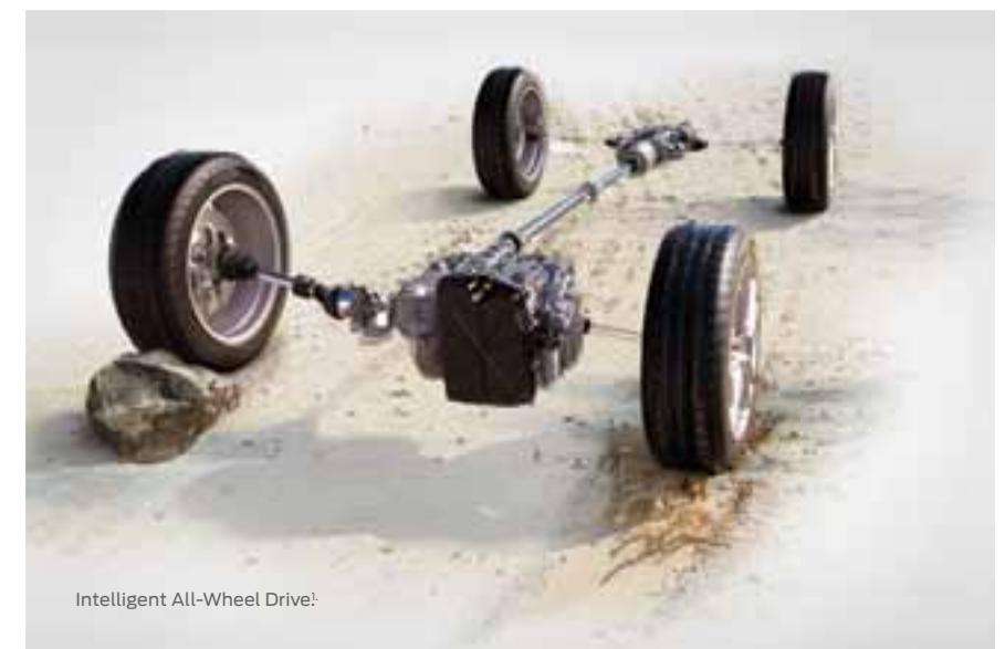
Intelligent All-Wheel Drive!

Intelligent All-Wheel Drive! For greater control in challenging conditions, the Intelligent All-Wheel Drive system is designed to monitor Escape's performance and adjusts the delivery of torque to each wheel every 16 milliseconds.