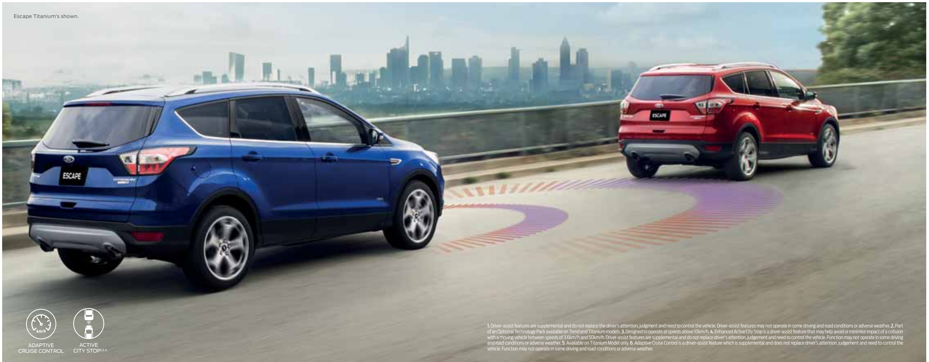
Escape Titanium's shown.