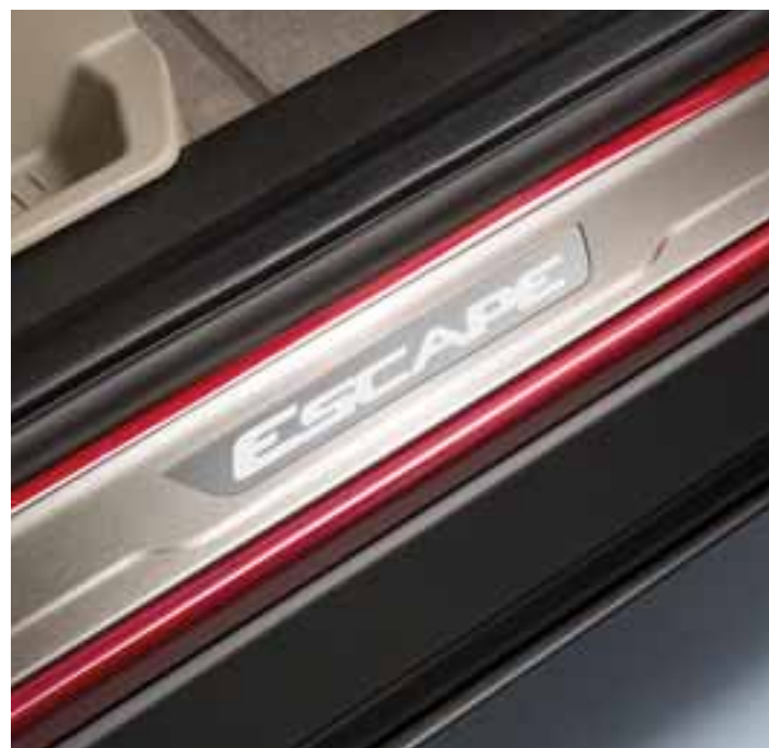
Scuff Plates. Elegant polished stainless steel scuff plates, with etched 'Escape'.