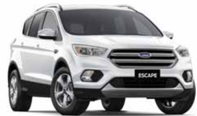
Escape Trend shown in Frozen White.