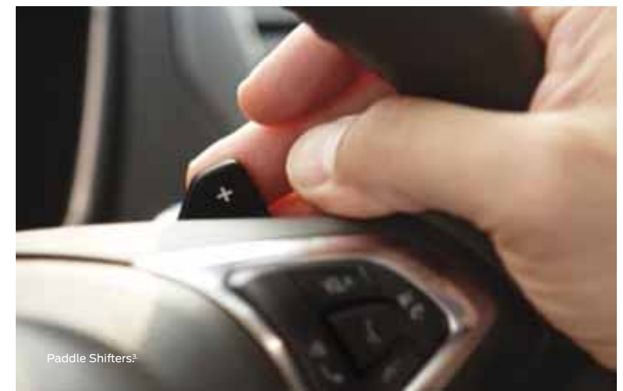
Paddle Shifters 3