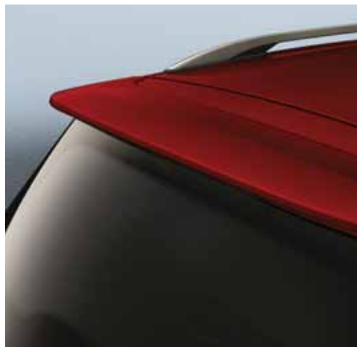
Spoiler. Give your vehicle a sportier profile and enhanced aerodynamics.