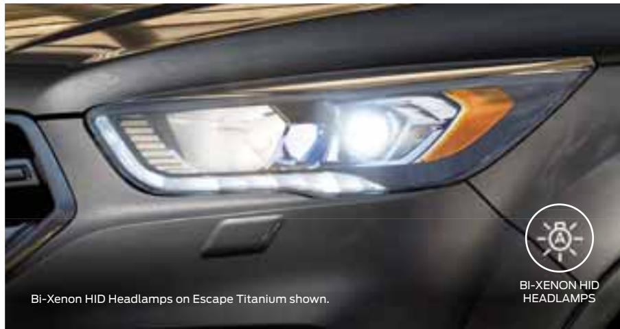
Bi-Xenon HID Headlamps on Escape Titanium shown.