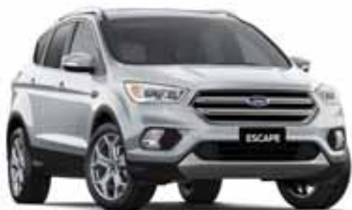
Moondust Silver 1