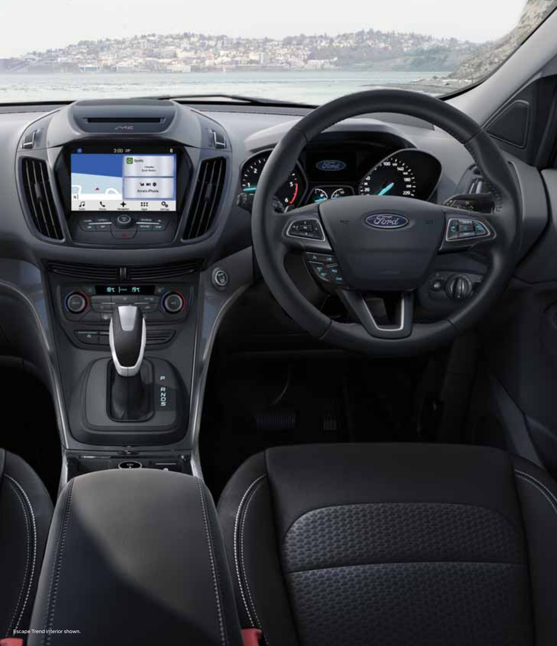
Escape Trend interior shown.