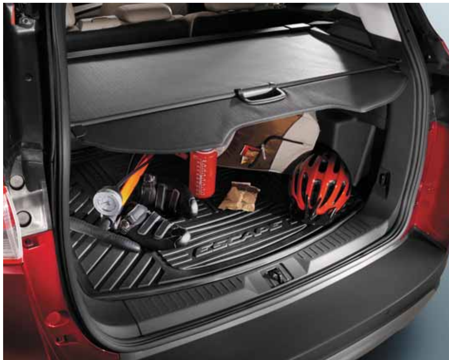
Waterproof Luggage Compartment Mat. Keep your boot clean and pristine whatever the weather, with an anti-slip mat tailored to fit the Ford Escape perfectly.