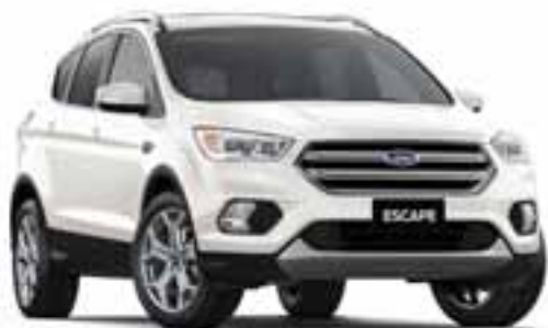
White Platinum TriCoat 1