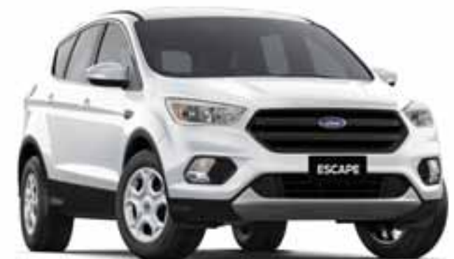
Escape Ambiente shown in Frozen White.