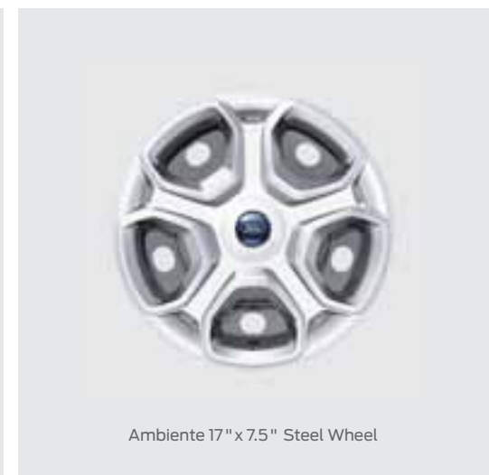
Ambiente 17" x 7.5" Steel Wheel