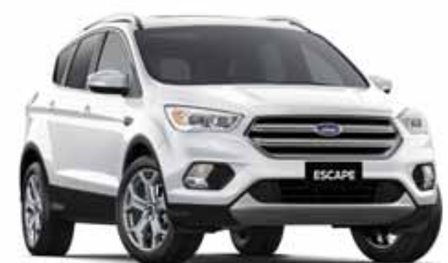
Escape Titanium shown in Frozen White.