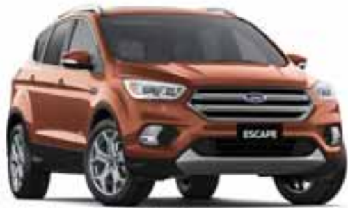
Copper Pulse 1