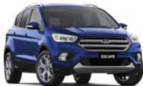
Deep Impact Blue 1