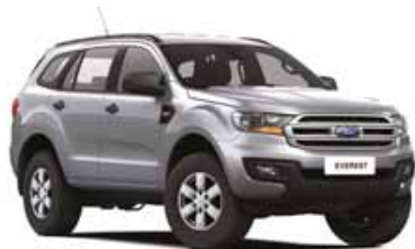
Everest Ambiente shown in Aluminium.