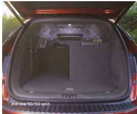
3rd-row 50/50 split.