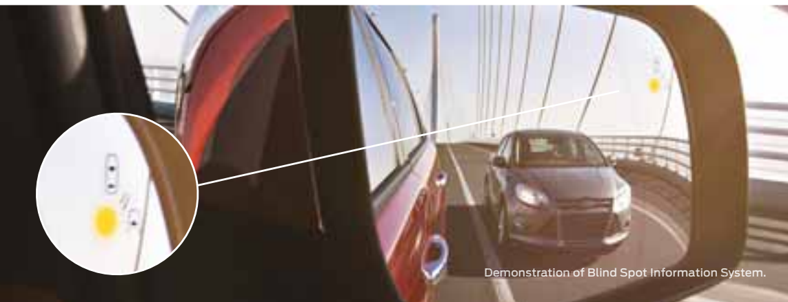
Demonstration of Blind Spot Information System.