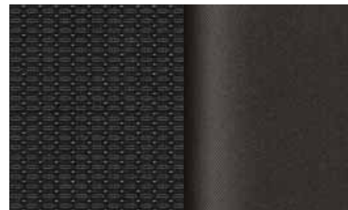
Trend Seat insert: Mason fabric in Ebony Seat bolster: Fineline fabric in Ebony