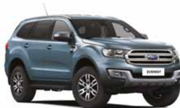
Everest Trend shown in Blue Reflex.