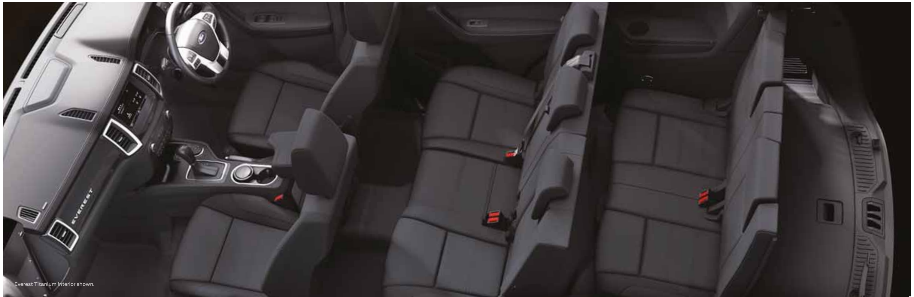
Everest Titanium interior shown.