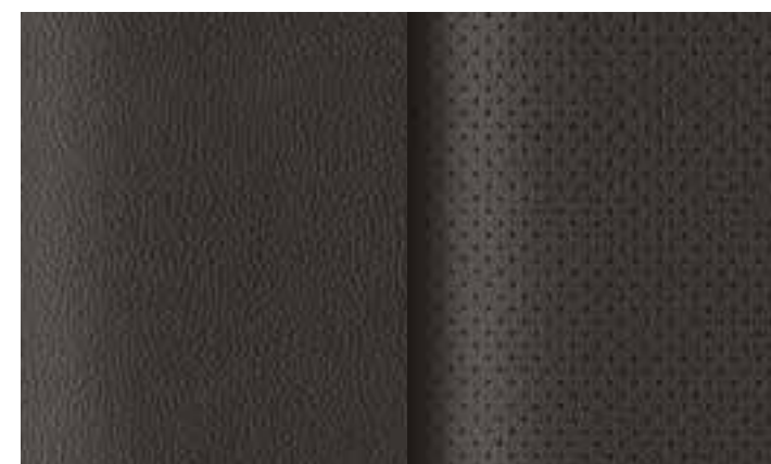
Titanium Seat insert: Soho Grain leather in River Rock Seat bolster: Soho Grain perforated leather in River Rock