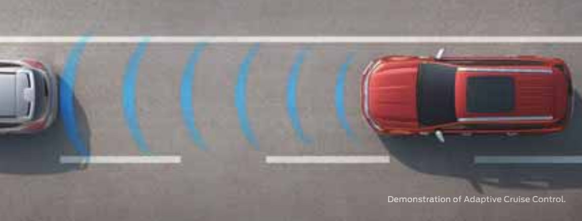
Demonstration of Adaptive Cruise Control.