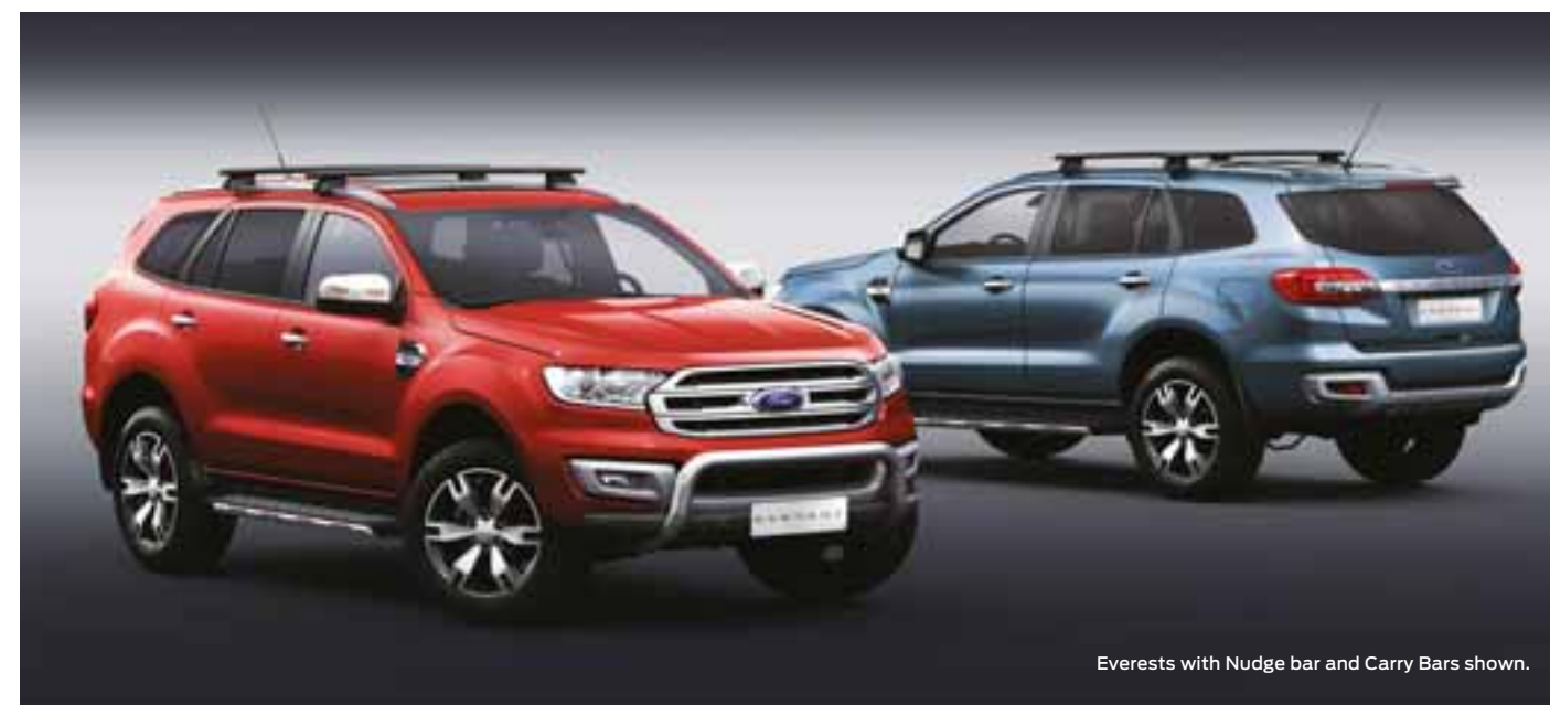
Everests with Nudge bar and Carry Bars shown.

S = Standard. A = Accessory that can be added at any time. – = Not available. O = Factory Option that can be ordered before a vehicle is manufactured.