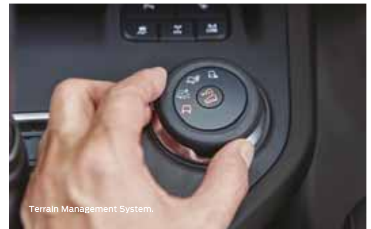
Terrain Management System.