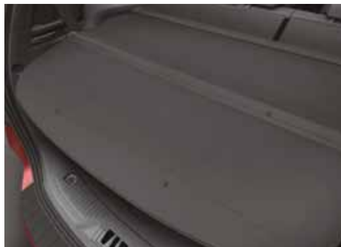
Cargo Cover. Retractable cover helps keep equipment and valuables out of sight.