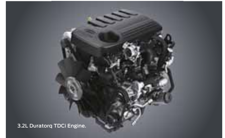
3.2L Duratorq TDCi Engine.

Voice-Controlled Satellite Navigation with Traffic Management Channel 4