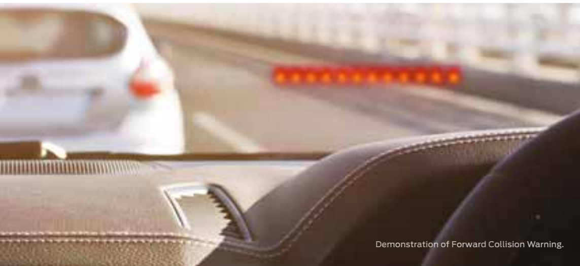
Demonstration of Forward Collision Warning.