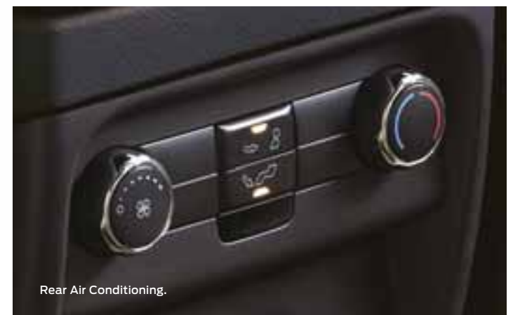
Rear Air Conditioning.