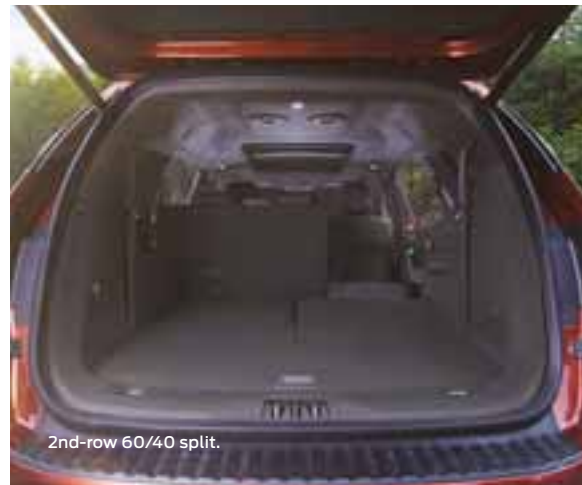
2nd-row 60/40 split.