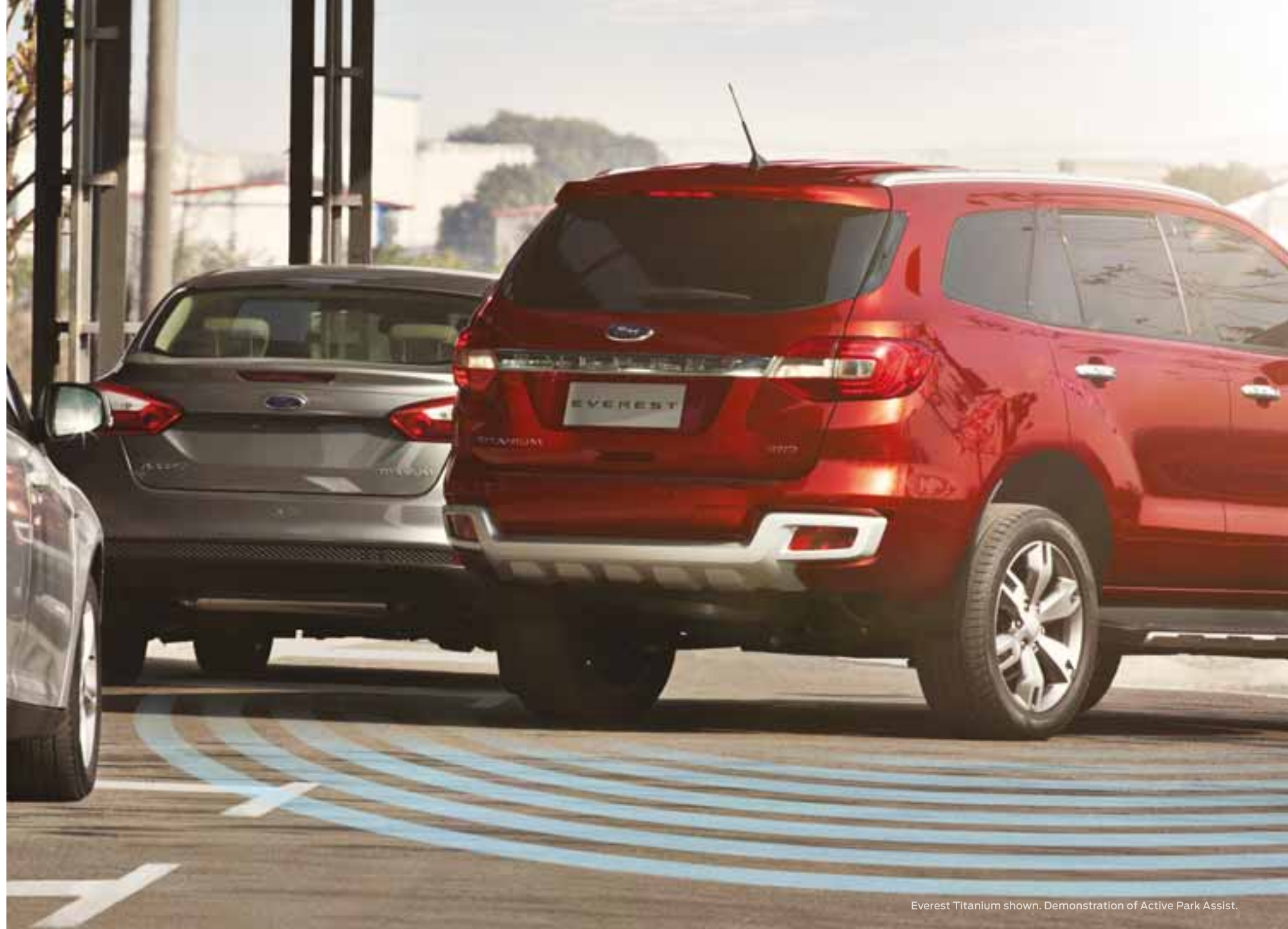
Everest Titanium shown. Demonstration of Active Park Assist.