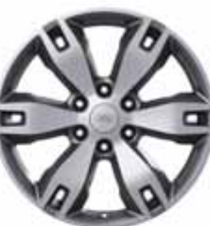
Titanium wheel 20" x 8.5" alloy wheels 265/50 R20 tyres Matching spare wheel & tyre