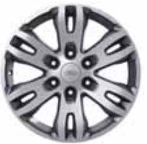
Trend wheel 18" x 8" alloy wheels 265/60 R18 tyres Matching spare wheel & tyre