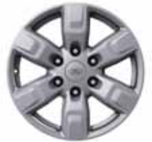
Ambiente wheel 17" x 8" alloy wheels 265/65 R17 tyres Matching spare wheel & tyre