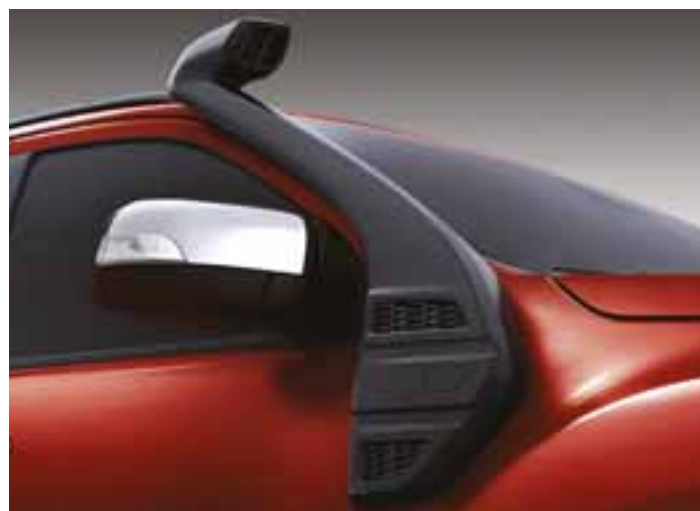
Snorkel. Draws air from roof level providing cooler cleaner air to the engine and also provides a higher air intake position to assist with water crossings.