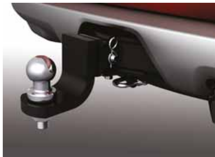
Tow Pack. Pack includes towbar, hitch, trailer wiring, LED compatible trailer wiring module and replacement lower bumper panel for a fully integrated finish