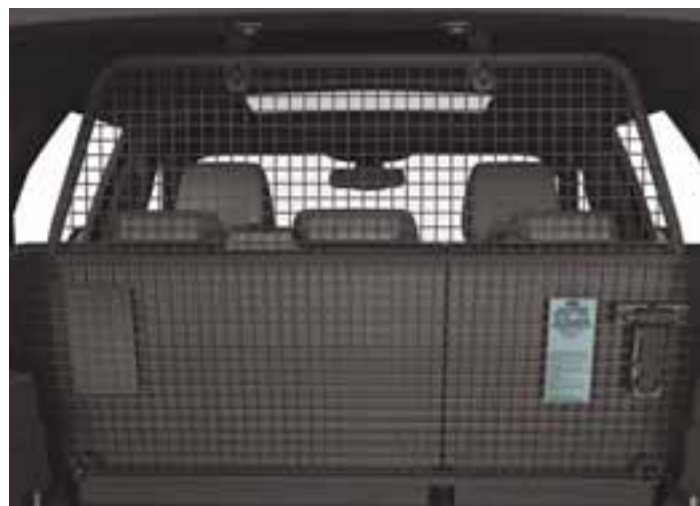
Cargo Barrier. Rated to 60 kg and meets Australian Standard AS/NZ4034.1:2008.