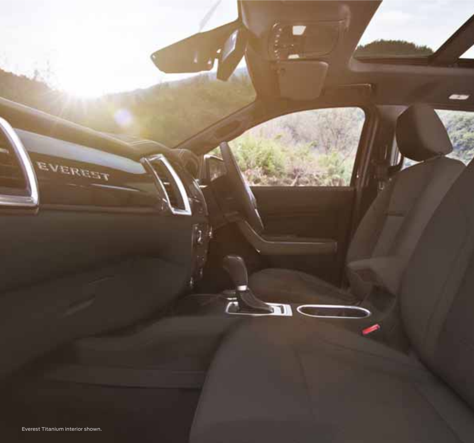
Everest Titanium interior shown.