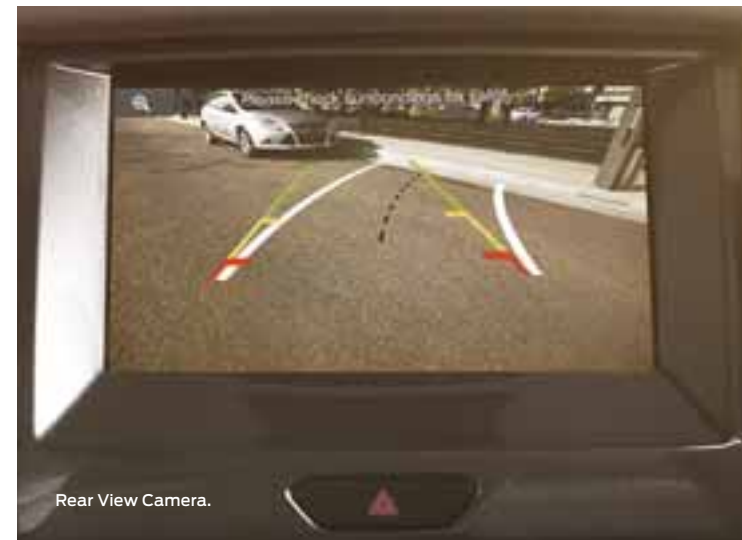
Rear View Camera.