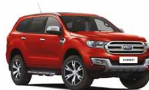
Everest Titanium shown in Sunset.