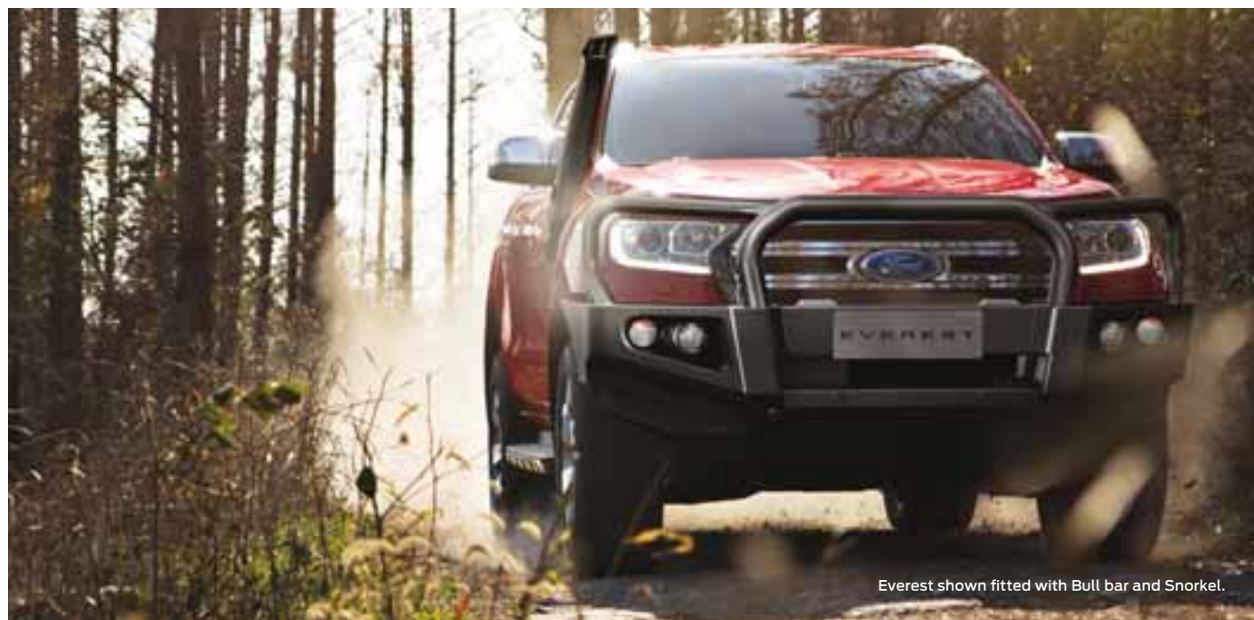
Everest shown fitted with Bull bar and Snorkel.