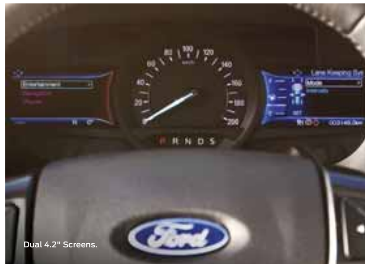
Dual 4.2" Screens.