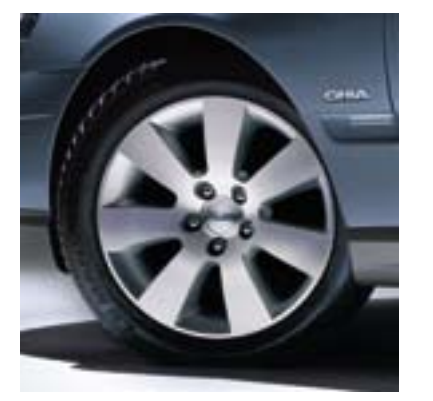
> 17" 7 spoke alloy wheels.