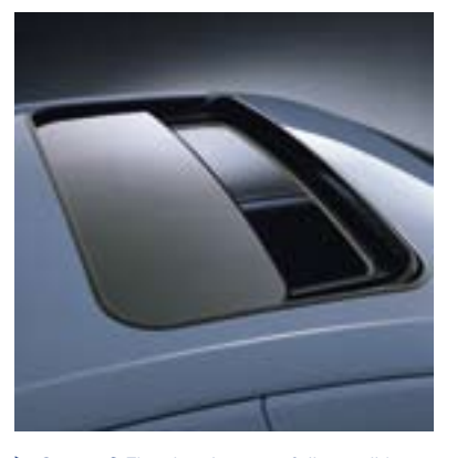
> Sunroof. The electric sunroof tilts or slides open to the sky with the touch of a button. Features automatic closing when you switch off the engine.

Nothing satisfies your driving passion like your very own new Fairlane or LTD. And customising your vehicle to suit your needs has never been easier. Choose from an exciting and wide range of options to create the ultimate driving experience. Better still, all items are factory fitted and are made to meet our exacting standards of quality and durability. Ford iDesign options are identified by unique badges that are also fitted at the factory. The range of visually exciting Ford iDesign items is complemented by a selection of Genuine Ford Accessories. Fitted by your Ford Dealer, this wide choice of accessories allows you to enhance your vehicle even further. To find out more visit ford.com.au or see your Ford Dealer.