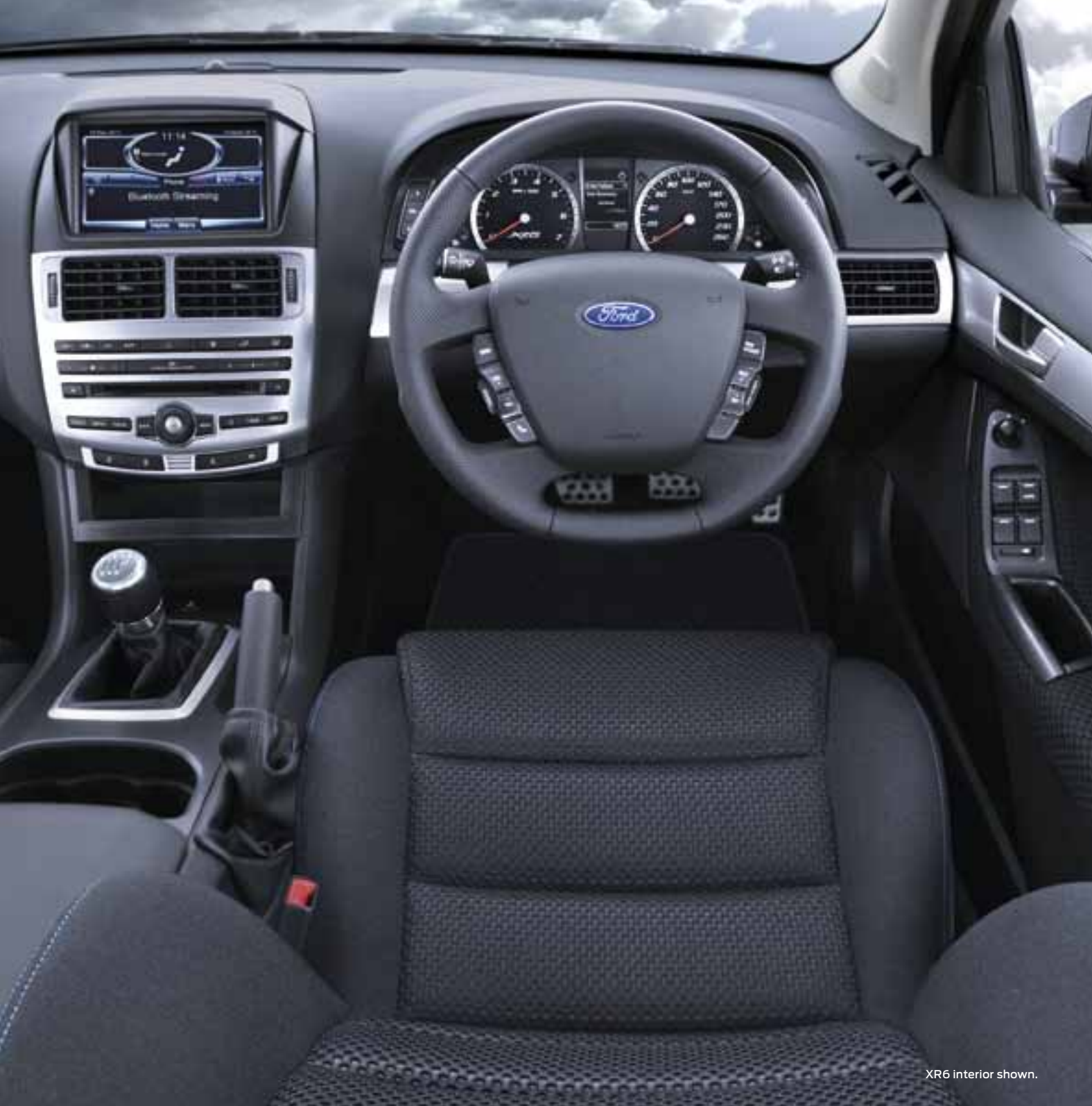
XR6 interior shown.