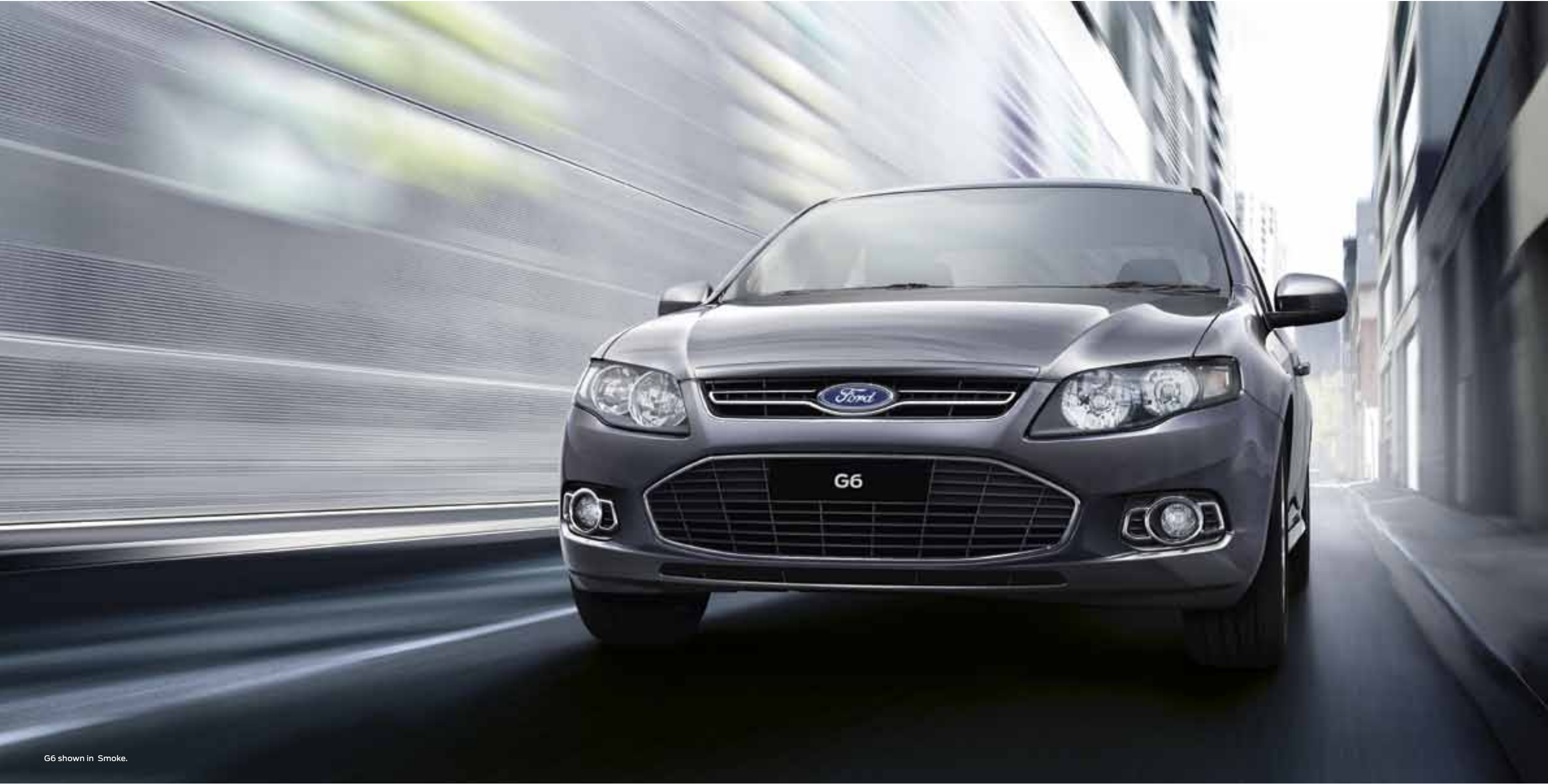
G6 shown in Smoke.

Enjoy the same levels of power and performance you're used to, but with improved fuel economy and reduced environmental impact.