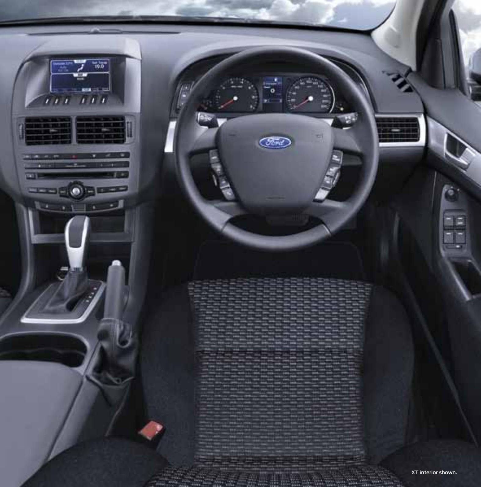
XT interior shown.