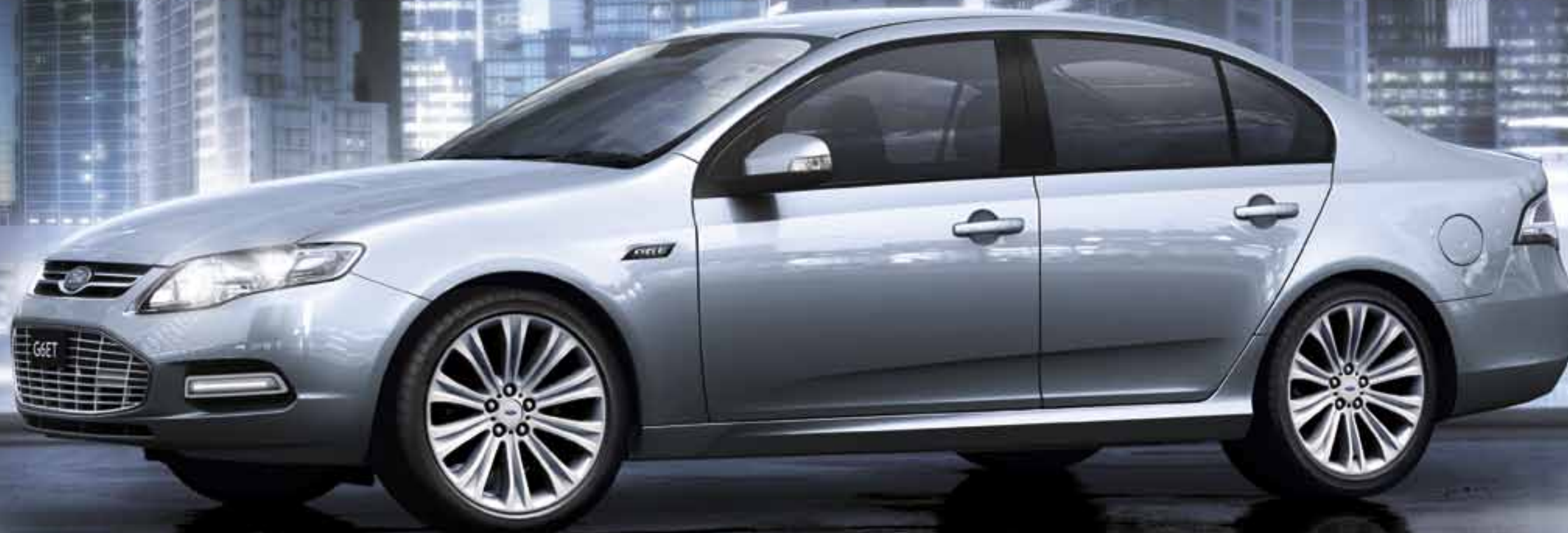
G6E Turbo shown in Lightning Strike.

The G-Series offers plenty in the way of luxury and comfort, without ever compromising on power and driving pleasure.