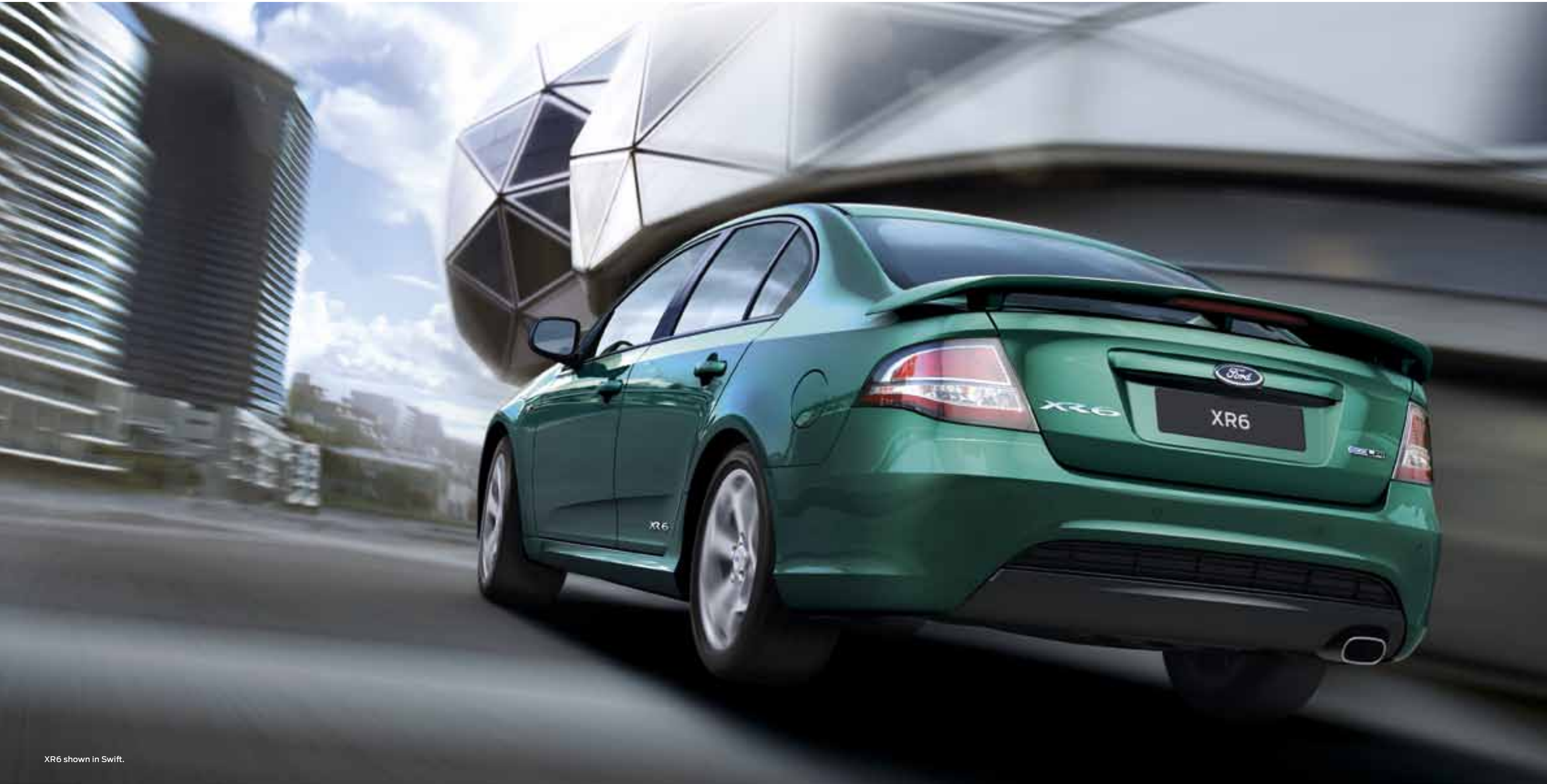
XR6 shown in Swift.

Enjoy outstanding power and torque and reduced carbon emissions while taking advantage of lower fuel costs.