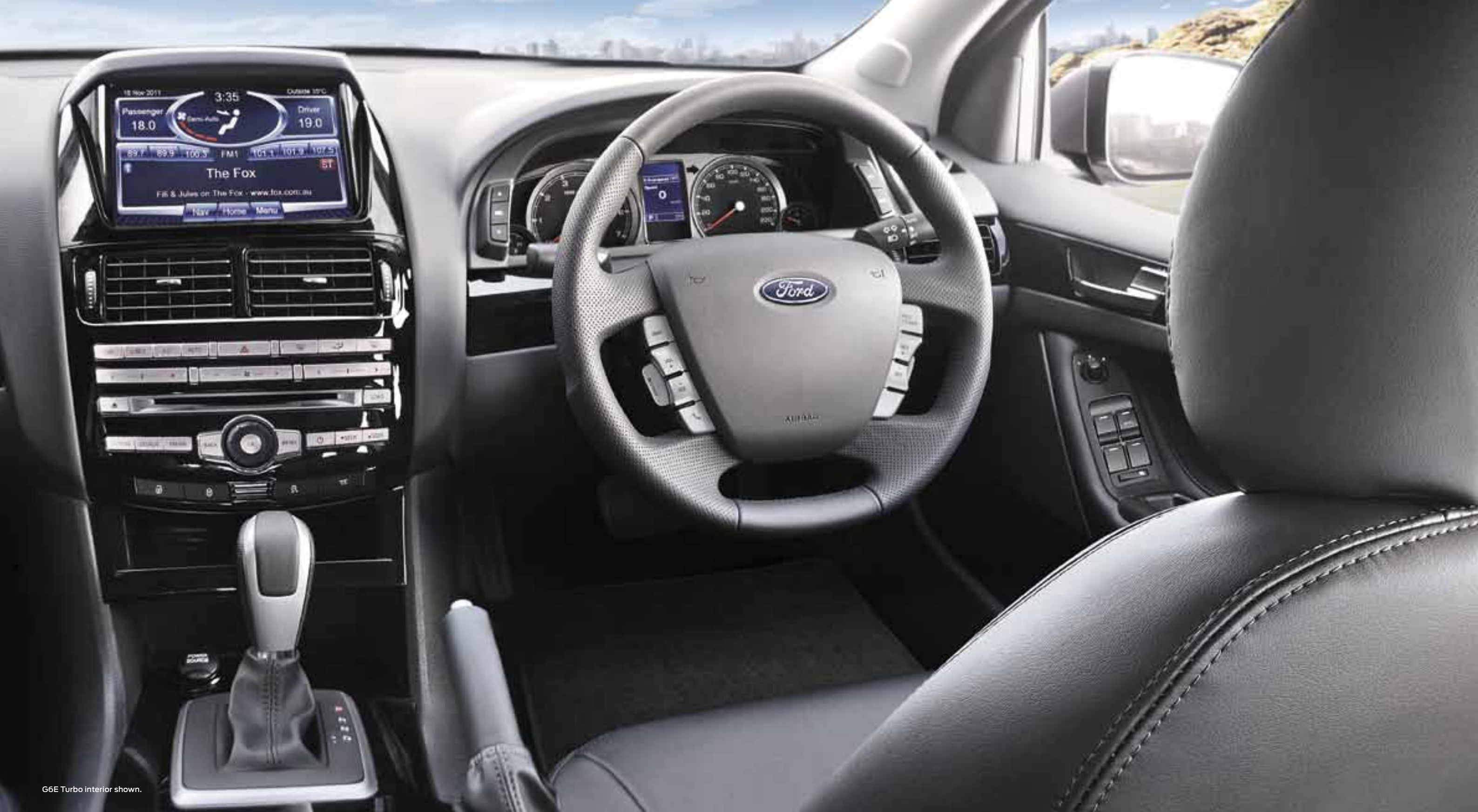
G6E Turbo interior shown.

Smart driving technologies and the latest in comfort and entertainment sit neatly within the Falcon's interior.