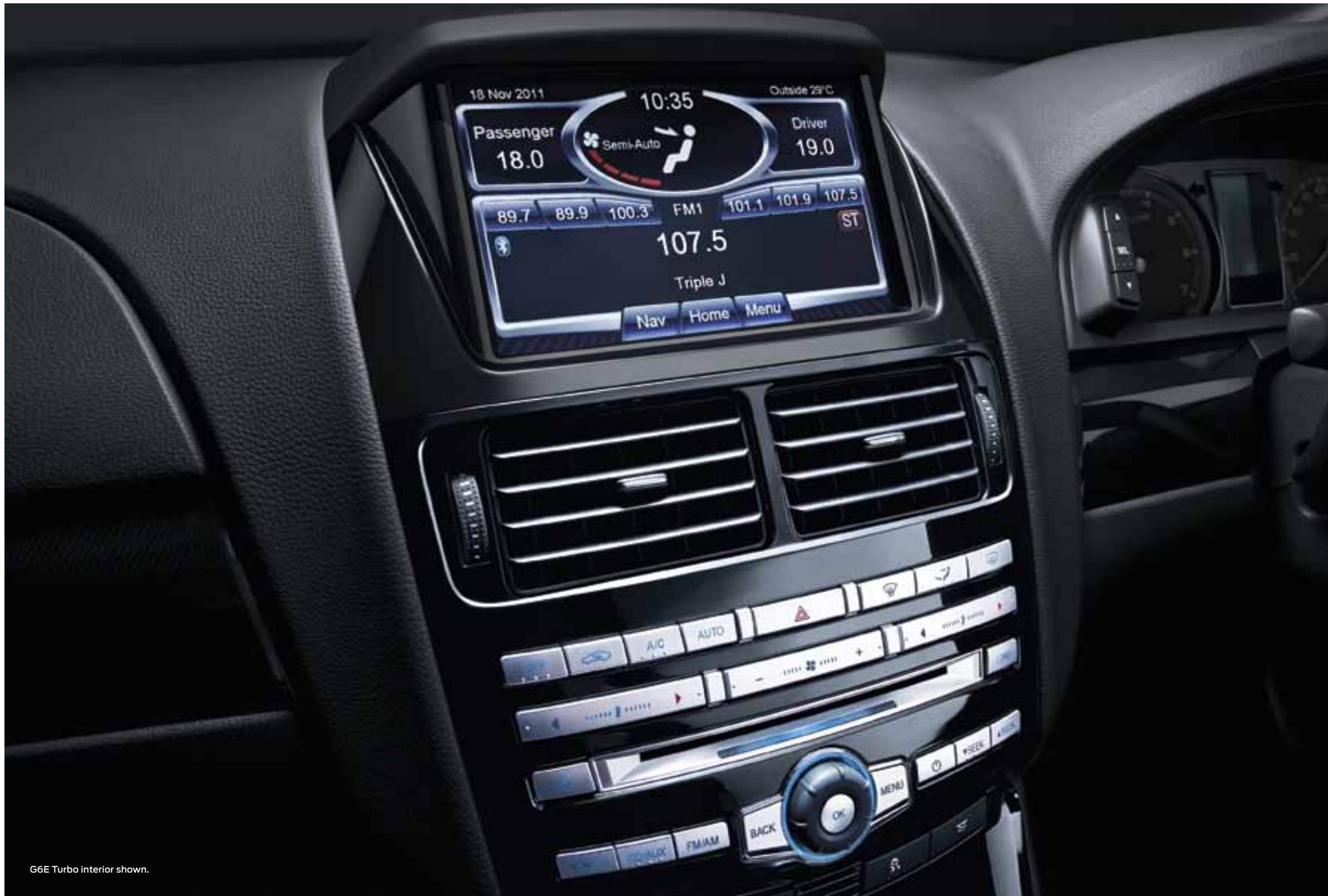
G6E Turbo interior shown.

The easy-to-read multi-function display allows you to check everything at a glance, from speed and journey distance to temperature, vehicle warnings and more.