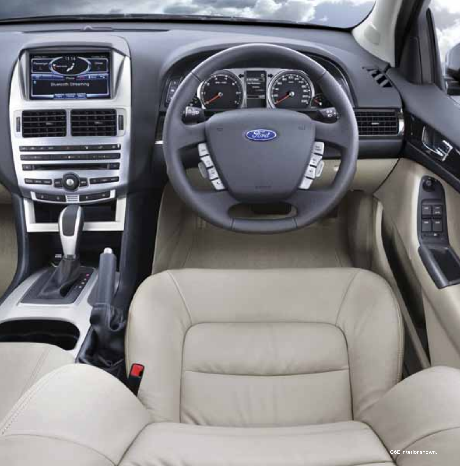
G6E interior shown.