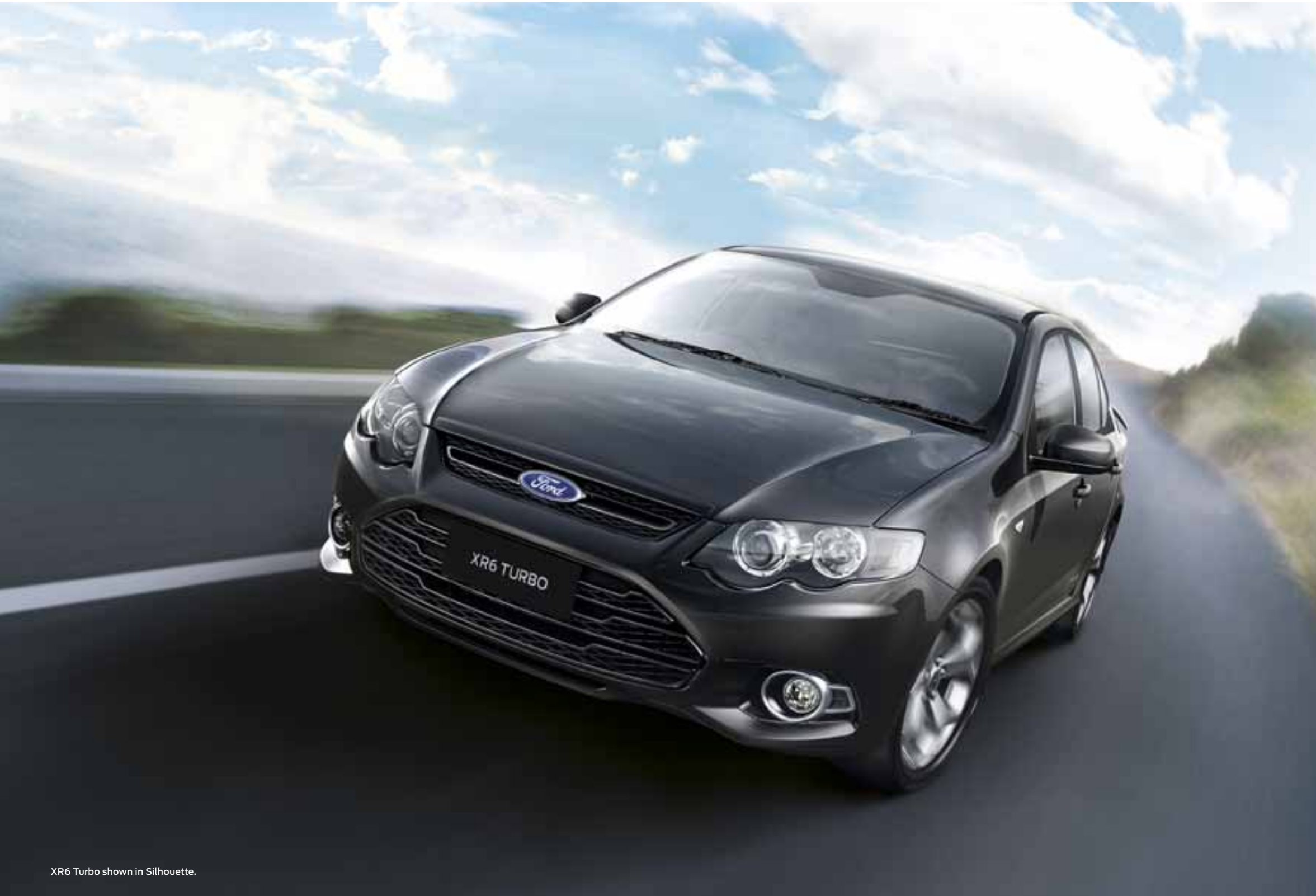
XR6 Turbo shown in Silhouette.

Enjoy a superior driving experience with advanced new engine technologies and the latest in high performance engineering and tuning.