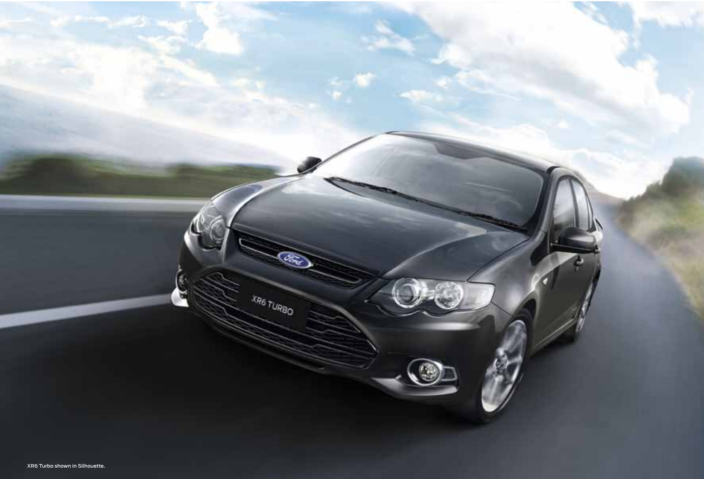
XR6 Turbo shown in Silhouette.

Enjoy a superior driving experience with advanced new engine technologies and the latest in high performance engineering and tuning.