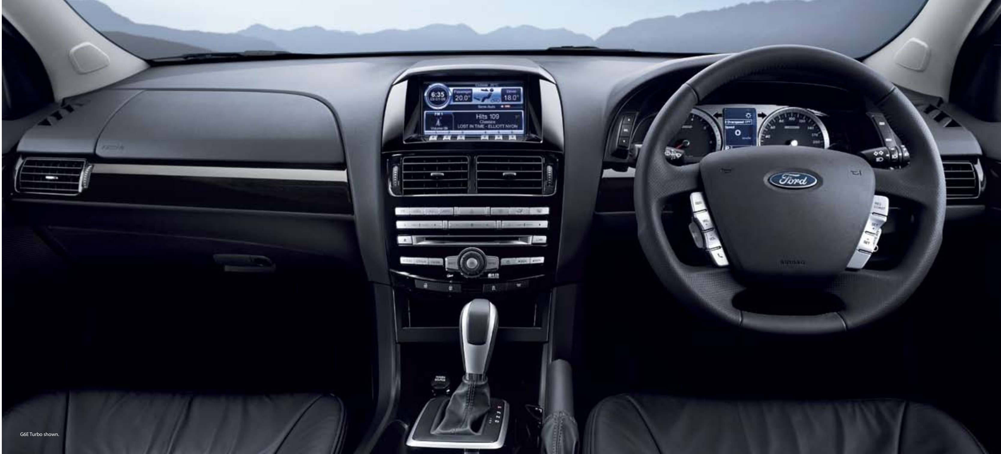
G6E Turbo shown.

When you can set the interior temperature to suit, the family travels in complete comfort regardless of what mother nature has in store.