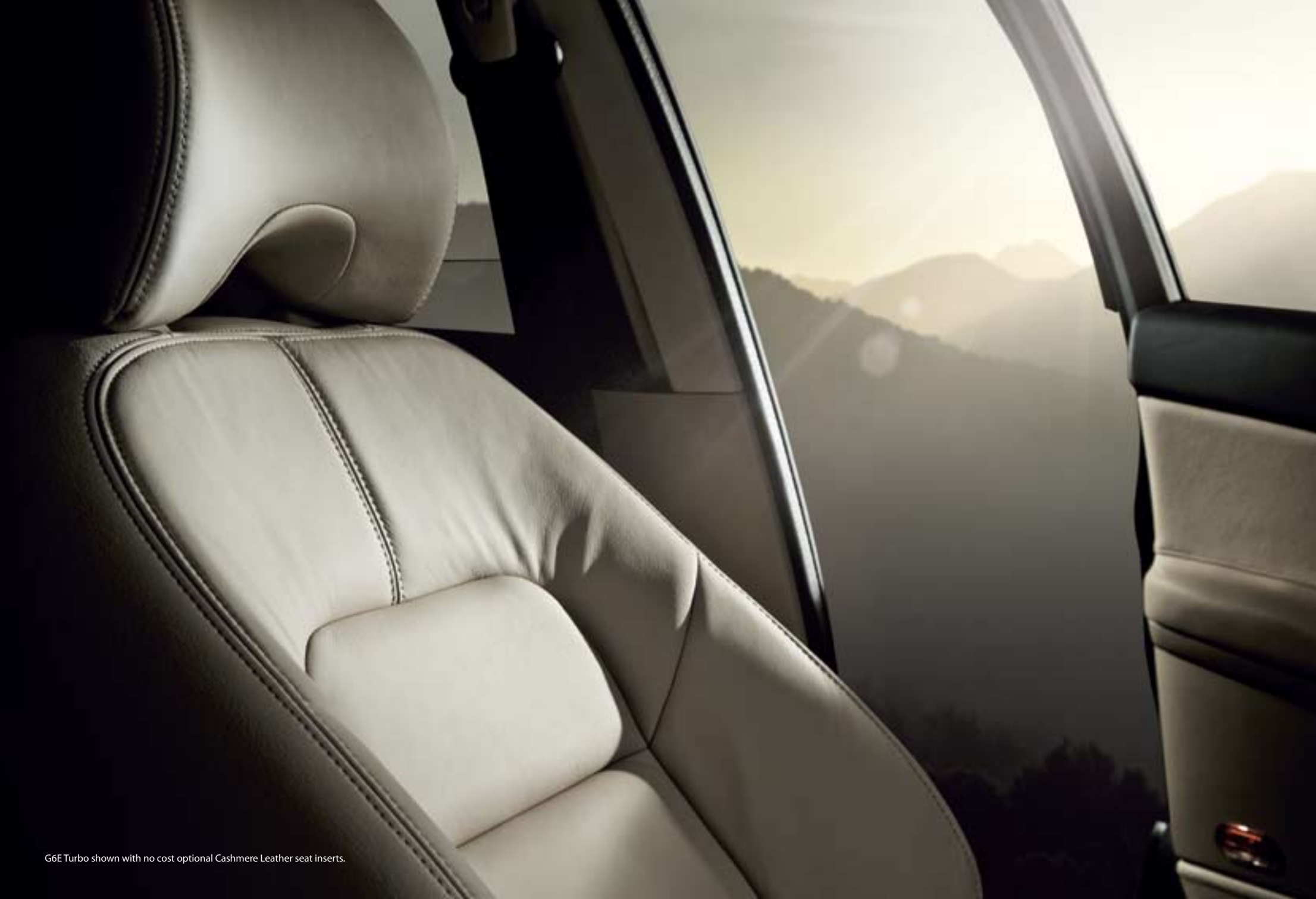
G6E Turbo shown with no cost optional Cashmere Leather seat inserts.