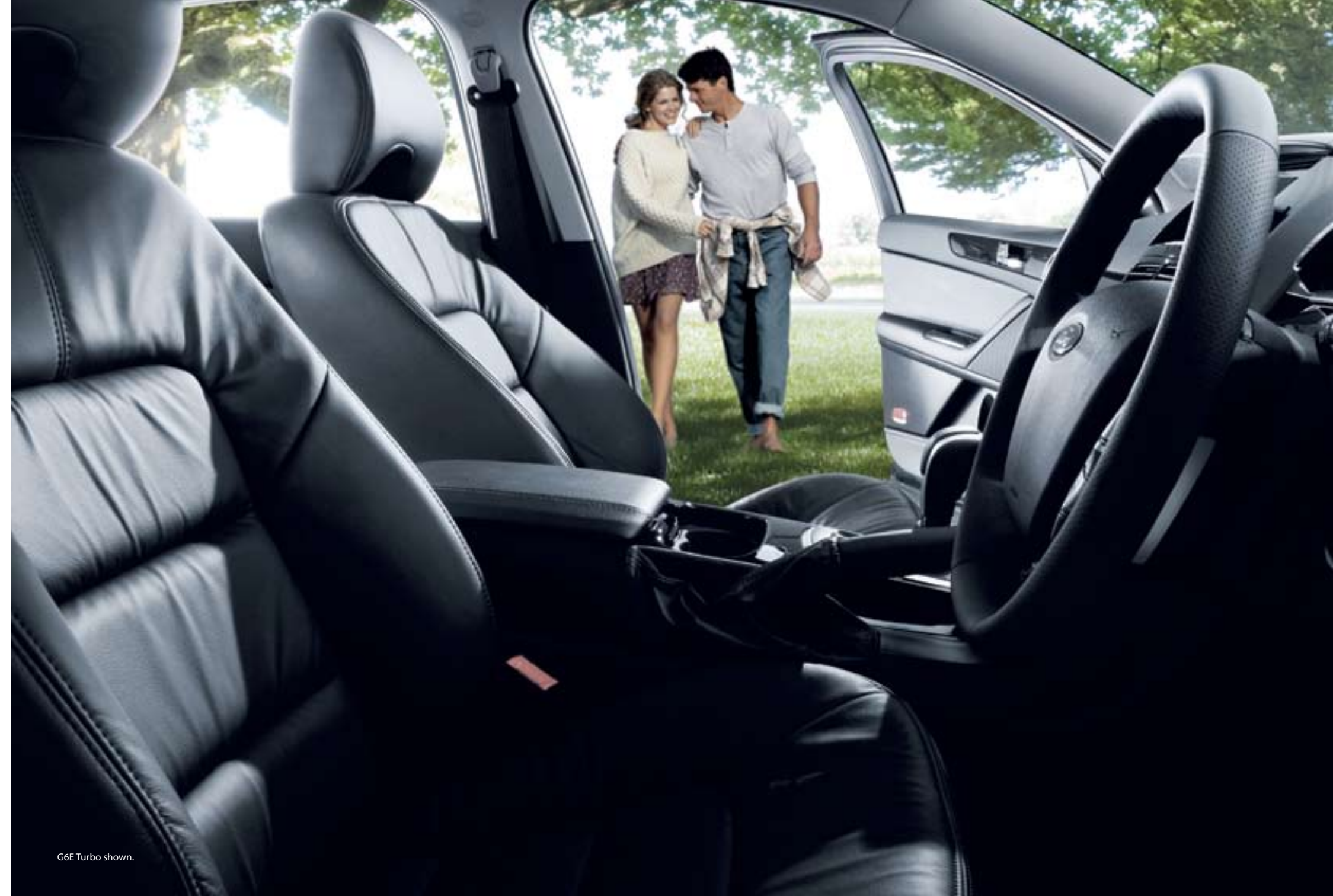
G6E Turbo shown.

#Conditions and exclusions apply. See your authorised Ford Dealer for details. This brochure is designed to provide you with a general introduction to the Ford Products (including available optional equipment) referred to, and should be read in conjunction with the latest specification sheet. Because of changes in conditions and circumstances Ford* reserves the right, subject to all applicable laws, at any time, at its discretion, and without notice, to discontinue or change the features, designs, materials, colours and other specifications and the prices of their products, and to either permanently or temporarily withdraw any such products from the market without incurring any liability to any prospective purchaser or purchasers. The latest specification sheet should be referred to for information on the availability, ordering and use of optional equipment. Always consult an authorised Ford Dealer for the latest information with respect to features, specifications, prices, optional equipment and availability before deciding to place an order. *FORD MOTOR COMPANY OF AUSTRALIA LIMITED. (A.B.N. 30 004 116 223) Registered Office: 1735 Sydney Road, Campbellfield, Victoria 3061, Australia. Printed July, 2009. FML7112