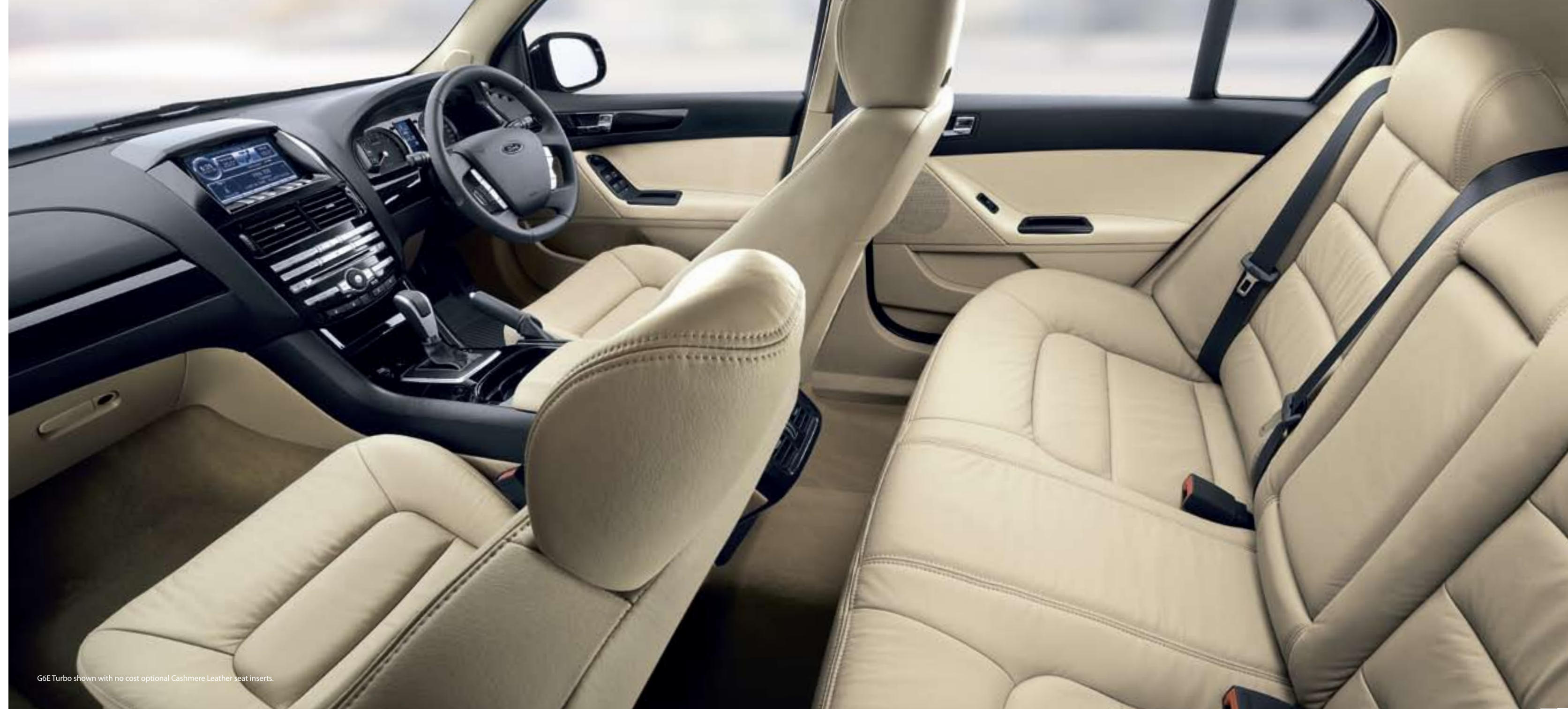
G6E Turbo shown with no cost optional Cashmere Leather seat inserts.