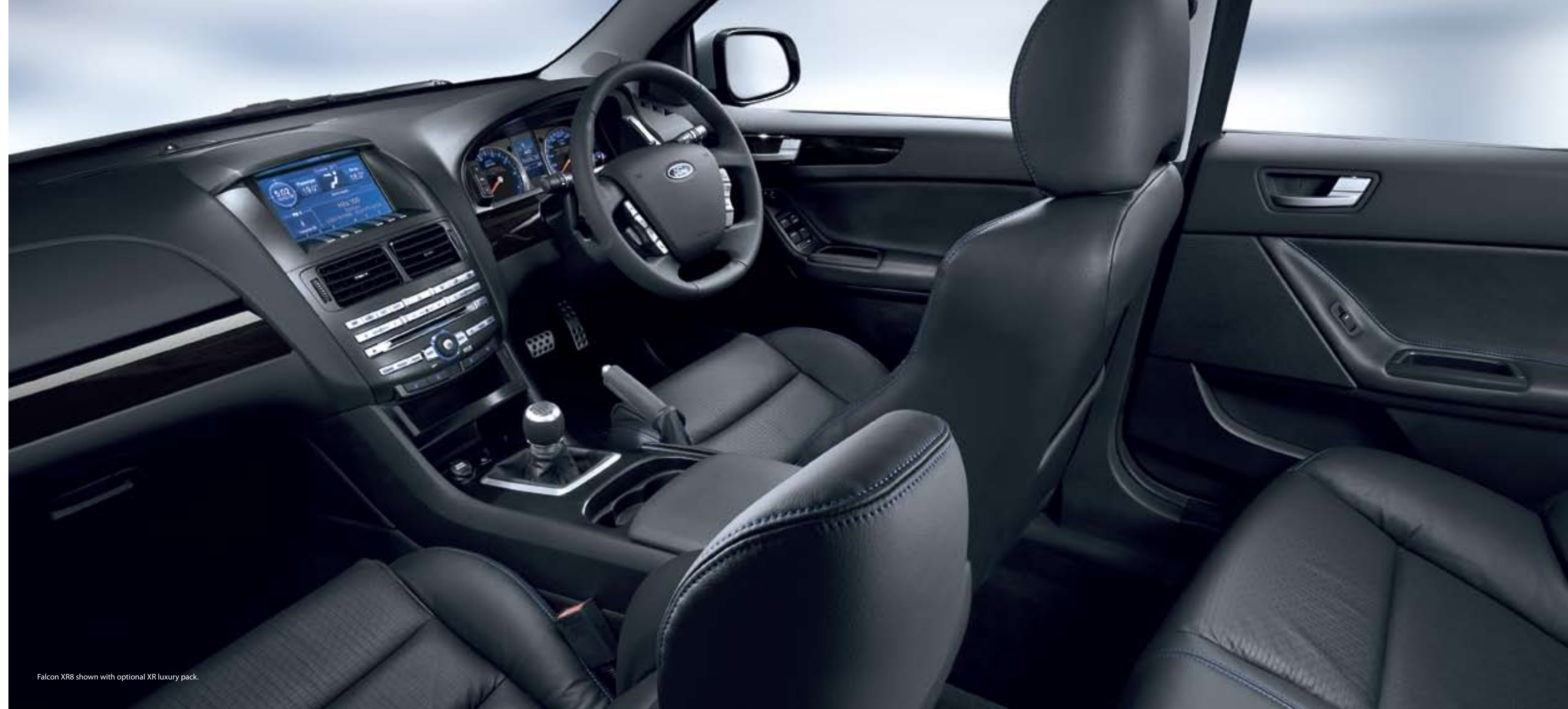
Falcon XR8 shown with optional XR luxury pack.