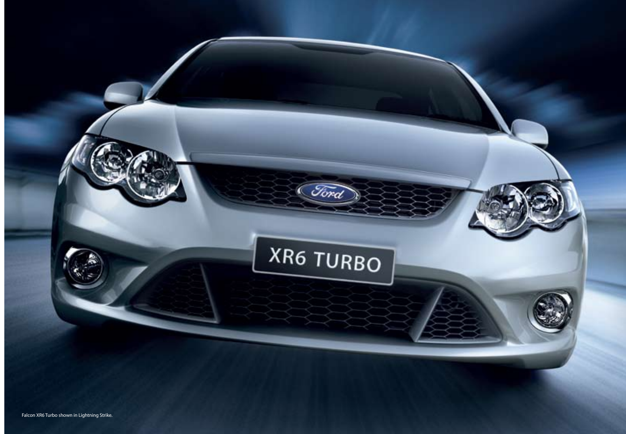
Falcon XR6 Turbo shown in Lightning Strike.

The range of sophisticated transmissions, with a low first gear ratio and higher top gear ratio deliver a truly spirited driving experience. The greater dynamic range means livelier, energetic performance as well as more relaxed cruising and ultra-smooth gear shifts.