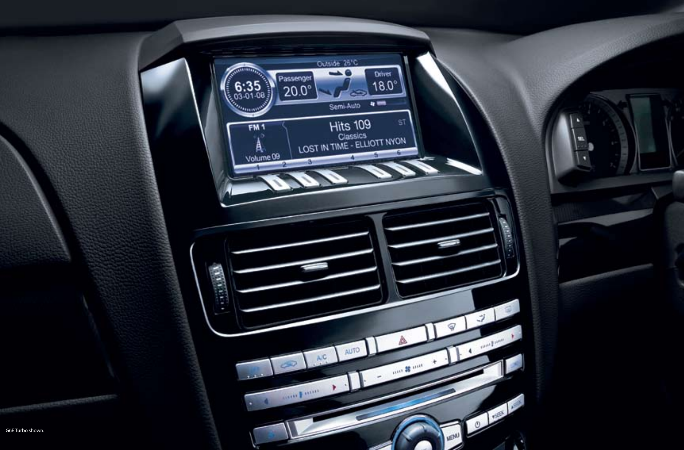
G6E Turbo shown.

The easy-to-read Multi-function Display allows you to check everything at a glance, from speed and journey distance to vehicle warnings and more.