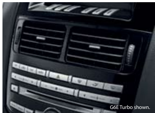
G6E Turbo shown.

Adjustable interior lighting means that you can keep an eye on the little ones while they're snoozing without disturbing a moment's rest.