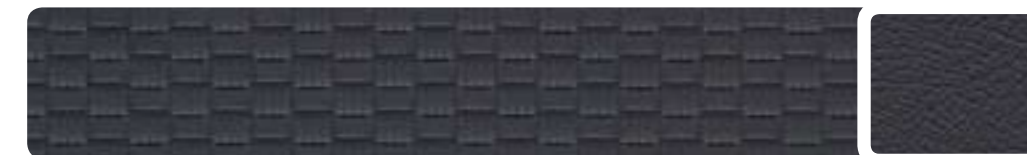
Nudo Shadow Weave Leather seat inserts