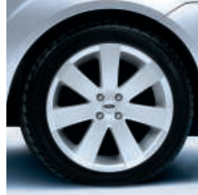
16" 7 spoke alloy wheels. Designed in Europe and made from high grade alloy for superior strength, these alloy wheels will give your Fiesta a sportier edge.