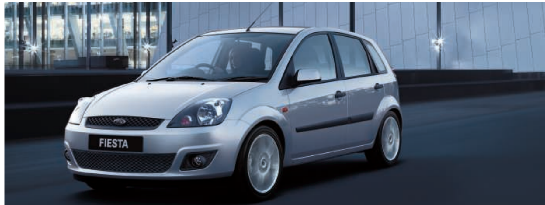
Fiesta Zetec shown in Moondust Silver.

9. Mandatory with LX automatic transmission. 10. Dynamic Stability Control is also known as Electronic Stability Control (ESC). 11. When you option Safety Pack.