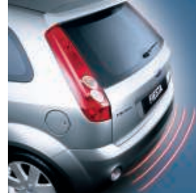
Reverse sensing system. The reverse sensing system uses warning tones to help make reversing and parking easier.