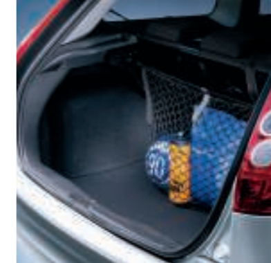
Cargo swing net. Keep your belongings in place. Easy to install and remove, it attaches to the sides of the cargo area to help prevent loose items moving around during transit.