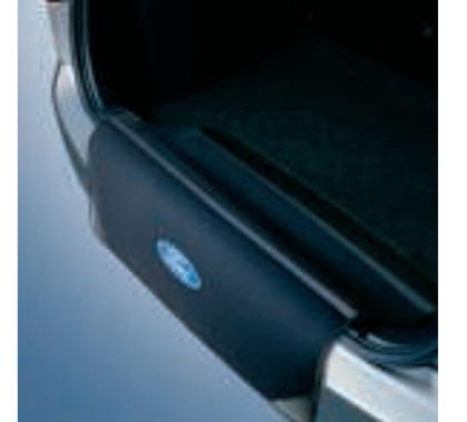
Boot scuff guard! Designed to help protect your Fiesta's rear bumper and boot lip from scratches and scuffs when loading and unloading. Folds away neatly when not in use.