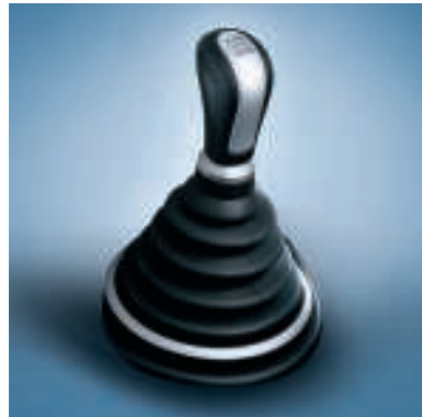
Sports leather gear knob. Superbly crafted sports leather gear knob gives the interior of your Fiesta an even sportier look and feel. Available on manual transmission vehicles only.