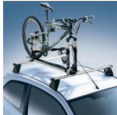
Bike carrier.* Transporting your bike is easy with this fully lockable bike carrier. Securely harnesses your bike by the front forks and is made from premium alloy for superior strength and stability.