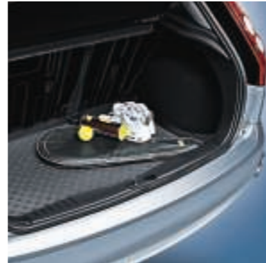
Boot liner!† Durable rubber mat features a raised texture to help minimise movement of goods during transit. Easy to remove and clean.

You probably didn't think it was possible, but the German engineered Ford Fiesta has gotten even sexier thanks to a broad range of interior and exterior style accessories. Now there's a multitude of different ways to personalise your Fiesta. If you're a sporty type, perhaps you'd like one of the many add-on carriers for bikes, skis or snowboards. There's also a huge range of exterior protection accessories available to keep your Fiesta looking sexy for longer.