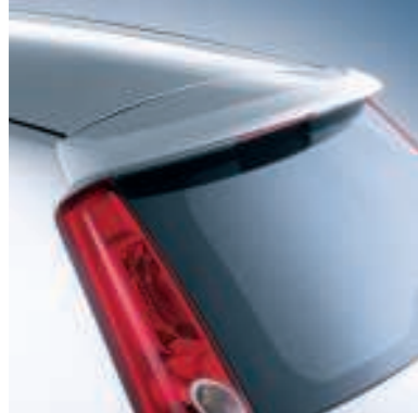
Spoiler. Maximise your Fiesta's sporty appearance with a spoiler designed to further enhance the vehicle's contours.