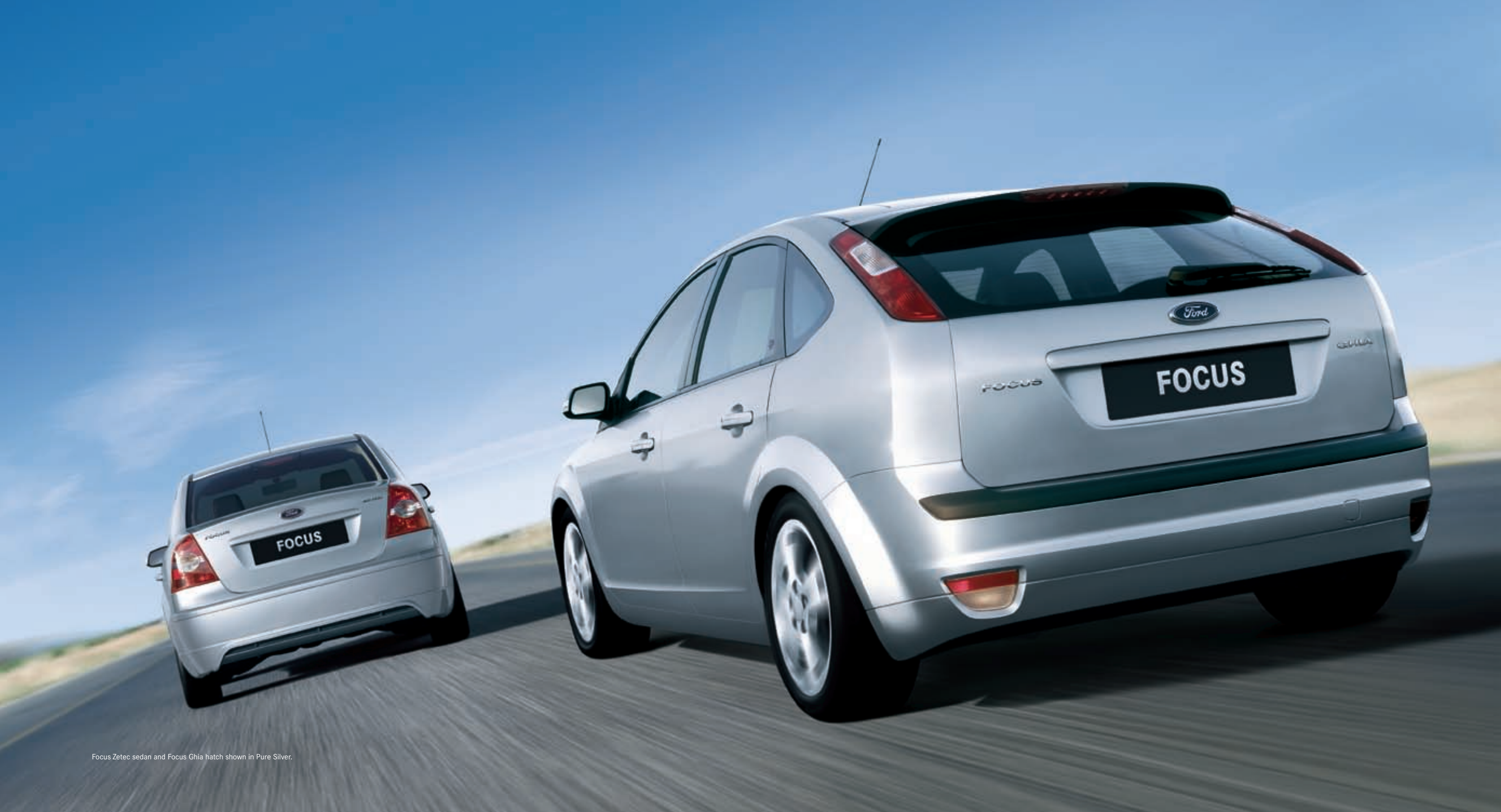
Focus Zetec sedan and Focus Ghia hatch shown in Pure Silver.