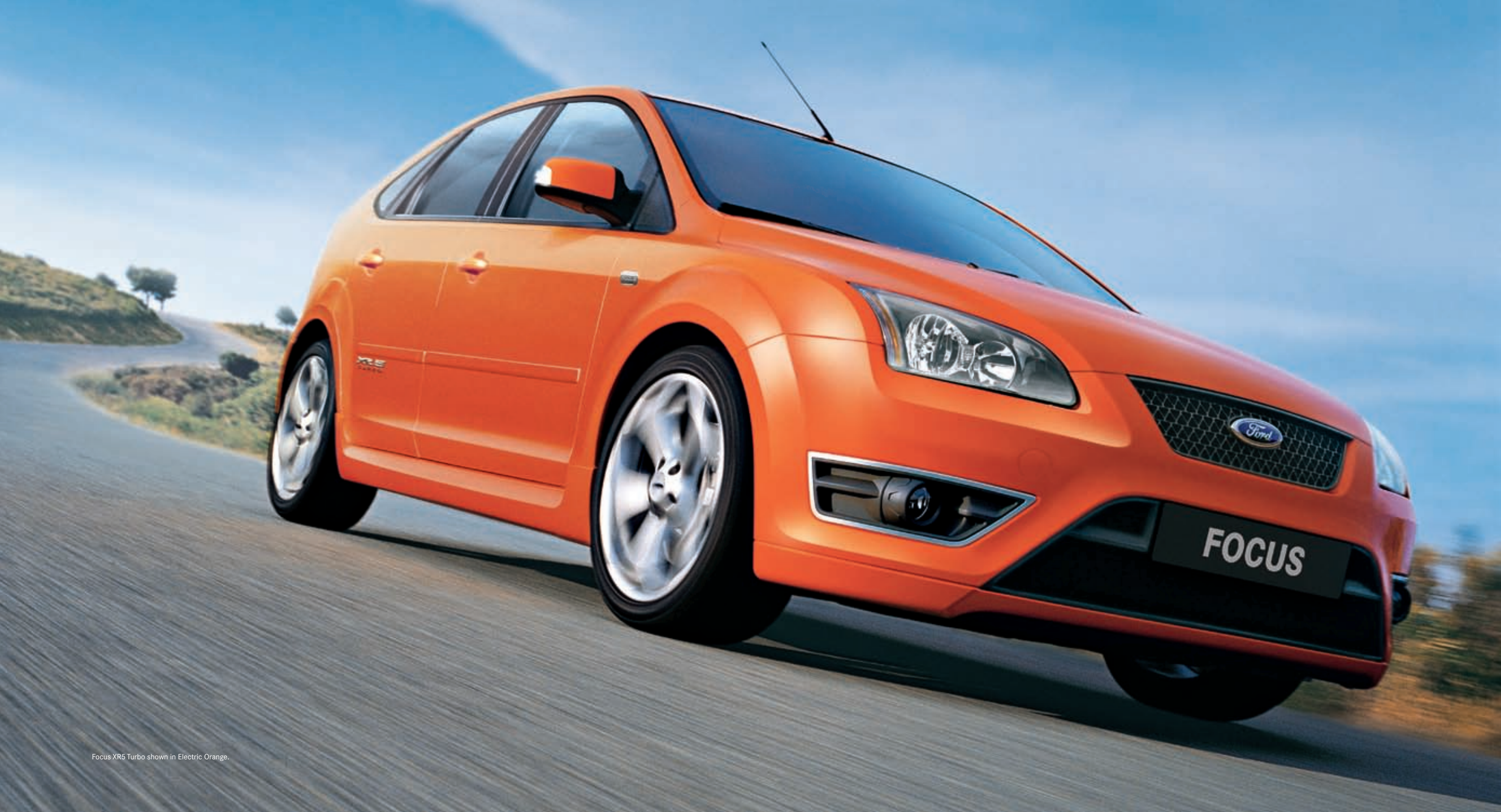
Focus XR5 Turbo shown in Electric Orange.