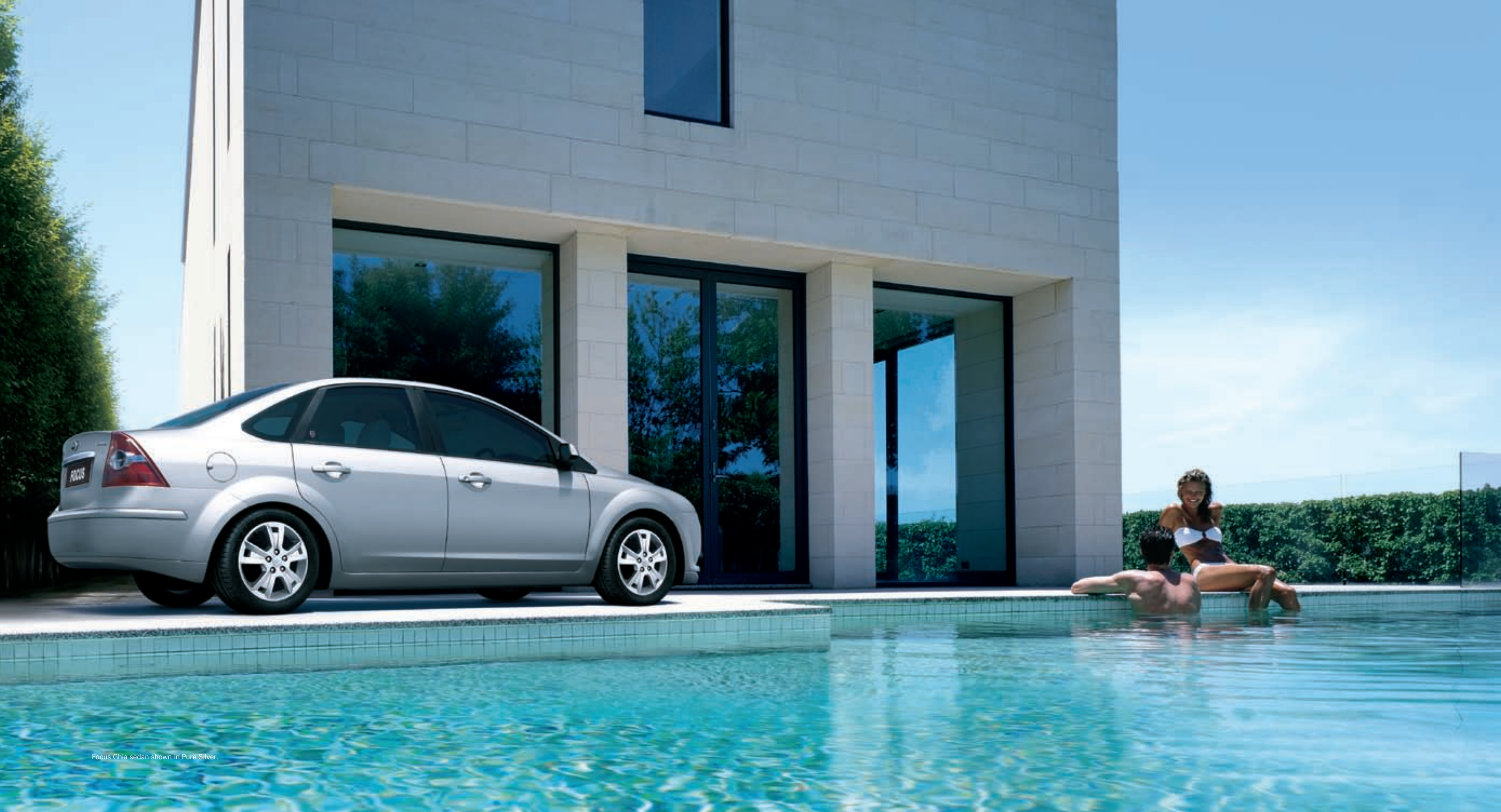
Focus Ghia sedan shown in Pure Silver.