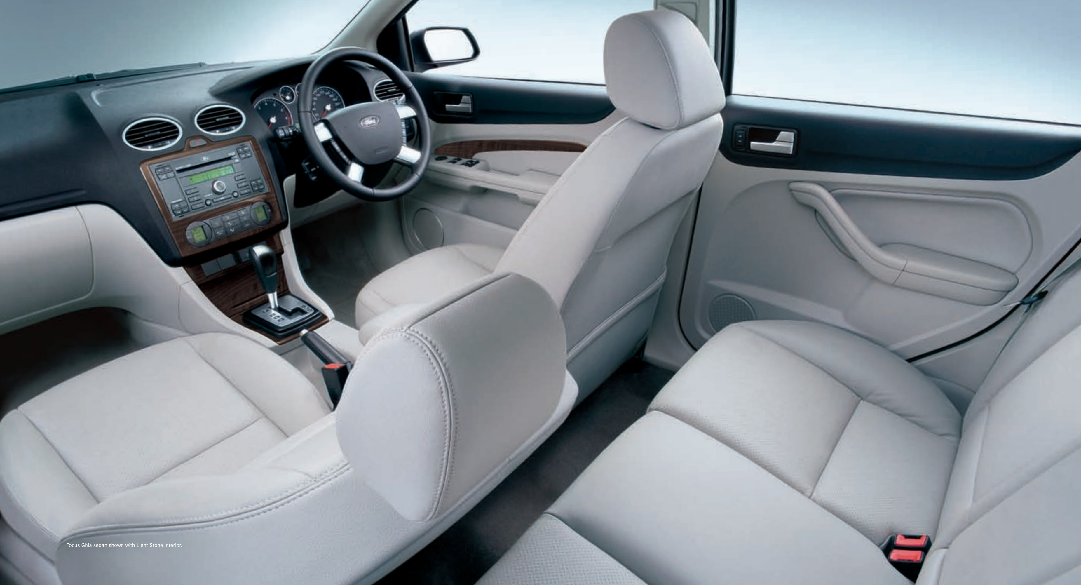
Focus Ghia sedan shown with Light Stone interior.