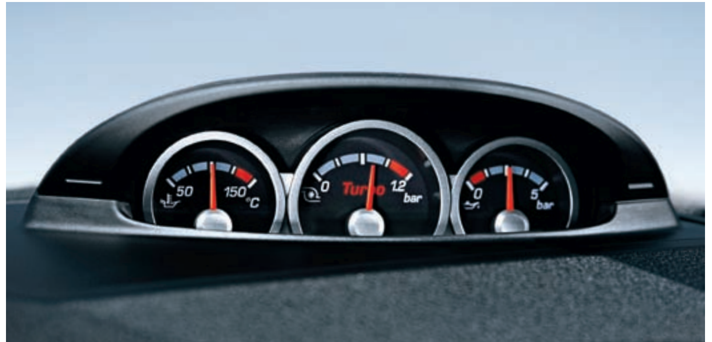
The Ford Focus XR5 Turbo's eye-catching instrument panel displays oil temperature, turbocharger boost pressure and oil pressure. The instrument panel is just one of many superb design elements you can expect to find in the Focus XR5 Turbo.