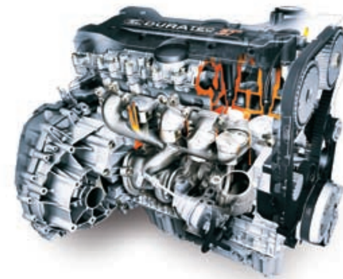
The Ford Focus XR5 Turbo's searing 2.5L Duratec 20V 5 cylinder turbo engine pumps out 166kW of power and 320Nm of torque for superbly smooth, sporty performance.

Designed and engineered in Germany with ultra-responsive steering, handling and braking, only one word adequately describes the latest Ford Focus: smooth. In all models except the Focus XR5 Turbo and turbo diesel Focus TDCi, power is transferred smoothly from the 2.0L Duratec 16V 4 cylinder engine by a 5-speed manual or optional 4-speed automatic transmission with Sequential Sports Shift. Completing the package, Control Blade Independent Rear Suspension and electro-hydraulic power steering combine to deliver a smoother ride with precise cornering. The Focus TDCi takes this advanced driving technology even further with its highly fuel efficient and quiet 2.0L Duratorq 16V 4 cylinder turbo diesel engine. Choose the Focus XR5 Turbo and you'll be rewarded with an involving drive that's bound to impress even the most passionate car enthusiast. You'll experience pure exhilaration as the highly refined, close-ratio 6-speed manual transmission taps into the sizzling power of the smooth revving 2.5L Duratec 20V 5 cylinder turbo engine. And Focus XR5 Turbo's sports tuned suspension achieves a superb balance between tremendous cornering ability and a smooth, compliant ride.