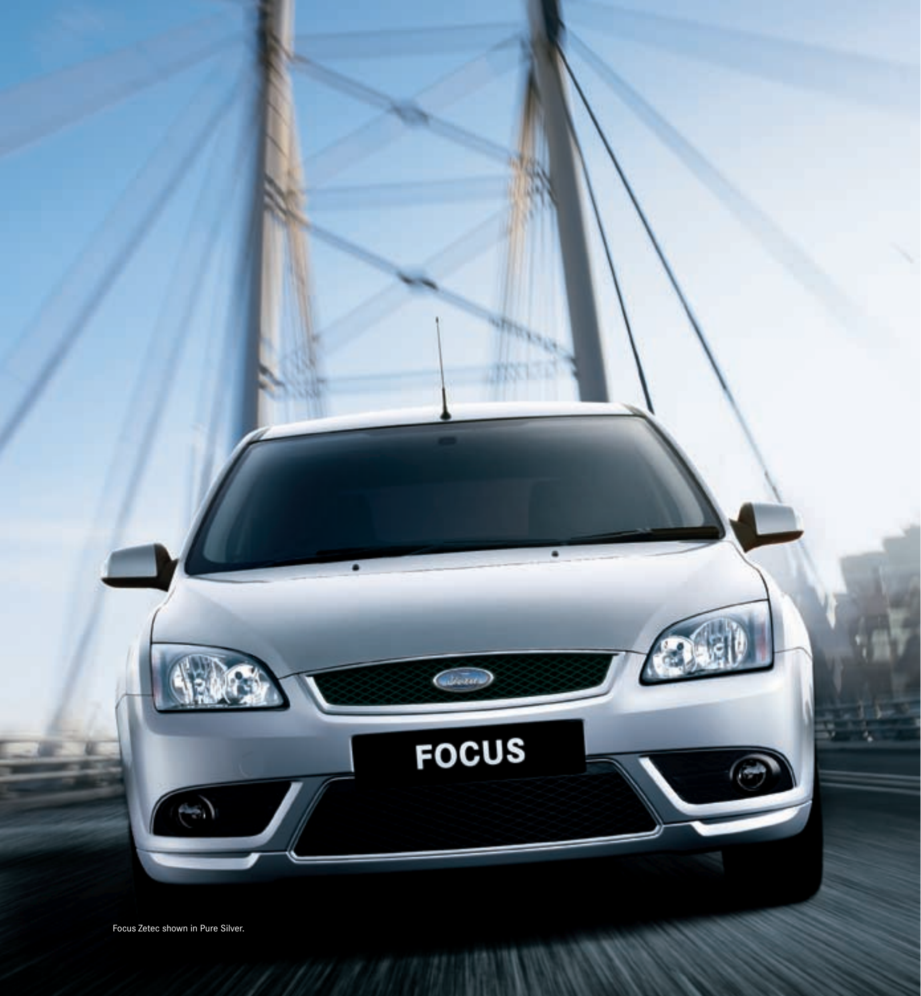
Focus Zetec shown in Pure Silver.