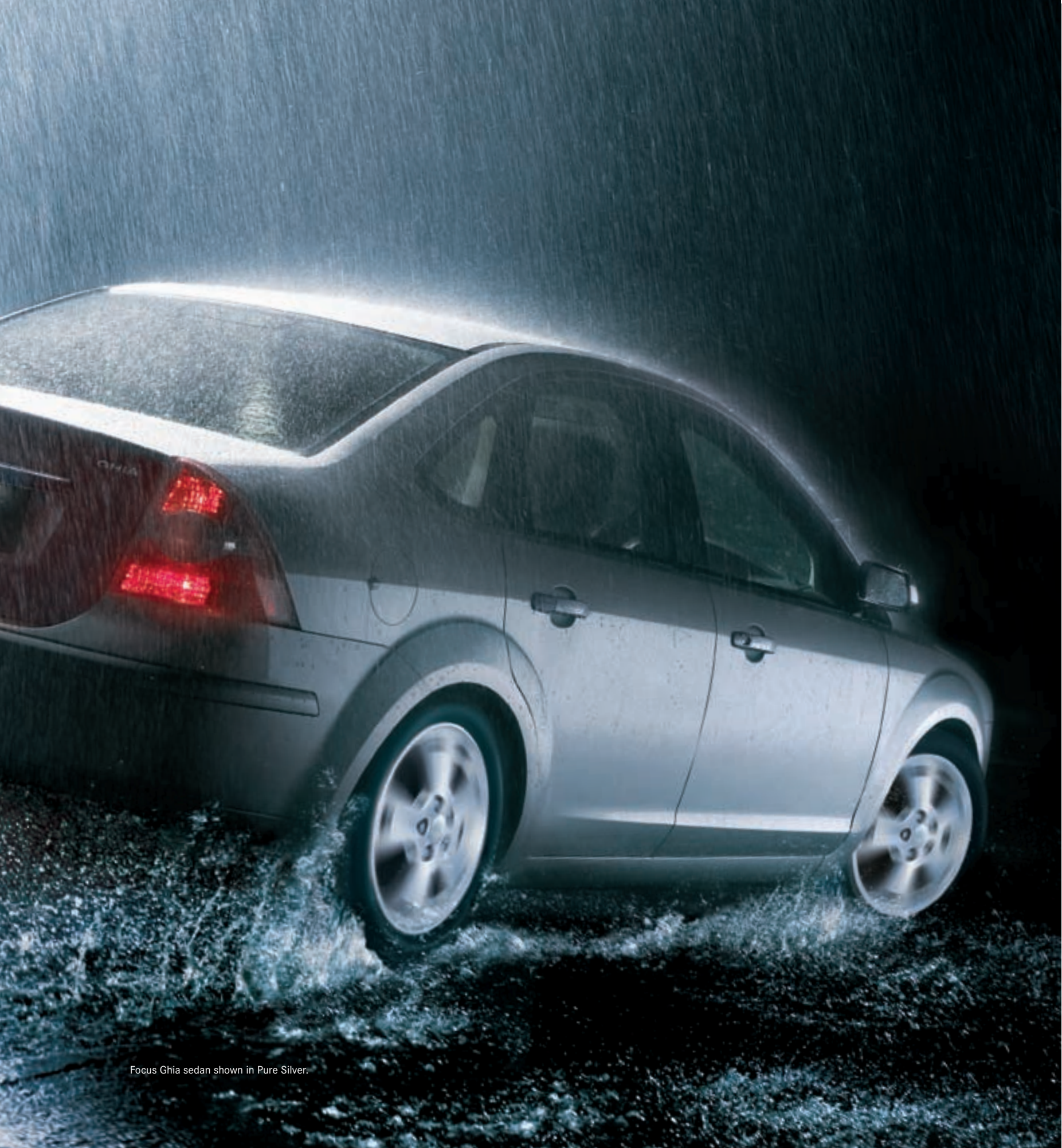
Focus Ghia sedan shown in Pure Silver.