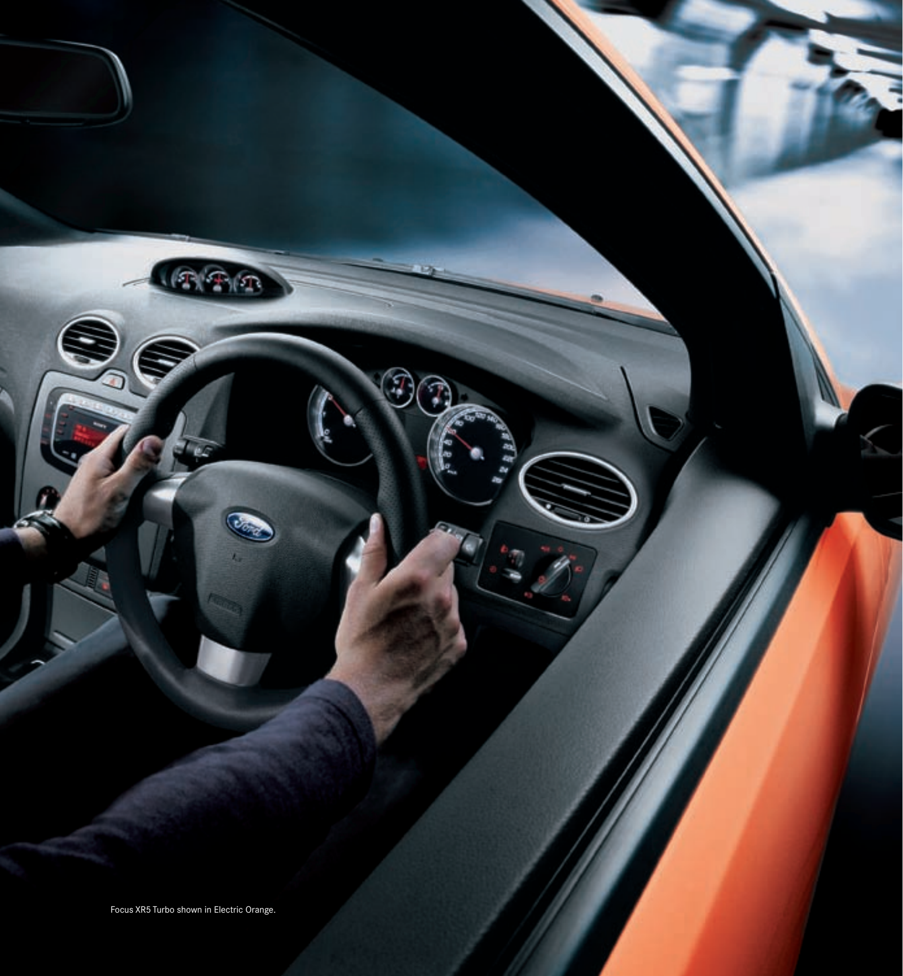
Focus XR5 Turbo shown in Electric Orange.