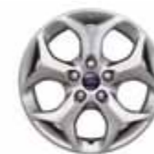
16" 5-spoke alloy wheel

Luggage compartment protection with an anti-slip surface.