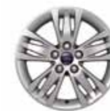
16" 5x3-spoke alloy wheel