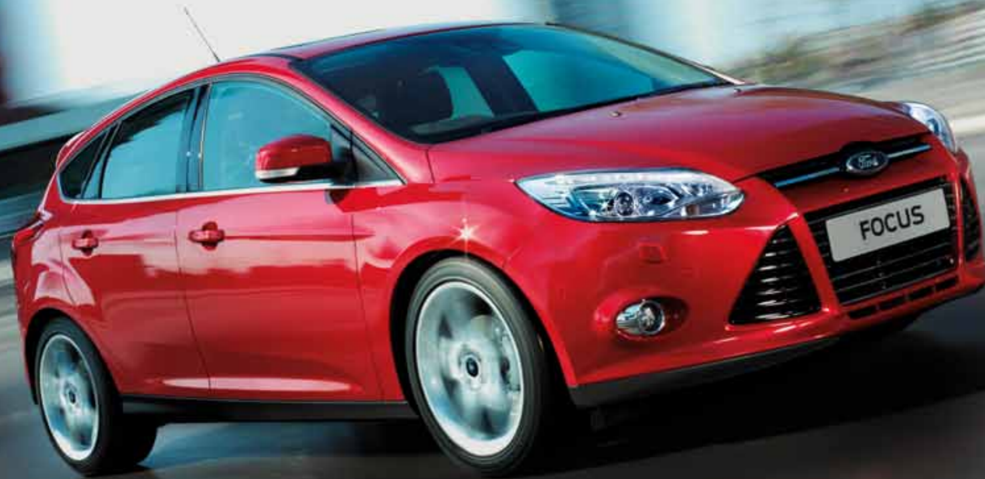
Focus Titanium Hatch with optional Sports Executive Pack shown in Candy Red.

Representing the next level of Ford Kinetic Design, this is a car that makes its presence known. Whichever way you look at it, the all-new Focus is impossible to ignore.