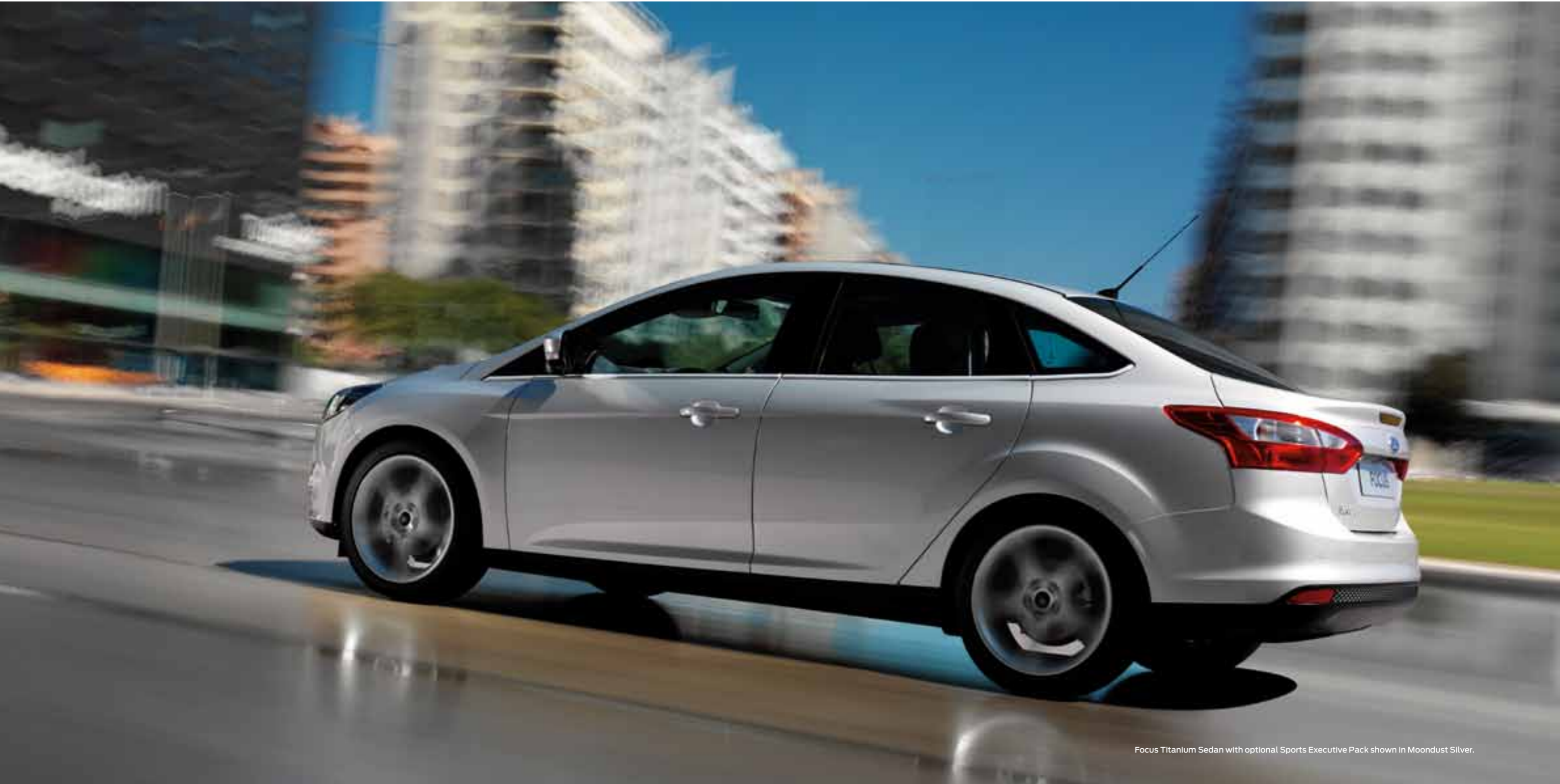
Focus Titanium Sedan with optional Sports Executive Pack shown in Moon dust Silver.

Get ready for the most addictive driving experience, with all the agility and precision you could wish for. It's so much fun to drive, you'll always be craving for more.