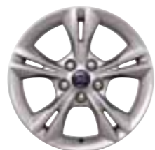
16" 5x2-spoke alloy wheel (Standard on Trend)