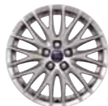
17" 10x2-spoke alloy wheel (Standard on Sport)