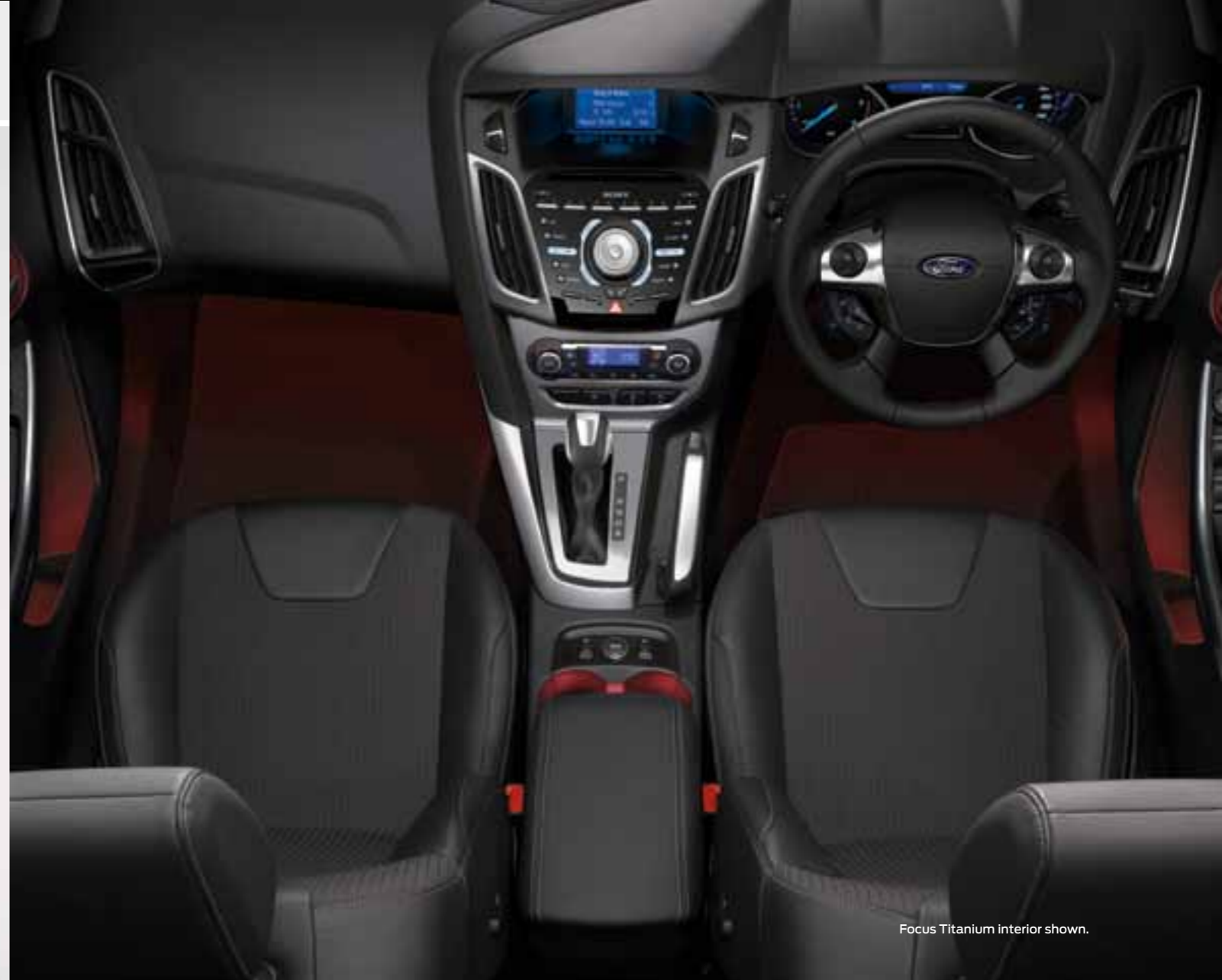
Focus Titanium interior shown.