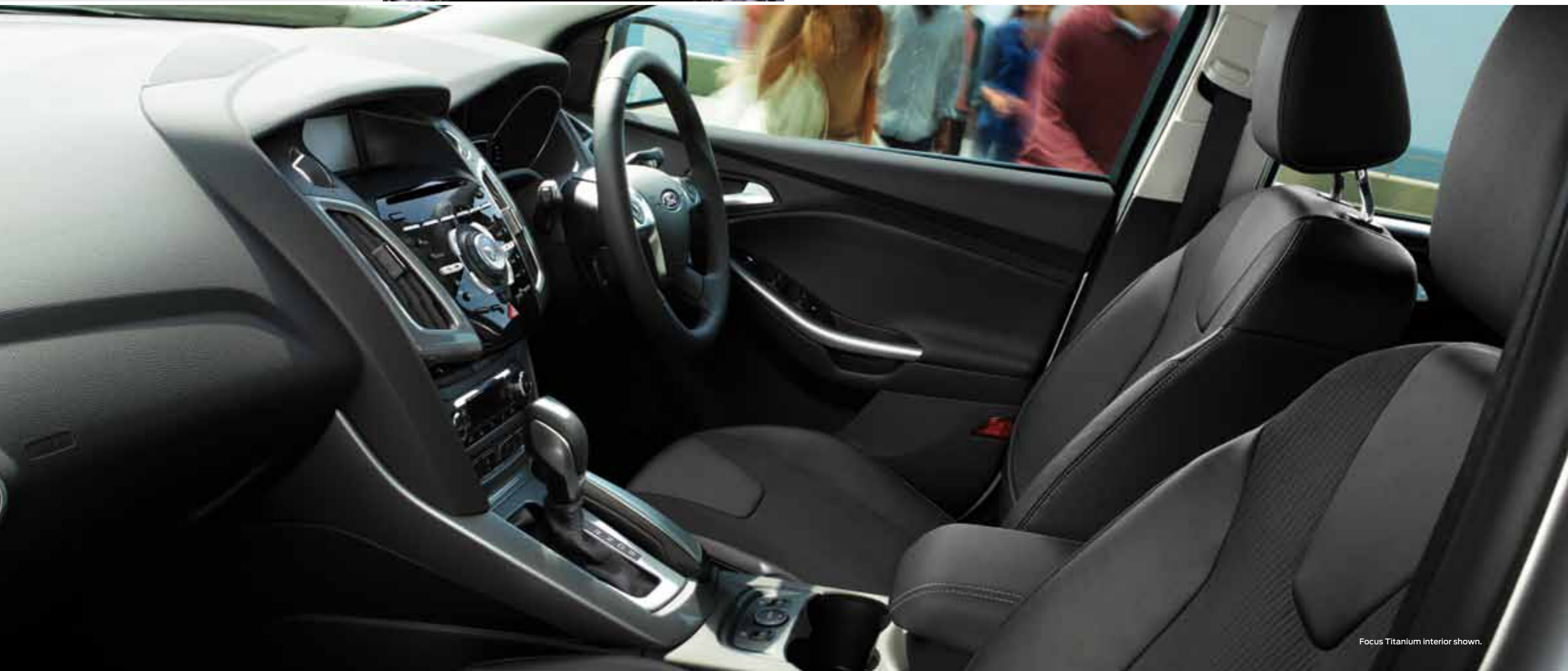
Focus Titanium interior shown.

Your every connection with the all-new Focus – from driver-orientated cockpit to the responsiveness of the steering, throttle and brakes, and the feel of the switches and controls – makes you feel a part of the car.