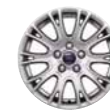
16" 10x2-spoke alloy wheel