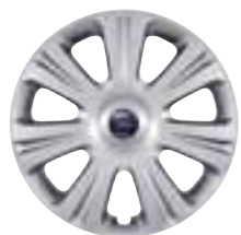
16" 7-spoke wheel cover (Standard on Ambiente)