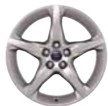
18" 5-spoke alloy wheel (Standard on Titanium)