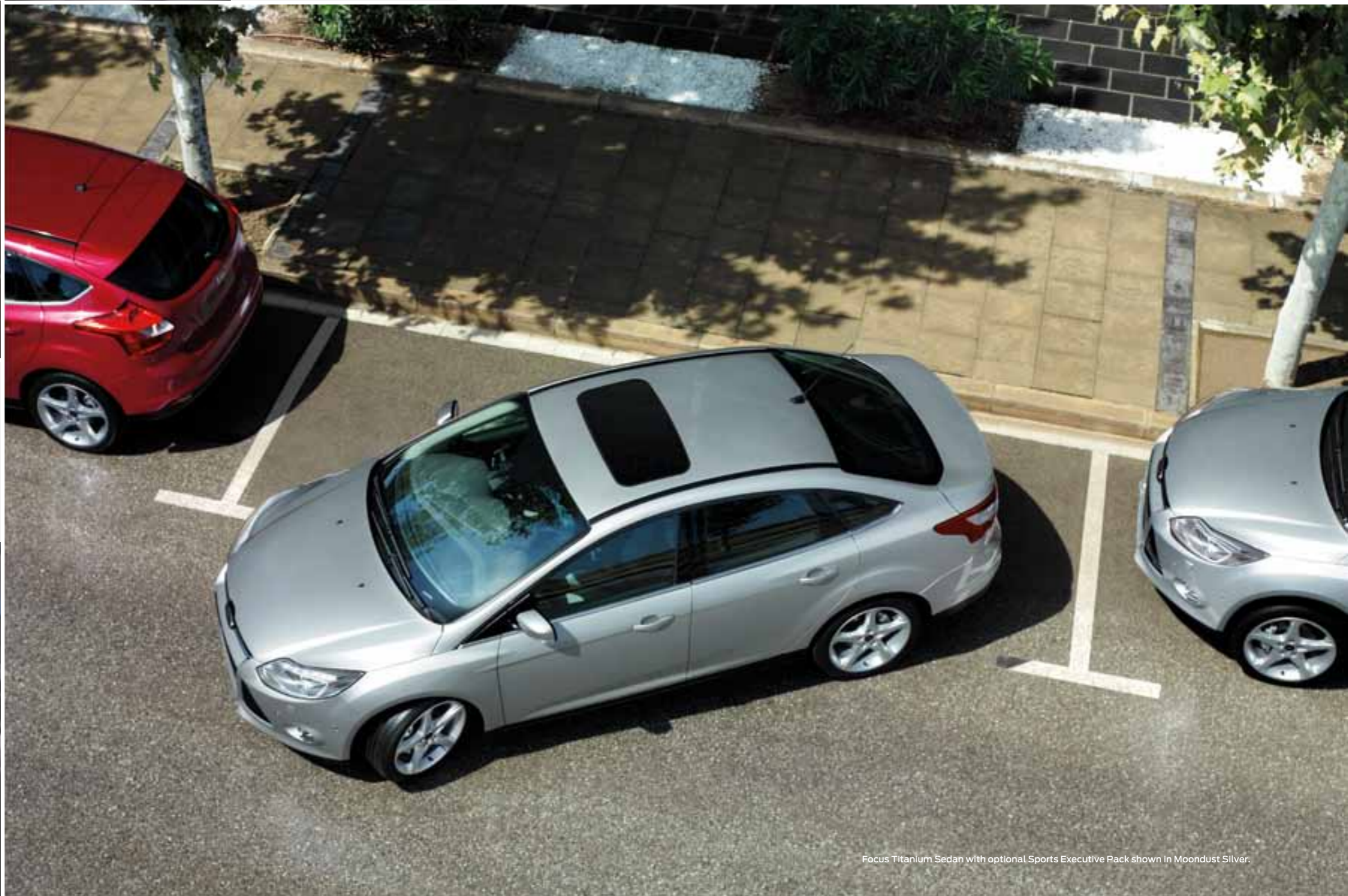
Focus Titanium Sedan with optional Sports Executive Pack shown in Moondust Silver.