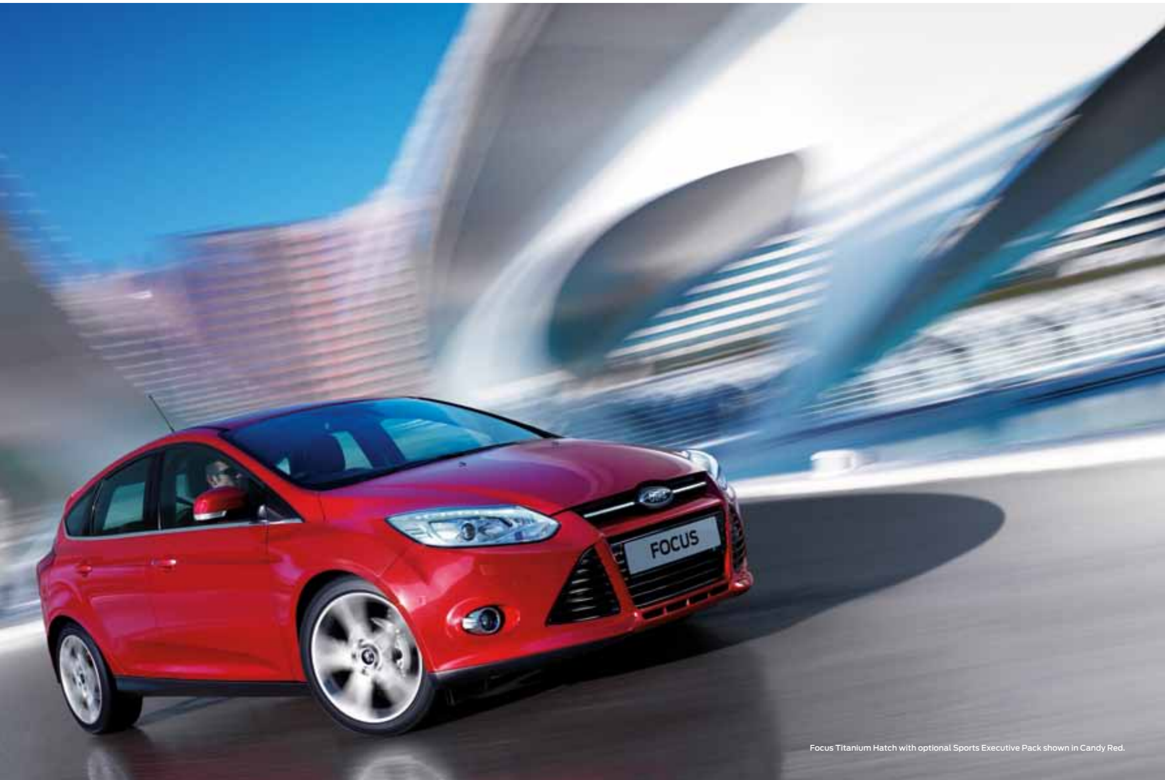
Focus Titanium Hatch with optional Sports Executive Pack shown in Candy Red.

The all-new Focus combines our latest engine and transmission technology with a dynamic chassis and precise steering. It reminds you how driving can be such a pleasure.