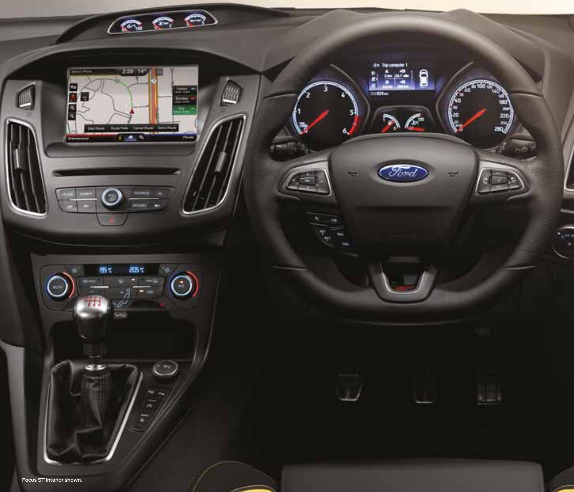
Focus ST interior shown.