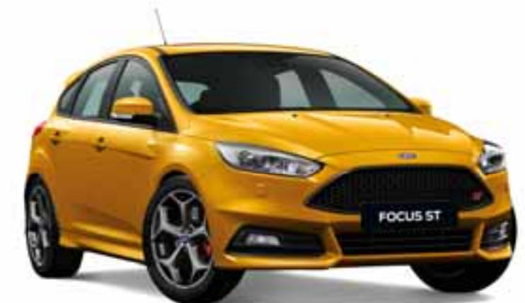
Focus ST show in Tangerine Scream. 3