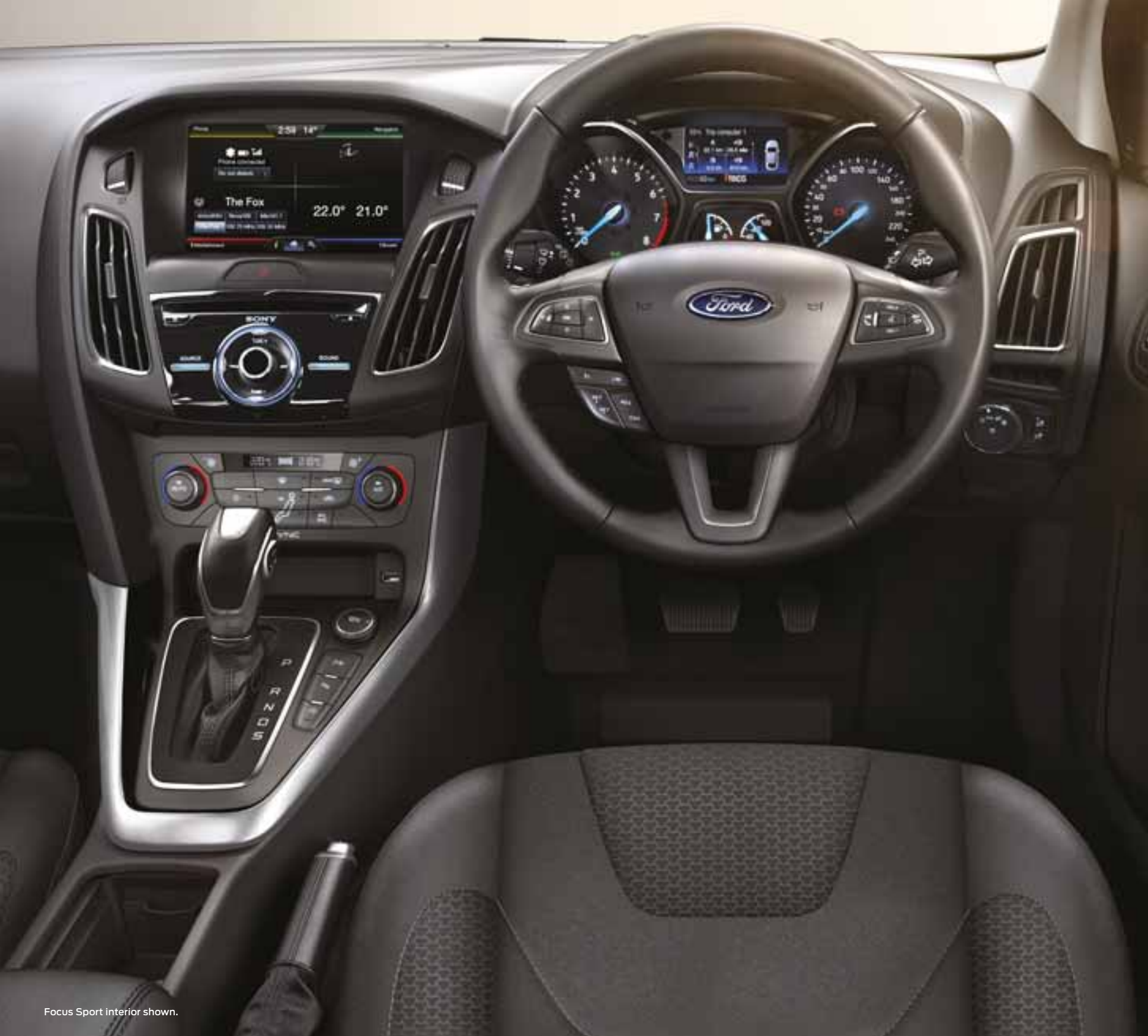
Focus Sport interior shown.