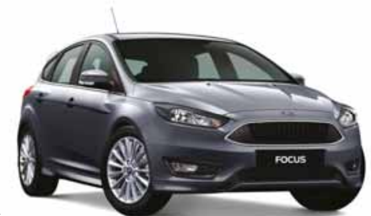
Focus Sport shown in Magnetic! 1