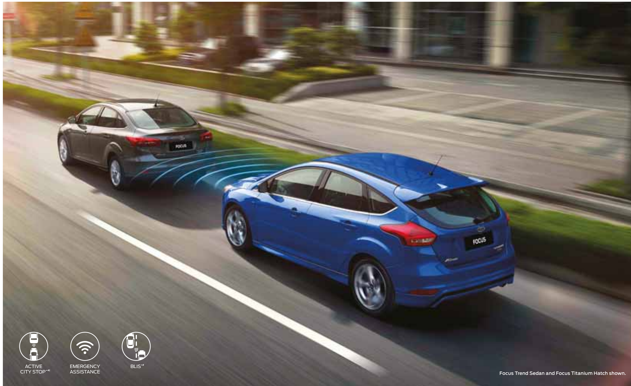
Focus Trend Sedan and Focus Titanium Hatch shown.