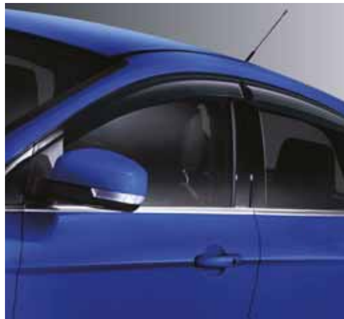
Weathershield. Reduces wind turbulence and noise, allowing you a more enjoyable drive with the windows down, even during light rain. Front and rear available.