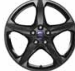
18" 5 spoke alloy wheel