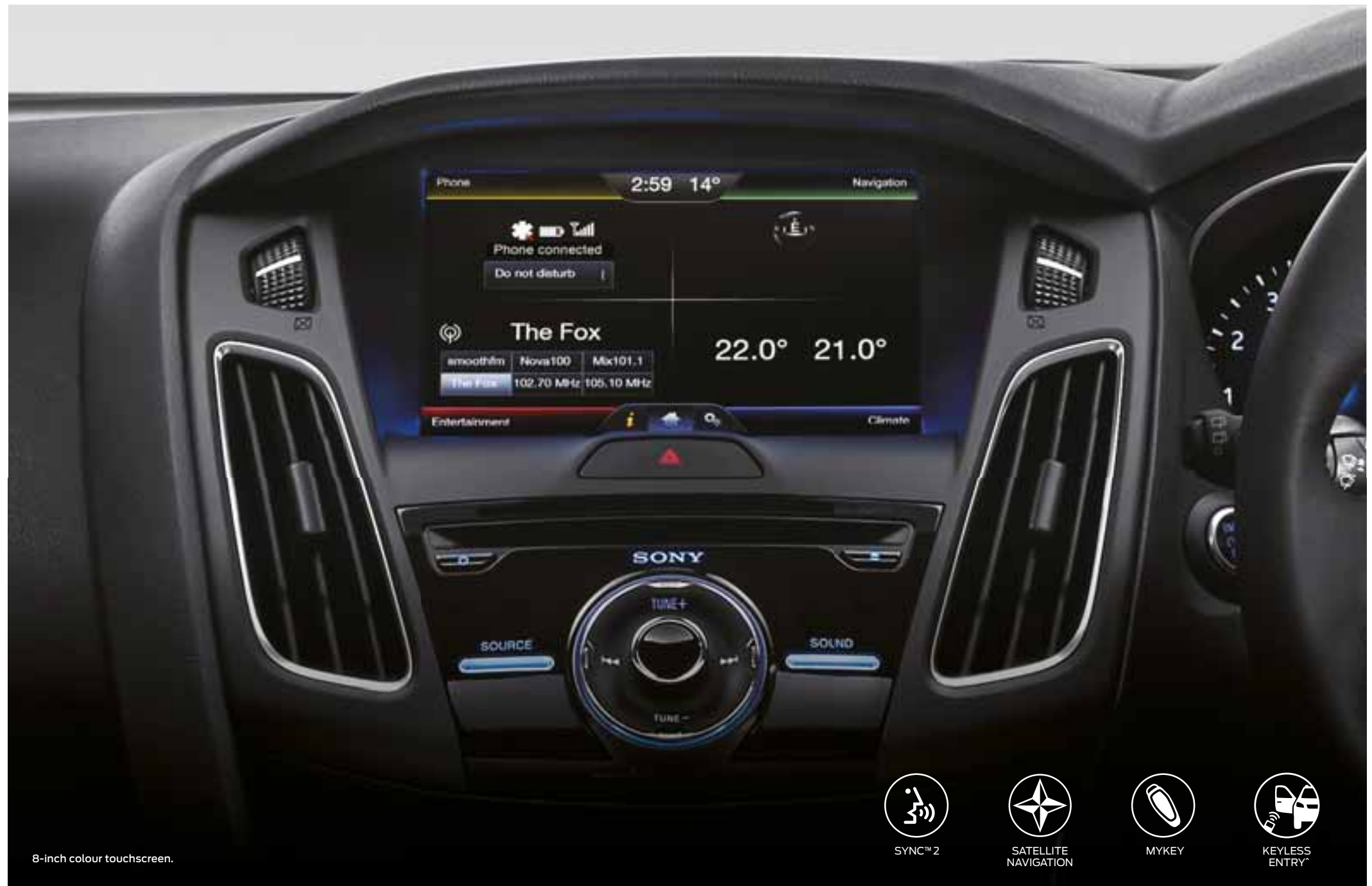
8-inch colour touchscreen.