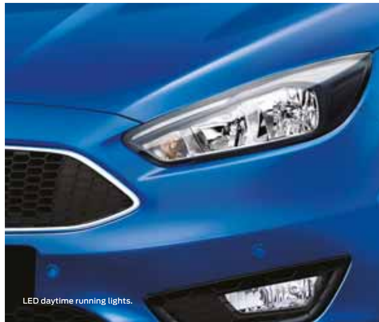
LED daytime running lights.