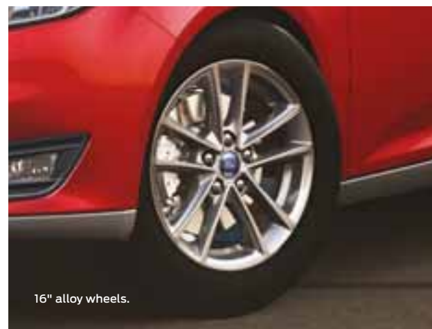
16" alloy wheels.