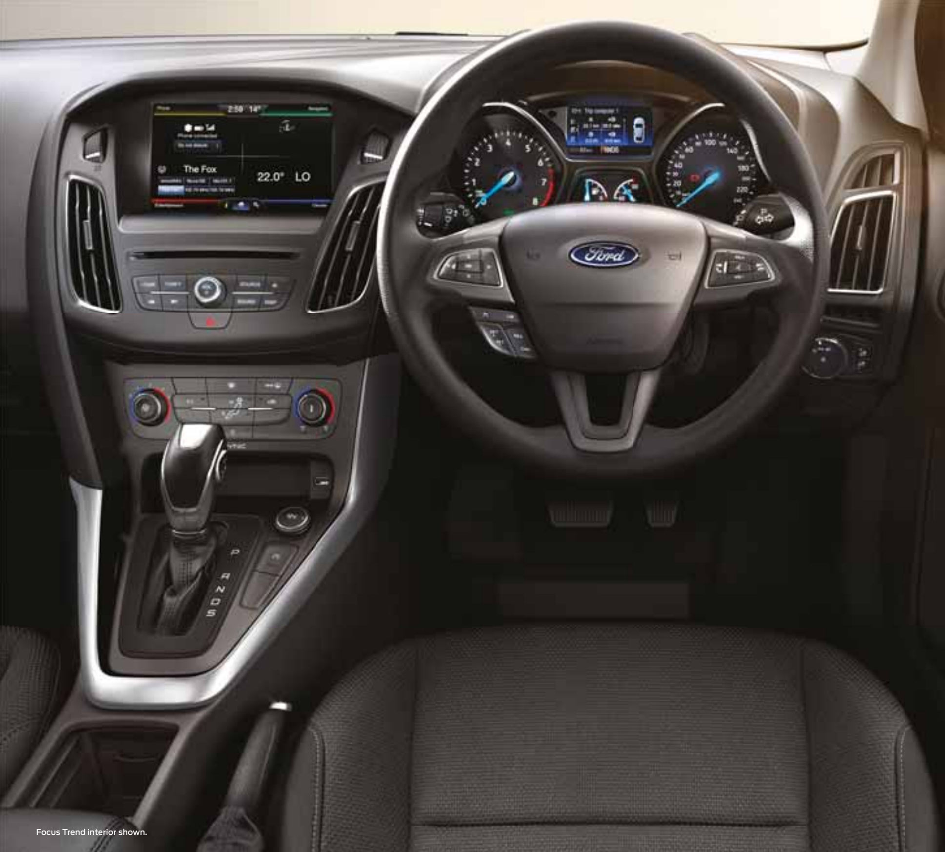
Focus Trend interior shown.