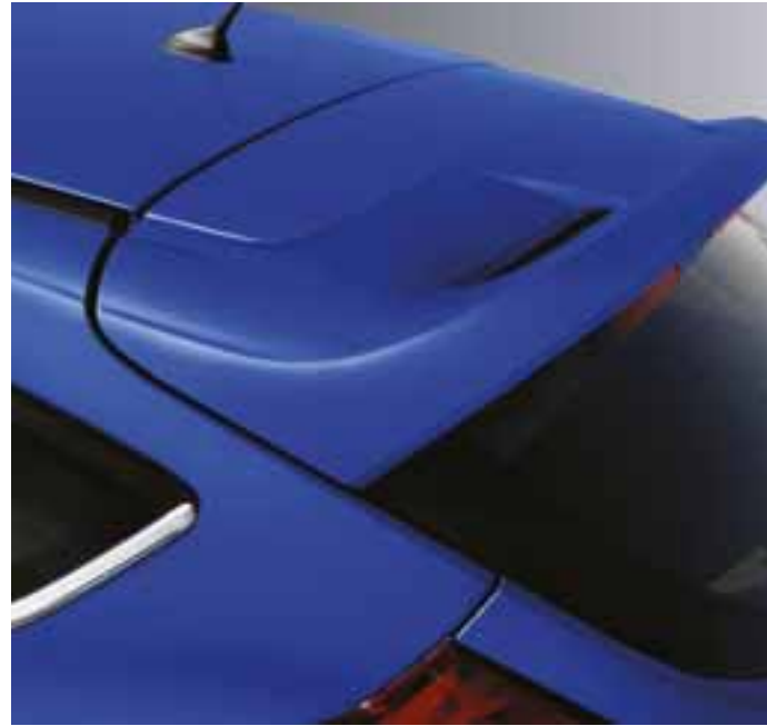
Hatch rear spoiler – large. This accessory gives an aerodynamic finish to the roof line.