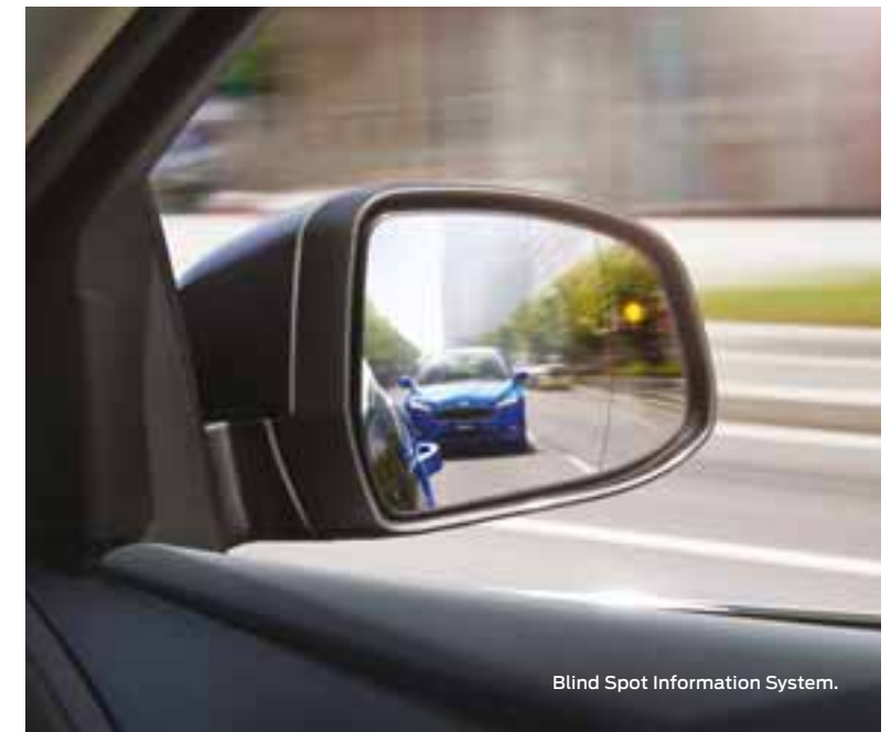
Blind Spot Information System.