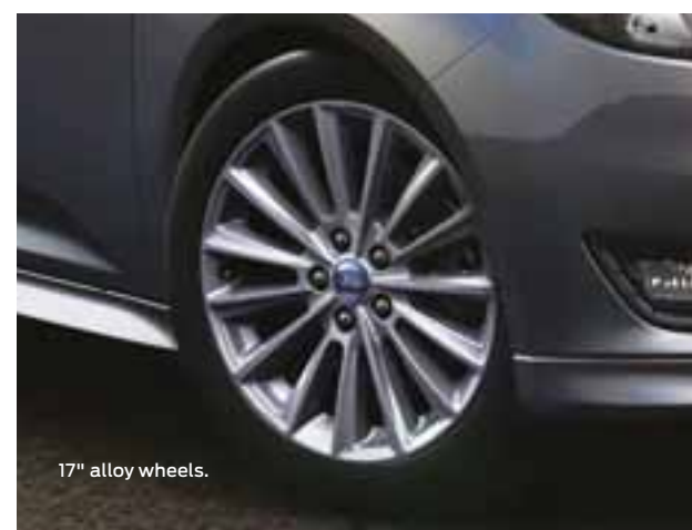
17" alloy wheels.