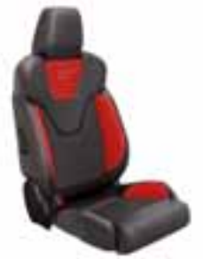
Trim colour: Race Red Paint colour: Race Red