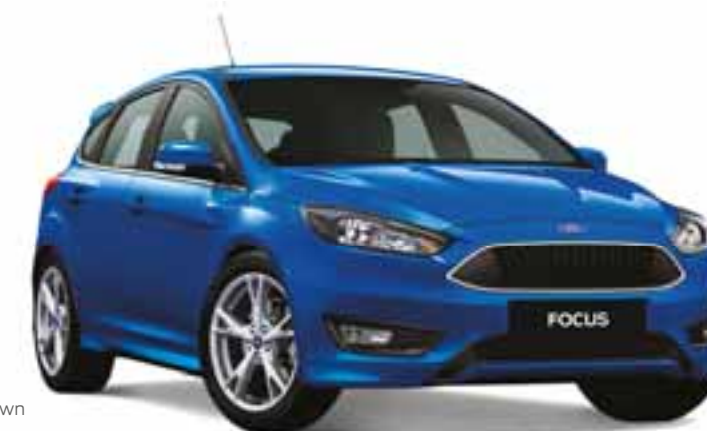
Focus Titanium shown in Winning Blue 1 .