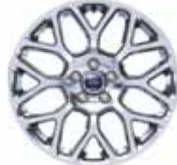
18" 8x2 spoke alloy wheel