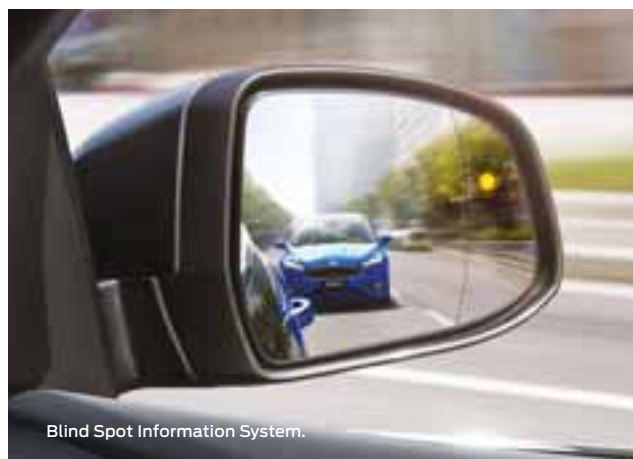
Blind Spot Information System.