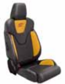
Trim colour: Tangerine Scream Paint colour: Tangerine Scream