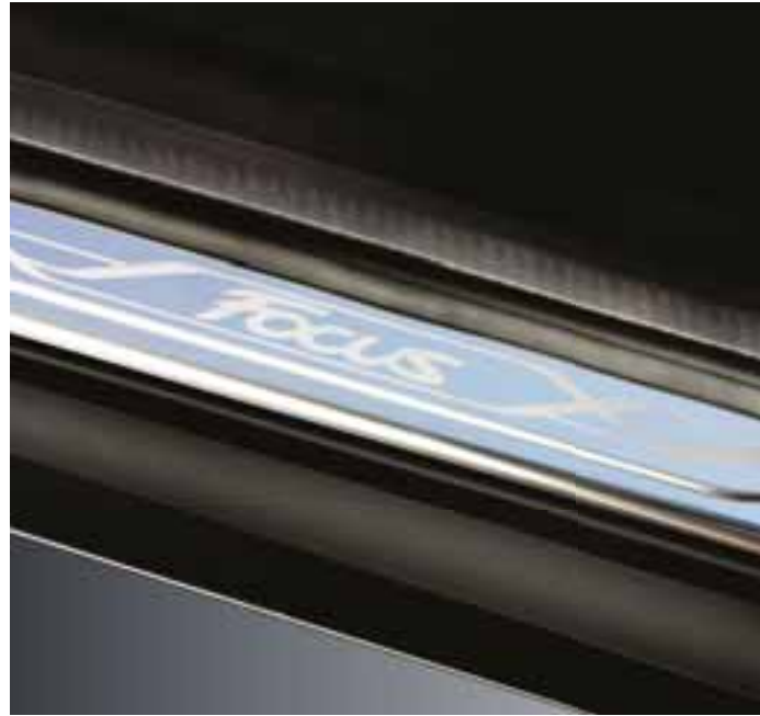
Scuff plates. Elegant polished stainless steel scuff plates, with etched 'Focus' script.