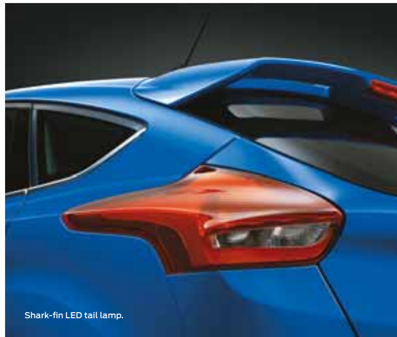
Shark-fin LED tail lamp.