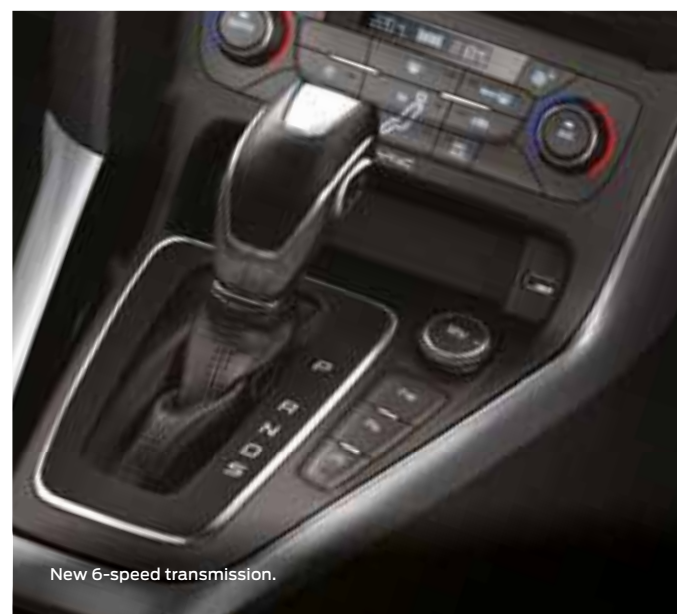
New 6-speed transmission.