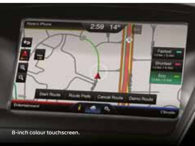
8-inch colour touchscreen.