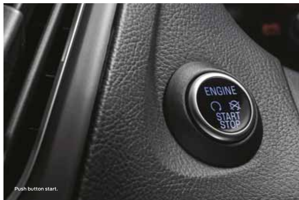
Push button start.

Be cool. On a hot day, open all your windows and cool your car quickly before you even get in. Just press and hold a button on your key fob and all the windows open automatically.^