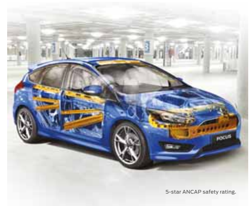
5-star ANCAP safety rating.