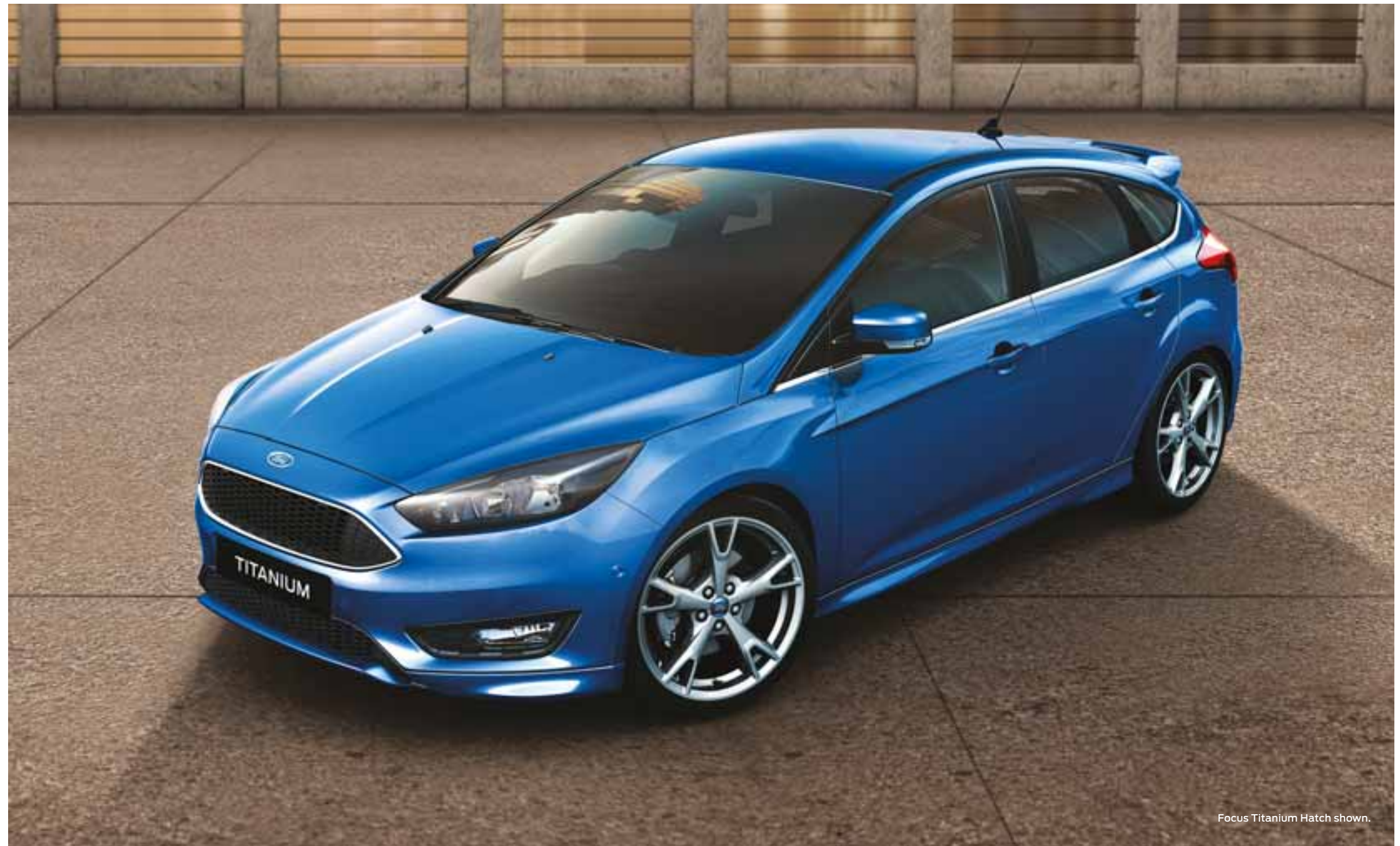
Focus Titanium Hatch shown.