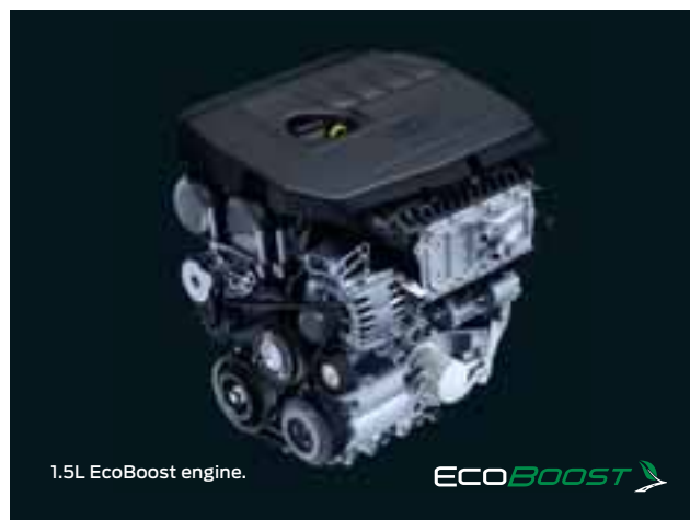
1.5L EcoBoost engine.