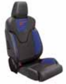
Trim colour: Performance Blue Paint colour: Performance Blue