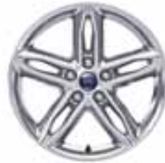
17" 5x2 spoke alloy wheel