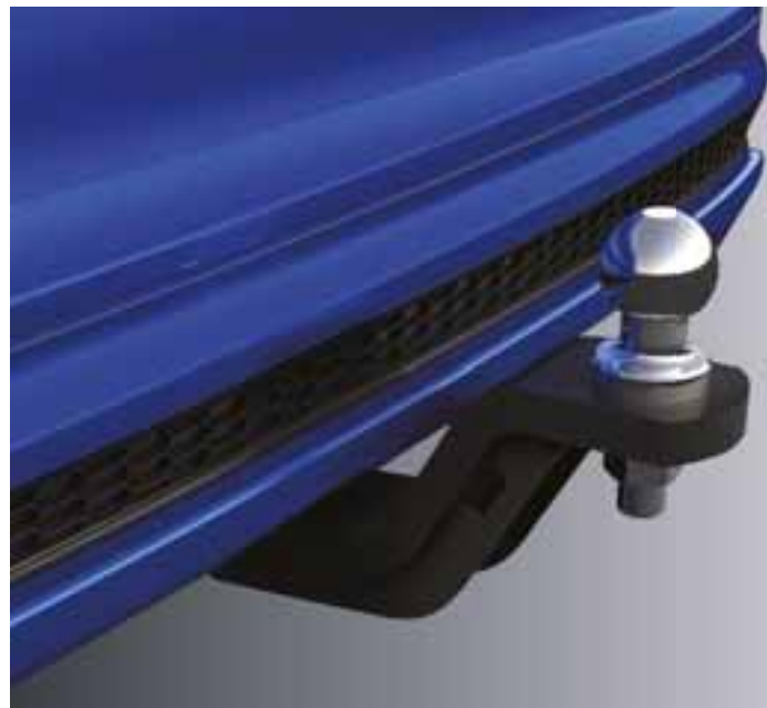
Tow pack. Whether your towing requirements are for work or play, the Genuine Ford Tow Pack will make towing a breeze.