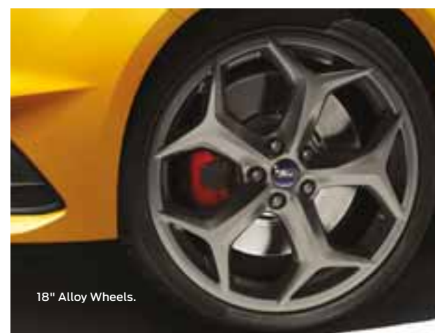
18" Alloy Wheels.