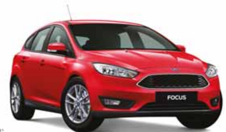
Focus Trend Hatch shown in Candy Red 6