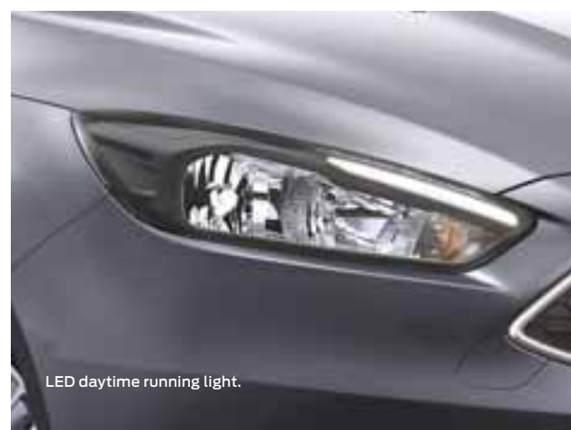
LED daytime running light.