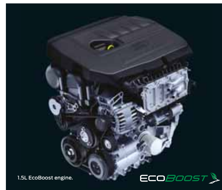
1.5L EcoBoost engine.