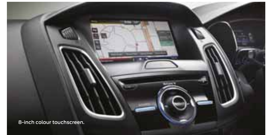
8-inch colour touchscreen.