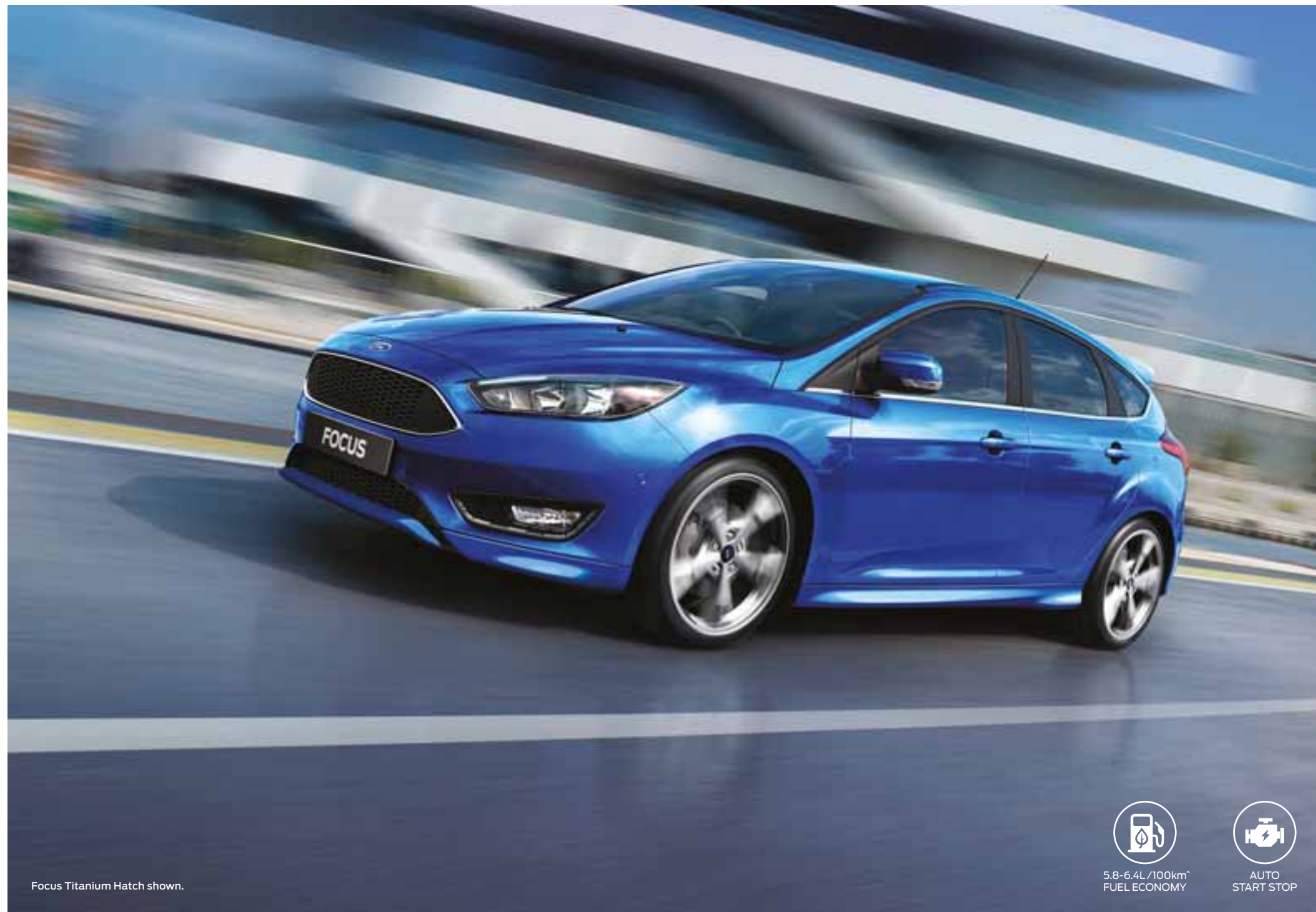
Focus Titanium Hatch shown.

Saves you money. When your Focus is at a standstill, Auto Start-Stop* automatically shuts down the engine, to reduce fuel use. Release the brake and the engine restarts.