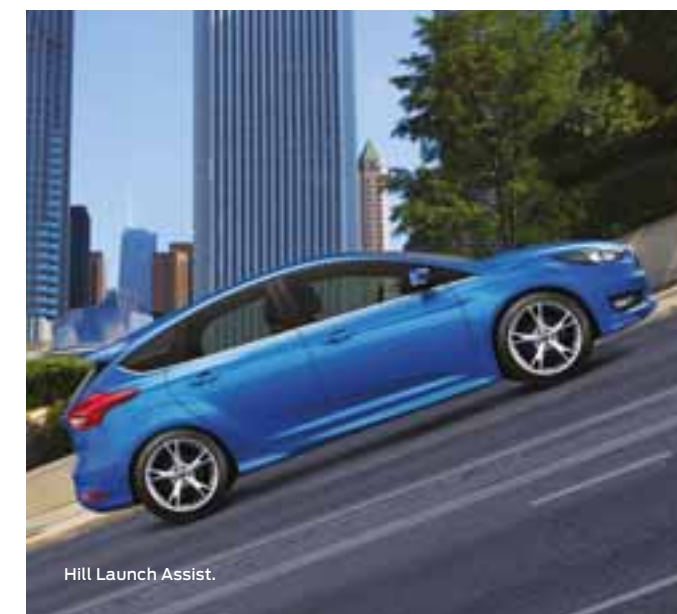
Hill Launch Assist.