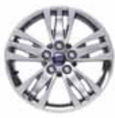
16" 5x3 spoke alloy wheel