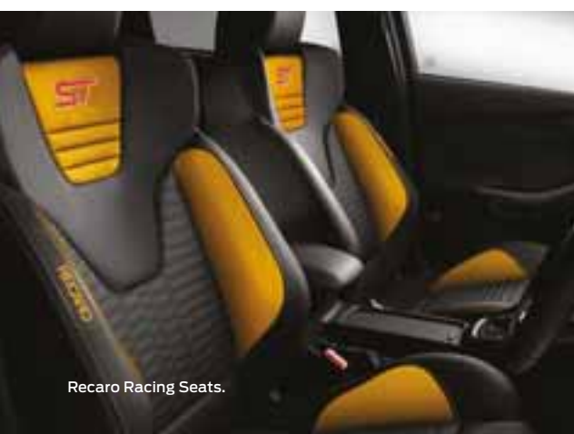
Recaro Racing Seats.