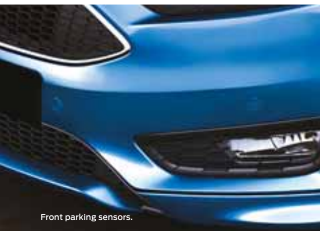
Front parking sensors.