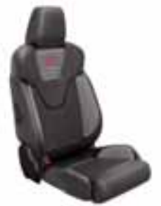
Trim colour: Smoke Storm Paint colour: Moondust Silver, Frozen White, Shadow Black, Stealth