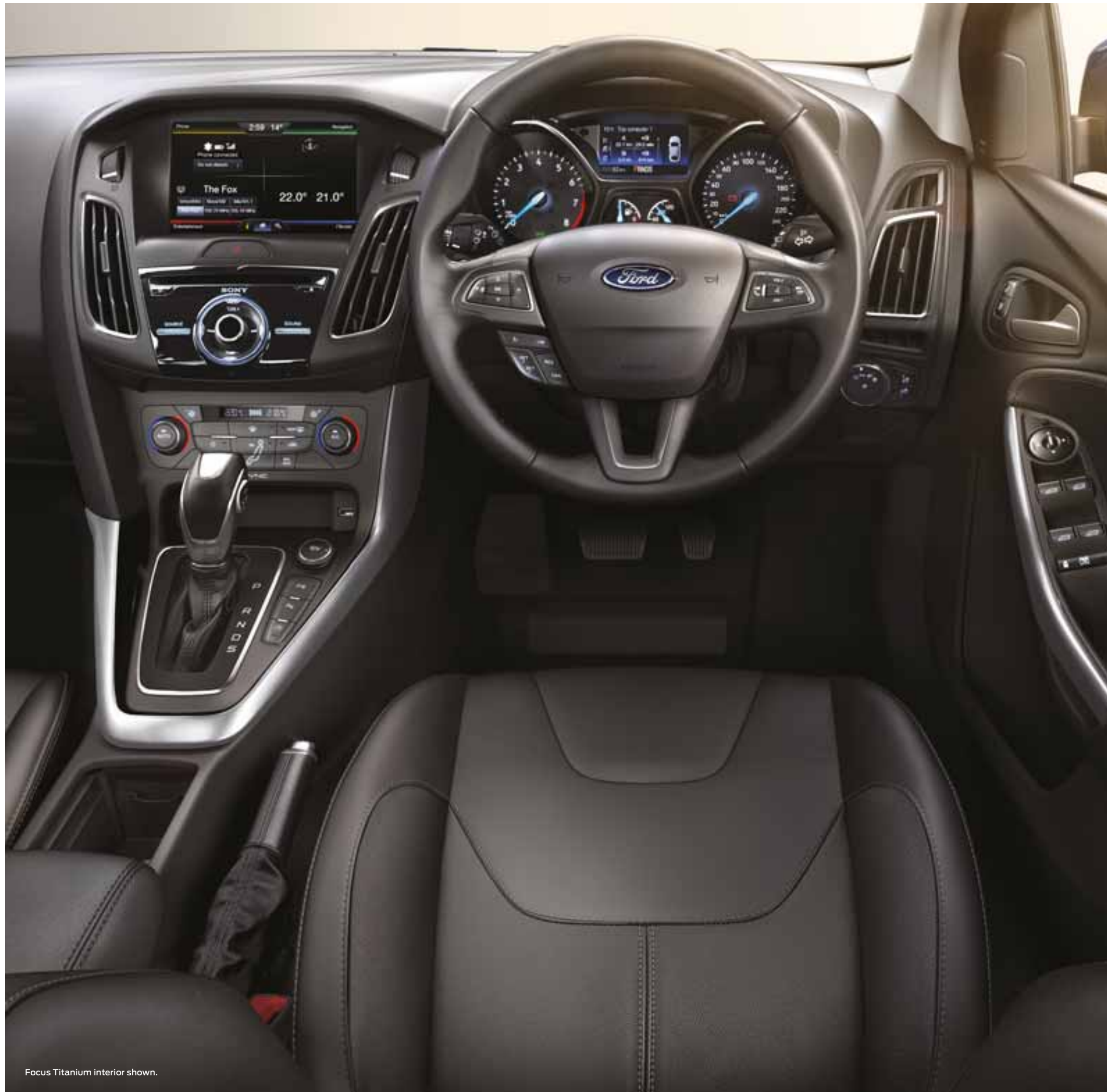
Focus Titanium interior shown.