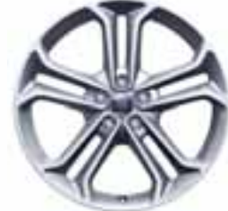
19" 5x2 spoke alloy wheel (ST only)