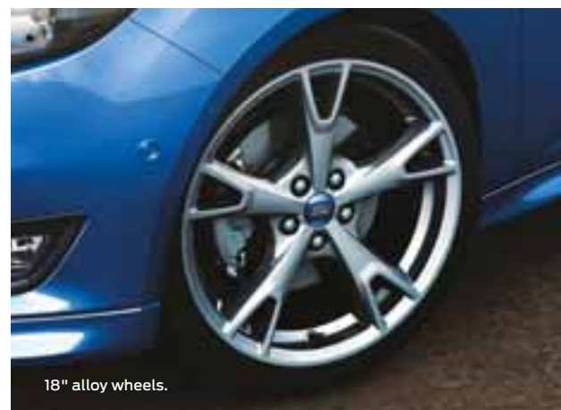
18" alloy wheels.