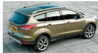
Roof rails - list