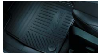
Rubber mats and rear carpet mats