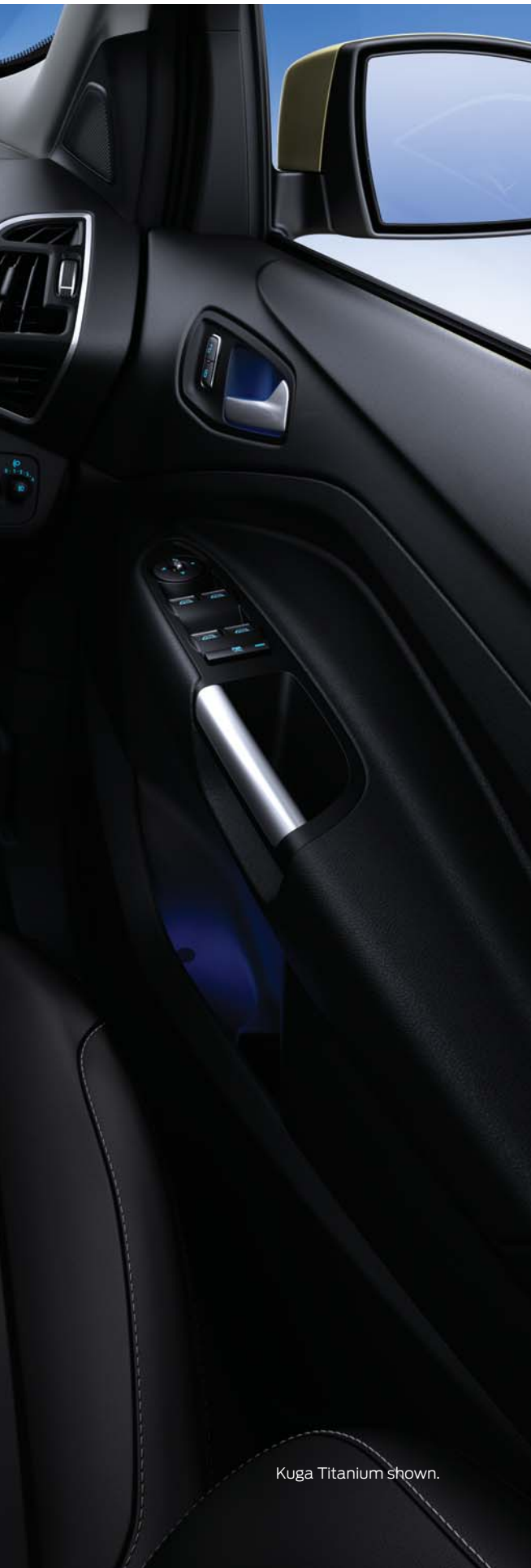
Kuga Titanium shown.