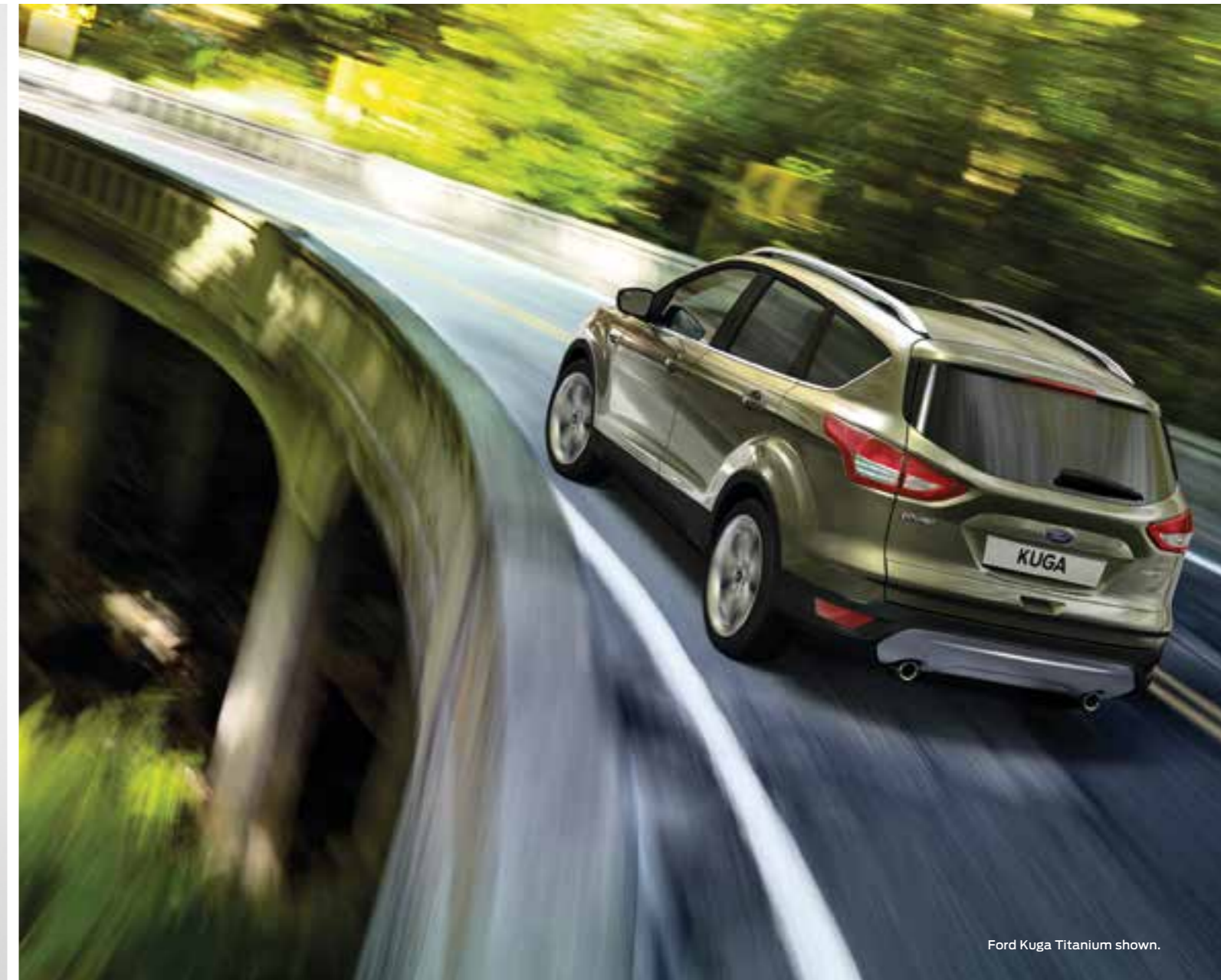
Ford Kuga Titanium shown.

A rear-facing child seat should never be placed in the front passenger seat when the Ford vehicle is equipped with an operational front passenger airbag. The safest place for children is properly restrained on the rear seat.