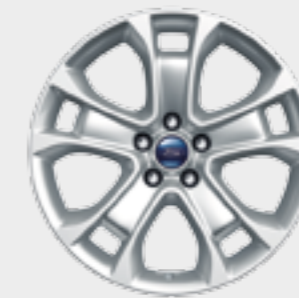
18" x 7.5" alloy wheel

Seat insert: Prada in Charcoal Black Seat bolster: Torino Leather in Charcoal Black Instrument panel: Charcoal Black