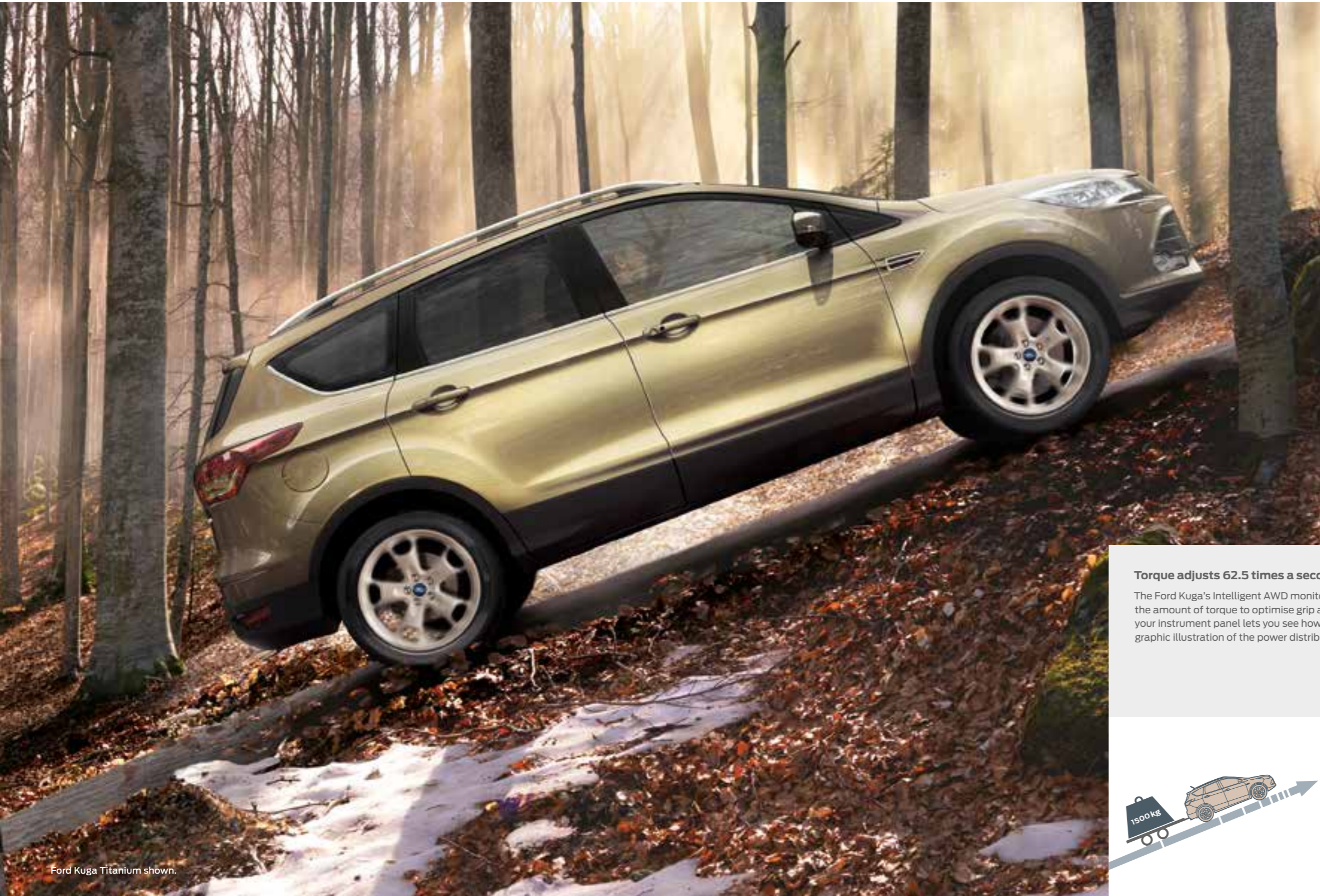
Ford Kuga Titanium shown.

Make the most of the terrain around you. The Ford Kuga's intelligent All-Wheel-Drive and streamlined power and efficiency helps you tackle whatever your day serves up to you, with confidence.