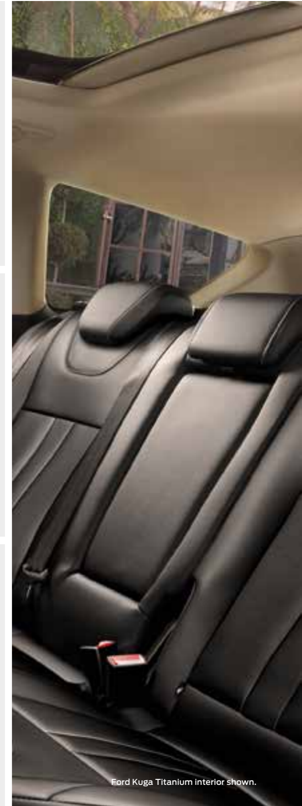
Ford Kuga Titanium interior shown.