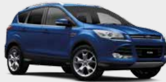
Deep Impact Blue**