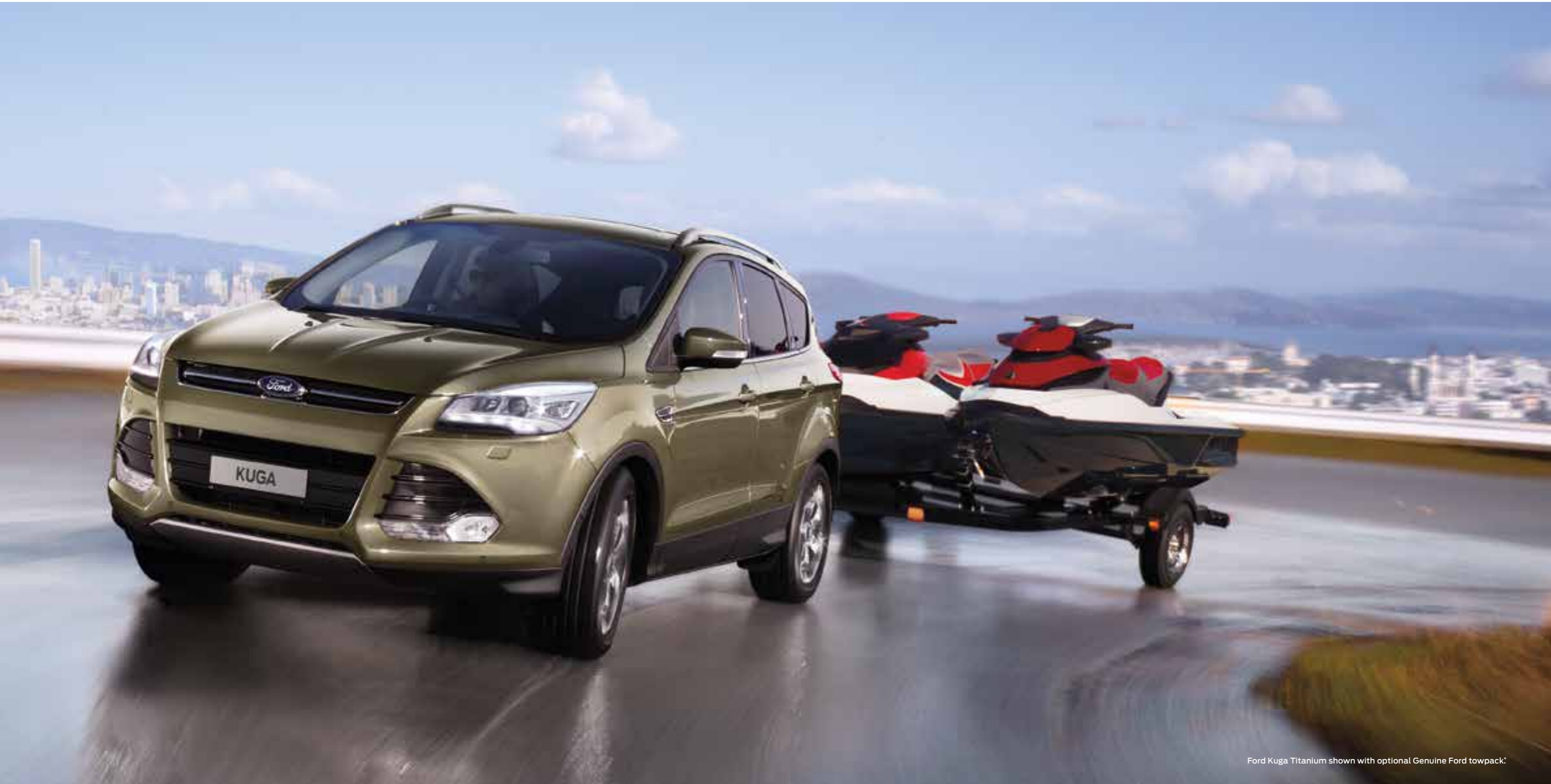
Ford Kuga Titanium shown with optional Genuine Ford towpack.*

Life can present unexpected surprises at any time. That's why the Ford Kuga is designed for maximum flexibility. It effortlessly adapts to how you drive, what you're carrying, and whatever road conditions you'll encounter on the way.