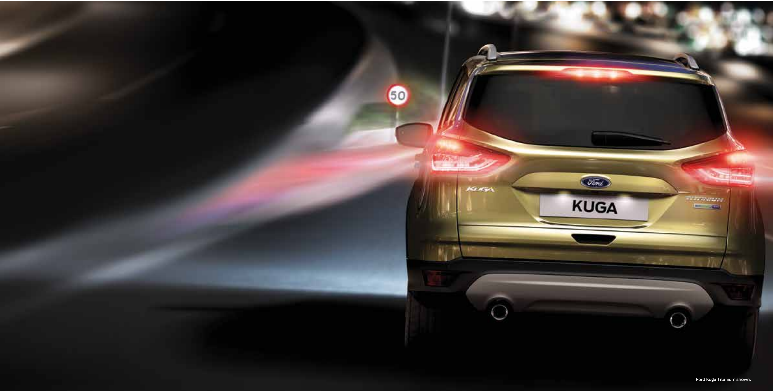
Ford Kuga Titanium shown.

The Ford Kuga incorporates some of the most advanced safety features available. Not only to help protect you, but to help prevent the need for protection in the first place.