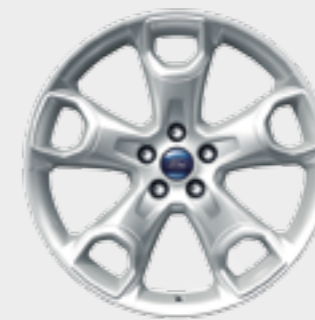
19" x 8" alloy wheel

Seat insert: Torino Leather in Charcoal Black Seat bolster: Torino Leather in Charcoal Black Instrument panel: Charcoal Black