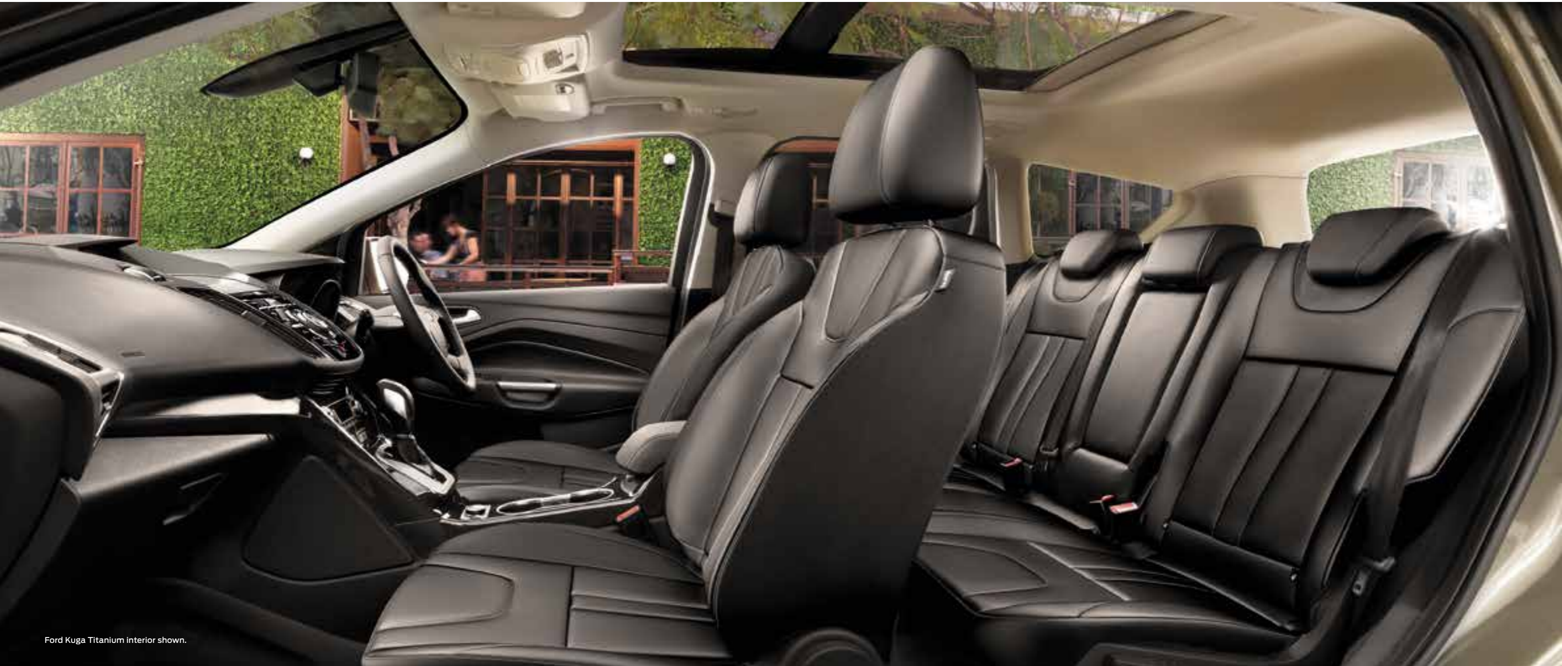
Ford Kuga Titanium interior shown.

You know the saying 'a place for everything, and everything in its place?' That's the philosophy behind the Ford Kuga's cabin design, with plenty of clever storage to make under-seat clutter a thing of the past.