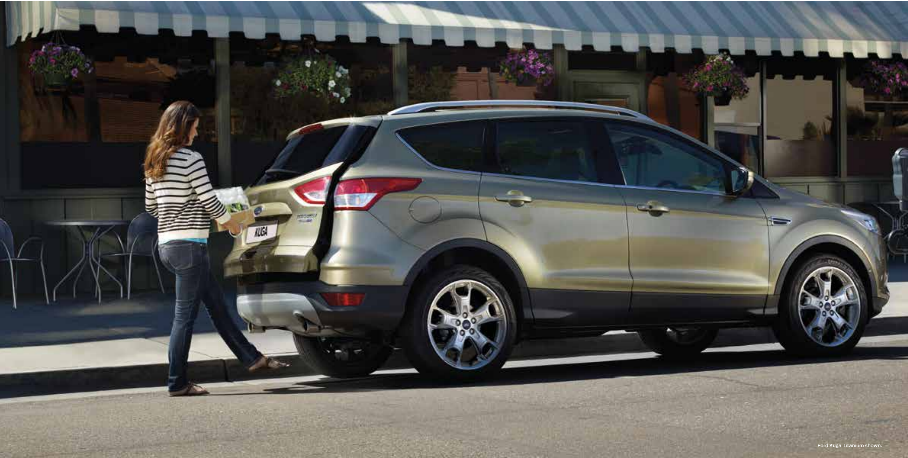
Ford Kuga Titanium shown.

The technology in the Ford Kuga isn't solely about a better driving experience. It's also about making every day more effortless and enjoyable. 4