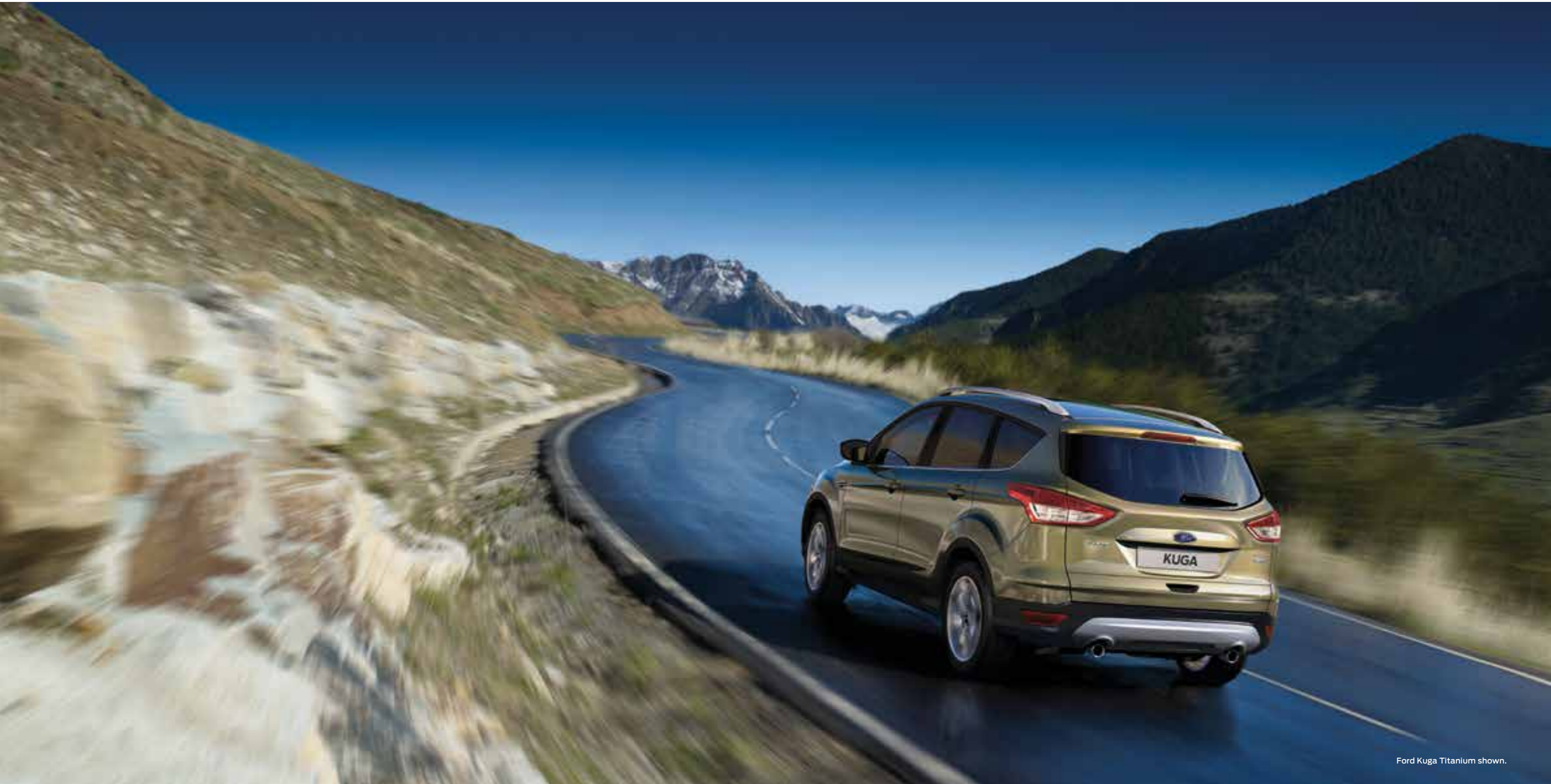
Ford Kuga Titanium shown.

The Ford Kuga offers petrol and diesel engine options with smart fuel-saving technologies, delivering impressive fuel-efficiency without compromising power. 14