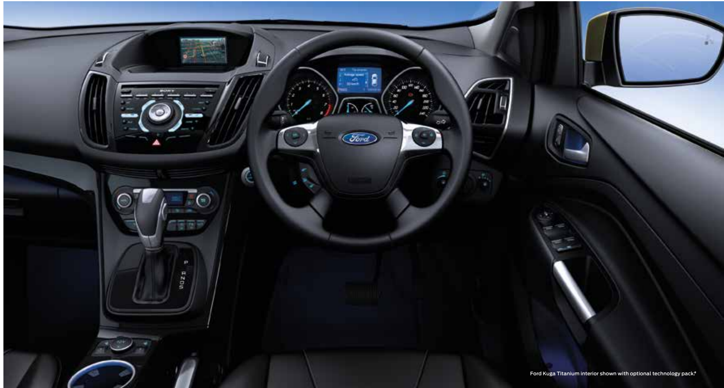
Ford Kuga Titanium interior shown with optional technology pack.‡

First it helps you find a parking spot that's just the right fit. Then it virtually parallel parks itself. How? Simply push a button, put the Ford Kuga into gear, take your hands off the wheel and watch it perfectly steer itself into your parking space. All you have to do is work the accelerator and brakes – and relax.