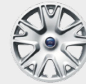
17" x 7.5" steel wheel

Seat insert: Prada in Charcoal Black Seat bolster: Lux in Charcoal Black Instrument panel: Charcoal Black