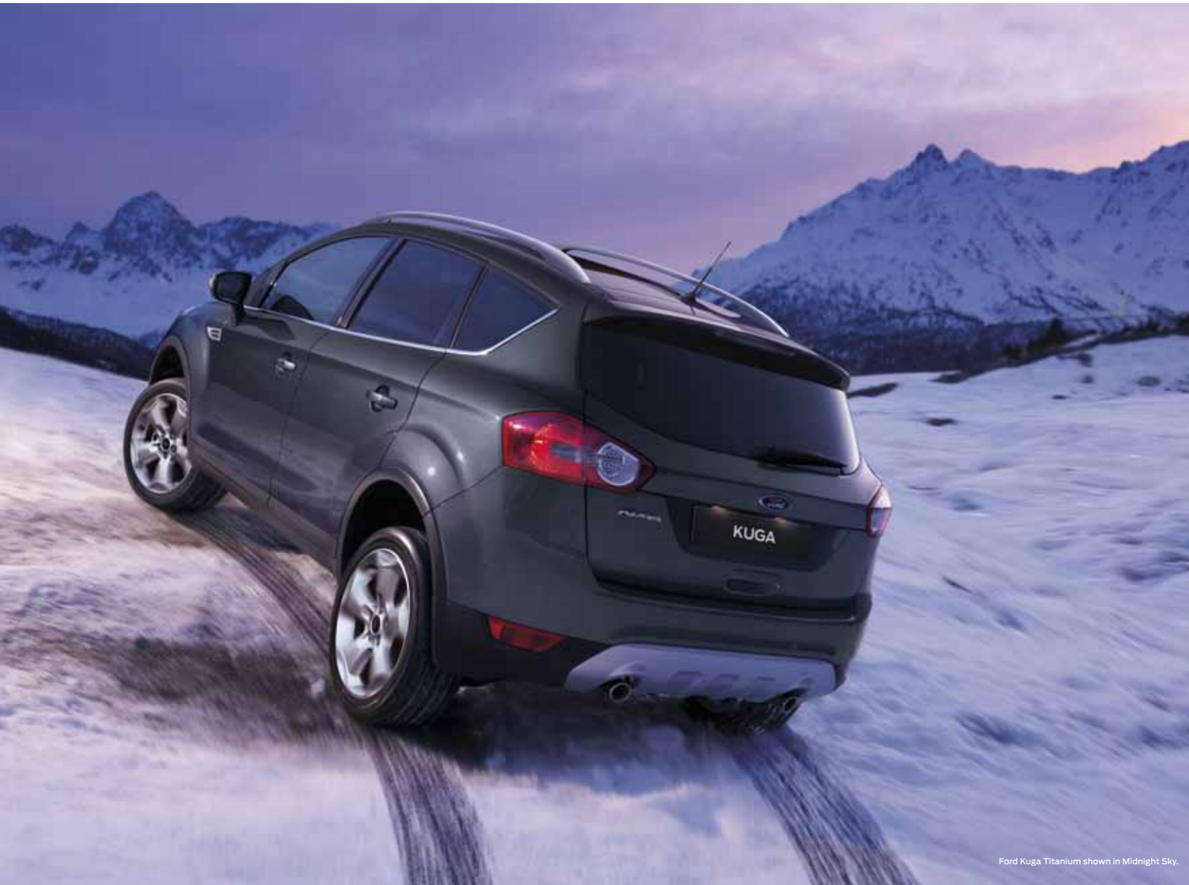
Ford Kuga Titanium shown in Midnight Sky.

Quality is evident across every inch of the Ford Kuga. From the advanced driving dynamics to the bold and stylish design and body form.