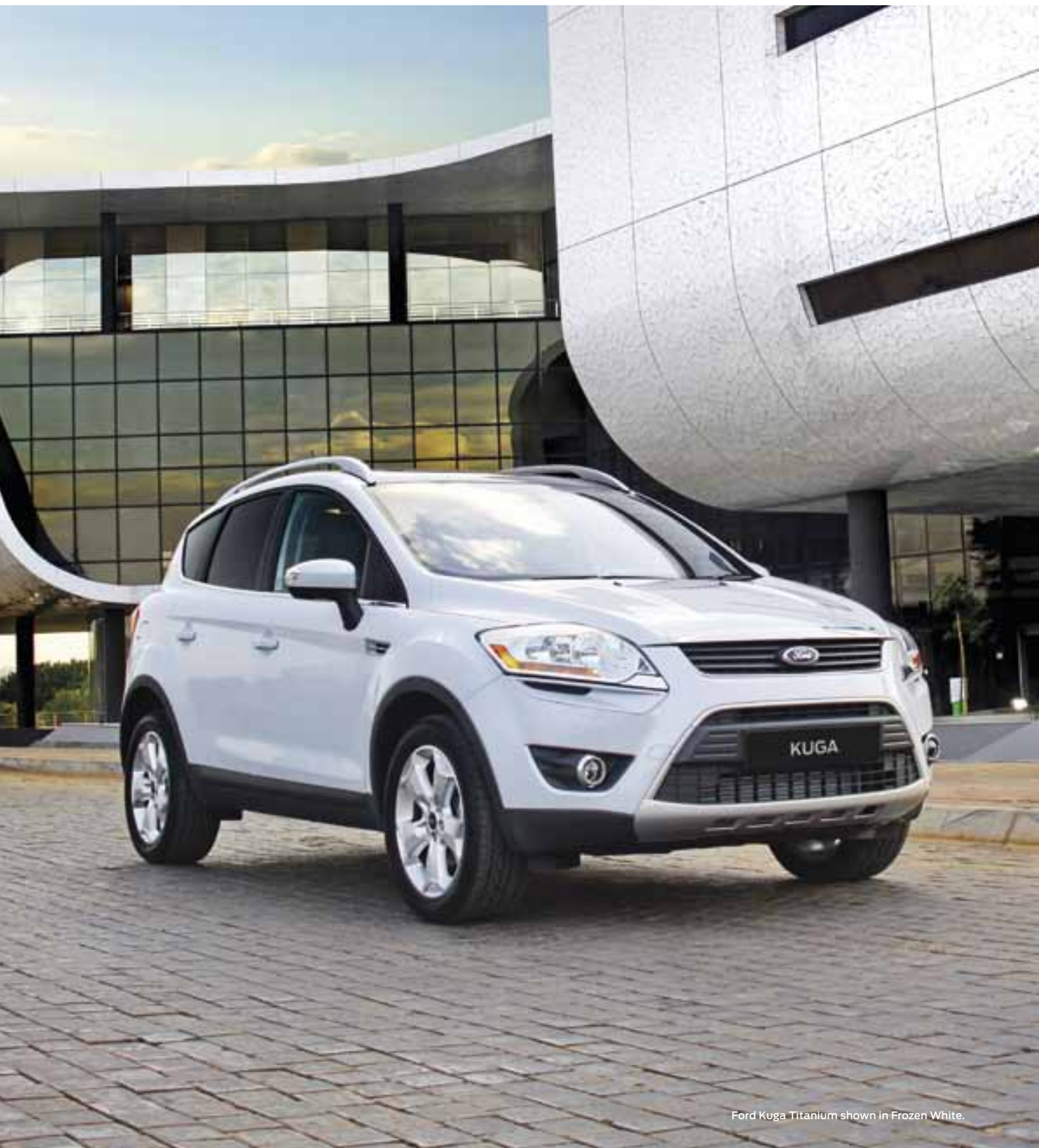
Ford Kuga Titanium shown in Frozen White.