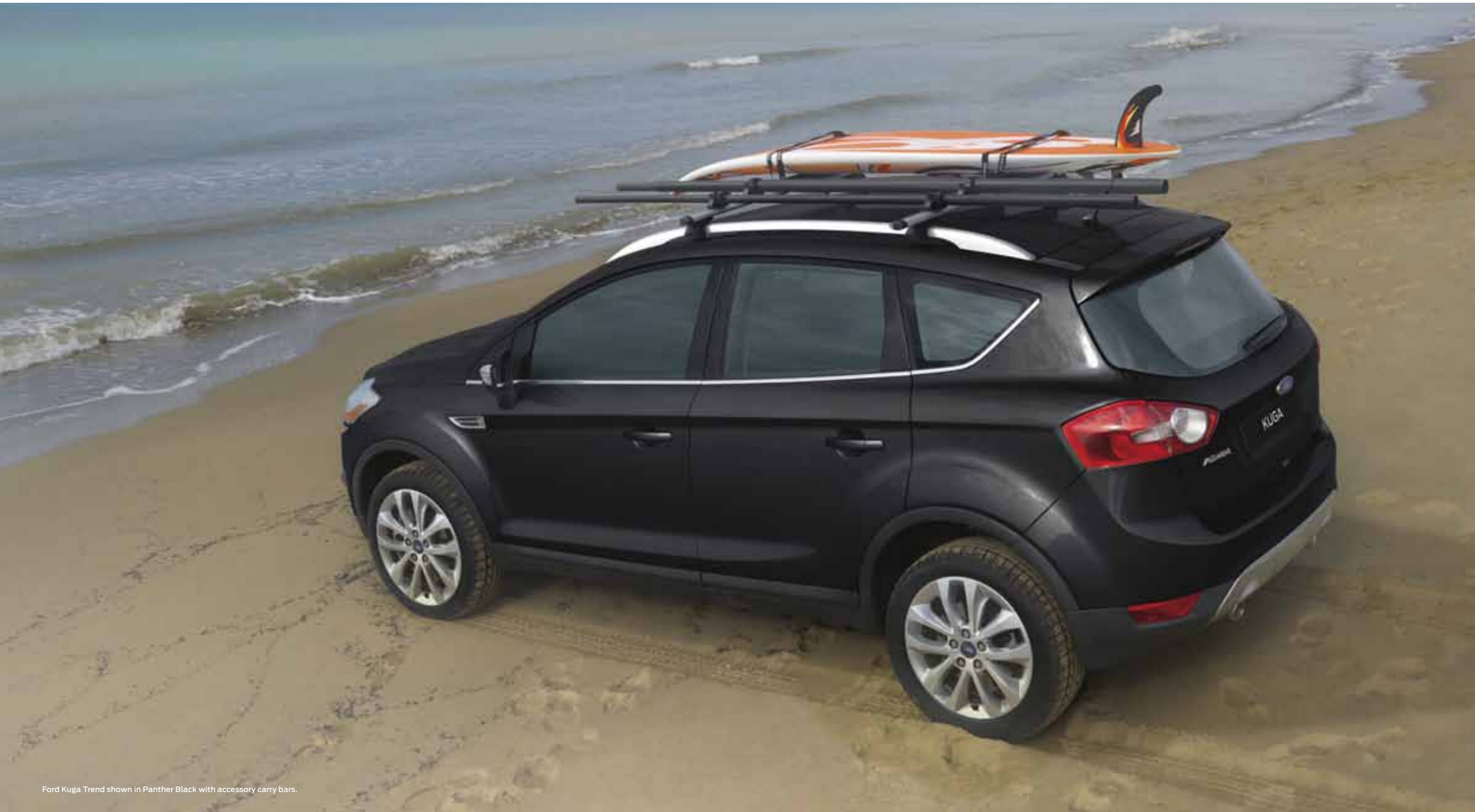
Ford Kuga Trend shown in Panther Black with accessory carry bars.

Enticing on and off-road driving performance is allied with a versatile and spacious interior to make Ford Kuga the perfect vehicle for all occasions.