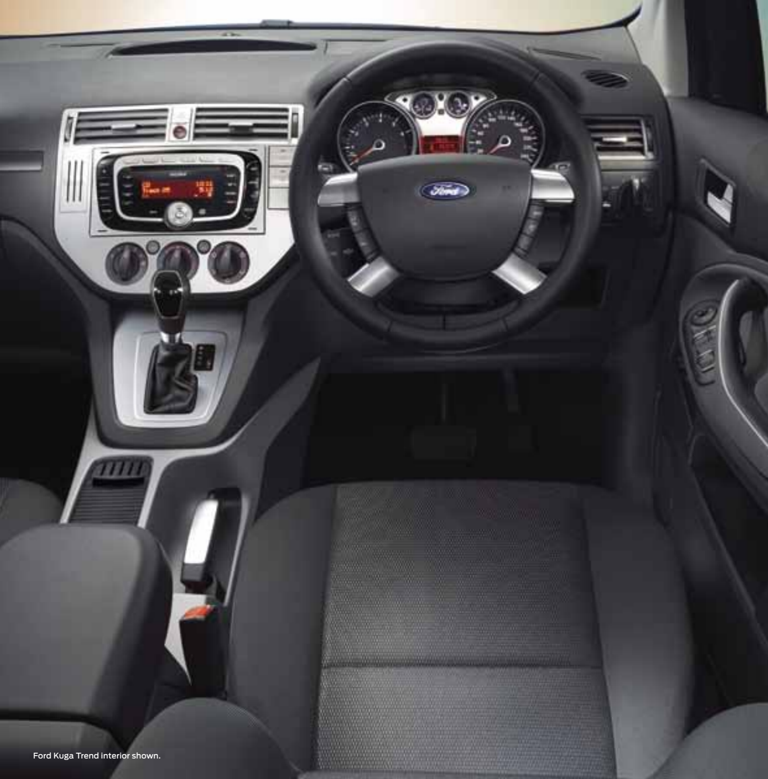
Ford Kuga Trend interior shown.