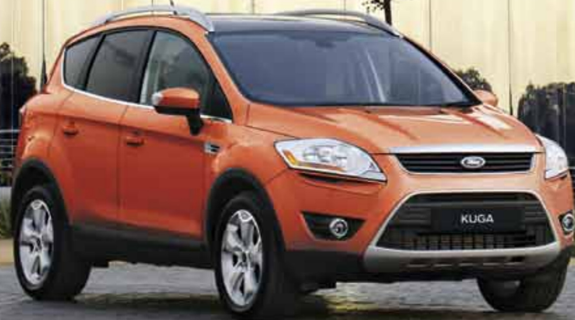
FORD KUGA TITANIUM

With the Ford Kuga Titanium and Ford Kuga Trend, outstanding drivability, handling and control meet style, comfort and quality.