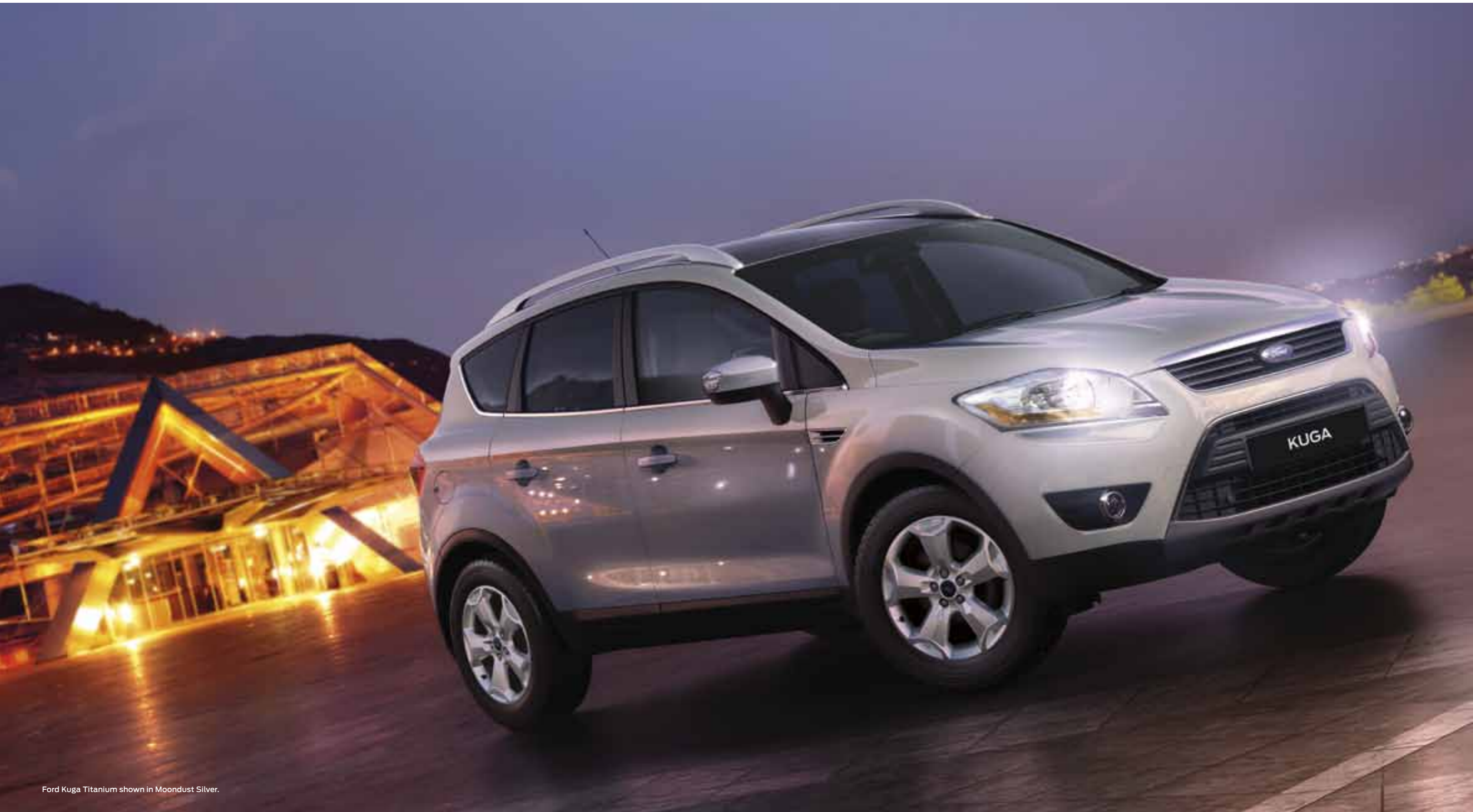
Ford Kuga Titanium shown in Moondust Silver.

With dynamic lines and bold styling, the Ford Kuga is an eye catching new addition to the Ford family.