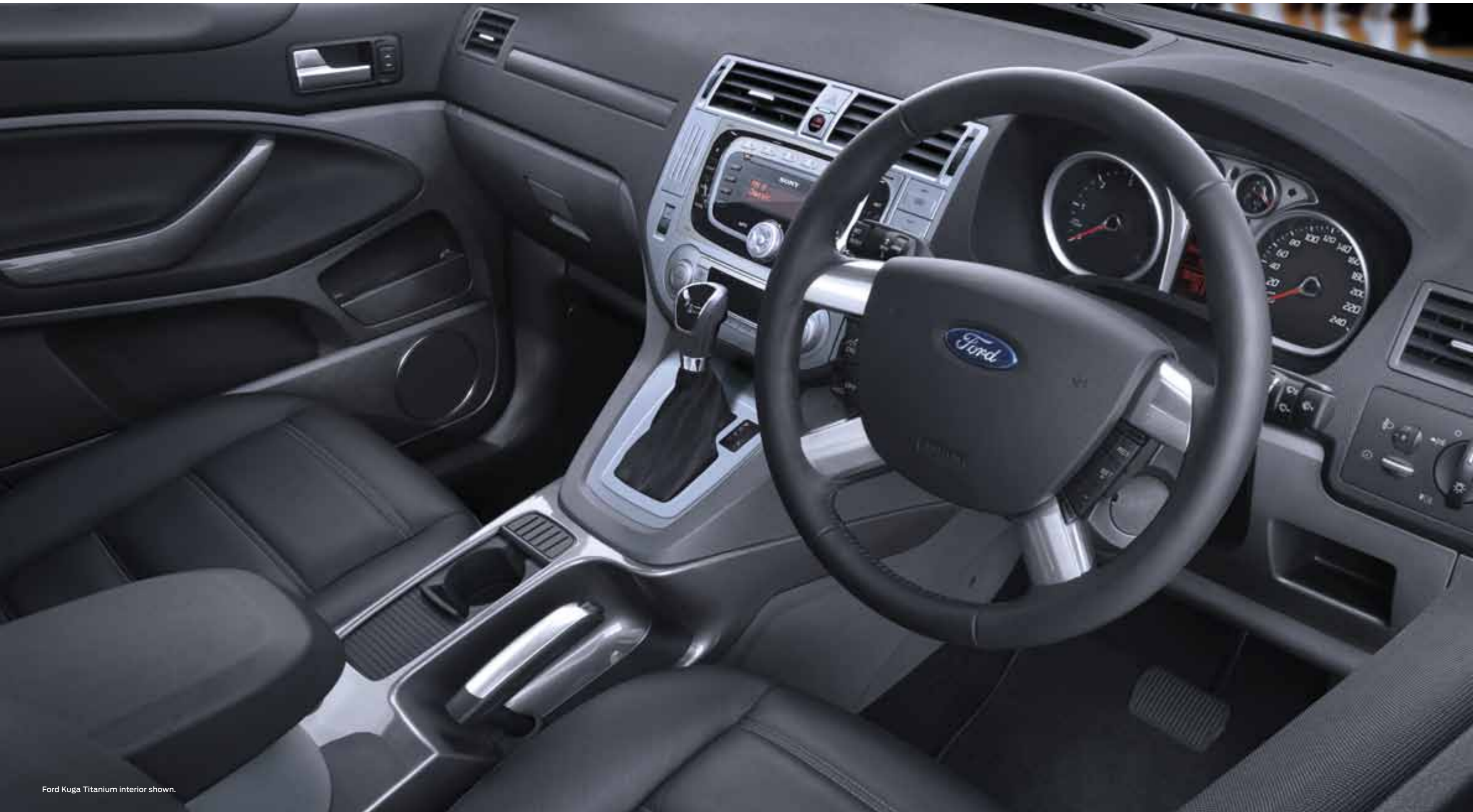
Ford Kuga Titanium interior shown.

Seamlessly combining functionality and style, the Ford Kuga's interior sports the clean lines of contemporary design matched with an impressive array of creature comforts.