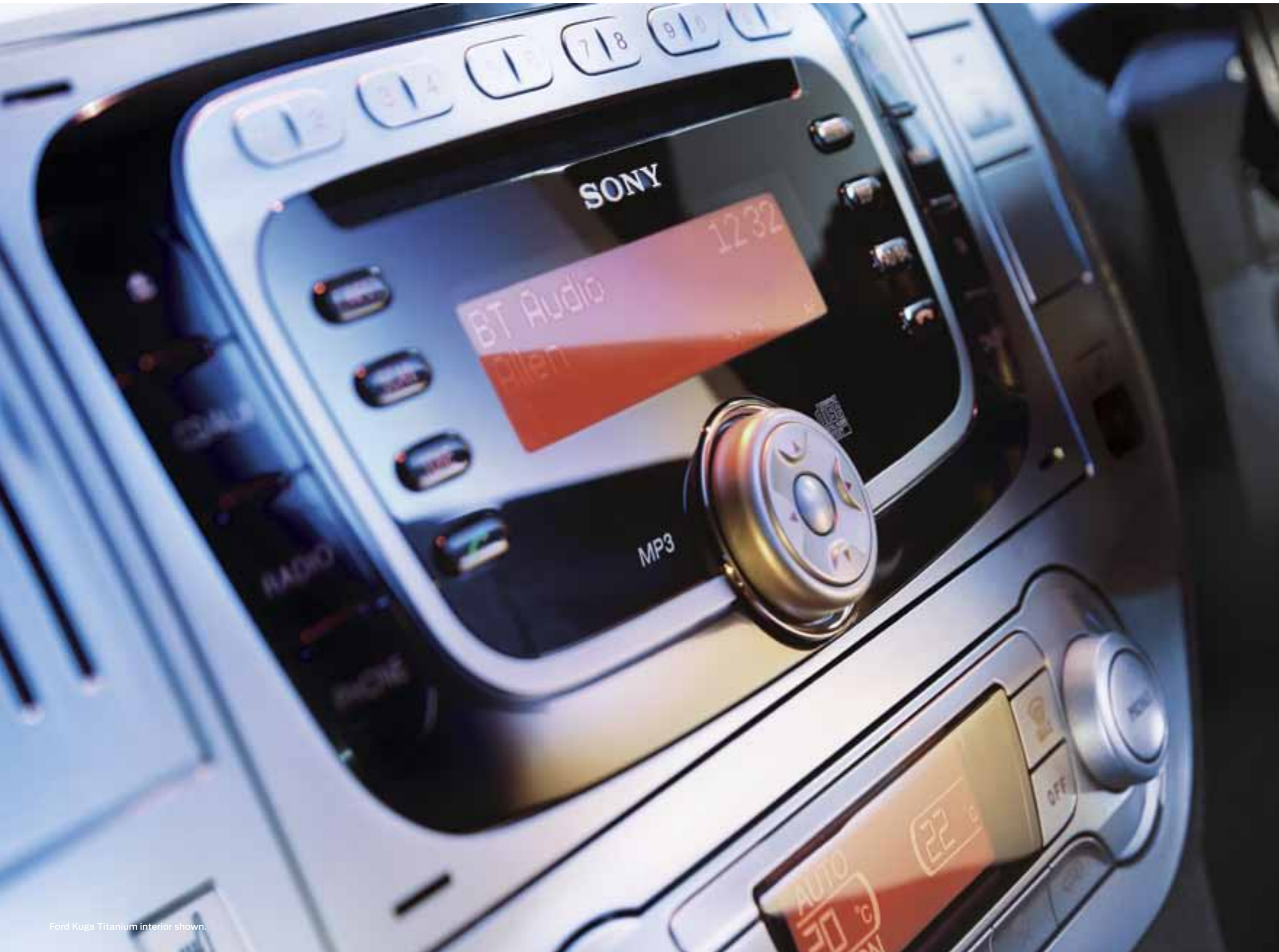
Ford Kuga Titanium interior shown.

With a range of intelligent technologies and smart features, the Ford Kuga puts comfort and control right at your fingertips.