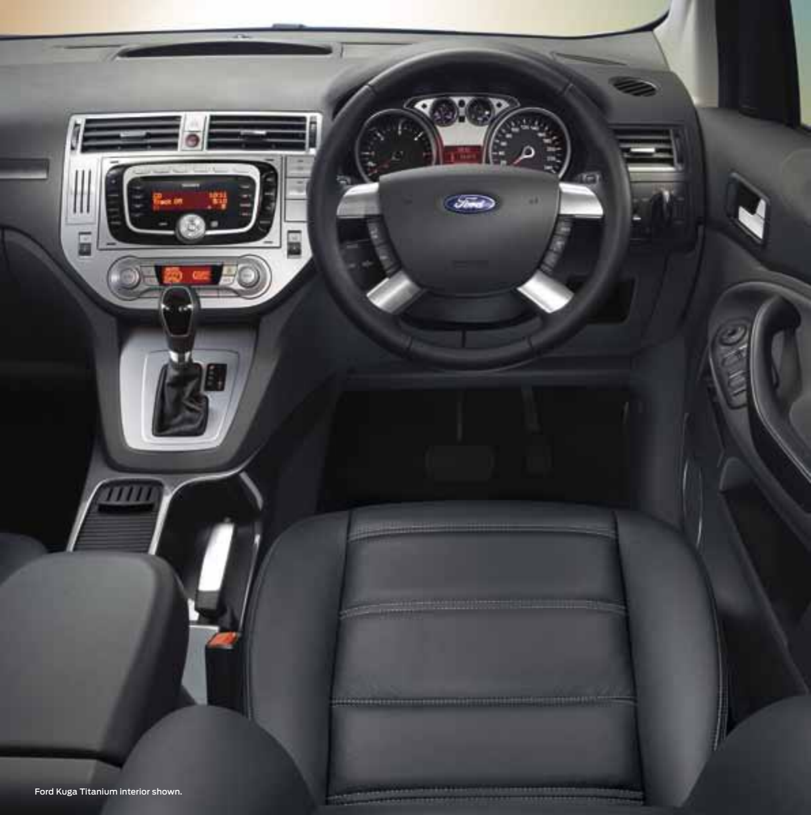
Ford Kuga Titanium interior shown.