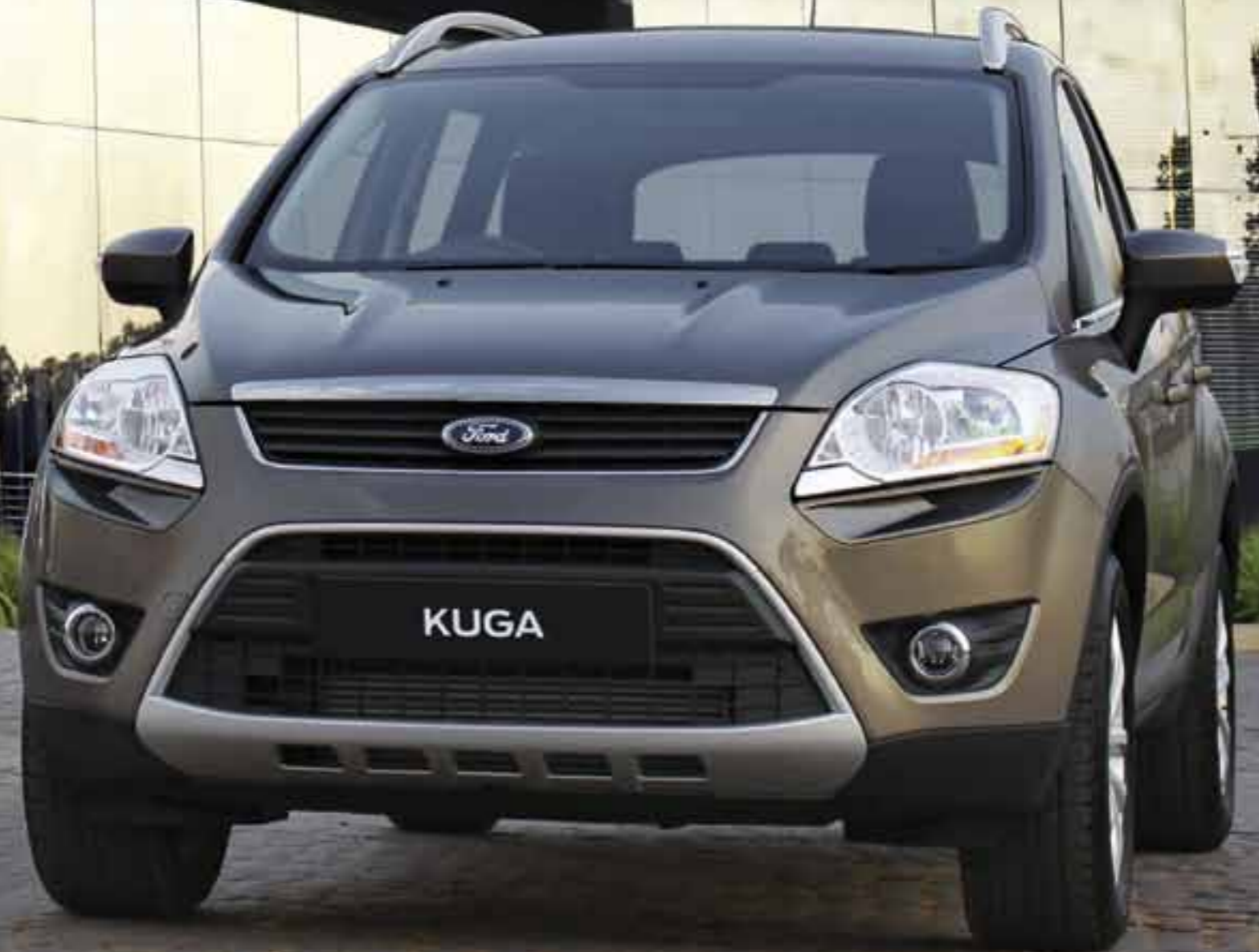
FORD KUGA TREND

Ford Kuga Titanium shown in Mars Red and Ford Kuga Trend shown in Lunar Sky.