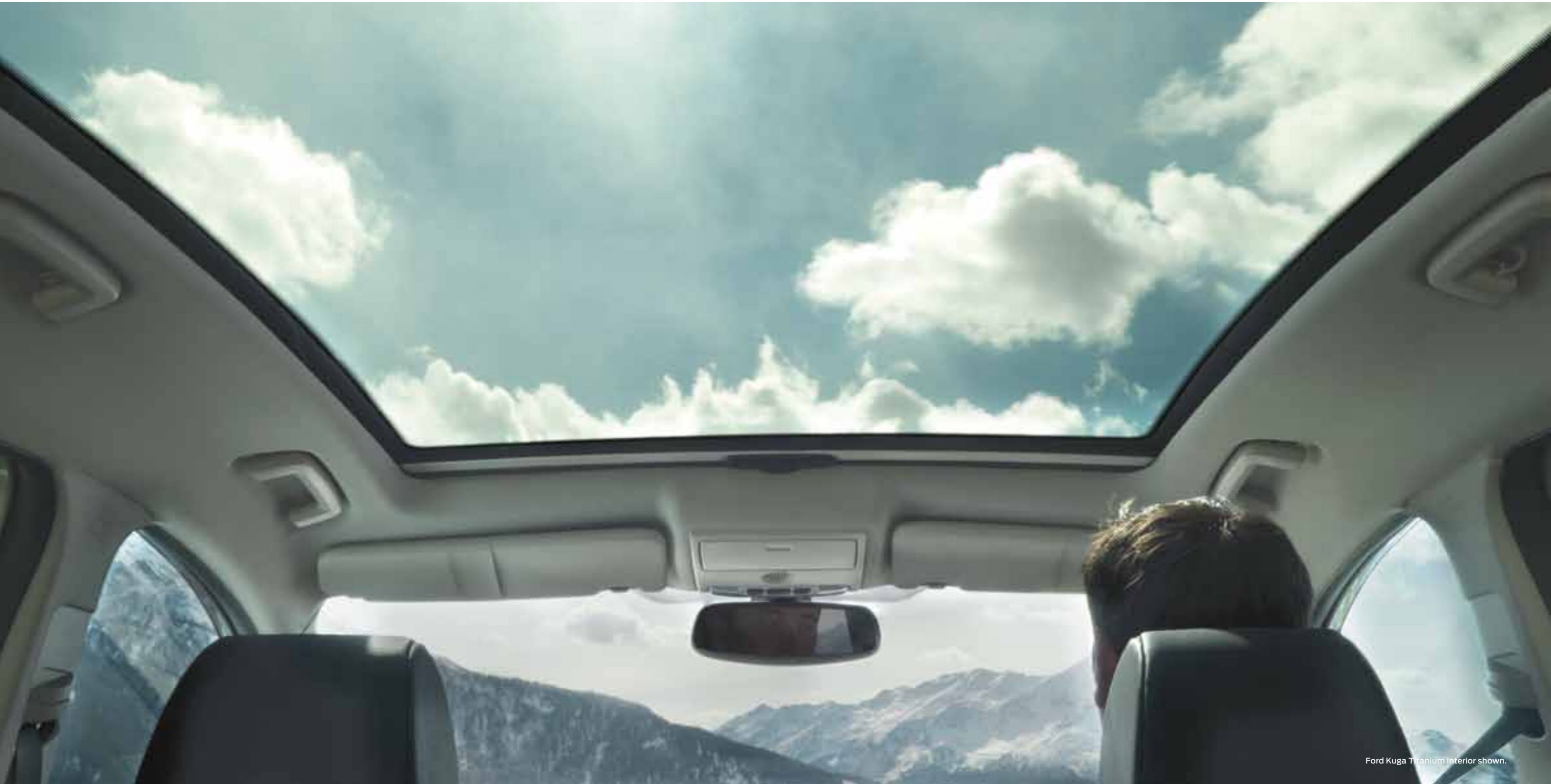
Ford Kuga Titanium interior shown.

From the bold and muscular body shape to the fixed glass panorama roof,* stylish form and features can be found in every aspect of the Ford Kuga.