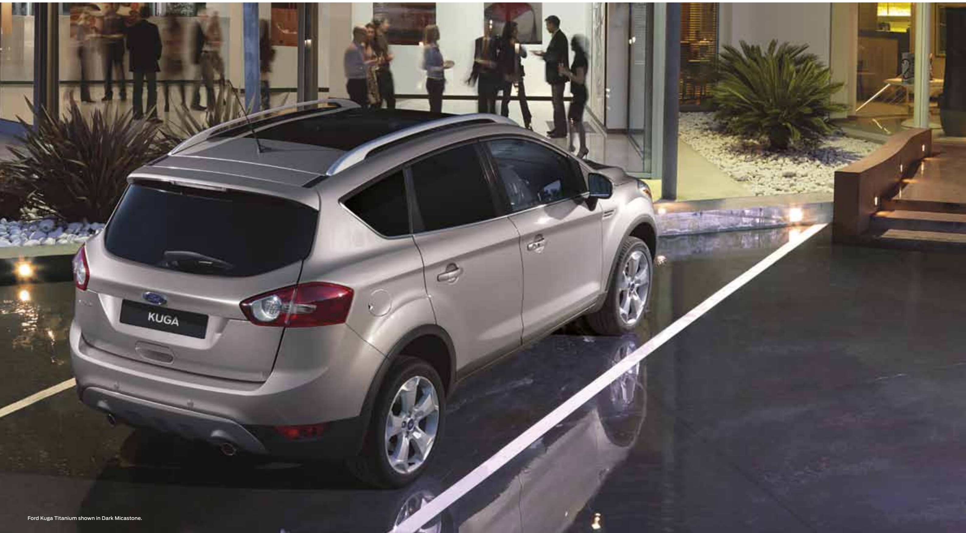
Ford Kuga Titanium shown in Dark Micastone.

Quality is evident wherever you look, with each and every component of the Ford Kuga designed and engineered to the highest possible standards.