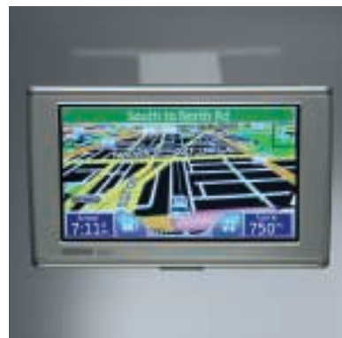
Garmin Nuvi 660 portable satellite navigation system. 1