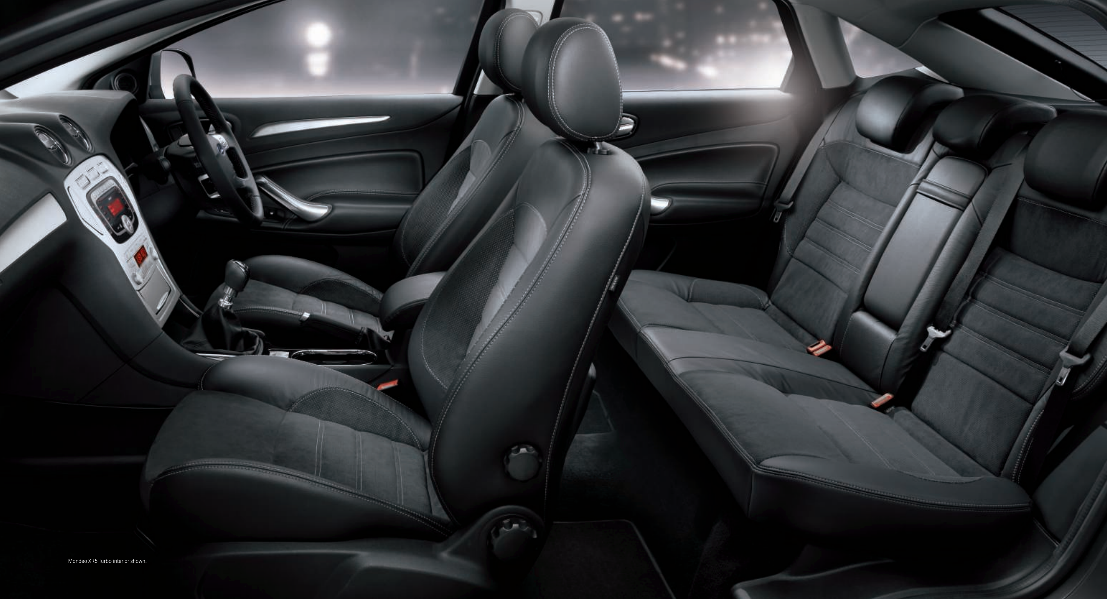
Mondeo XR5 Turbo interior shown.