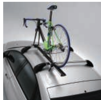
Carry bars and bike carrier (sold separately) for easy transport of bikes of all sizes.