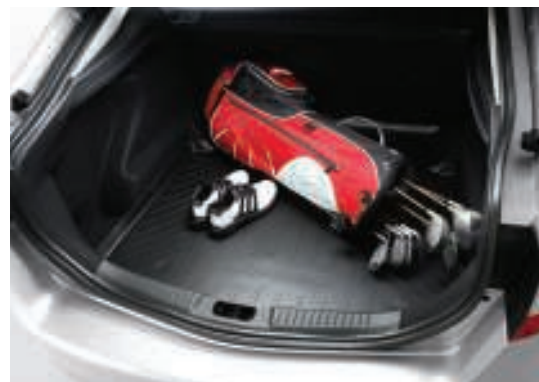
Waterproof boot liner helps keep boot area clean and dry.