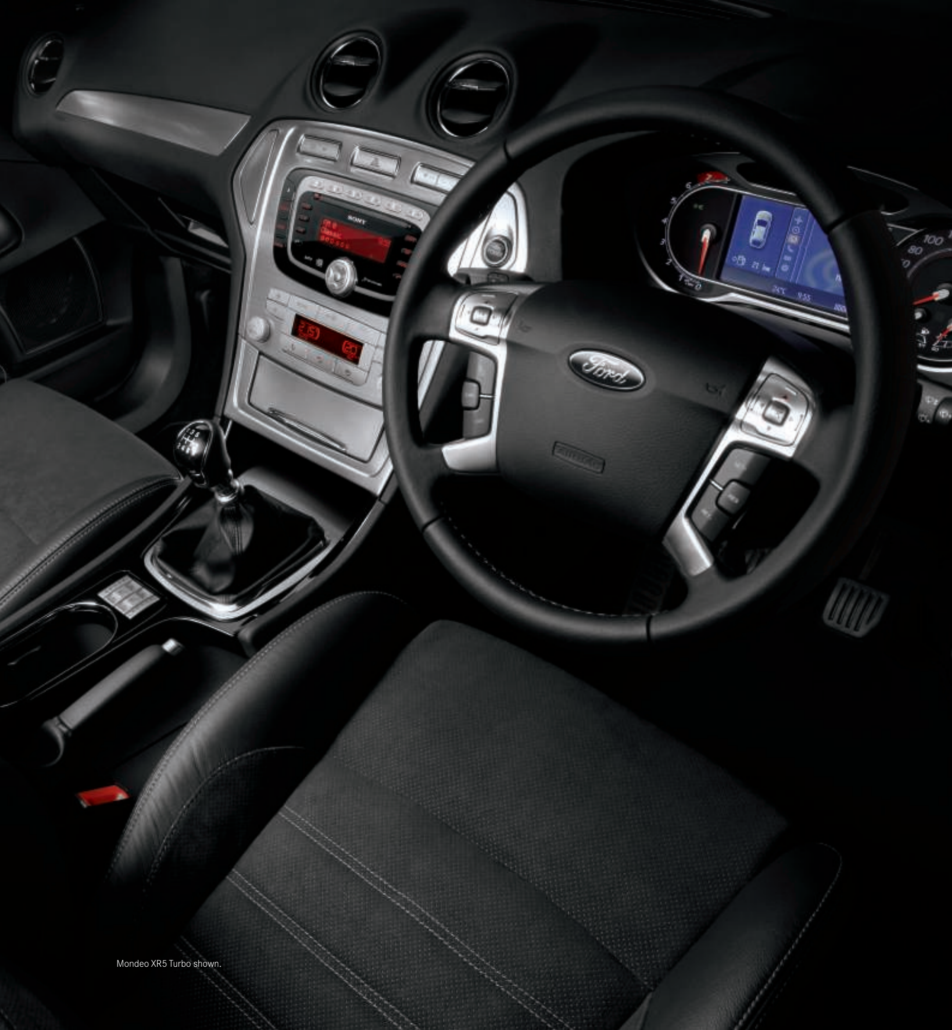
Mondeo XR5 Turbo shown.