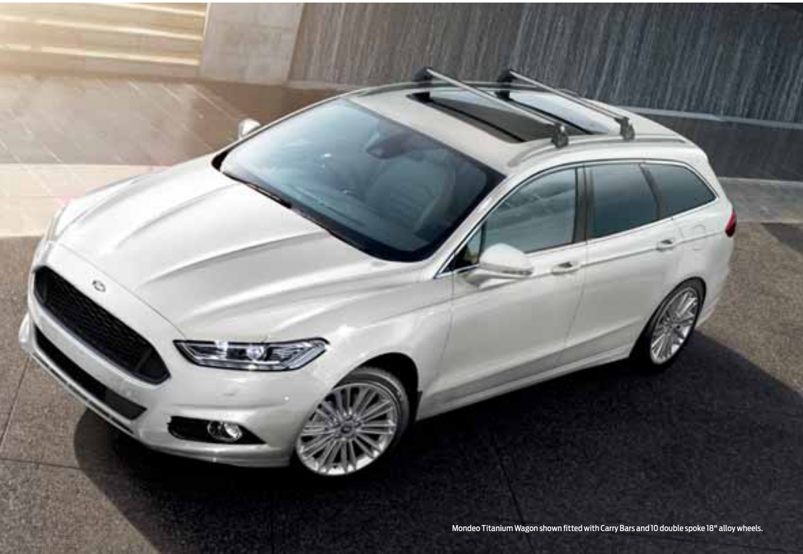
Mondeo Titanium Wagon shown fitted with Carry Bars and 10 double spoke 18" alloy wheels.

Like the hem of a perfectly tailored suit, your choice of vehicle accessories are the final details that make sure your Mondeo has everything it needs to suit you and your lifestyle.