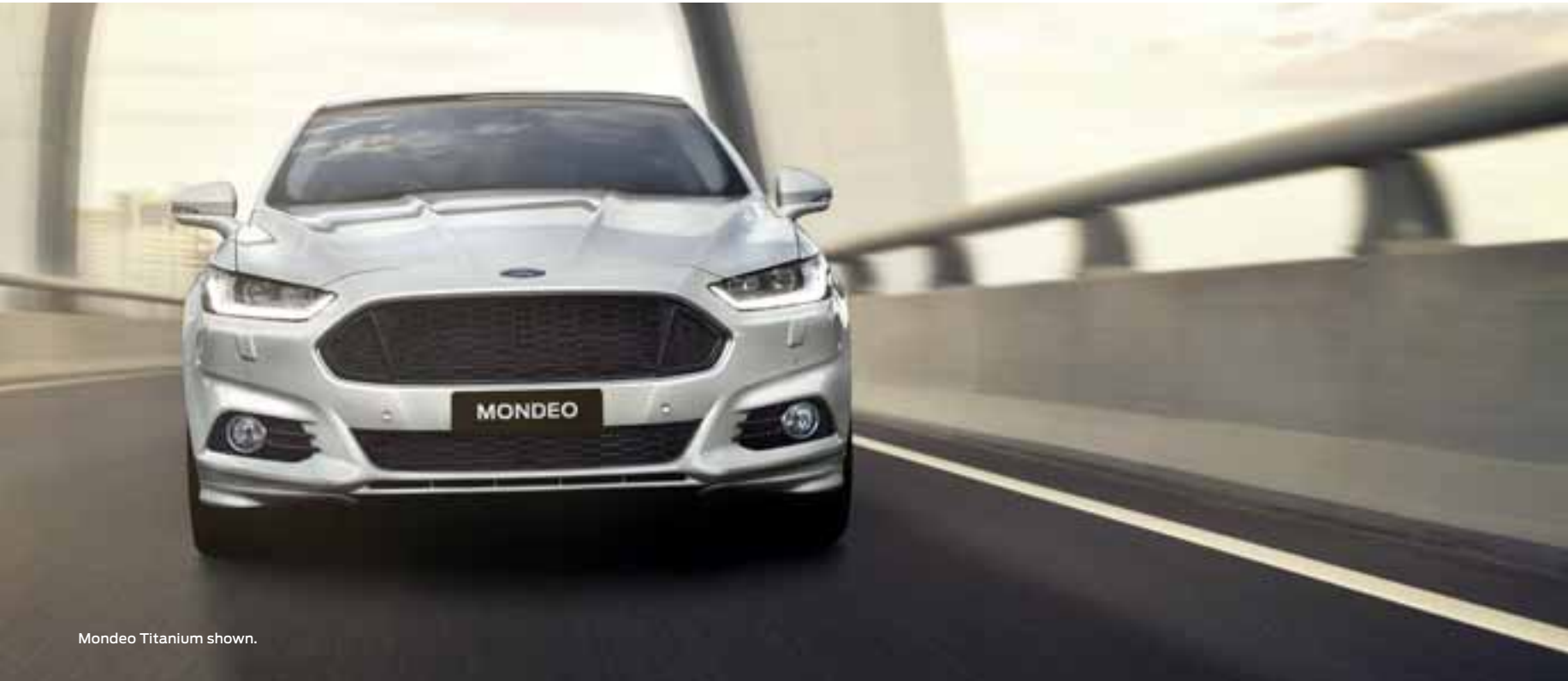
Mondeo Titanium shown.