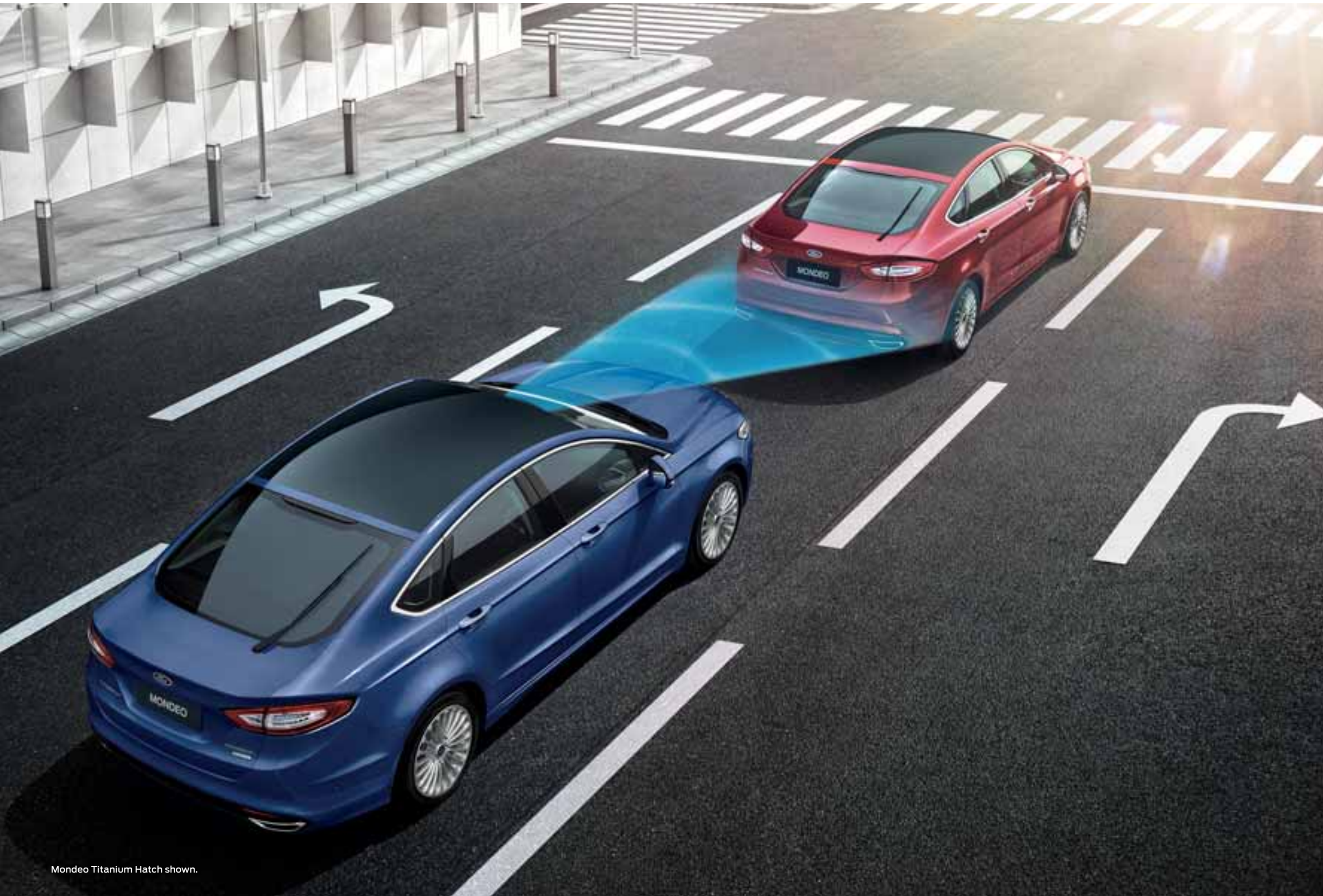
Mondeo Titanium Hatch shown.

Whether you're driving in stop-start traffic, reversing out of a tight spot, or just trying to keep your younger drivers safer – Ford's latest smart technologies have got you covered.