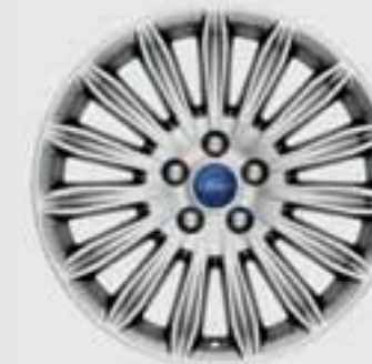
17" x 7.5" alloy wheel Hatch & Wagon

Seat Insert: Perforated Miko Charcoal Black Seat Bolster: Salerno Leather Charcoal Black