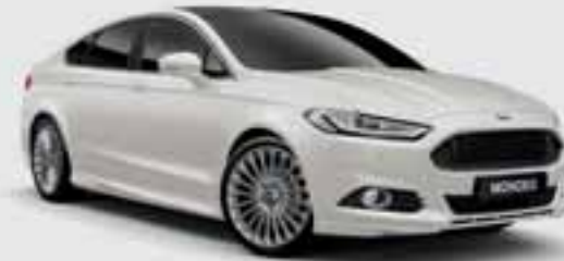
White Platinum Tri Coat*