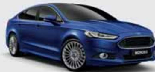
Deep Impact Blue*