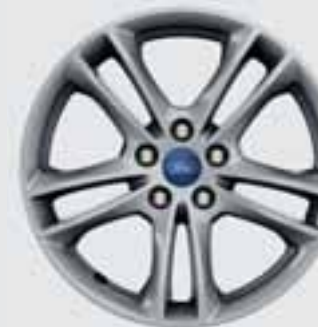
17" x 7.5" alloy wheel Wagon