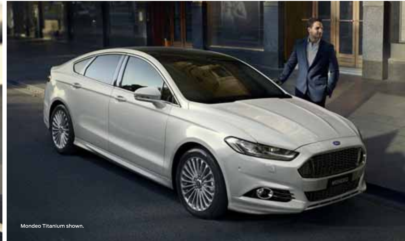
Mondeo Titanium shown.

Wherever you look inside the Mondeo's cabin, you'll find a perfect blend of form and function. Sleek, elegant interiors house the Mondeo's intuitive features, while the ergonomic styling makes sure they're always within reach.