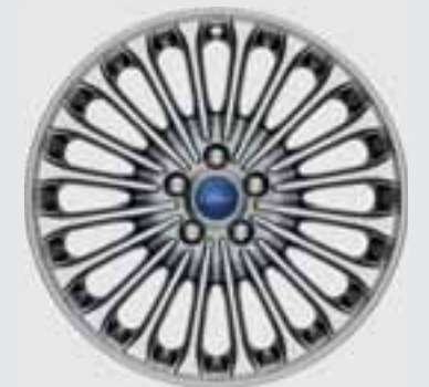
18" x 8.0" alloy wheel Hatch & Wagon

Seat Insert: Salerno Leather Charcoal Black Seat Bolster: Salerno Leather Charcoal Black