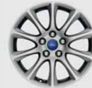
16" x 6.5" alloy wheel Hatch

Seat insert: Cloth Ebony Seat bolster: Cloth Ebony