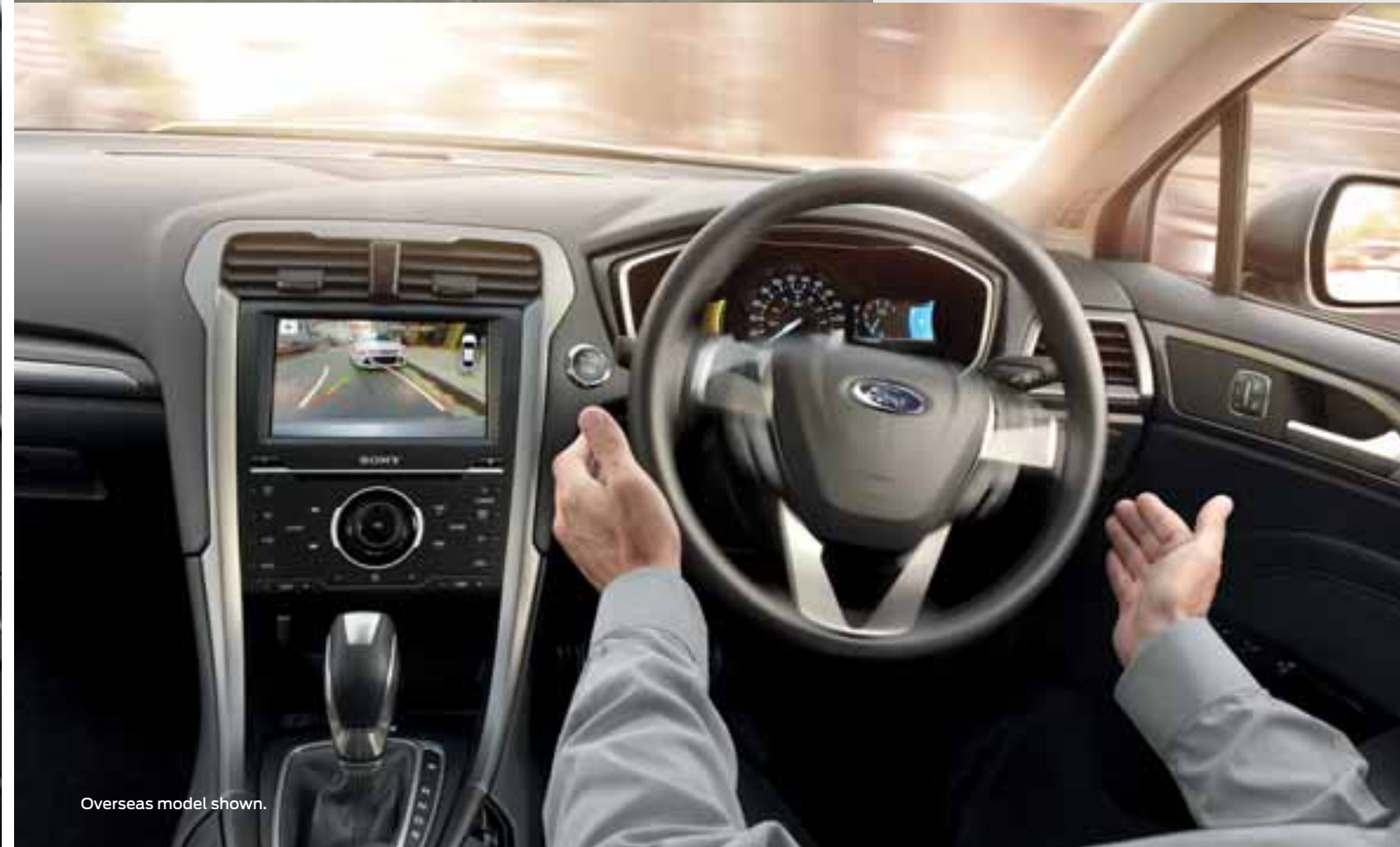
Overseas model shown.

Imagine. Perfect parallel parking without your hands ever touching the steering wheel. Enhanced Active Park Assist not only helps you find the right parking space, it steers you in. Perfectly. Put the car into gear. Take your hands off the wheel. All you have to do is work the accelerator and brake. It even steers you out of your park, hands-free.