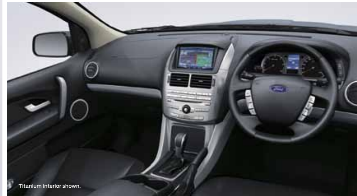
Titanium interior shown.

The show-stopping Territory features stylish projector headlights, high-tech LED front position lamps* and impressive 18" alloy wheels* with unique machined face finish. With detailing like this, you'll be the envy of your street.