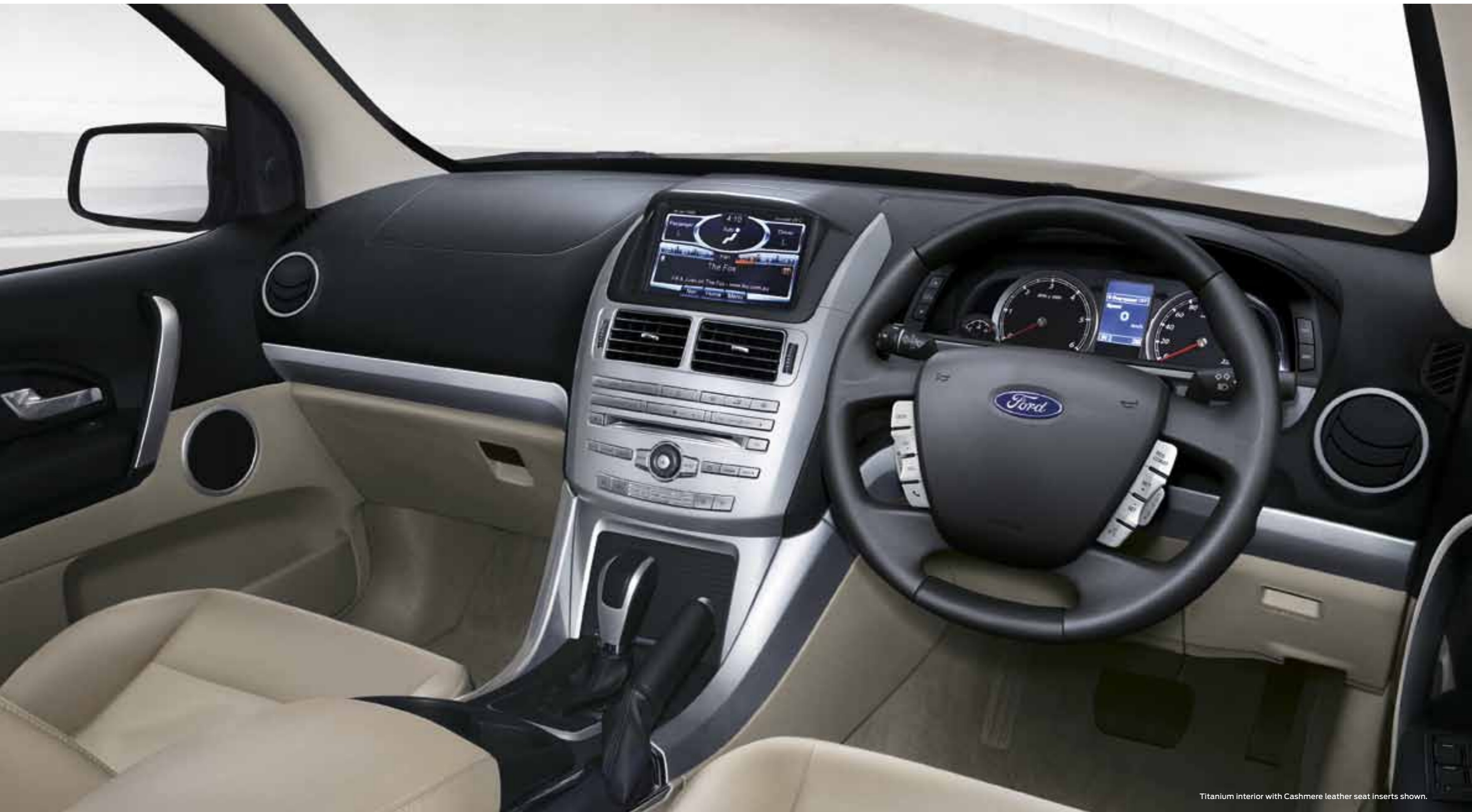
Titanium interior with Cashmere leather seat inserts shown.

What the exterior promises, the interior delivers. With a contemporary interior design and all the latest creature comforts and technologies on board, you can enjoy the Territory's seamless combination of style and functionality.