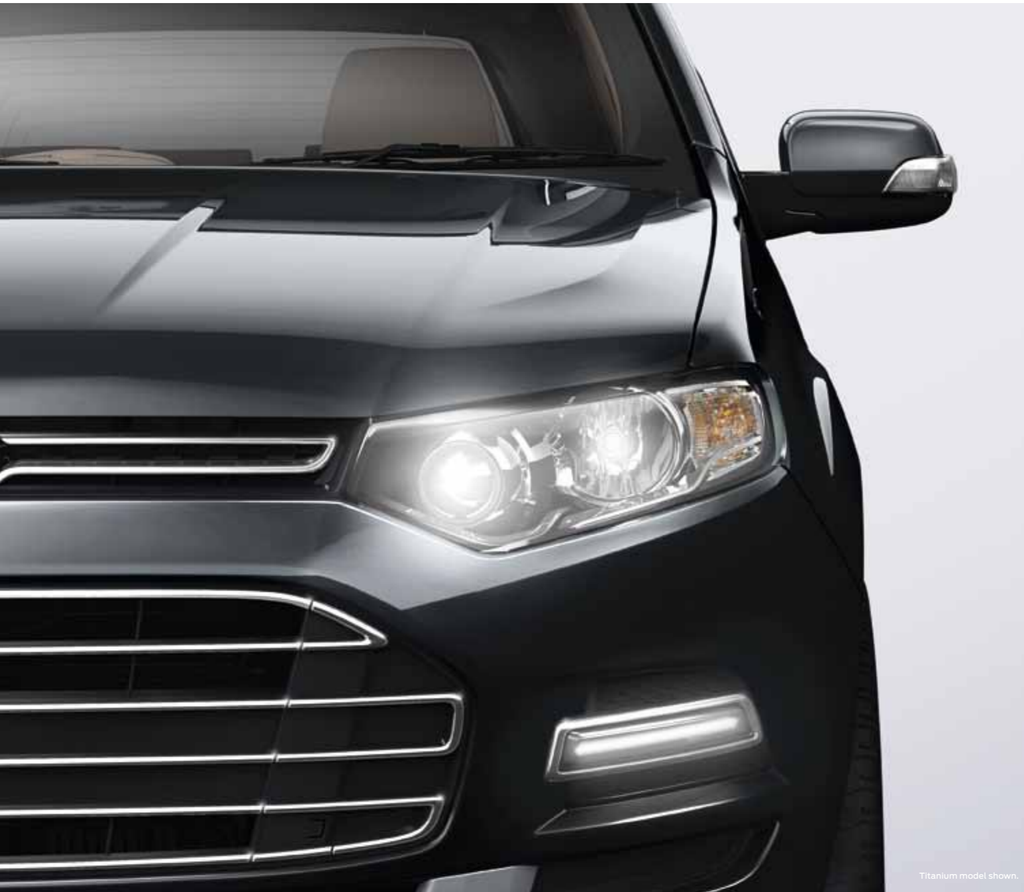
Titanium model shown.

Wherever it goes, the Territory steals the show. Its eye-catching design features a prestigious front grille and dynamic styling, giving the vehicle unique energy on the road and a real presence in the driveway. So, you're sure to make a bold statement every time you get behind the wheel.