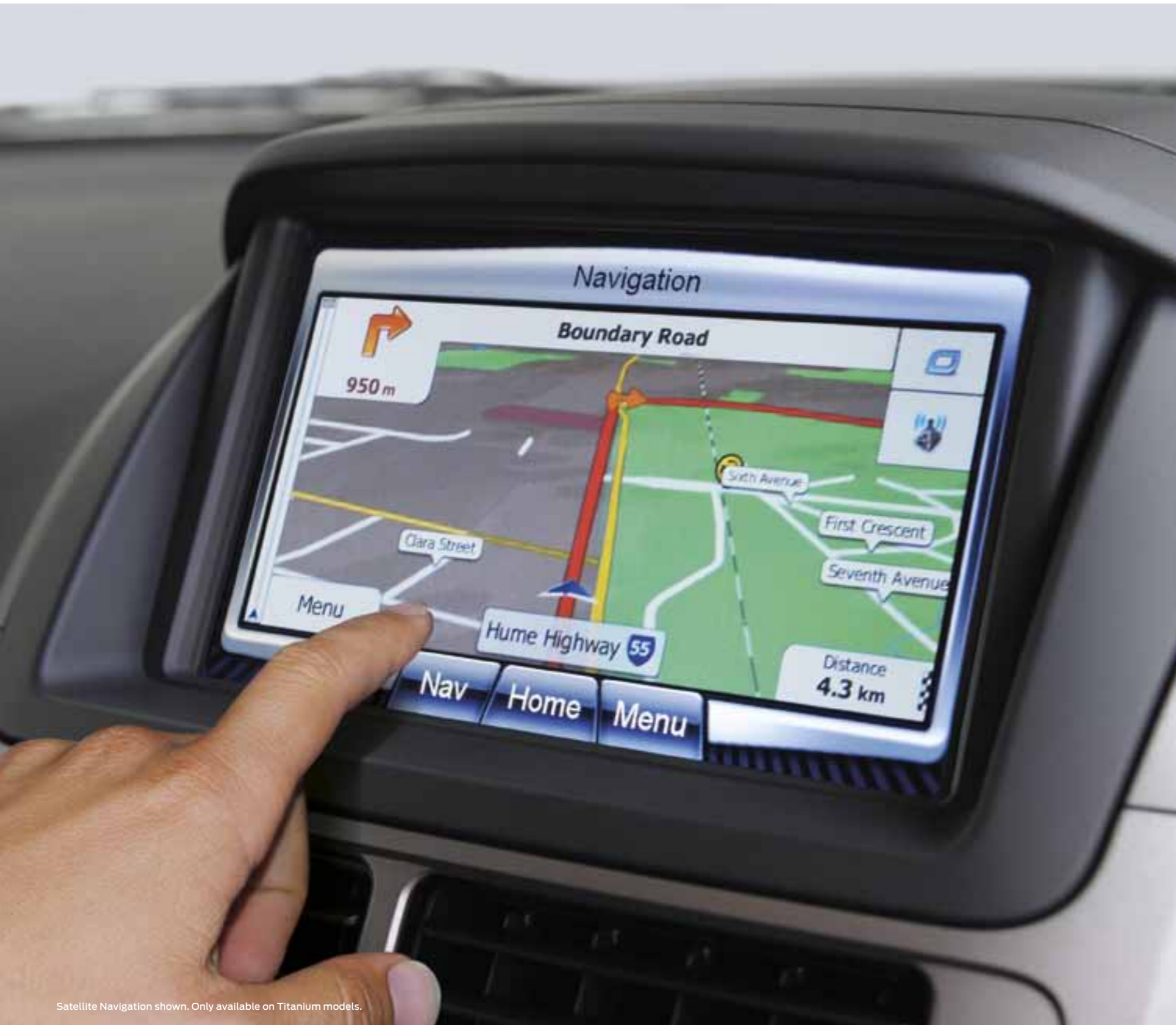
Satellite Navigation shown. Only available on Titanium models.

Boasting a whole range of innovative features, the Territory is smarter than ever. It's intuitively designed to make your life easier and more enjoyable, and once you try it you won't want to drive anything else.