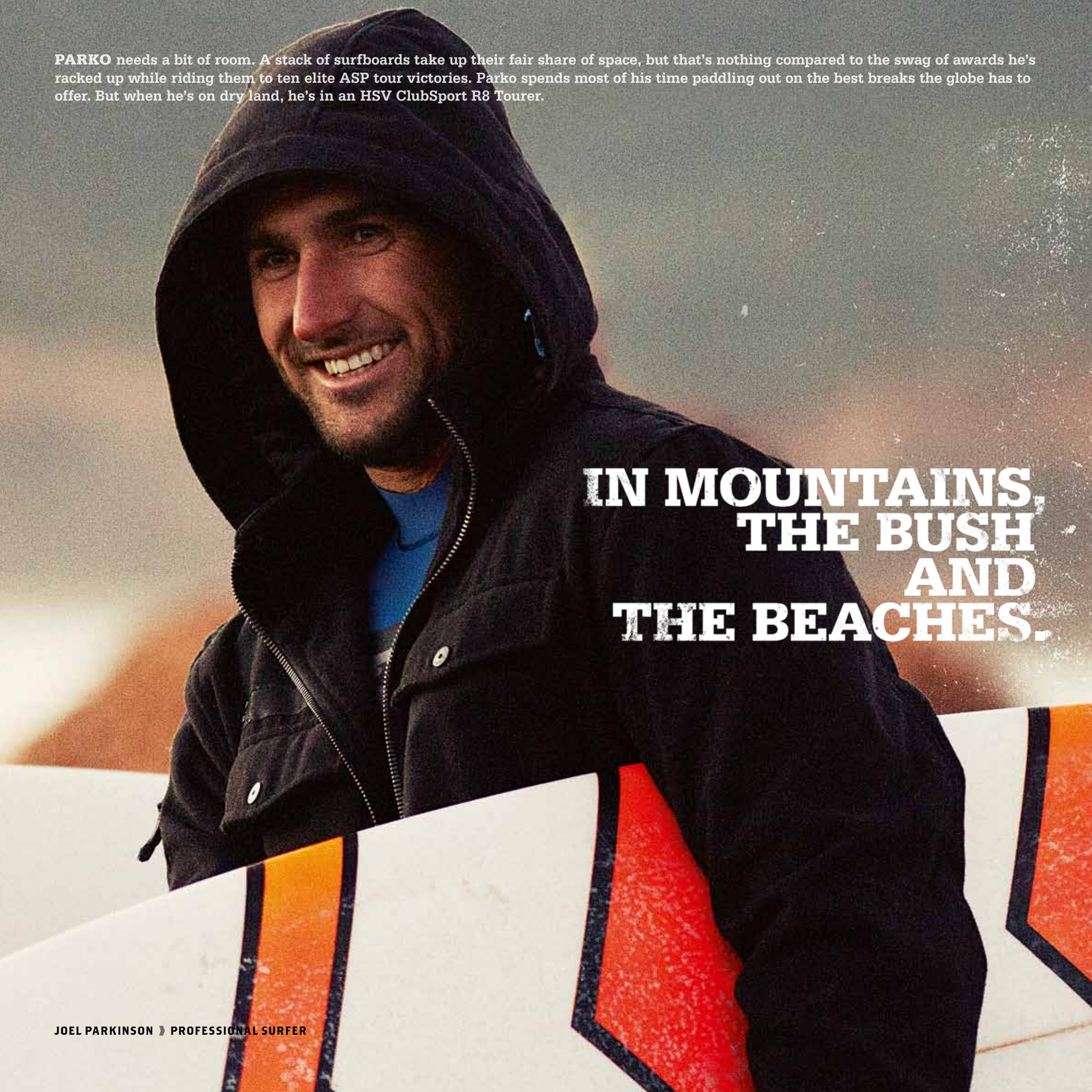
JOEL PARKINSON » PROFESSIONAL SURFER