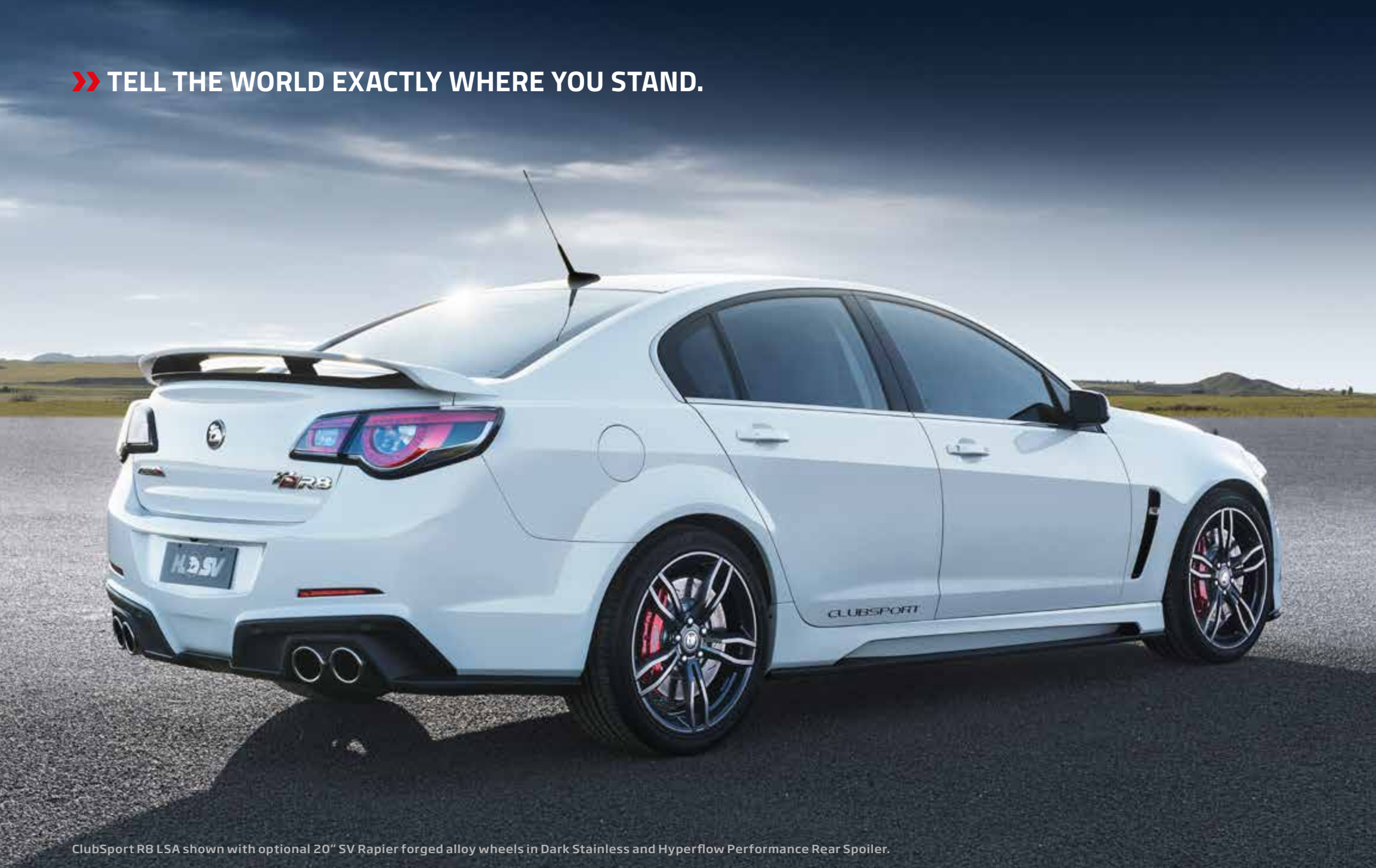
ClubSport R8 LSA shown with optional 20" SV Rapier forged alloy wheels in Dark Stainless and Hyperflow Performance Rear Spoiler.

»» TELL THE WORLD EXACTLY WHERE YOU STAND.