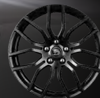
20" SV PERFORMANCE FORGED ALLOY WHEEL IN SATIN GRAPHITE (OPTIONAL ON ALL MODELS)