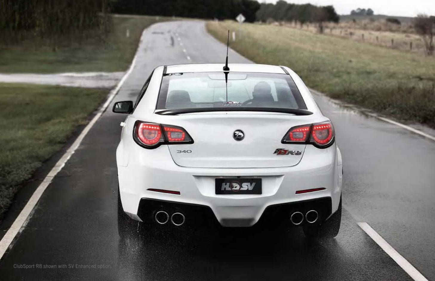
ClubSport R8 shown with SV Enhanced option.