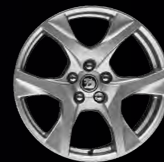
20" CAST FLOW-FORM ALLOY WHEEL WITH SILVER FINISH (STANDARD ON CLUBSPORT)