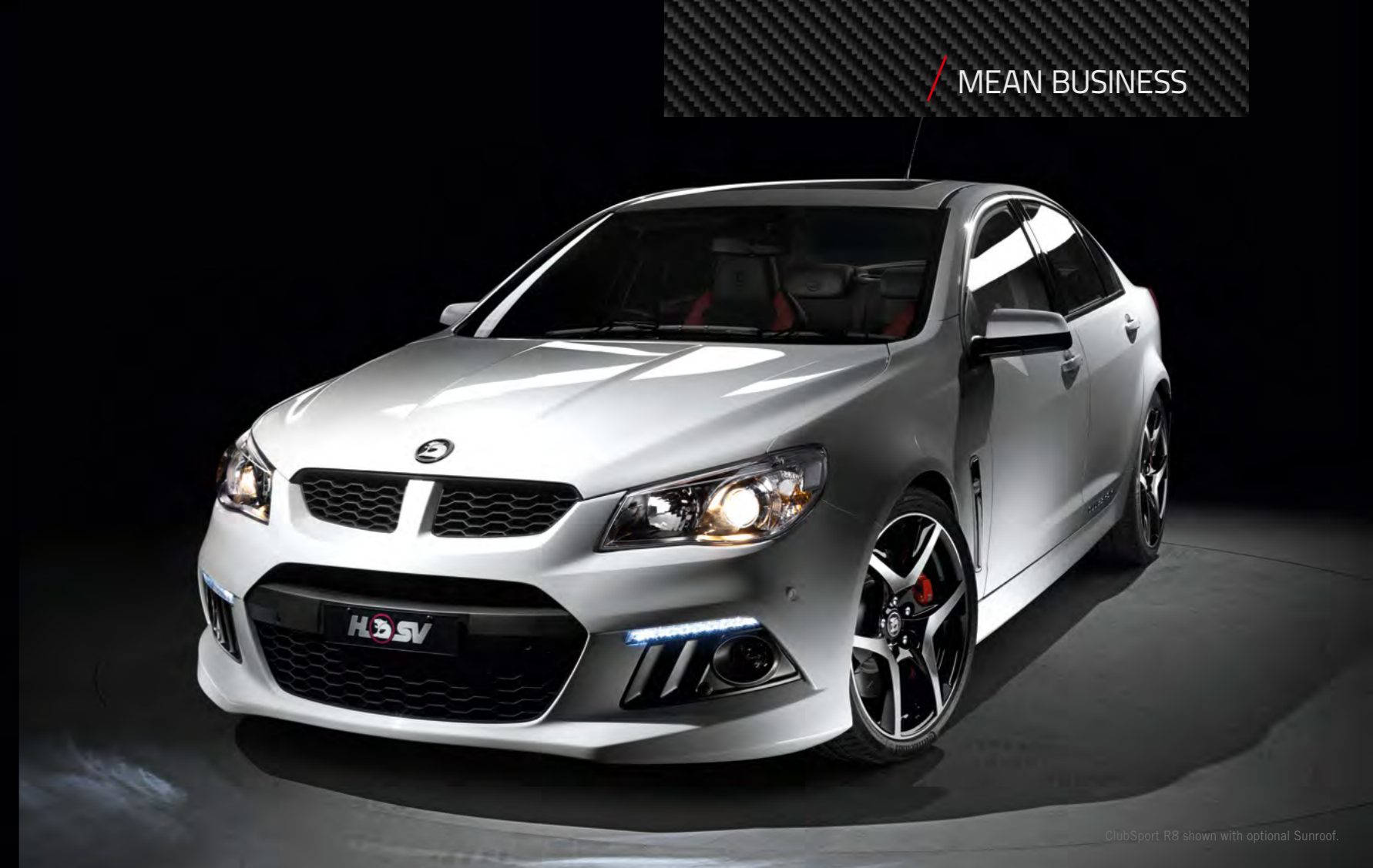
ClubSport R8 shown with optional Sunroof.