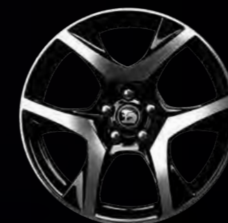
20" CAST FLOW-FORM ALLOY WHEEL WITH MACHINED FACE AND GLOSS BLACK ACCENTS (CLUBSPORT R8 AND CLUBSPORT R8 TOURER)