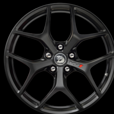
20" SV PANORAMA FORGED ALLOY WHEEL FINISHED IN MATTE BLACK GTSR W1