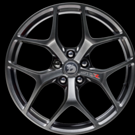
20" SV PANORAMA FORGED ALLOY WHEEL FINISHED IN HYPER DARK STAINLESS GTSR AND GTSR MALOO