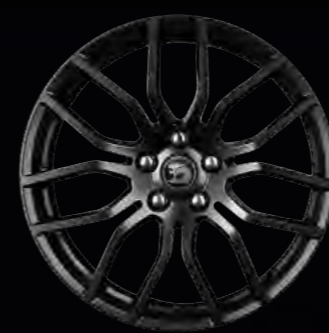
20" SV PERFORMANCE FORGED ALLOY WHEEL IN SATIN GRAPHITE (OPTIONAL)