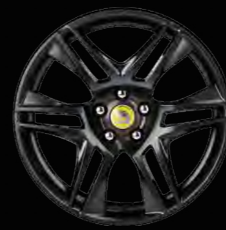
20" BLADE FORGED ALLOY WHEEL IN SATIN GRAPHITE