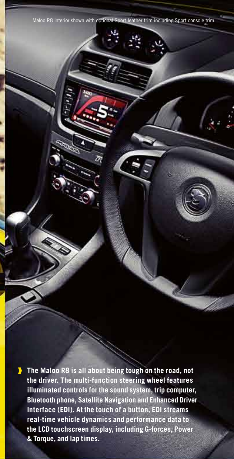
Maloo R8 interior shown with optional Sport leather trim including Sport console trim.

▶ The Maloo R8 is all about being tough on the road, not the driver. The multi-function steering wheel features illuminated controls for the sound system, trip computer, Bluetooth phone, Satellite Navigation and Enhanced Driver Interface (EDI). At the touch of a button, EDI streams real-time vehicle dynamics and performance data to the LCD touchscreen display, including G-forces, Power & Torque, and lap times.