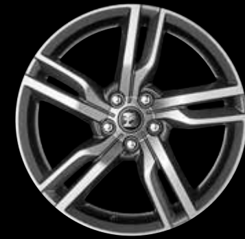
20" ALLOY WHEEL WITH MACHINED FACE AND MAGNETIC GREY ACCENTS