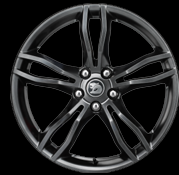
20" SV RAPIER FORGED ALLOY WHEEL IN DARK STAINLESS (OPTIONAL)