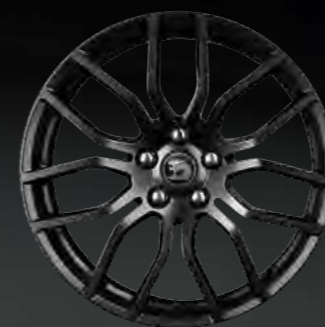
20" SV PERFORMANCE FORGED ALLOY WHEEL IN SATIN GRAPHITE (OPTIONAL)