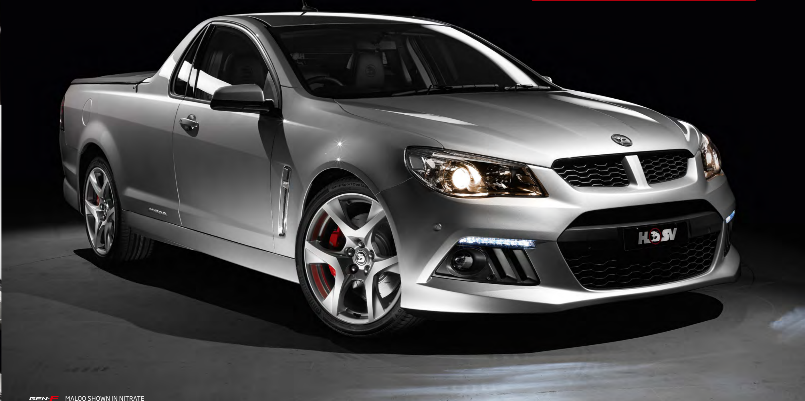
GEN-F MALOO SHOWN IN NITRATE

NEW AP VENTILATED DISCS , with 4-piston calipers forged from 6061 T6 aluminium, provide a superior strength-to-weight ratio and outstanding braking performance.