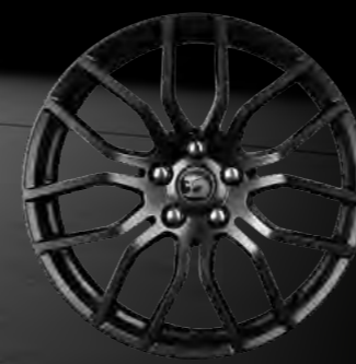
20" SV PERFORMANCE FORGED ALLOY WHEEL IN SATIN GRAPHITE (OPTIONAL)