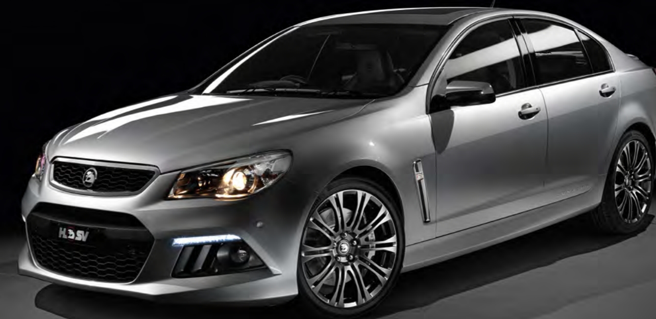
Senator Signature shown with optional Sunroof and 6-speed automatic transmission with Active Select.

GENERATION 3 MAGNETIC RIDE CONTROL is a semi-active suspension system that allows damping to be adjusted in the blink of an eye to deliver greater body control, sharper handling and superior ride quality.