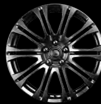
20" FORGED ALLOY WHEEL IN DARK STAINLESS