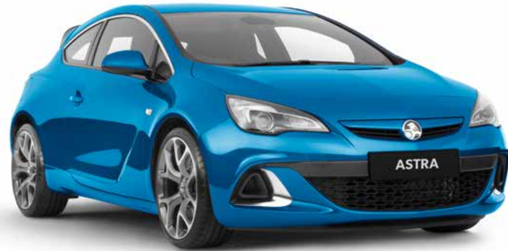
Astra VXR in Arden Blue