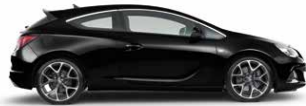
Astra VXR in Carbon Flash Black