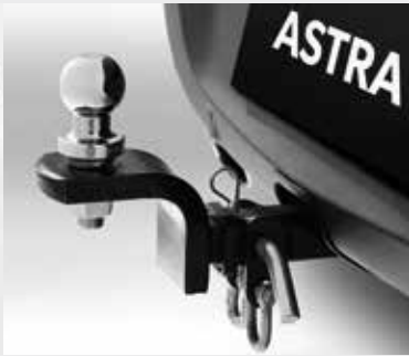
Tow package (Available Q3 2015)