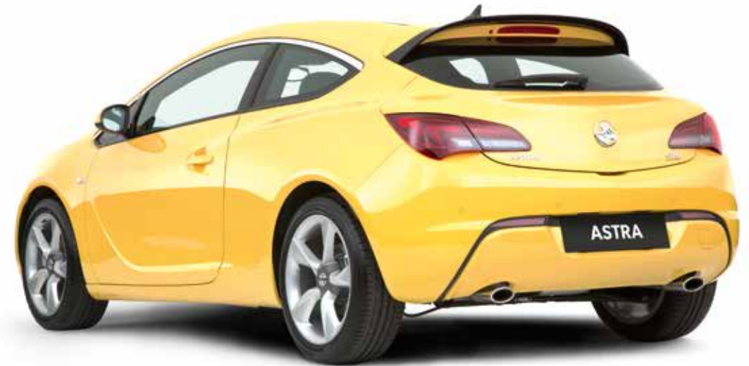
GTC Sport in Sunny Melon with manual transmission shown