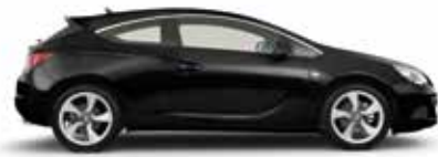
Carbon Flash Black*