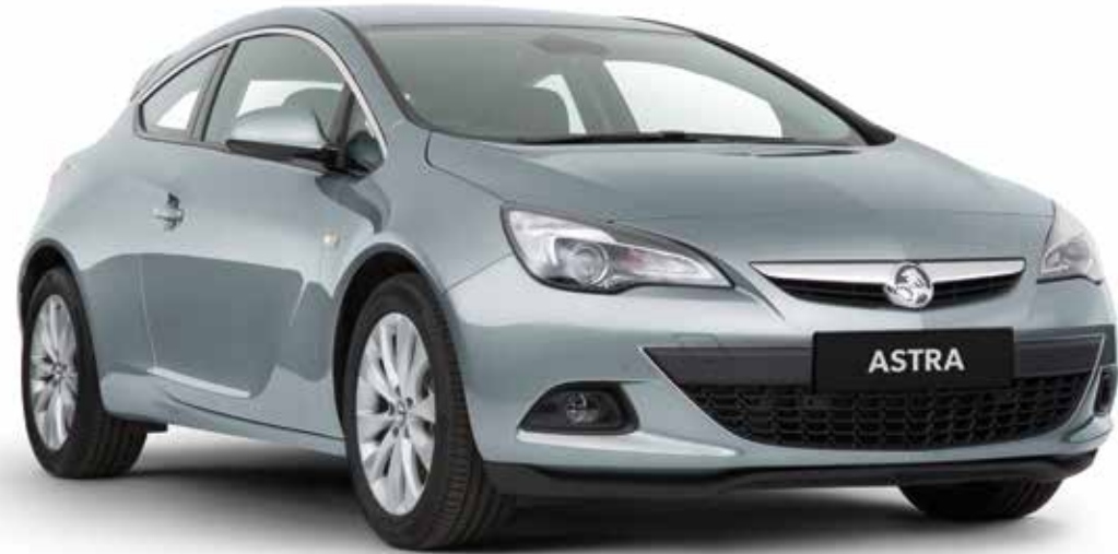
Astra GTC in Silver Lake with auto transmission shown