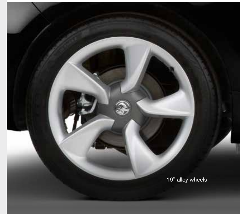
19" alloy wheels