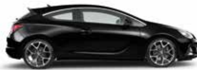
Carbon Flash Black*