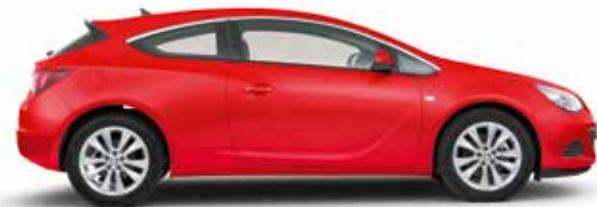
Astra GTC in Power Red with auto transmission shown