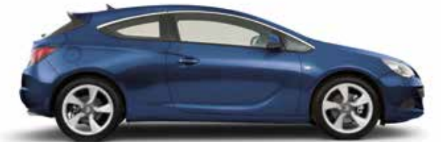
GTC Sport in Buzz Blue with manual transmission shown

The GTC Sport takes the excitement level up another notch. With extra flourishes such as 19-inch alloys, leather appointed trim, heated front sports seats and alloy sports pedals, it more than lives up to its name.