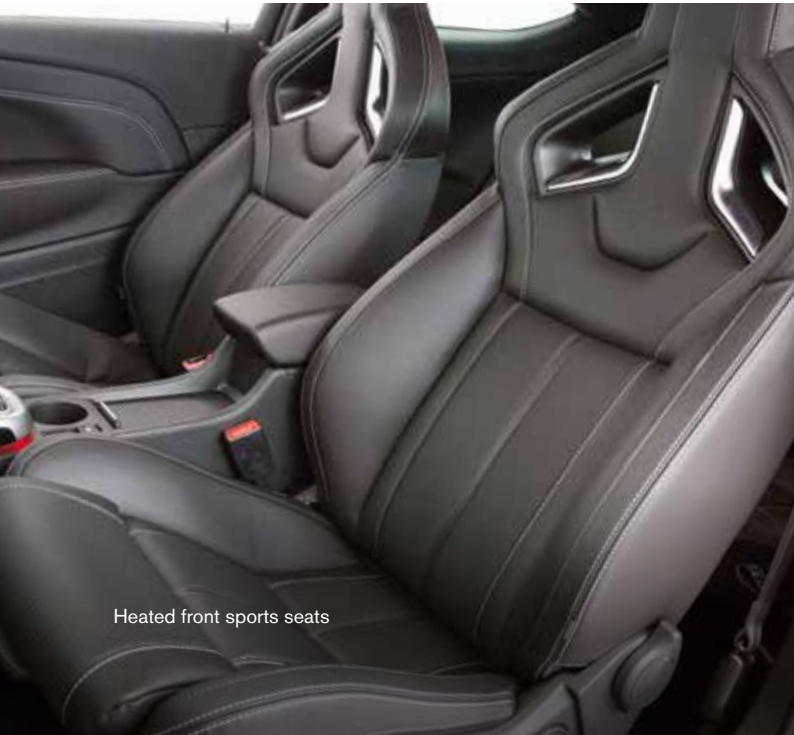
Heated front sports seats

Be prepared to be totally blown away. The absolute pinnacle of high performance engineering in the compact 3-door class, this is Holden's finest and hottest hatch ever.