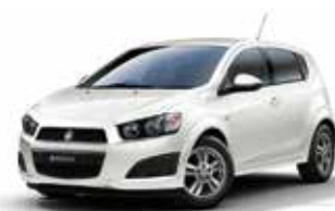
Snowflake White Pearl*