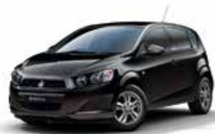
Carbon Flash Black*