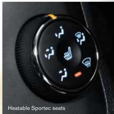
Heatable Sportec seats

Holden MyLink offers new levels of convenience and flexibility by bringing smartphone capabilities into your vehicle.