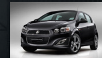
CARBON FLASH BLACK*