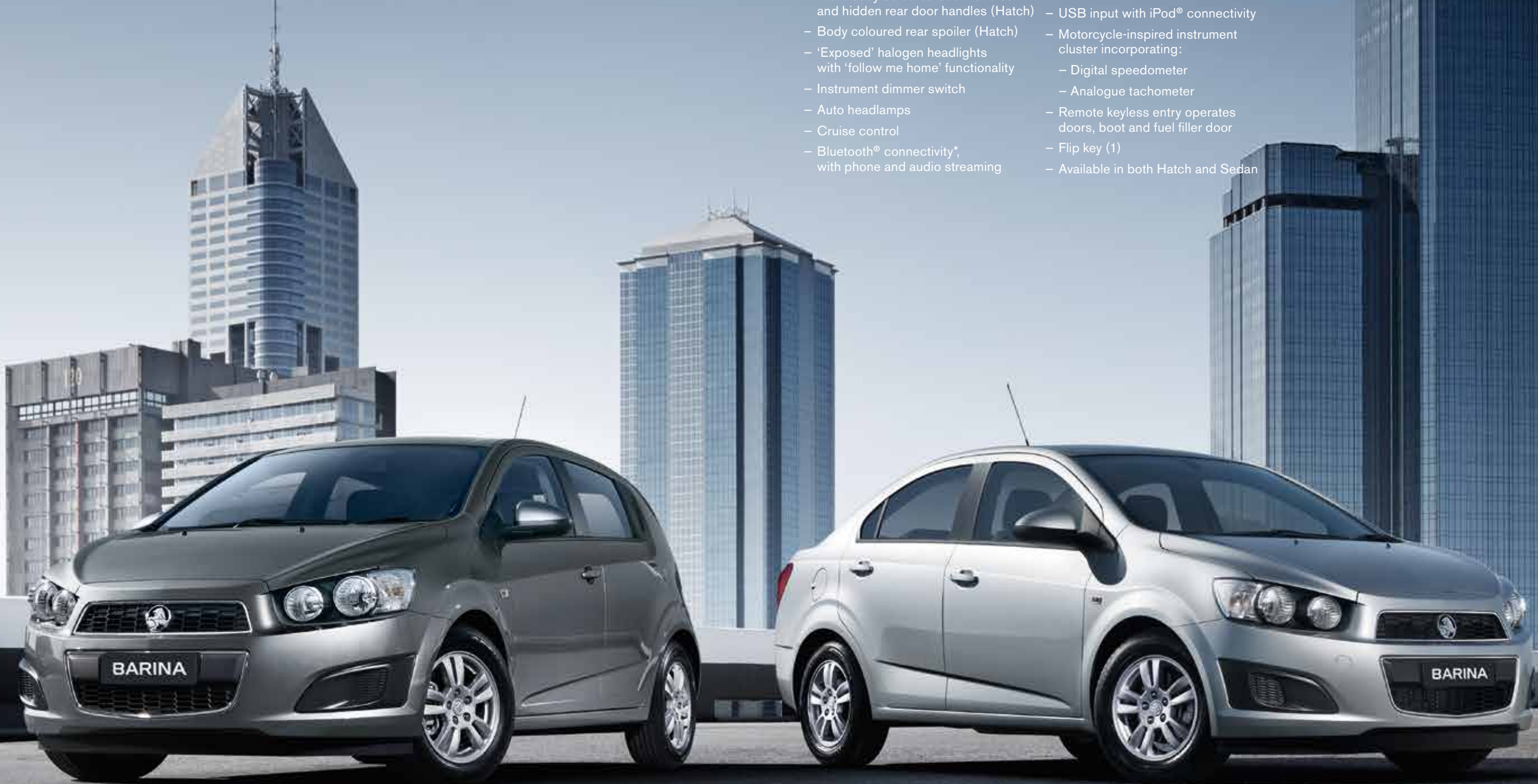
Barina CD Hatch in Satin Steel