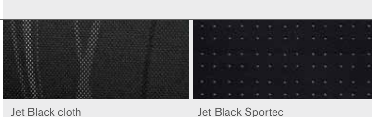
Jet Black cloth

* Prestige paints are available at an additional cost