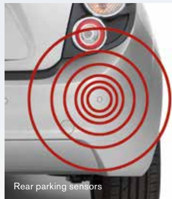
Rear parking sensors

The CDX eases into and out of tight parking spaces, thanks to its rear parking sensors. Audible warnings indicate the proximity of potential obstacles.