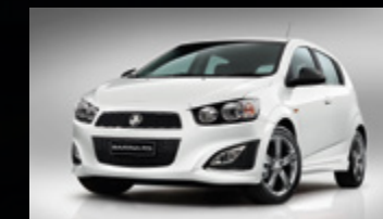
SNOWFLAKE WHITE PEARL*