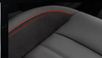
LEATHER & SUEDE APPOINTED SPORTS SEAT TRIM

Variations between colours shown and actual paint colours/interior trim colours may occur due to the printing process