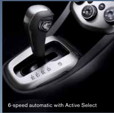
6-speed automatic with Active Select

The 6-speed automatic transmission comes with Active Select, which allows you to manually switch gears for a more 'hands on' driving experience