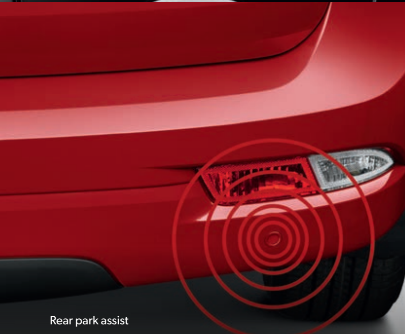
Rear park assist