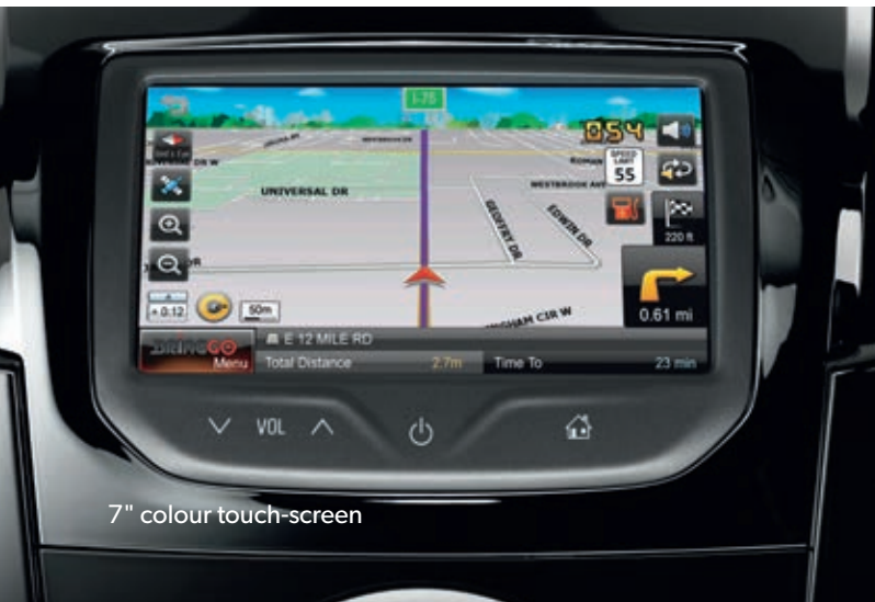
7" colour touch-screen

From the signature 'power dome' hood to the sleek rear styling, the streamlined body design creates an agile sporty look. The dynamic road presence signals that this is one serious 4x4. Loaded with features, the Colorado 7 LT comfortably takes everything in its stride.