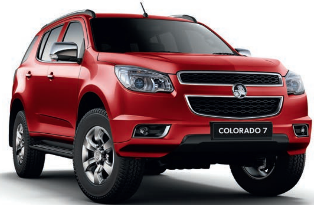
Colorado 7 LTZ in Sizzle