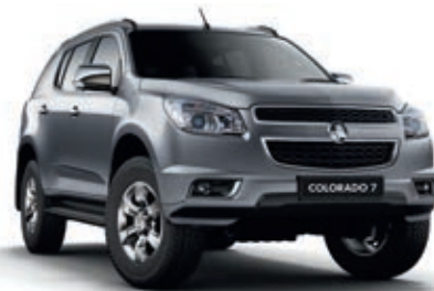
Satin Steel Grey*