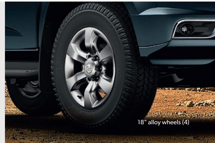
18" alloy wheels (4)