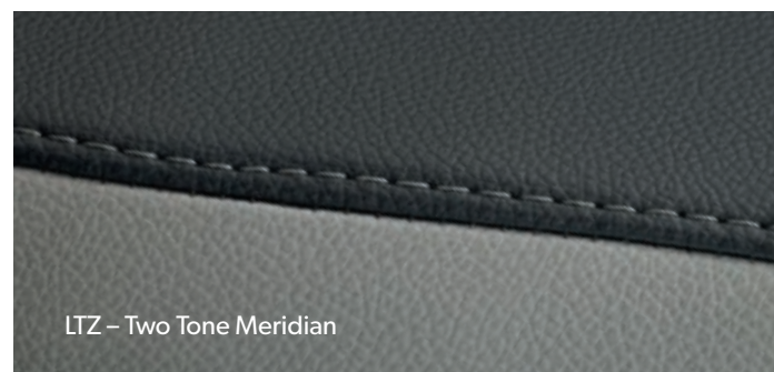
LTZ – Two Tone Meridian