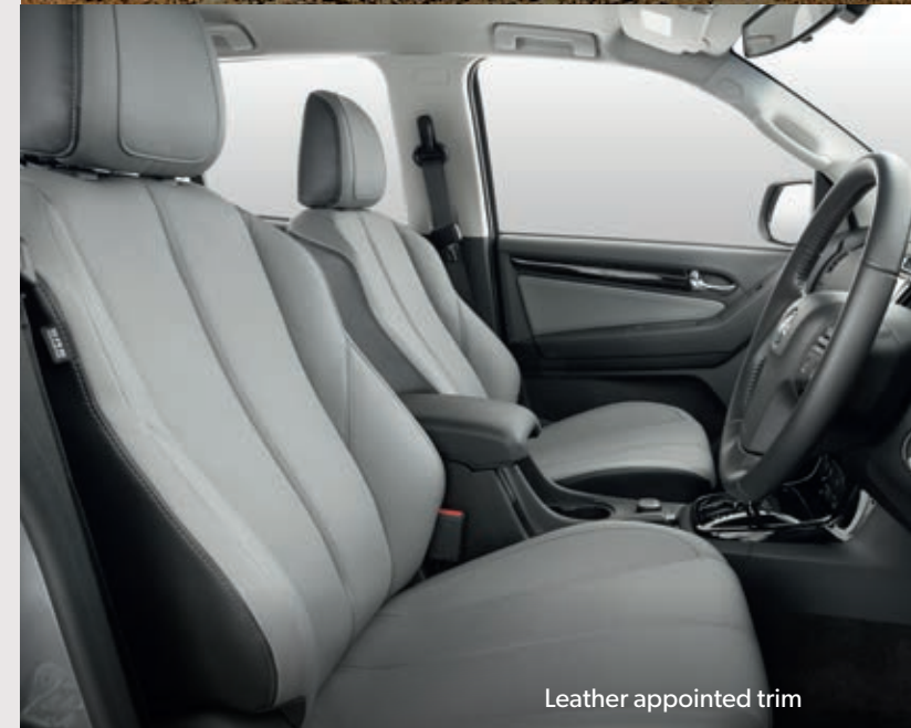
Leather appointed trim