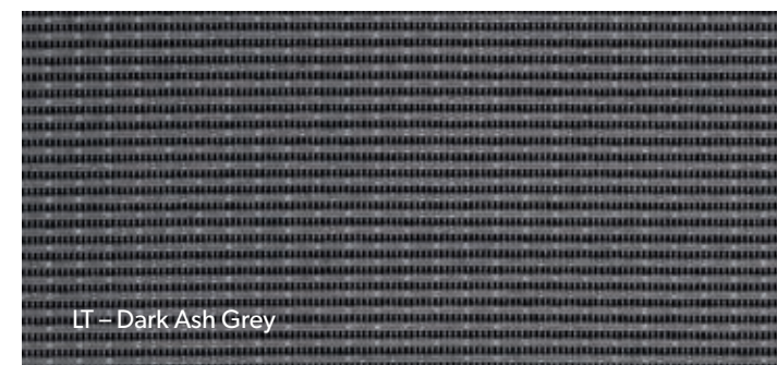
LT – Dark Ash Grey