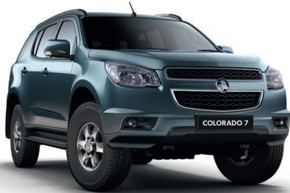
Colorado 7 LT in Blue Mountain