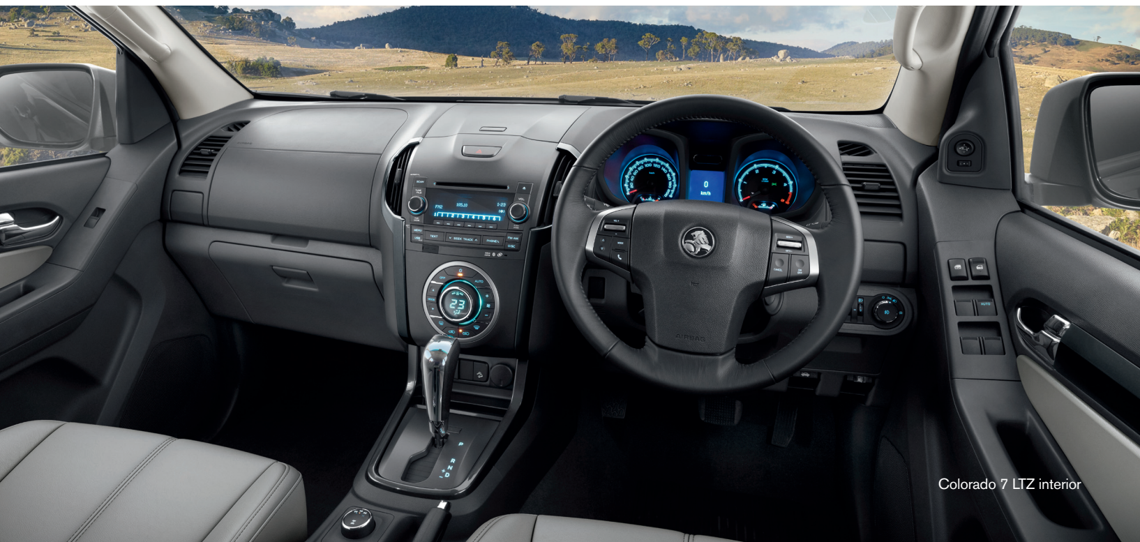
Colorado 7 LTZ interior