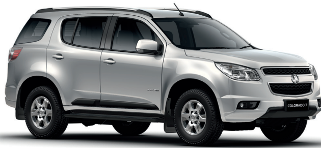
Colorado 7 LT in Nitrate