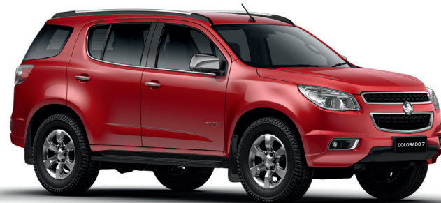
Colorado 7 LTZ in Sizzle