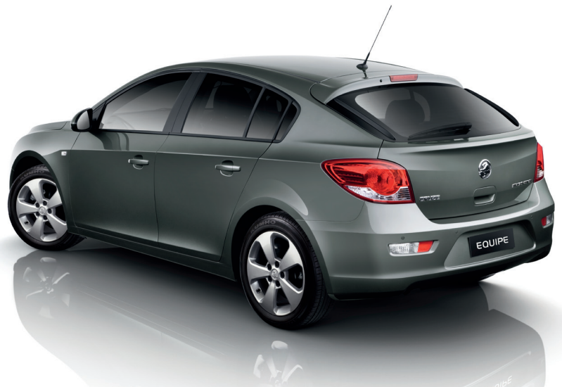
Cover: Cruze Equipe Sedan in Red Hot Above right: Cruze Equipe Hatch in Alto Grey

Available in hatch or sedan, it offers alloy wheels, rear parking sensors and Equipe badging.