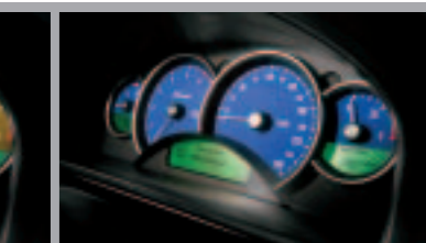
Turismo instrument cluster