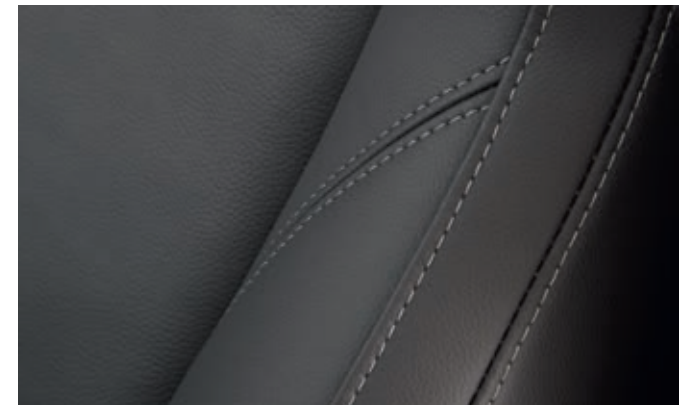
LTZ Black leather-appointed