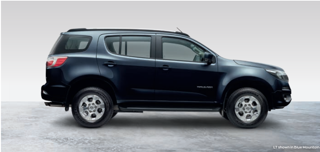
LT shown in Blue Mountain