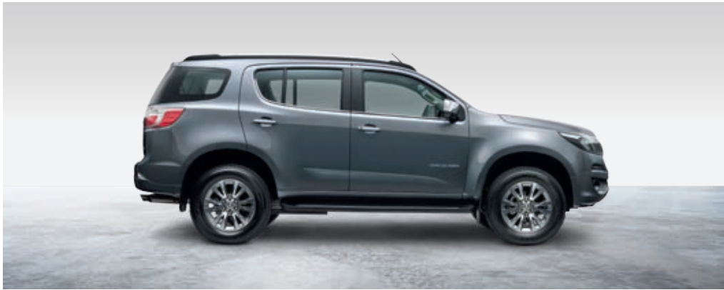
Satin Steel Grey*