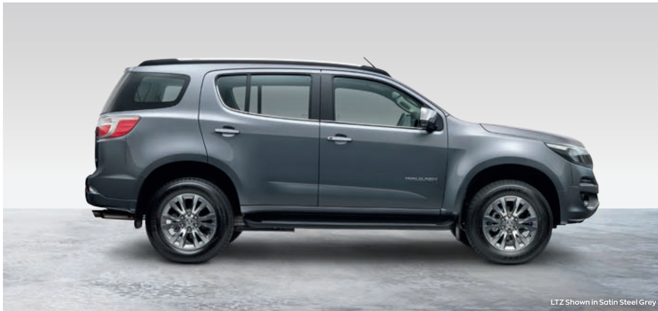
LTZ Shown in Satin Steel Grey