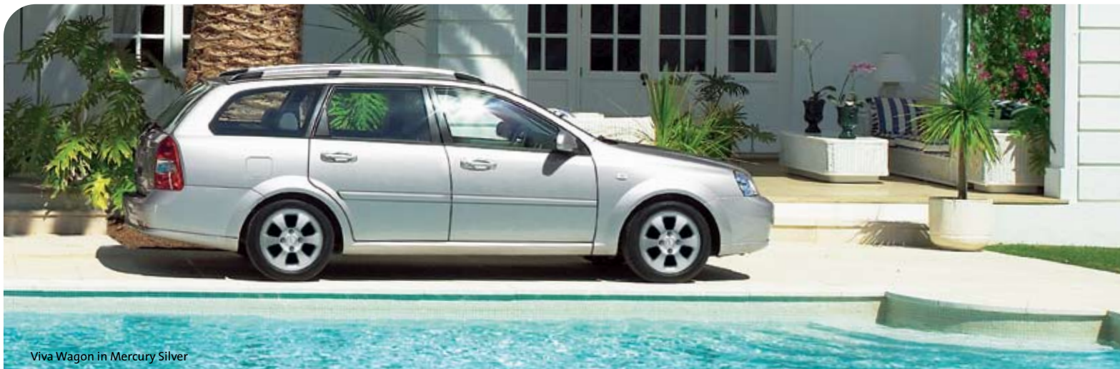
Viva Wagon in Mercury Silver