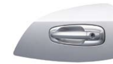
Mercury Silver Metallic*