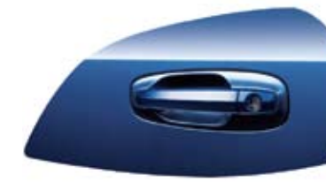
Impact Blue Metallic*