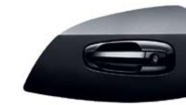
Carbon Flash Black Metallic*