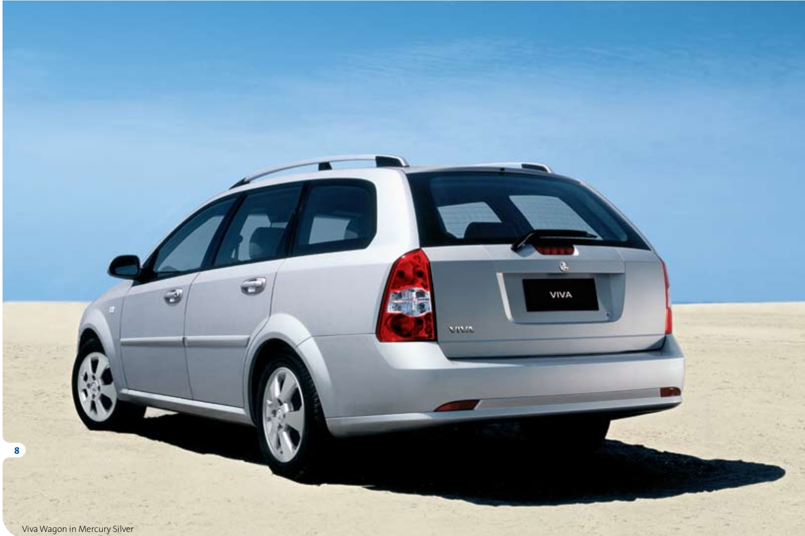
Viva Wagon in Mercury Silver