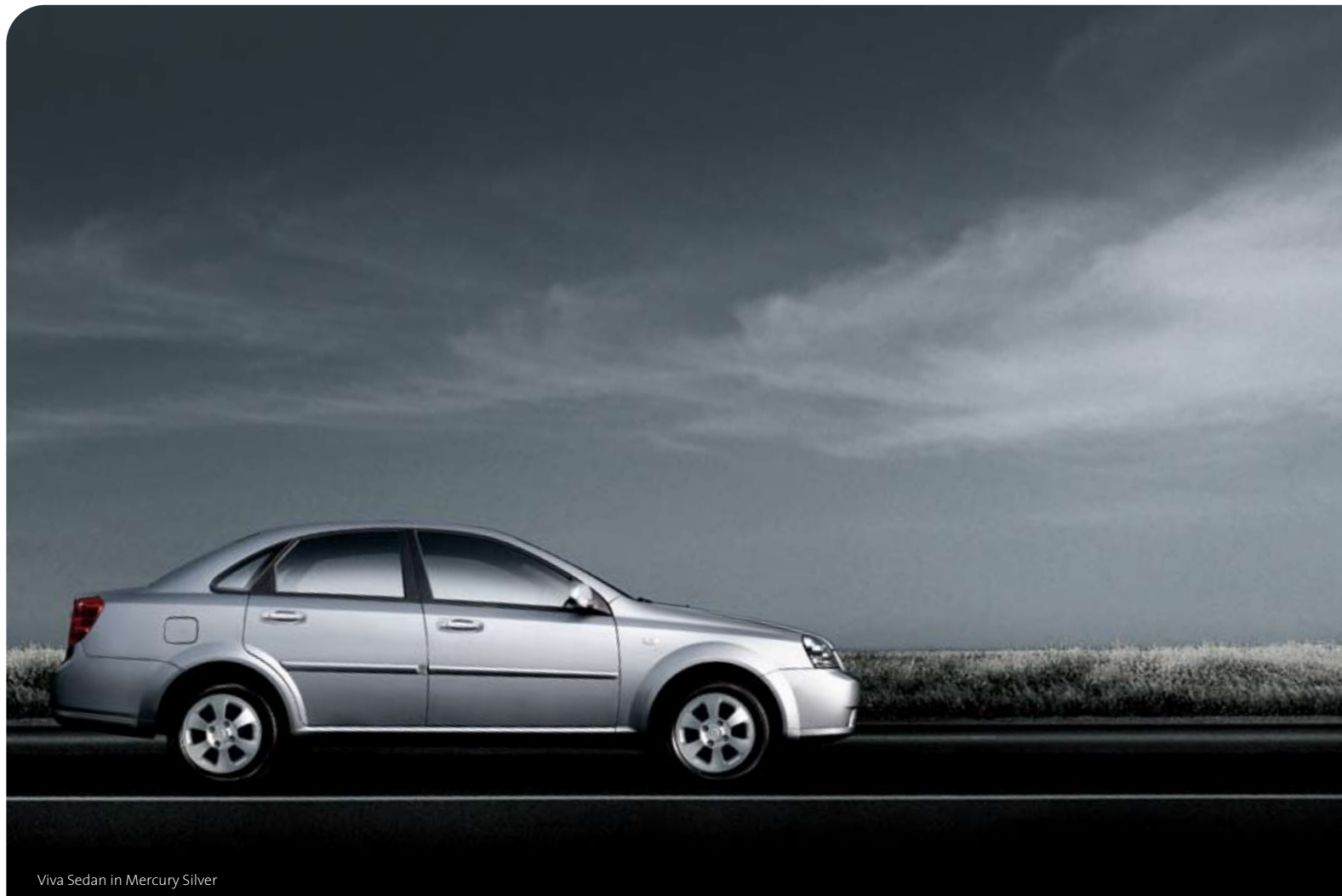
Viva Sedan in Mercury Silver