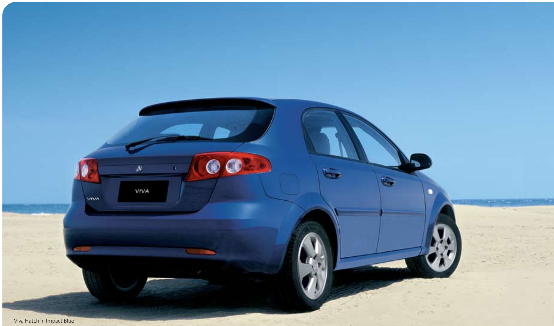
Viva Hatch in Impact Blue