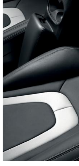
Jet Black Athens leather with Ceramic White inserts

Variations between colours shown and actual paint colours/interior trim colours may occur due to the printing process. Customers are encouraged to contact their Holden Dealer for current colour availability.