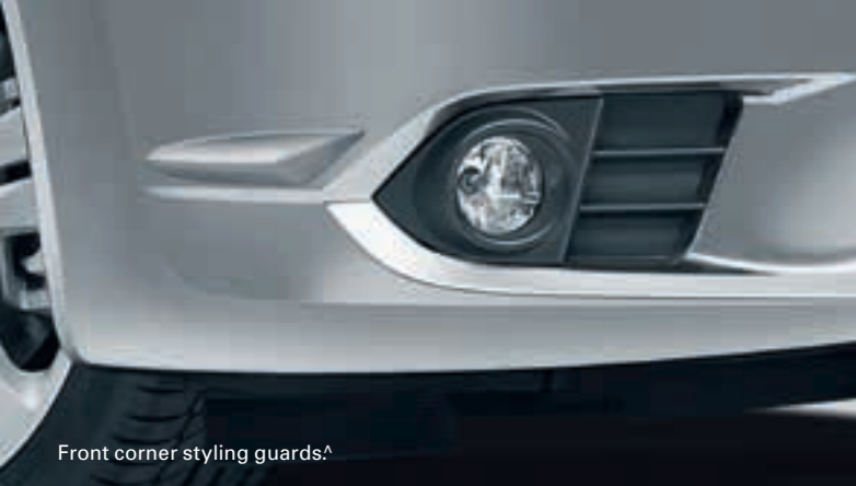
Front corner styling guards ^