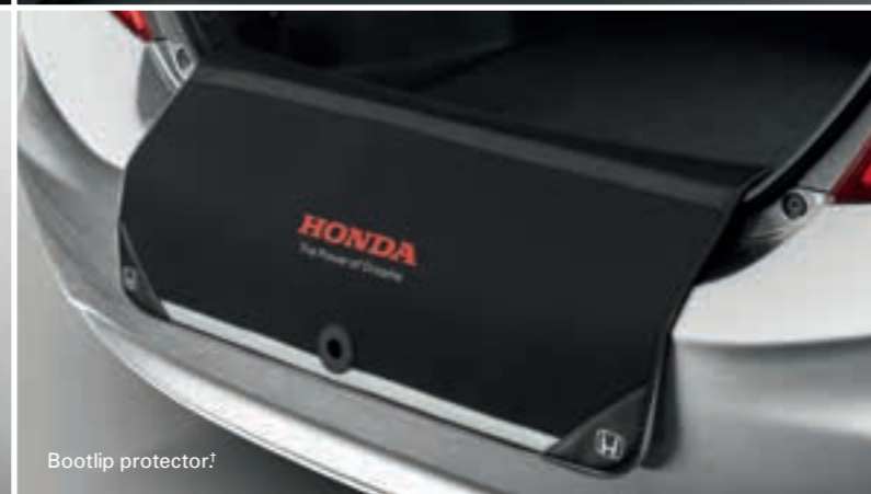
Bootlip protector. †