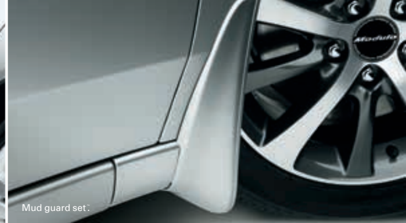
Mud guard set. †