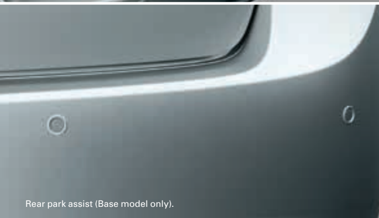
Rear park assist (Base model only).