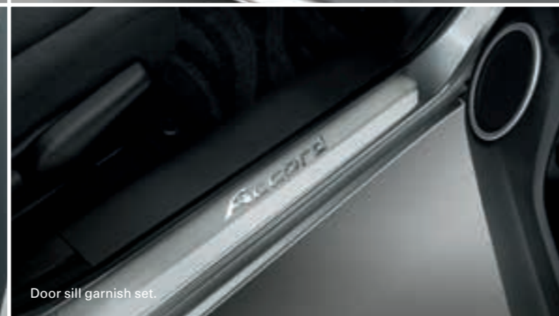
Door sill garnish set.