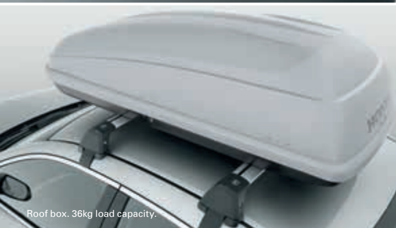
Roof box. 36kg load capacity.