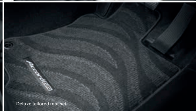
Deluxe tailored mat set.