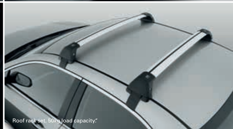
Roof rack set. 50kg load capacity.*