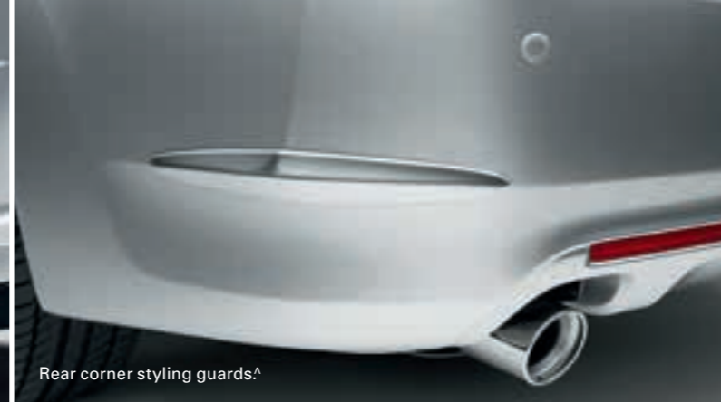
Rear corner styling guards ^