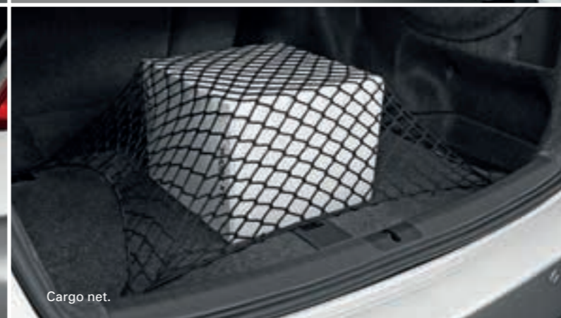
Cargo net. †