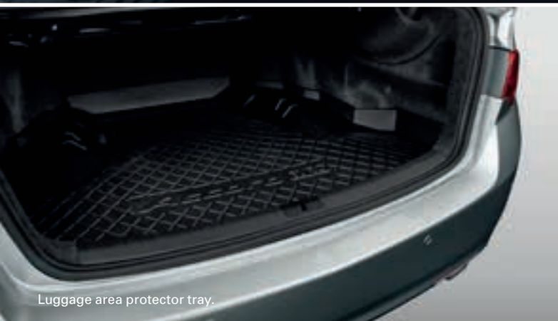
Luggage area protector tray.