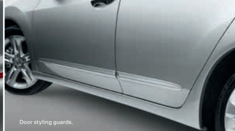
Door styling guards.