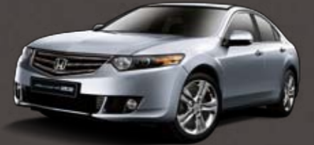
Buran Silver Metallic ^