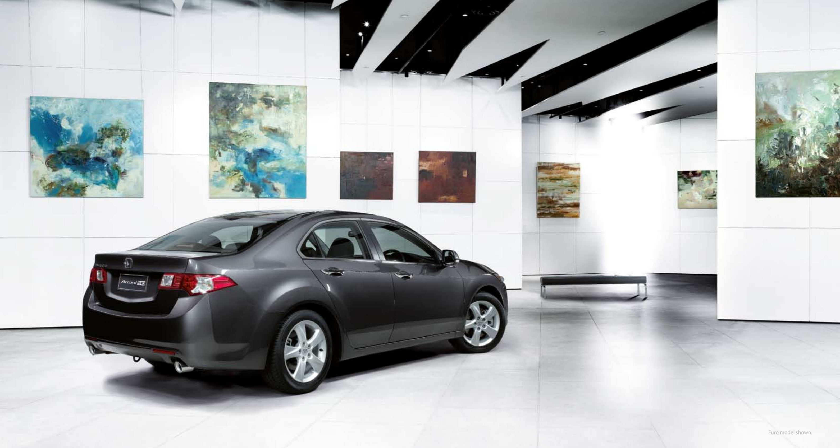
Euro model shown.