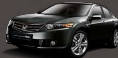
Crystal Black Pearllescent ^