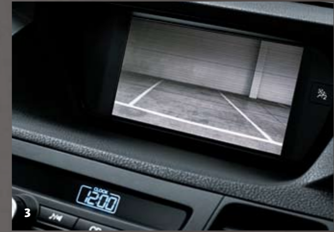
Euro Luxury Navigation model shown.