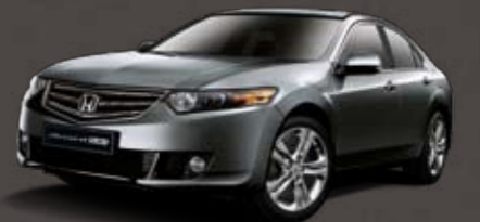
Volcano Grey Metallic ^