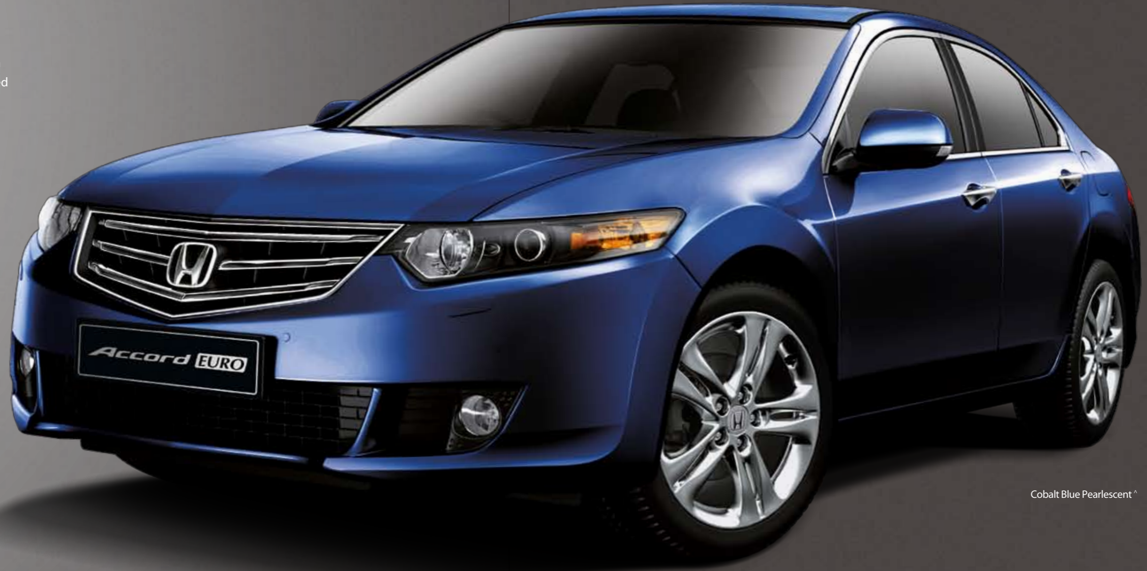
Cobalt Blue Pearllescent ^

This isn't an average car for average people. That's why the Honda Accord Euro comes in a range of dynamic colours that are designed not only to suit you, but also to show that your new Euro really is one of a kind.