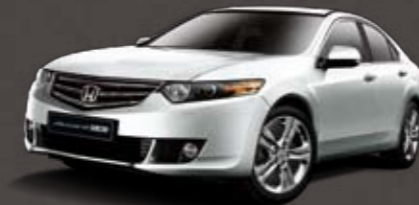
Premium White Pearllescent ^