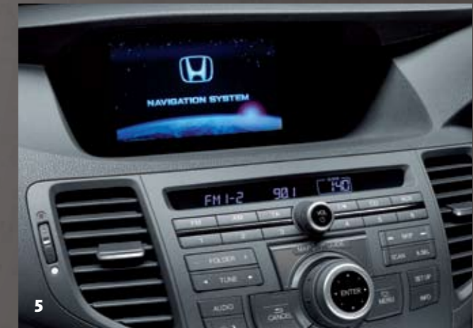
Euro Luxury Navigation model shown.