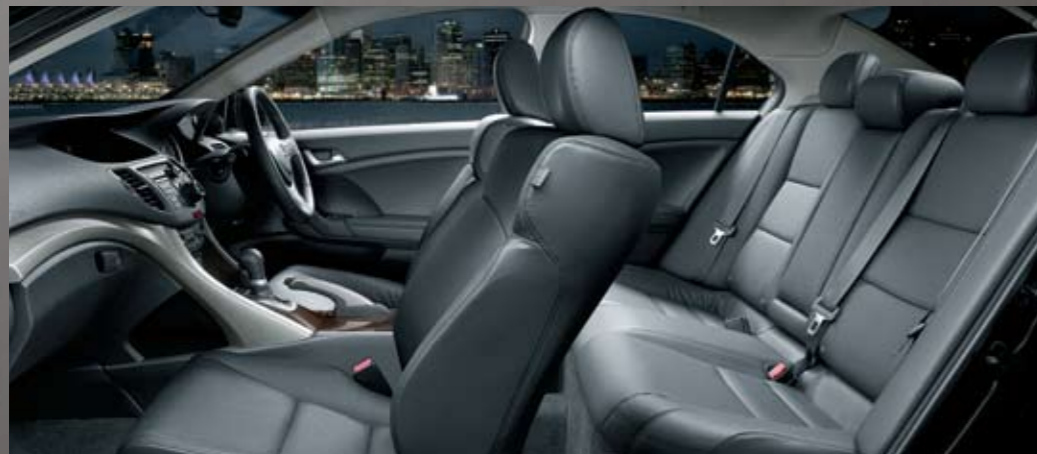
Interior colour for all models is Black.