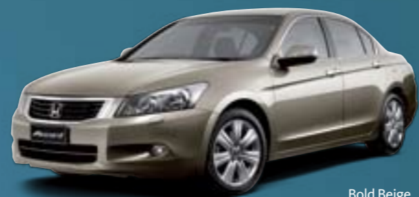
Bold Beige Metallic