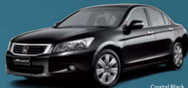
Crystal Black Pearllescent