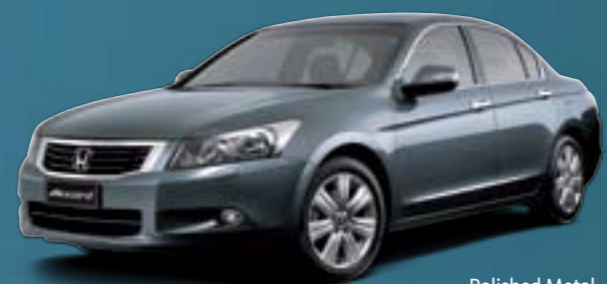
Polished Metal Metallic