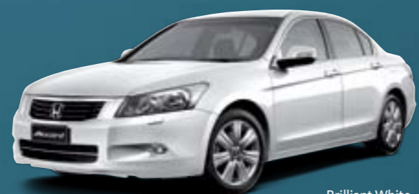
Brilliant White Pearllescent

Every way you look at it, it looks great.