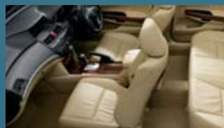
VTi Luxury model shown.