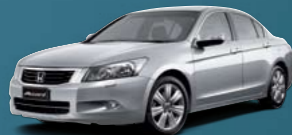
Alabaster Silver Metallic