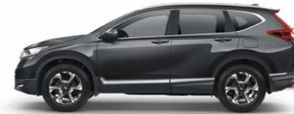
Modern Steel Metallic