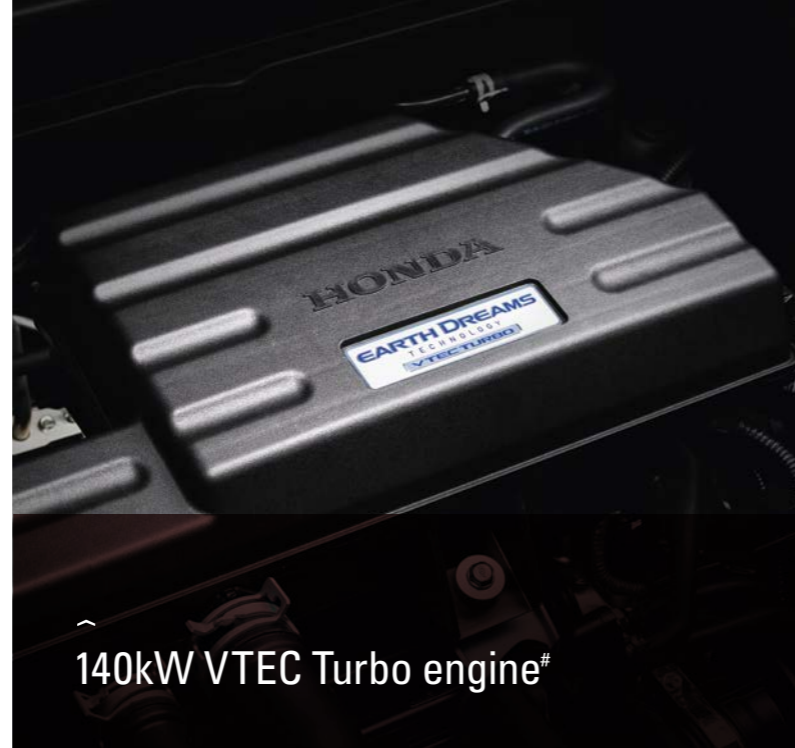
140kW VTEC Turbo engine #

On par with all that power and handling is a focus on efficiency. The Honda CR-V with Earth Dreams Technology # is engineered to maximise fuel economy and reduce emissions. Boasting 7 litres per 100km ^ , it maximises your driving enjoyment while minimising your impact on the world around you. So you can focus on exploring the road ahead and not what you leave behind.