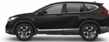
Crystal Black Pearllescent