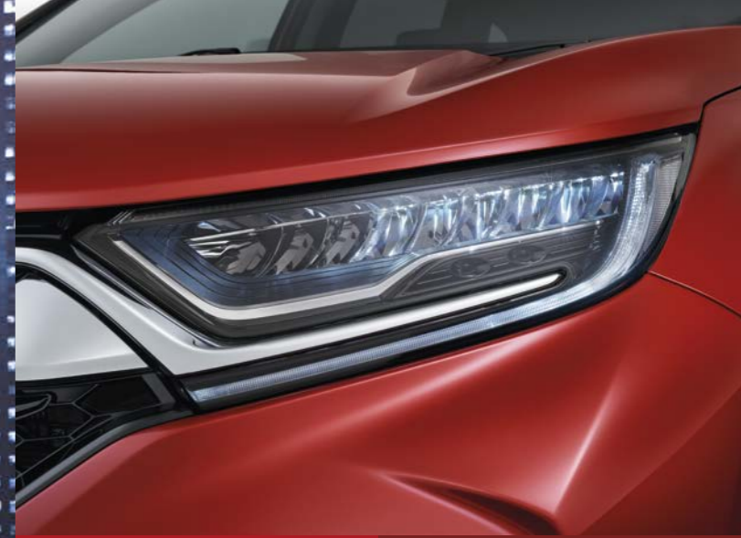
Features: VTi-LX shown in Passion Red Pearllescent.