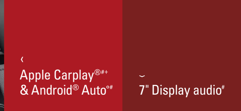
Apple Carplay ® ++ & Android ® Auto °