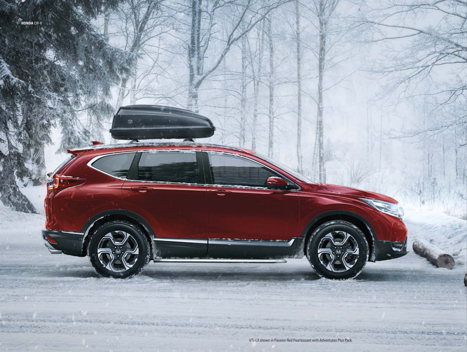
VTi-LX shown in Passion Red Pearlescent with Adventures Plus Pack.