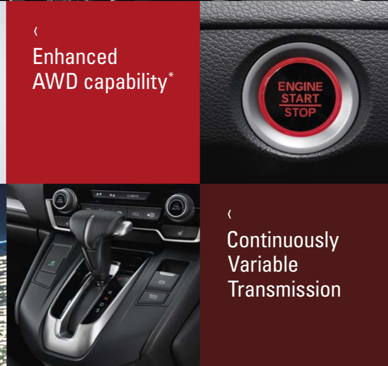
Continuously Variable Transmission