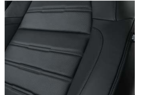
Black leather-appointed † seat trim