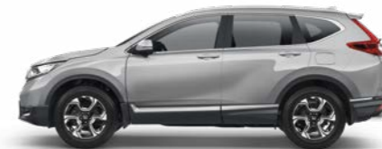
Lunar Silver Metallic