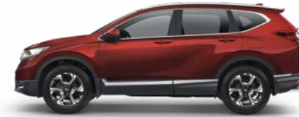
Passion Red Pearllescent