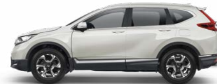
White Orchid Pearllescent