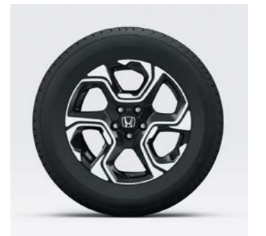
18" alloy wheels – VTi-S and above