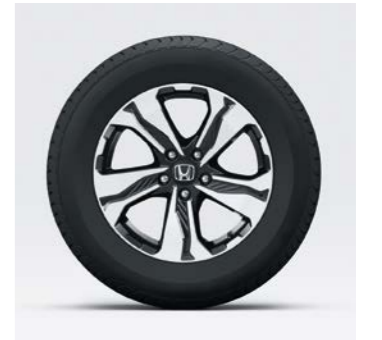
17" alloy wheels – Vi and VTi 2WD