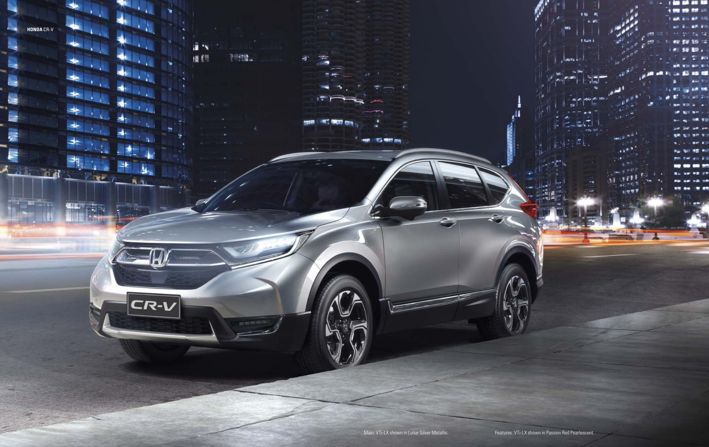
Main: VTi-LX shown in Lunar Silver Metallic.