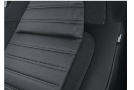
Black fabric seat trim*