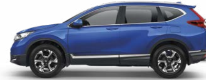
Brilliant Sporty Blue Metallic