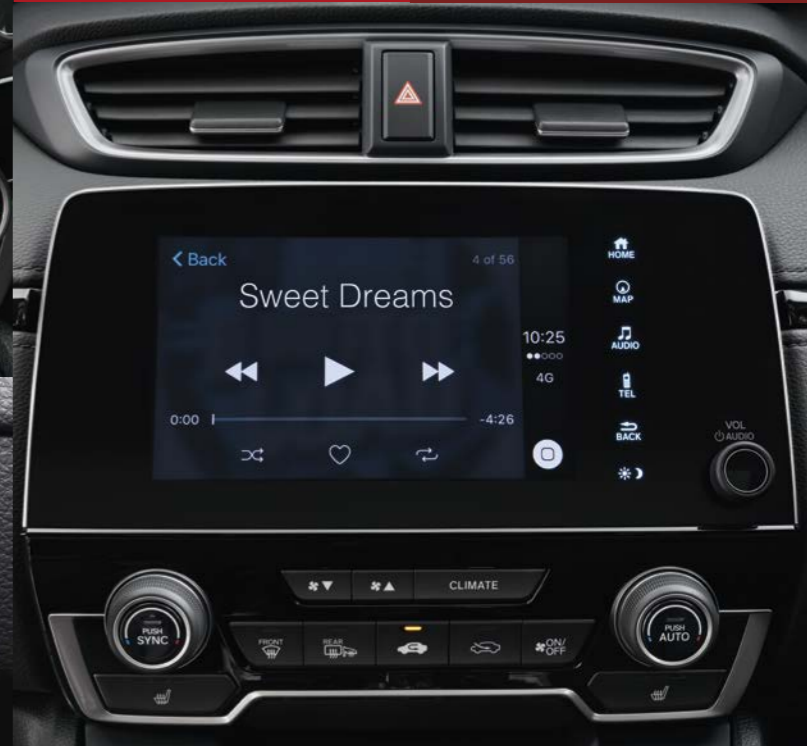
7" Display audio #