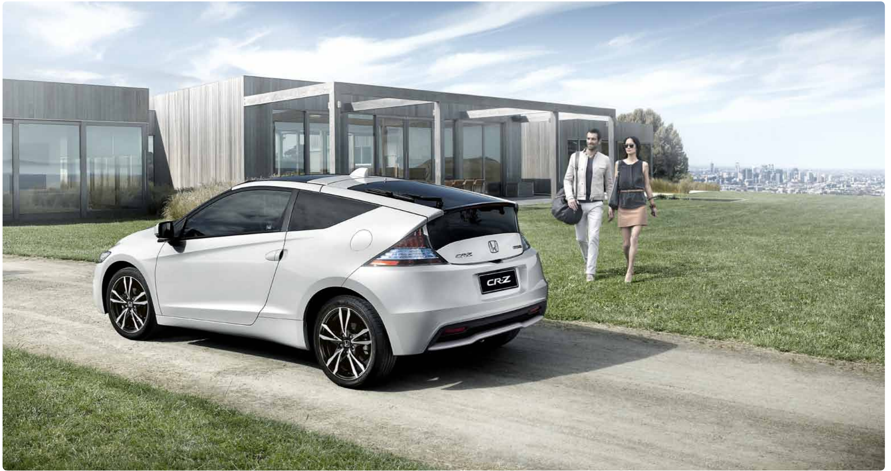
CR-Z shown in Premium White Pearlescent.