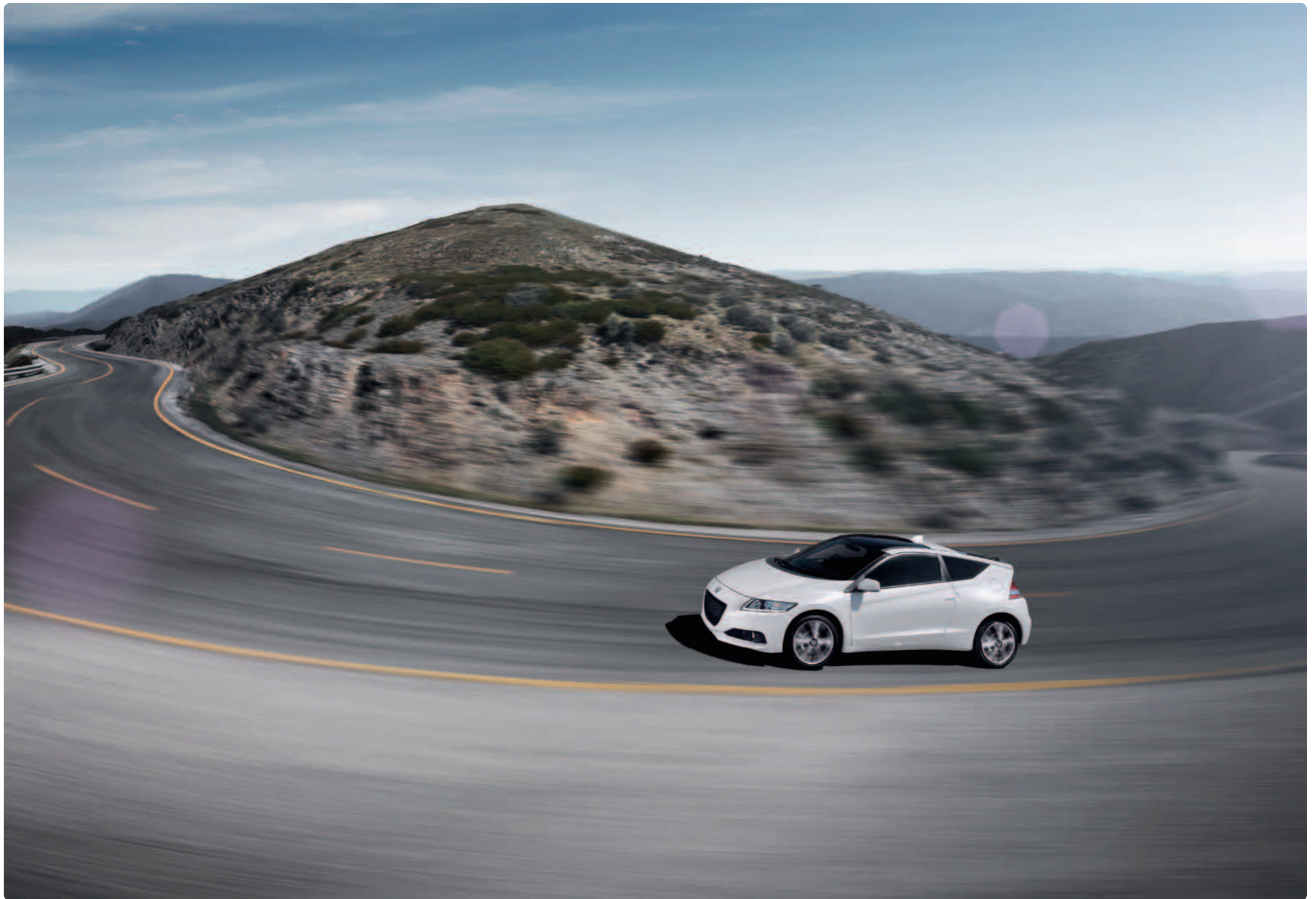
CR-Z shown in Premium White Pearlescent.