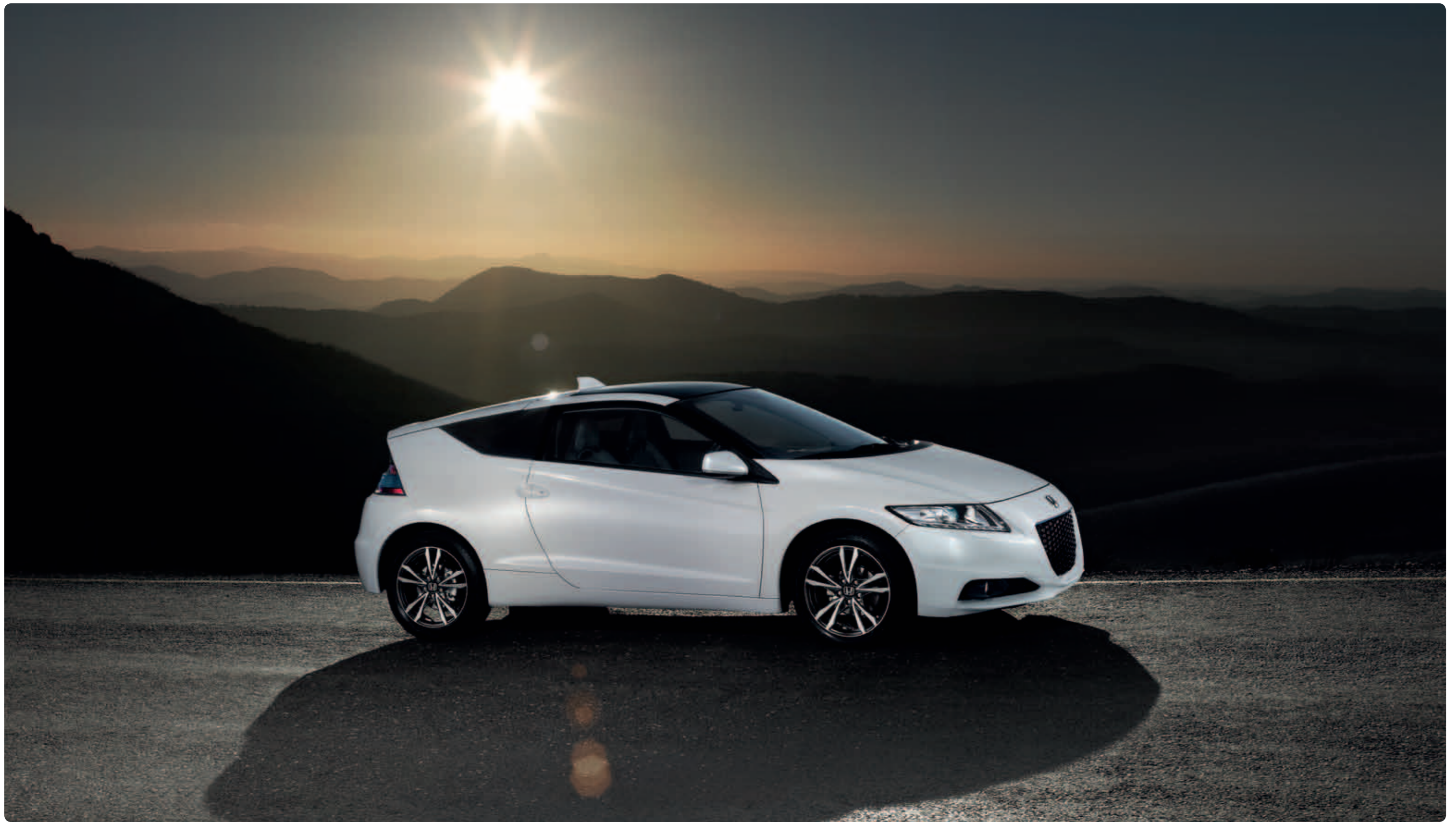
CR-Z shown in Premium White Pearlescent.