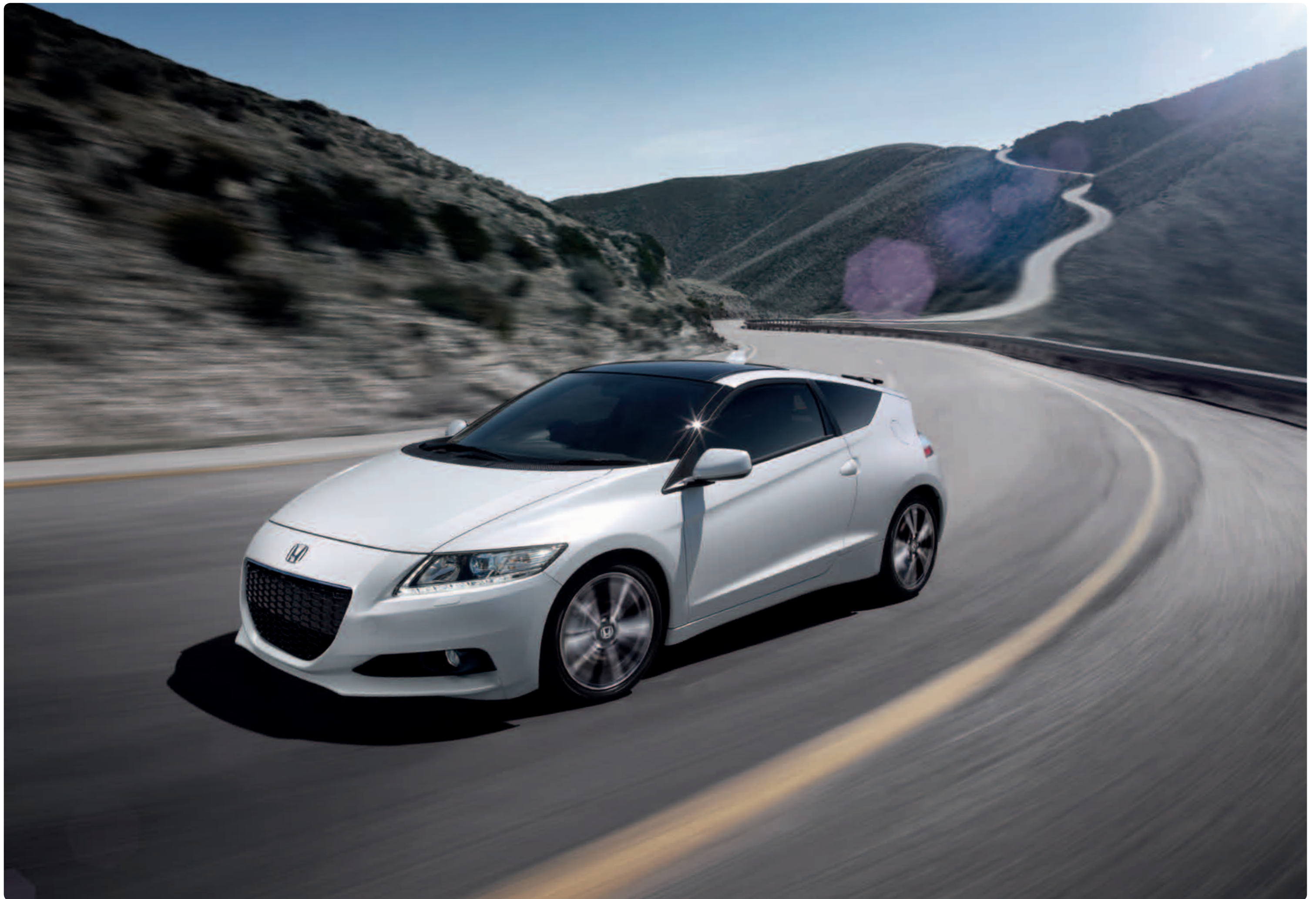
CR-Z shown in Premium White Pearllescent.