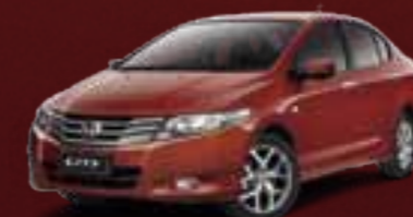
Habanero Red Pearlescent ^