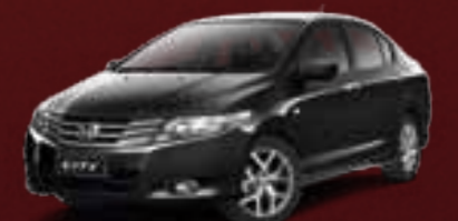
Crystal Black Pearlescent ^

^ Metallic/Pearlescent paint at extra cost.