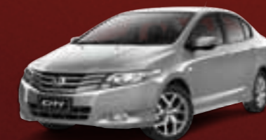
Alabaster Silver Metallic ^