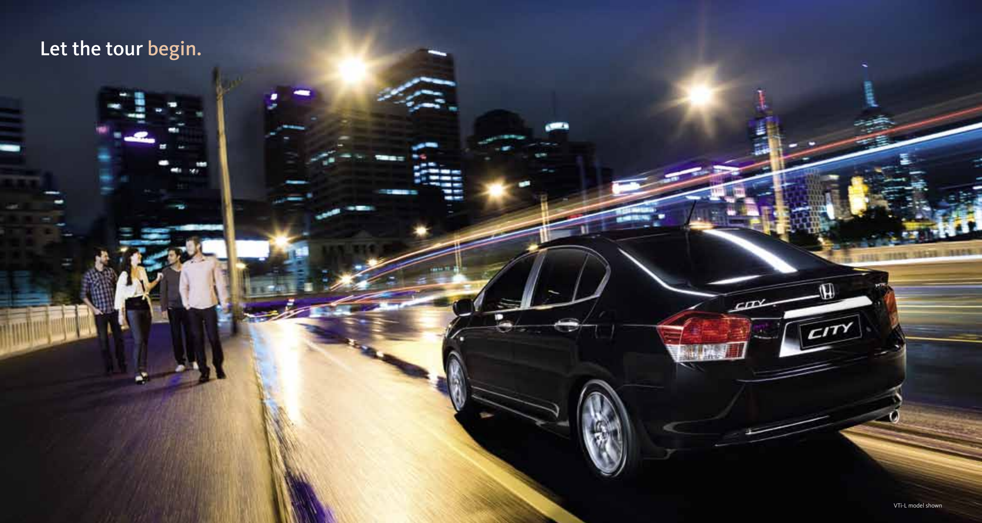
VTi-L model shown

Cities – really great ones, anyway – make you giddy. They cram the best of all worlds together. Energy, excitement, sophistication and style collide. Welcome to the Honda City. Whether you choose the VTi or VTi-L model, the 5-speed manual or 5-speed automatic transmission, one thing will become instantly and abundantly clear; this is no ordinary car. It's a smart new way.