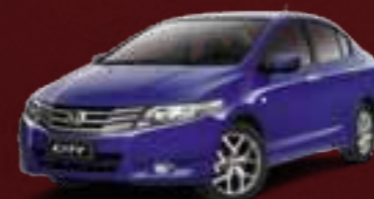
Deep Lapis Blue Metallic ^