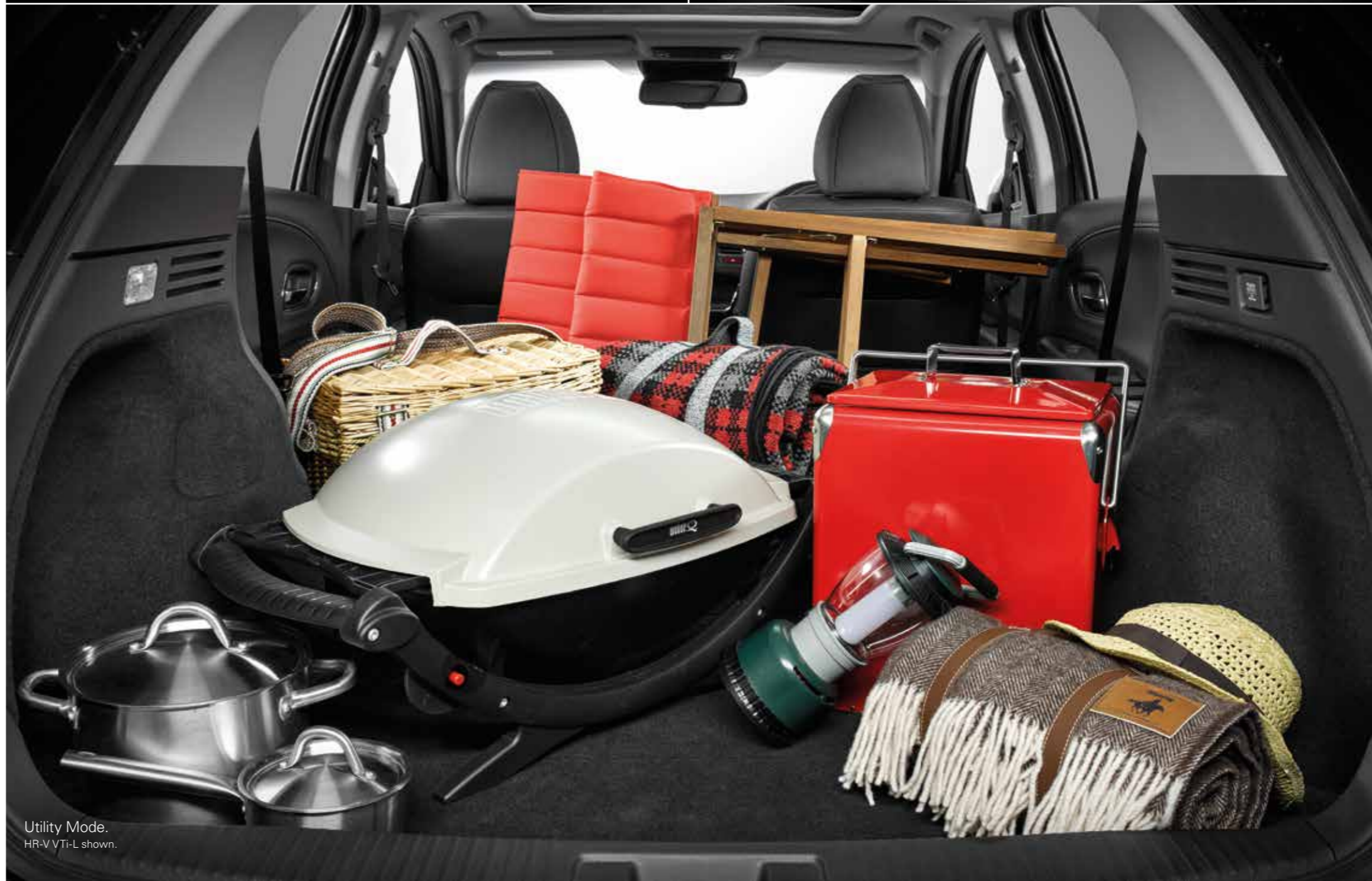
Utility Mode. HR-V VTi-L shown.