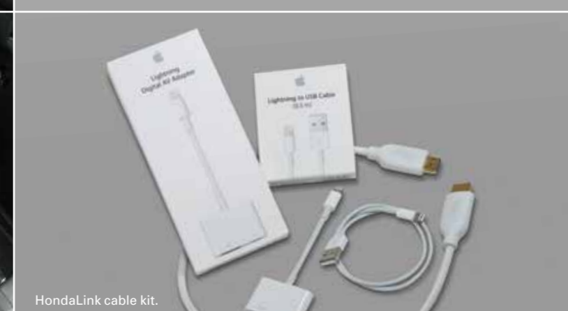
HondaLink cable kit.