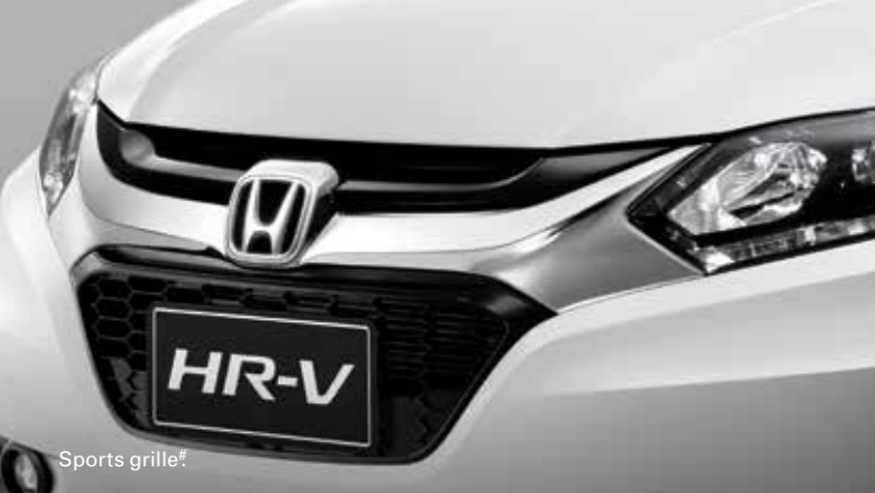
Sports grille ‡