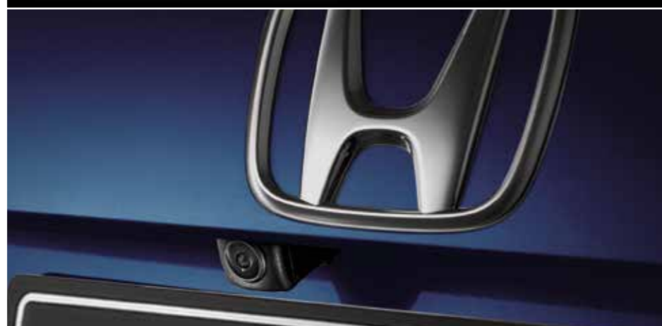
Multi-angle reversing camera