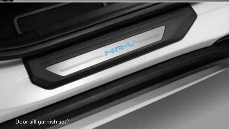
Door sill garnish set ^