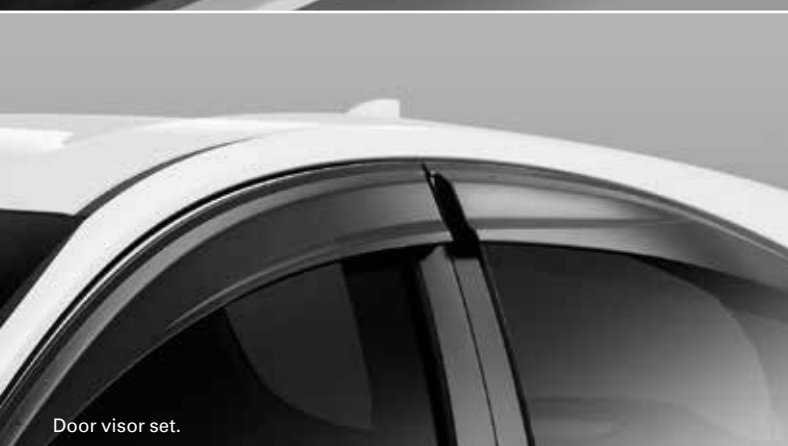
Door visor set.