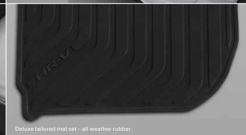
Deluxe tailored mat set – all weather rubber.