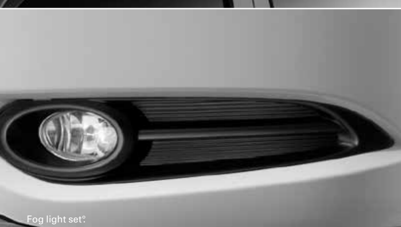
Fog light set ‡