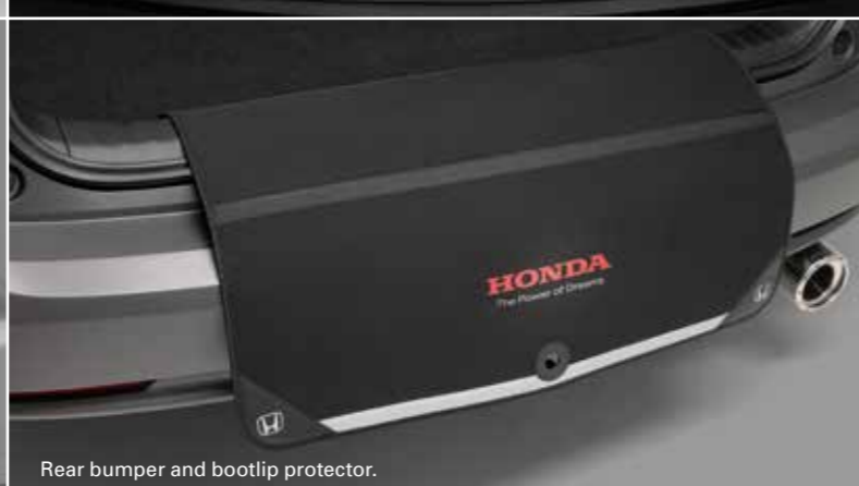
Rear bumper and bootlip protector.