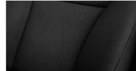
Black fabric seat trim – VTi and VTi-S models.