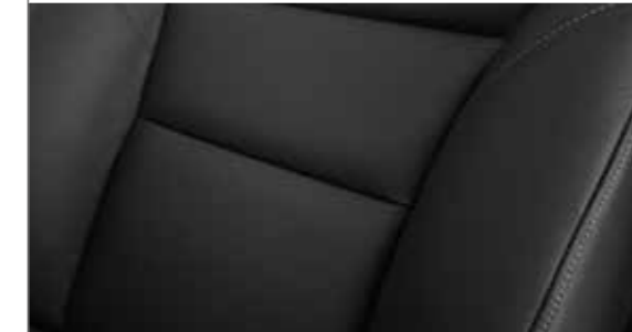
Black leather-appointed seat trim† – VTi-L models.