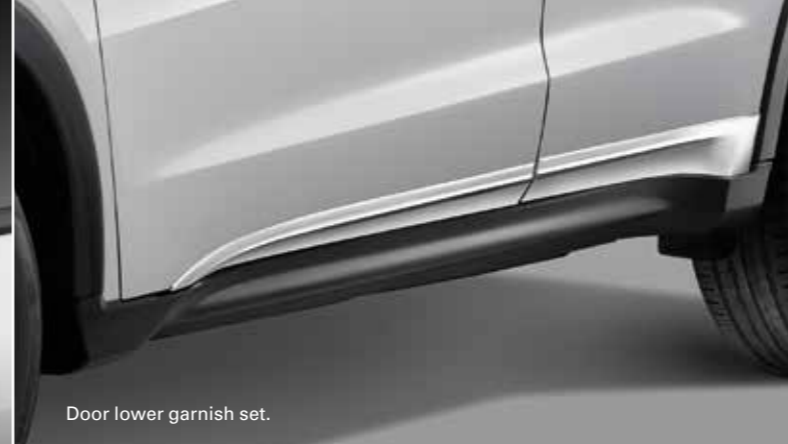
Door lower garnish set.