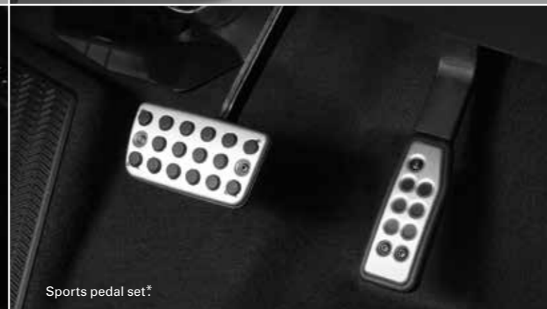
Sports pedal set *