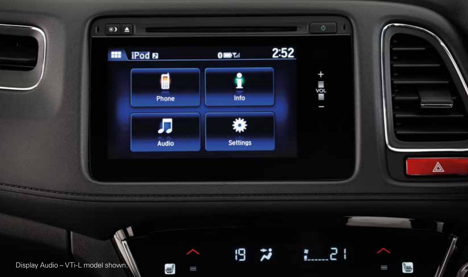
Display Audio – VTi-L model shown.