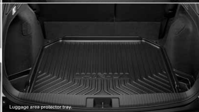
Luggage area protector tray.