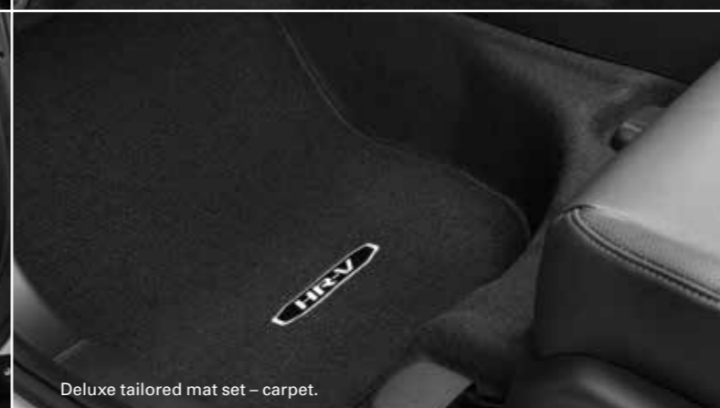
Deluxe tailored mat set – carpet.