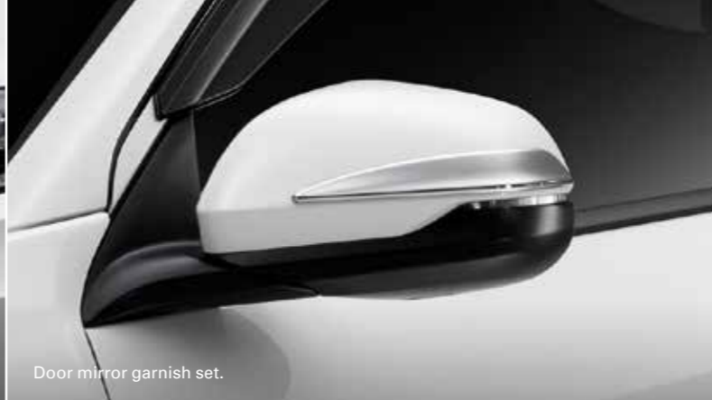
Door mirror garnish set.