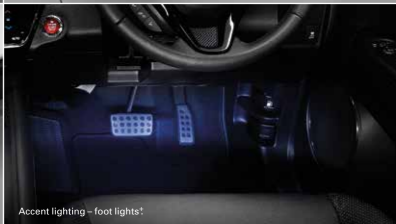
Accent lighting – foot lights ‡