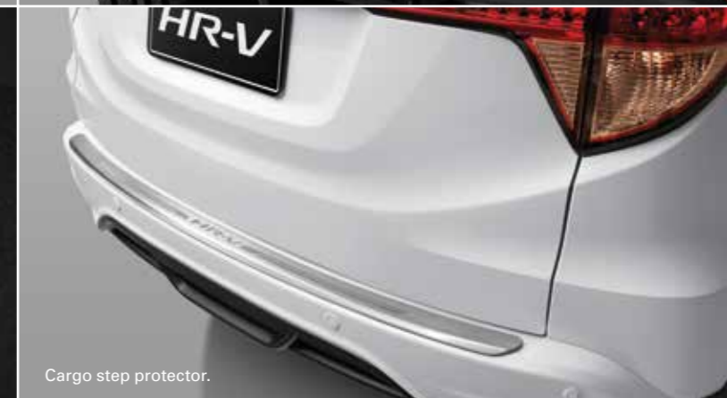
Cargo step protector.