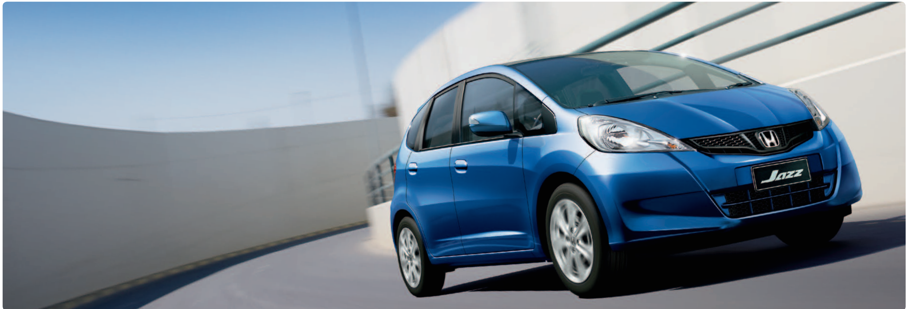
Jazz Vibe shown in Azure Blue.