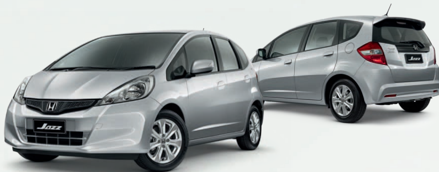
Jazz Vibe shown in Alabaster Silver.

o Features new to the Jazz Vibe-S shown in bold. Dark blue/Grey seat trim