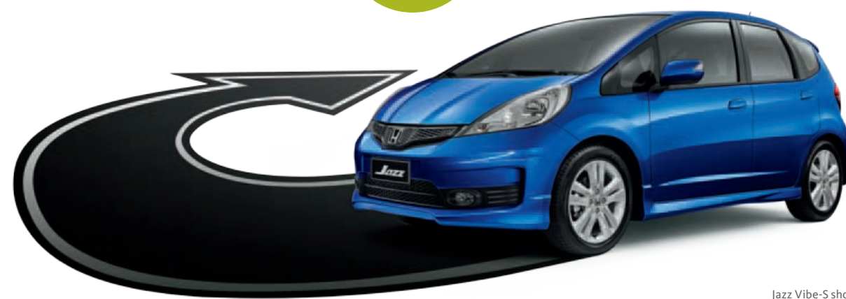
Jazz Vibe-S shown in Azure Blue.

Regardless of your decision, you'll soon notice the Jazz Vibe's awesome agility. By teaming low rear suspension, Electric Power-assisted Steering (EPS) and a rigid body with a low centre of gravity, the Jazz Vibe shows equal aplomb whether taming tight corners or even tighter parking spaces.