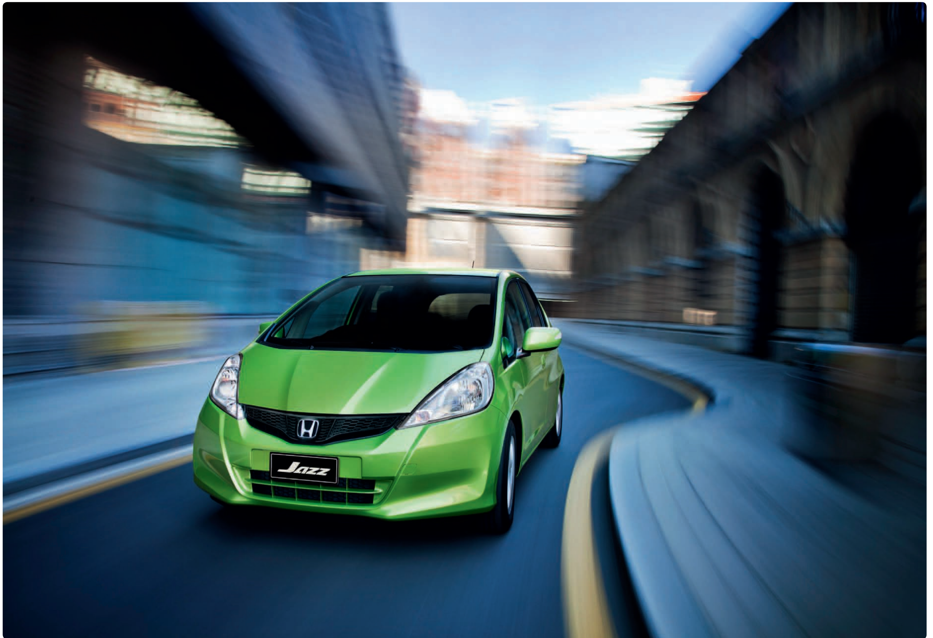
Jazz Vibe shown in Fresh Lime.