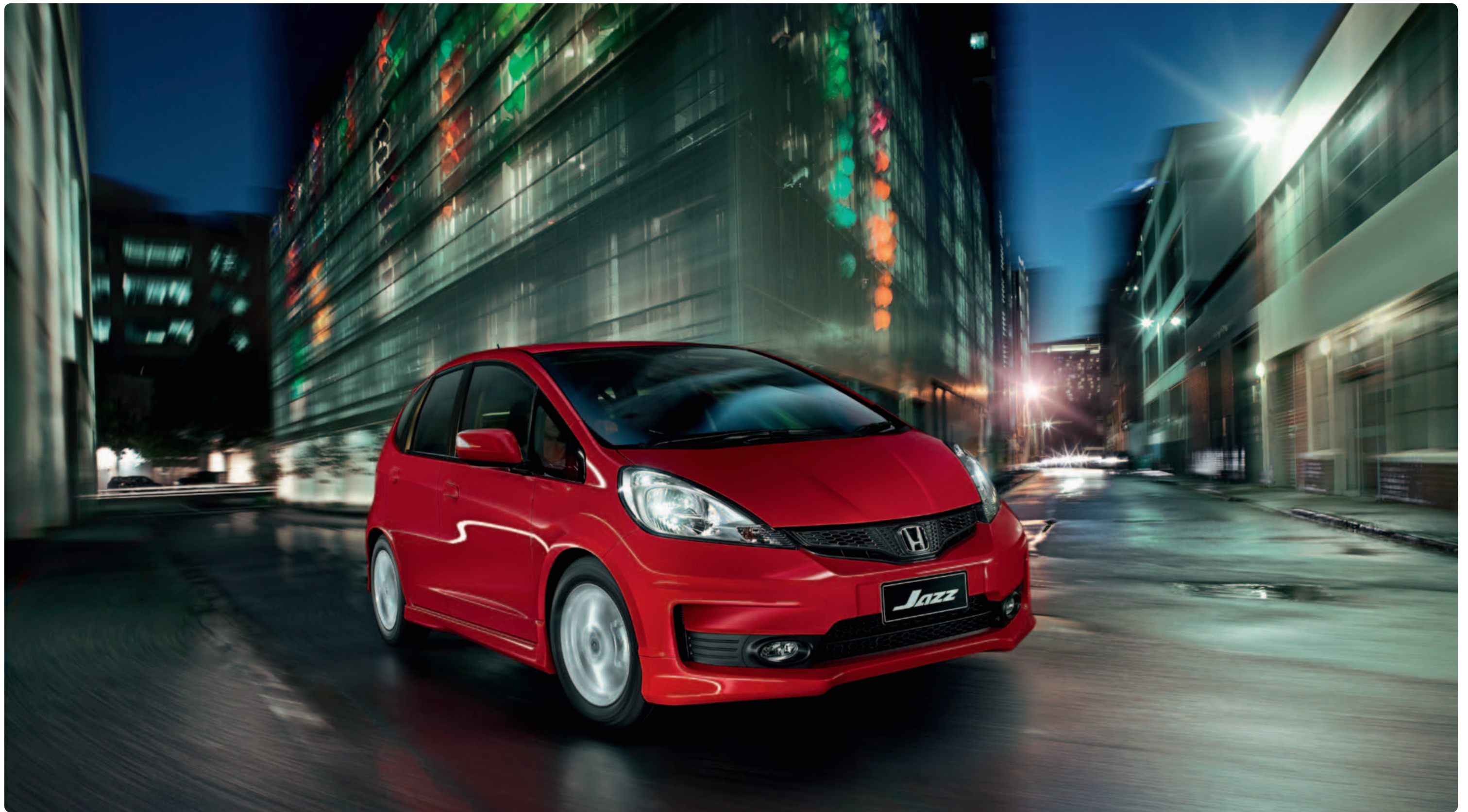
Jazz Vibe-S shown in Milano Red.