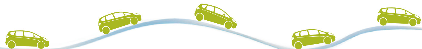
Typical 'gear hunting' without Grade Logic Control