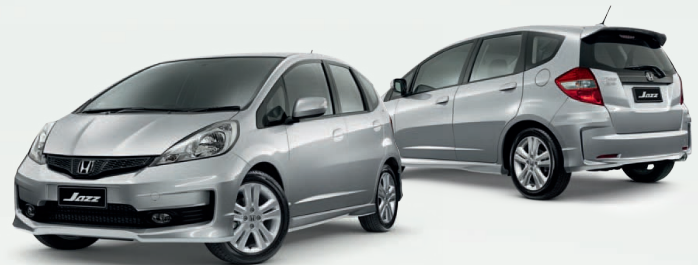
Jazz Vibe-S shown in Alabaster Silver.