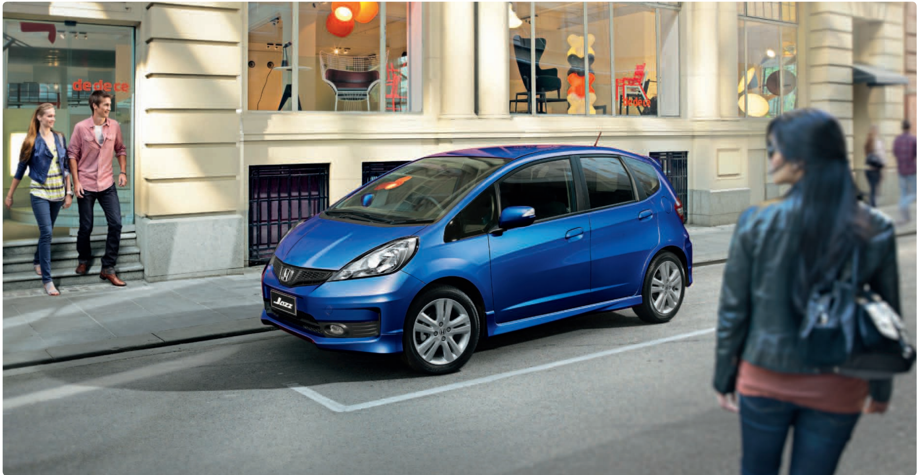
Jazz Vibe-S shown in Azure Blue.