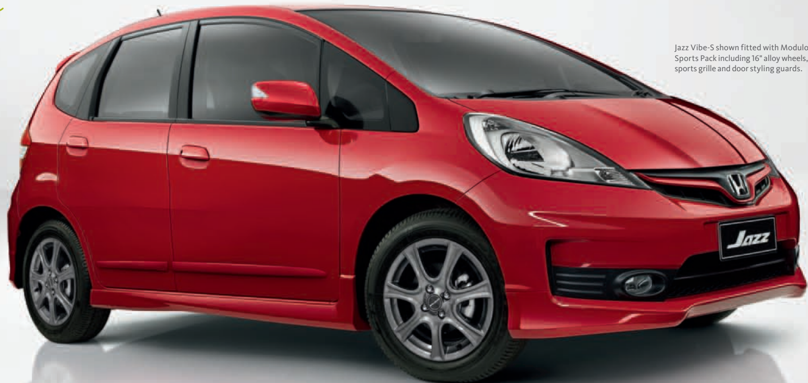
Jazz Vibe-S shown fitted with Modulo Sports Pack including 16" alloy wheels, sports grille and door styling guards.