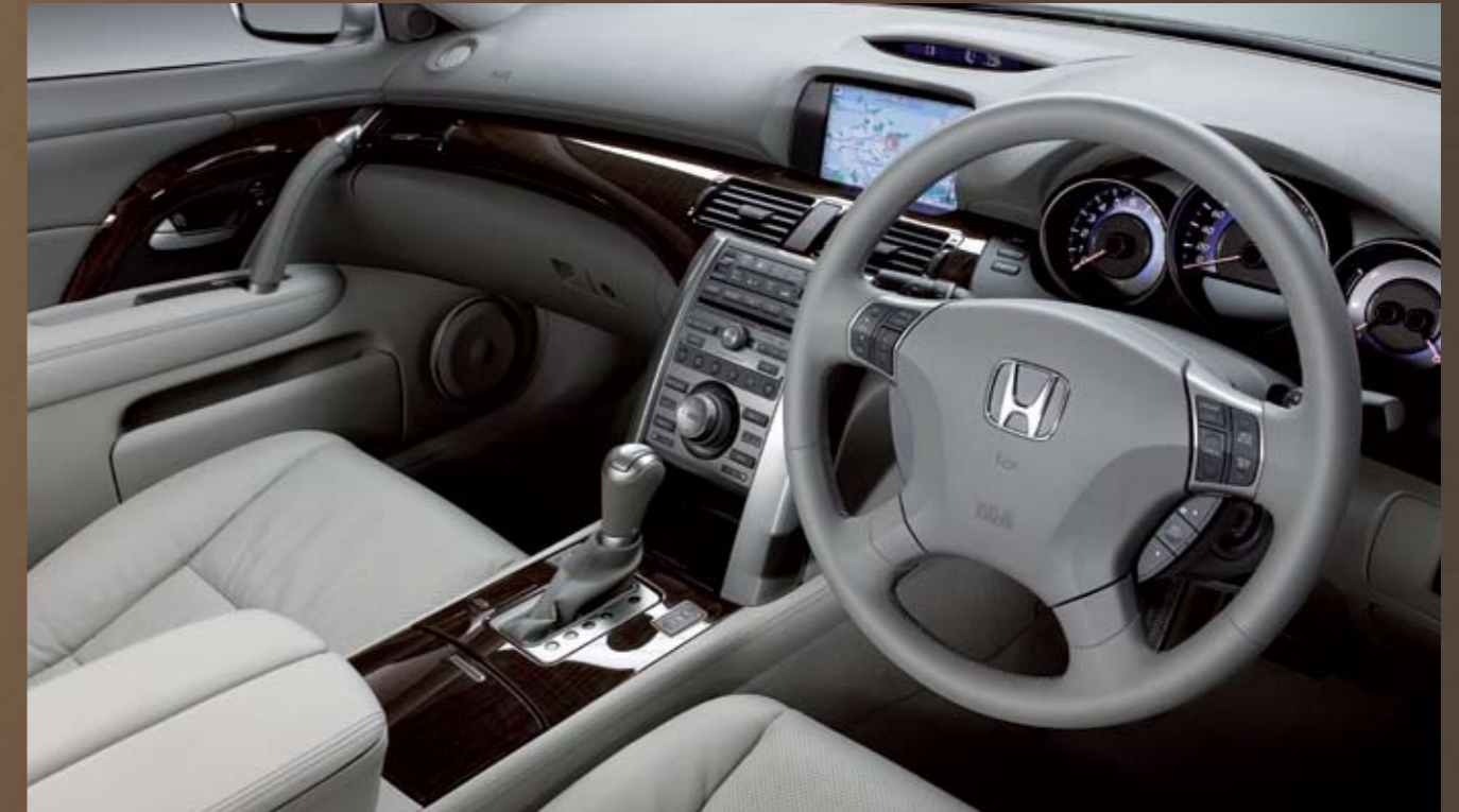
Super Platinum interior colour model shown.

This isn't an average car for average people. That's why the all-new Honda Legend comes in a range of dynamic colours that are designed not only to suit you, but also to show that your new Legend really is one of a kind.