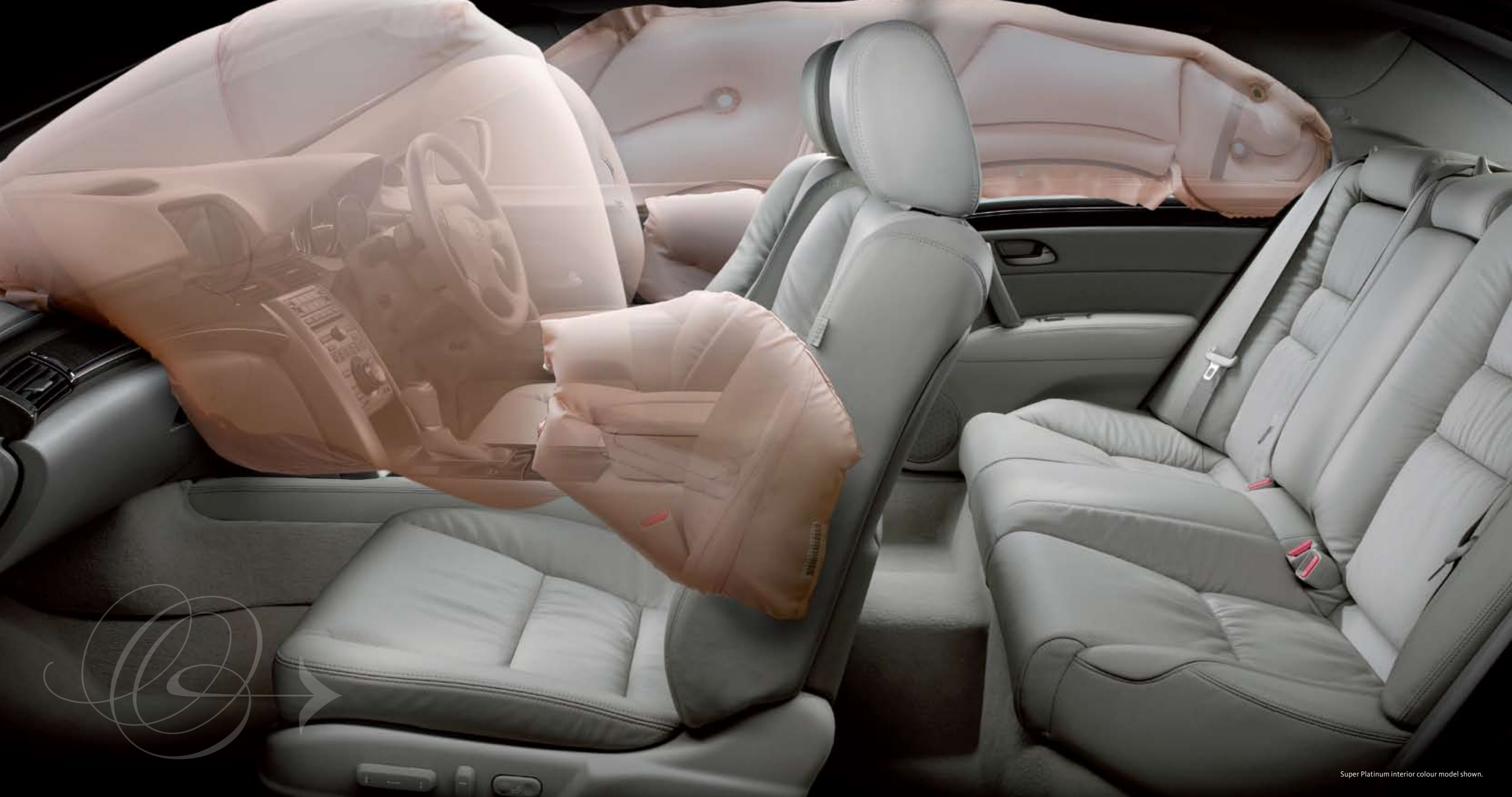
Super Platinum interior colour model shown.