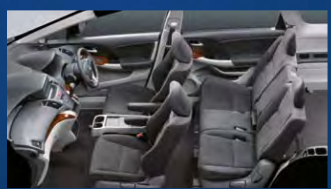
Overseas model shown.

So yeah, I love it. I'm on my learners' so I especially love it when Dad lets me drive. Well, I love it when my little brothers aren't in the car – they just tease me; saying I'm hopeless. That's pretty distracting. It's good to learn in because it's got a big view out the windscreen – you can see everything. Dad says it's got something to do with the narrowed 'A' pillar that gives it such a huge field of view. Me, I just say give me the keys!