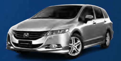
Alabaster Silver Metallic