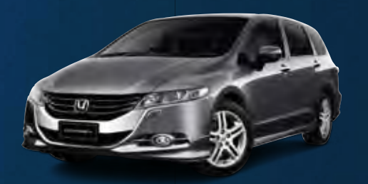
Polished Metal Metallic