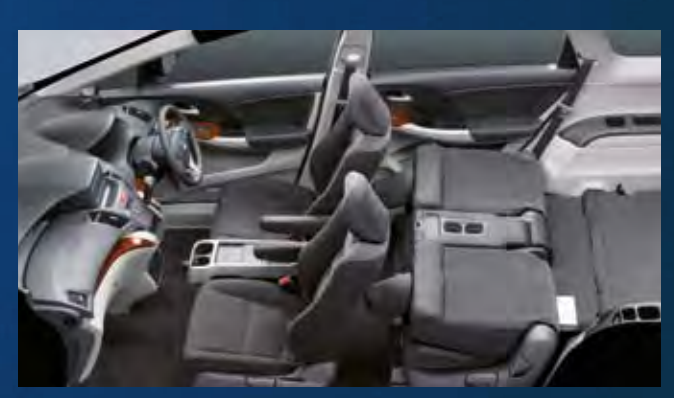
Overseas model shown.