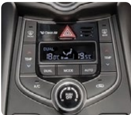
Dual Zone Auto Climate Control (Elite and Premium)

*Elite and Premium only. †Premium only. iPod® is a registered trademark of Apple Inc., registered in the US and other countries. *iPod® and connection lead not included. Bluetooth® is a registered trademark of Bluetooth SIG, Inc. †Please check your Bluetooth® device's capabilities to ensure compatibility. *SUNA™ Traffic channel coverage is available in the following metropolitan areas only: Adelaide, Brisbane, Canberra, Gold Coast, Melbourne, Perth and Sydney. †MapCare™ Plan only applies to new vehicles with factory-fitted satellite navigation. NAVTEQ and MapCare™ are registered trademarks of Nokia Corporation. Maximum number of 2 updates, delivered on an annual cycle within 3 years of the vehicle's initial purchase. Free map updates only apply if the vehicle is serviced at a participating authorised Hyundai dealer.