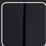
Leather appointed seats ^ (RY)