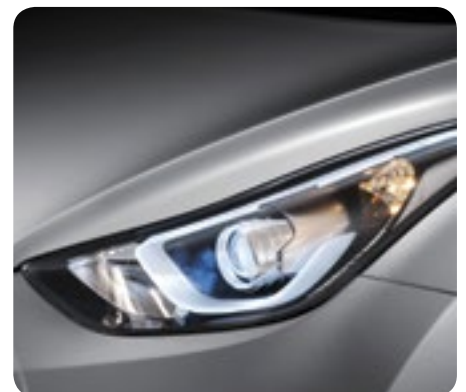
Dusk Sensing Headlamps (Premium)