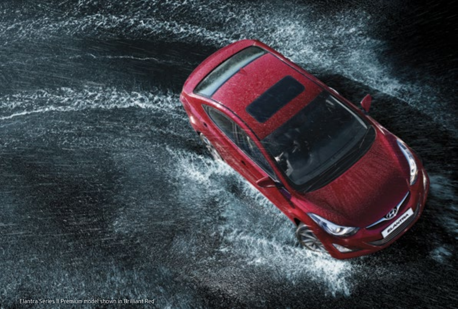
Elantra Series II Premium model shown in Brilliant Red