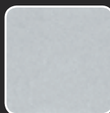
Sleek Silver Metallic (P3S)