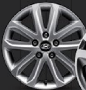
205/55R16 Alloy Wheel (Elite)