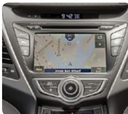
Multimedia System with SatNav ◇ and 3 years NAVTEQ MapCare ™^