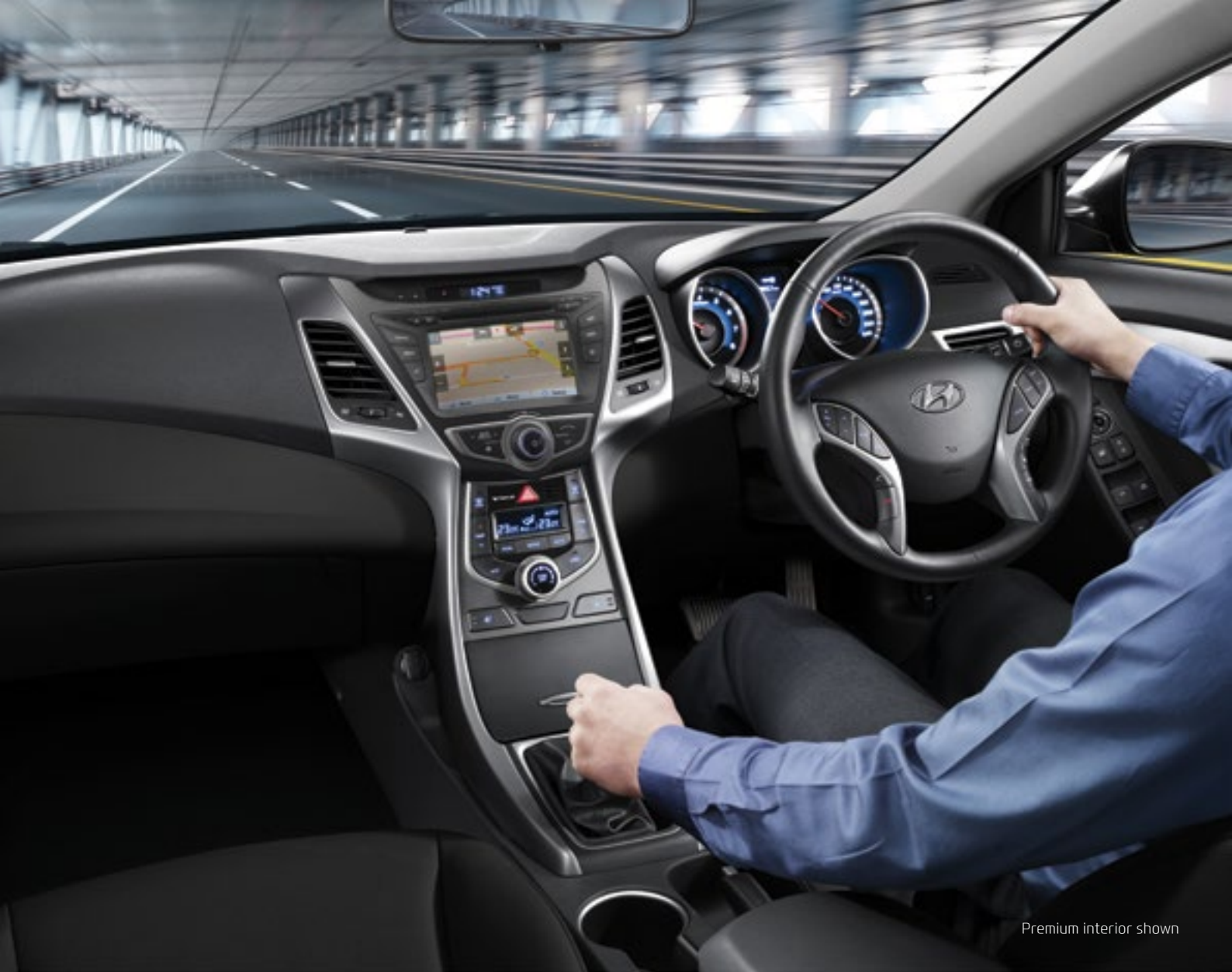
Premium interior shown