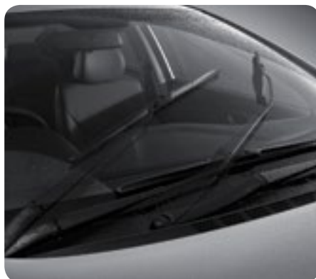
Rain sensing wipers (Elite and Premium)