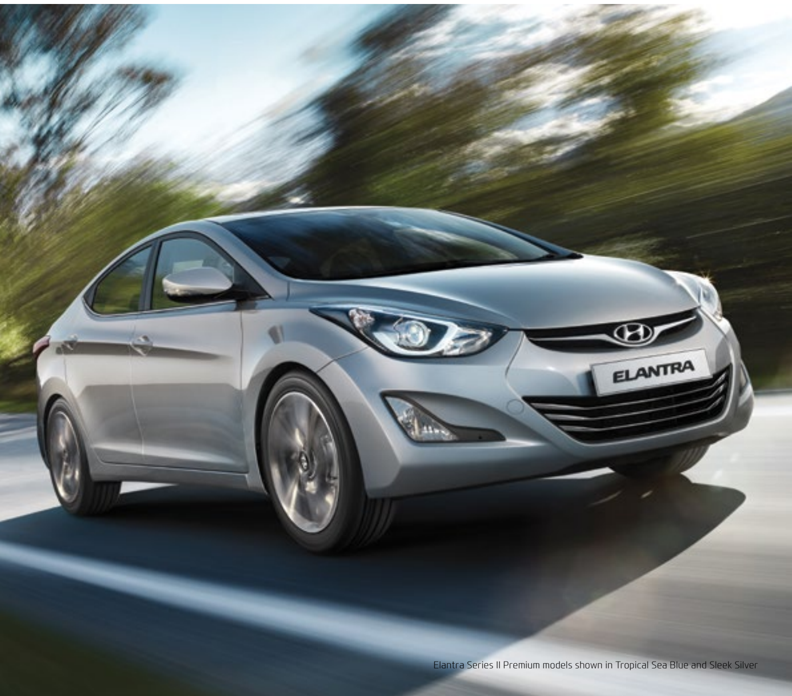
Elantra Series II Premium models shown in Tropical Sea Blue and Sleek Silver