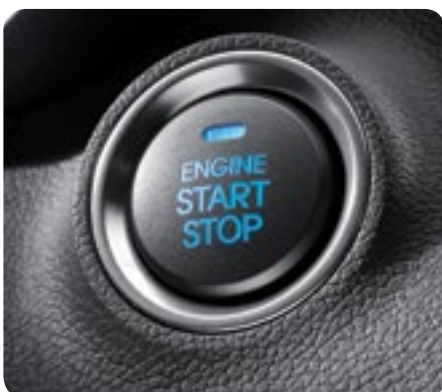
Push Button Start ◇

Elantra Series II Premium model shown in Sleek Silver