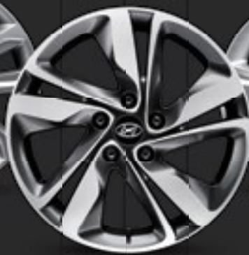
215/45R17 Alloy Wheel (Premium)