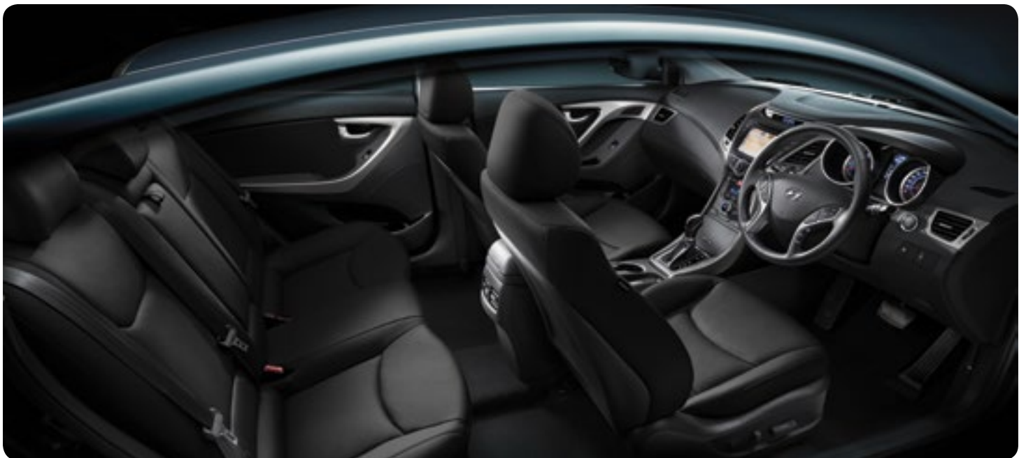
Elantra Series II Premium interior shown

The Elantra Series II delivers all the luxurious space you'd expect in a much bigger car. With loads of legroom, generous headroom and shoulder room for both front and rear-seat passengers, the Elantra allows five adults to enjoy the journey in comfort.