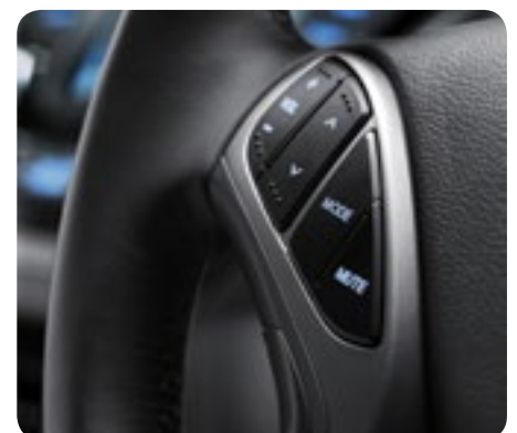
Steering Wheel Mounted Audio Controls