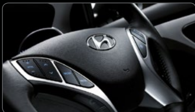
Premium Steering Wheel (Elite and Premium)