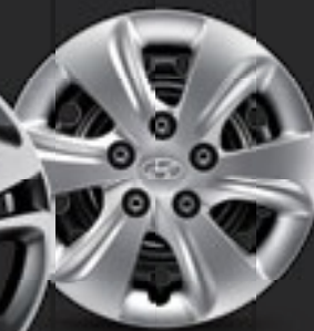
195/65R15 Steel Wheel (Active)