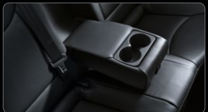
Rear Centre Armrest