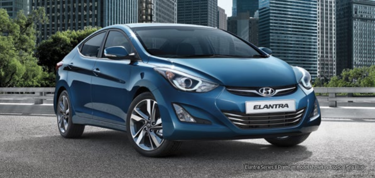
Elantra Series II Premium model shown in Tropical Sea Blue.