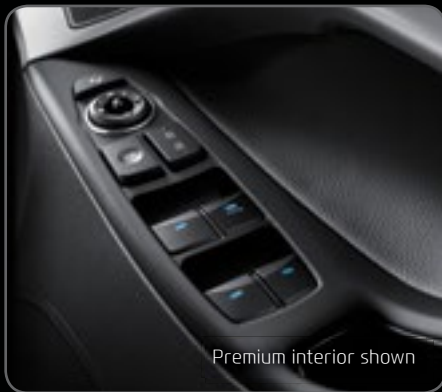
Premium interior shown

From start to finish, the Elantra makes a bold statement of design and engineering excellence that makes it arguably the best value car on the road today.