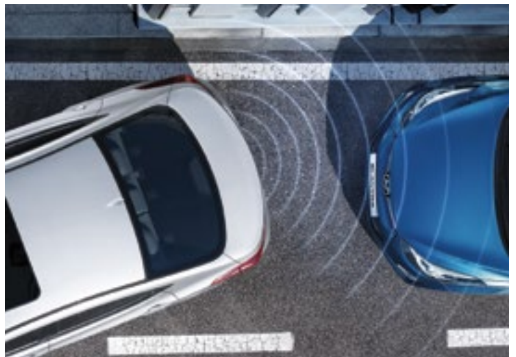
Rear Parking Sensors

Rear parking sensors warn you when you're getting too close to an object, while a rear view camera (Elite & Premium) built into the rear of the vehicle provides a colour LCD image on the 7" Touchscreen of the area behind the vehicle, for additional safety and protection.