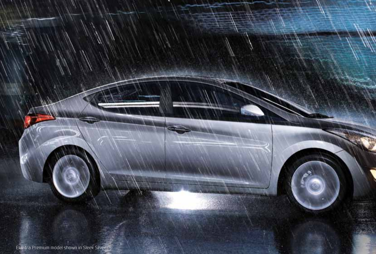
Elantra Premium model shown in Sleek Silver