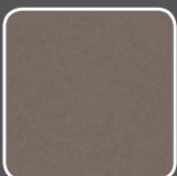
Bronze Metalic (P7N)