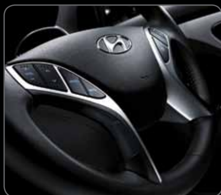
Premium Steering Wheel