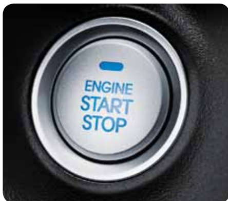
Push Button Start (Elite and Premium)