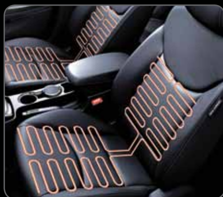
Heated Front Seats (Premium Only)