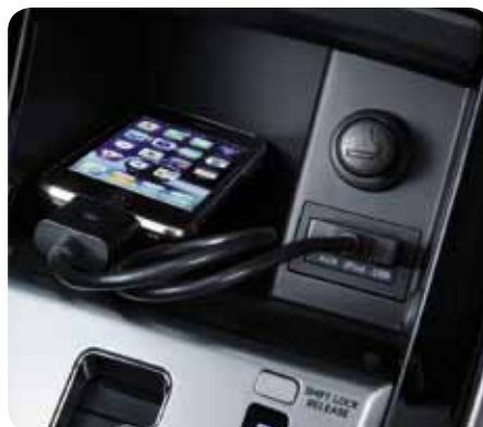
iPod, AUX & USB Support*