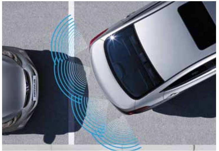
Rear Parking Sensor

Parking sensors warn you when you're getting too close to an object, while a reverse camera (Premium only) built into the rear of the vehicle provides a colour LCD image of the area behind the vehicle, for additional safety and protection.