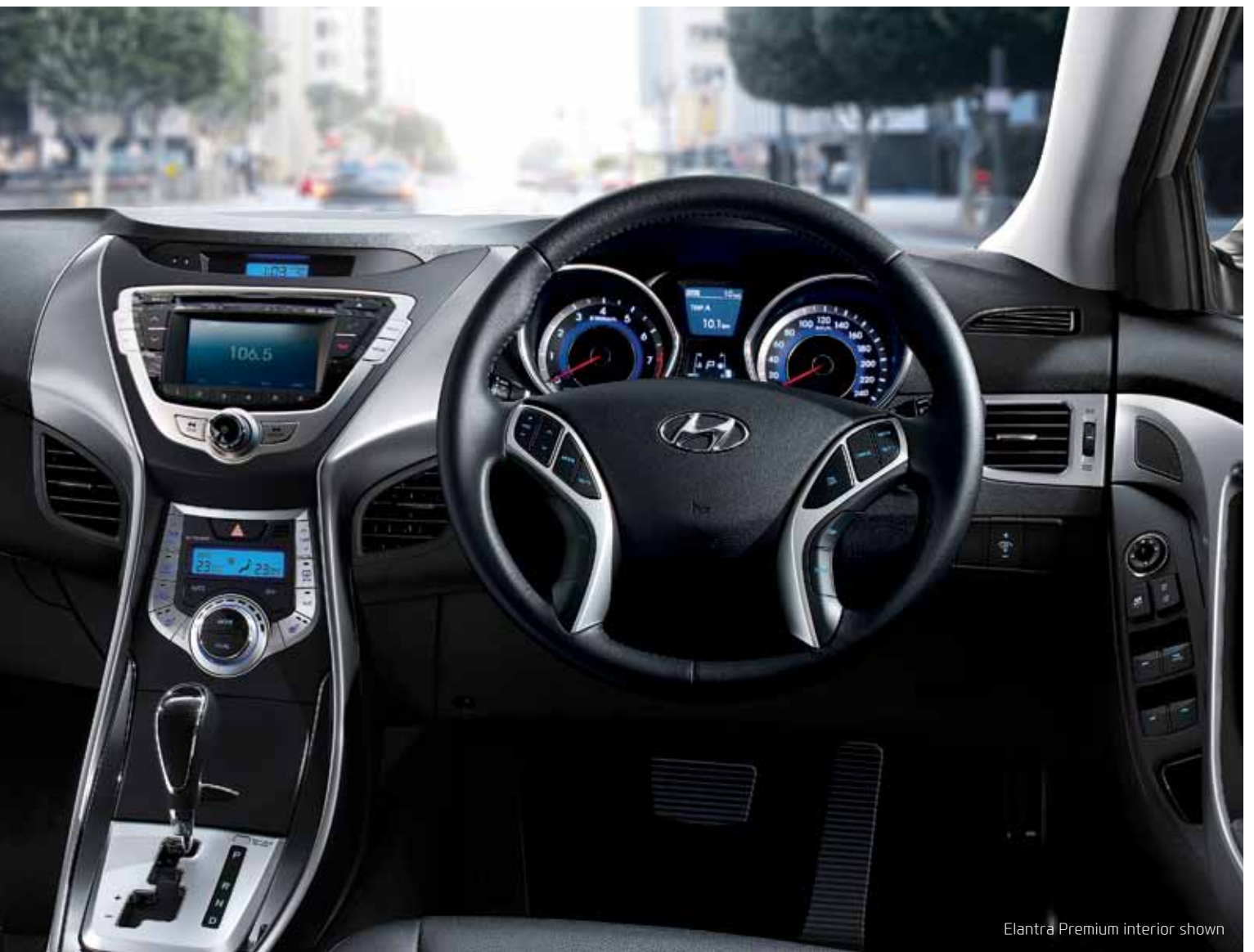
Elantra Premium interior shown