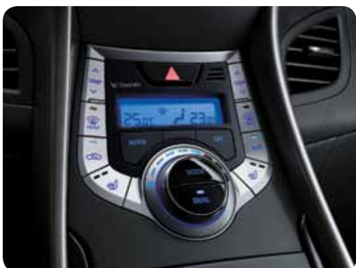
Dual Zone Auto Climate Control (Elite and Premium)

Elantra Premium model shown in Sleek Silver