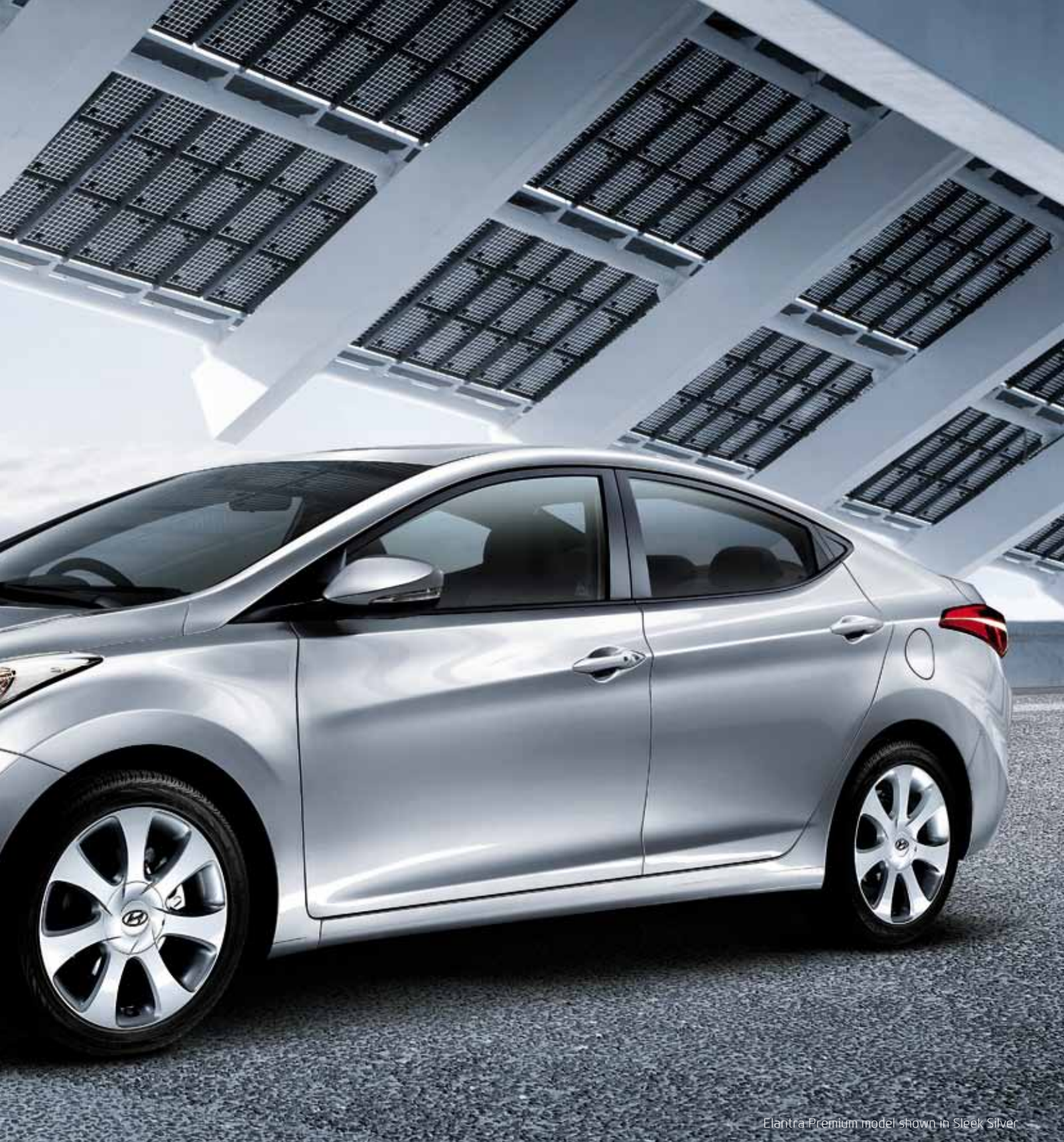
Elantra Premium model shown in Sleek Silver