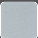
Sleek Silver Metalic (P3S)