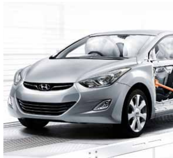
Safety intrusion beam

While driving the Elantra, a myriad of active safety technologies are continuously at work, monitoring the vehicle's performance and handling, ready to spring into action to assist you maintain or regain control. These include the Electronic Stability Control (ESC) with Traction Control System (TCS), which senses the loss of wheel grip (such as when skidding) and then applies individual wheel braking, together with engine and transmission adjustments, to help you get the vehicle back on its intended course.