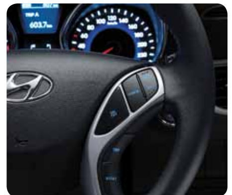
Steering Wheel Mounted Audio Controls