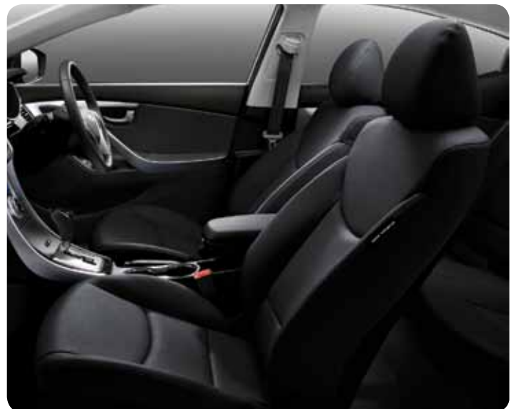
Elantra Premium interior shown