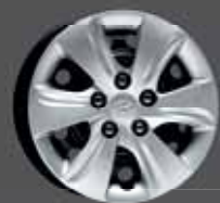
195/65R15 Steel Wheel (Active)

The Elantra comes with a choice of 15" steel wheels or 16" and 17" alloy wheels with flangeless designs that project a stronger, sturdier appearance and create a neat, clean finish.