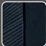
Knit (Oceanids Black)