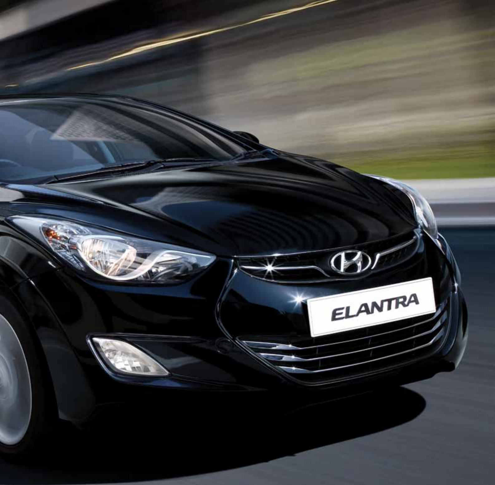
Elantra Premium shown in Phantom Black