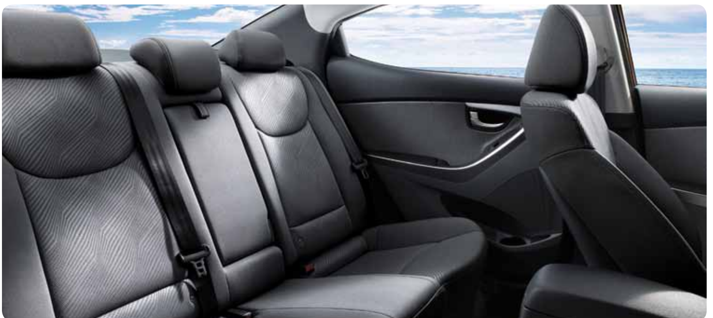
Elantra Elite interior shown

The Elantra delivers all the luxurious space you'd expect in a much bigger car. With loads of legroom, generous headroom and class-leading shoulder room for both front and rear-seat passengers, the Elantra allows five adults to enjoy the journey in comfort, putting it in a class of its own.