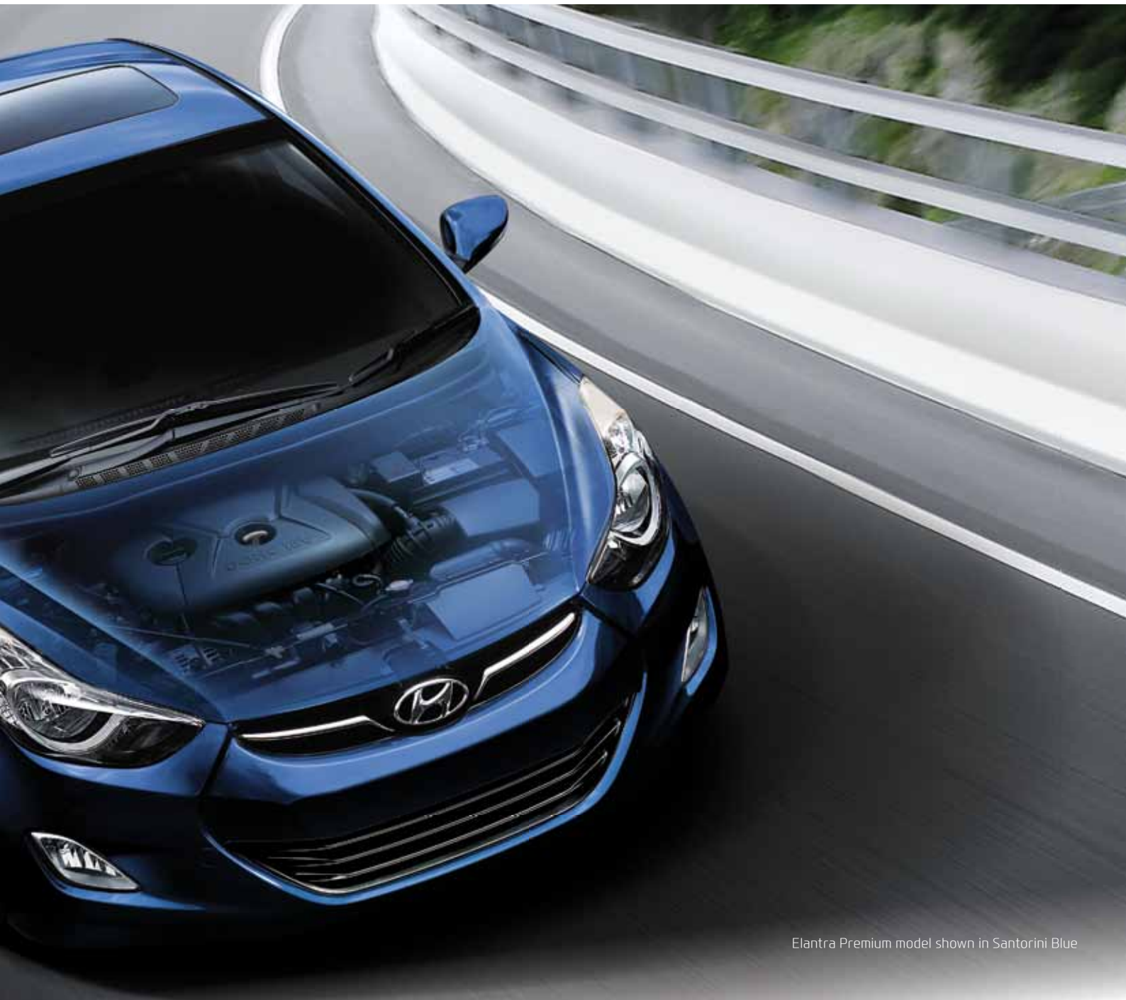
Elantra Premium model shown in Santorini Blue