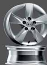
205/55R16 Alloy Wheel (Elite)