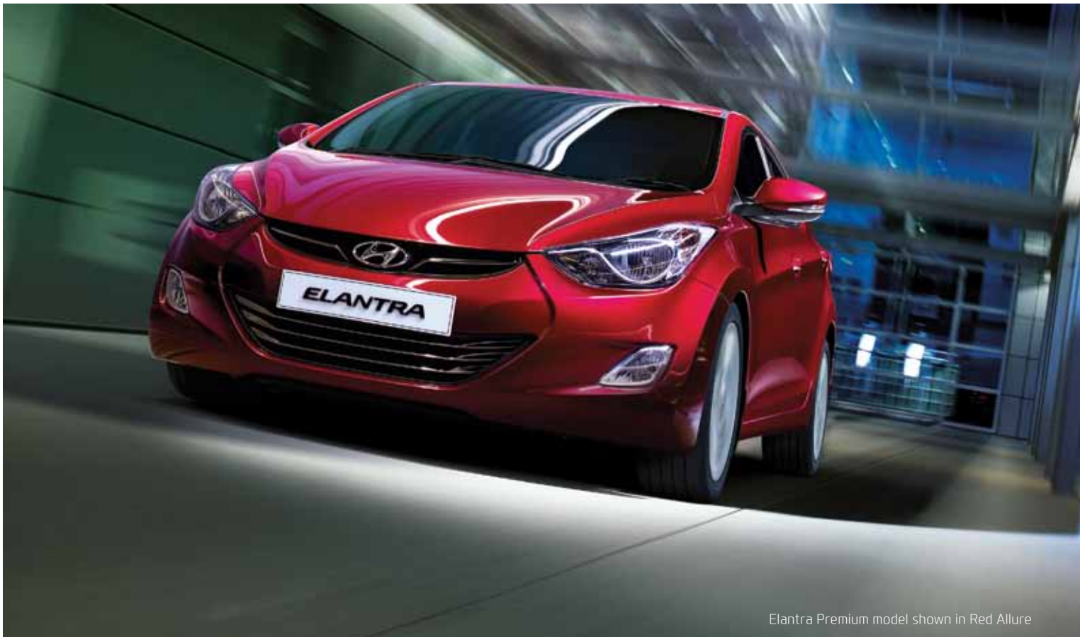
Elantra Premium model shown in Red Allure