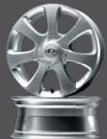
215/45R17 Alloy Wheel (Premium)