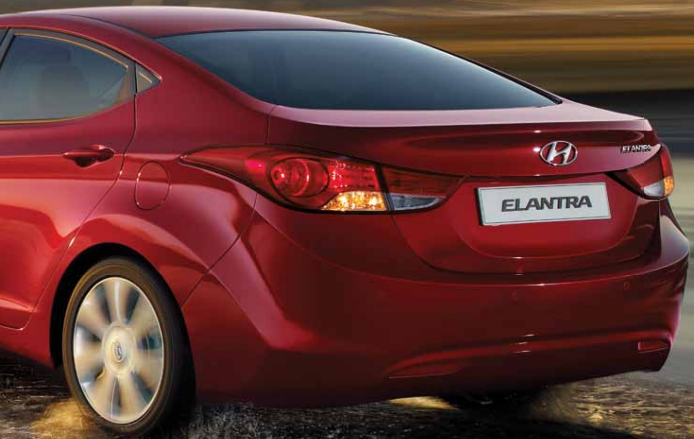
Elantra Premium model shown in Red Allure