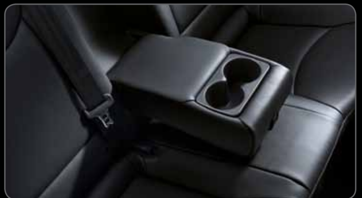
Rear Centre Armrest