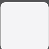
Creamy White Solid (YAC)