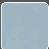
Clean Blue Metalic (P2U)