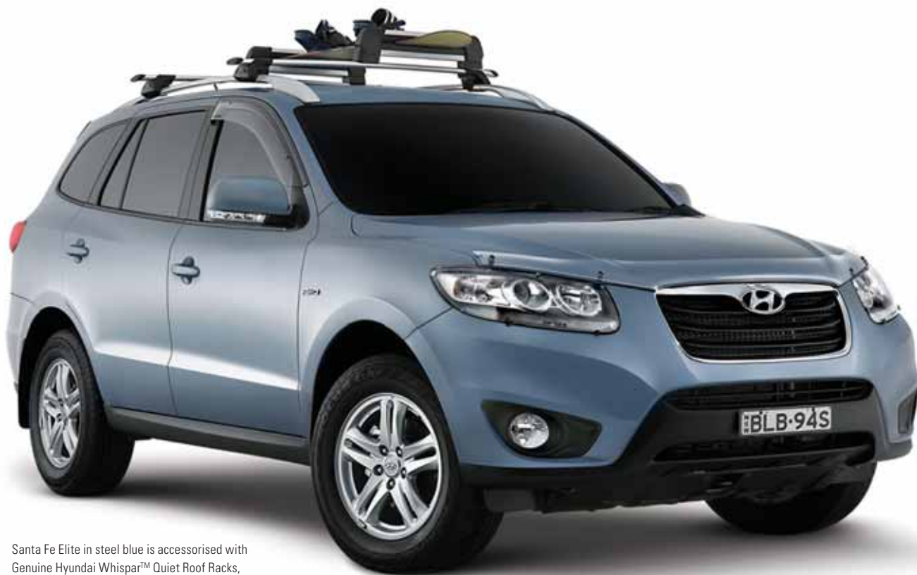
Santa Fe Elite in steel blue is accessorised with Genuine Hyundai Whisper™ Quiet Roof Racks, Snowboard Carrier, Bonnet Protector, Headlight Protectors & Stylevisors.