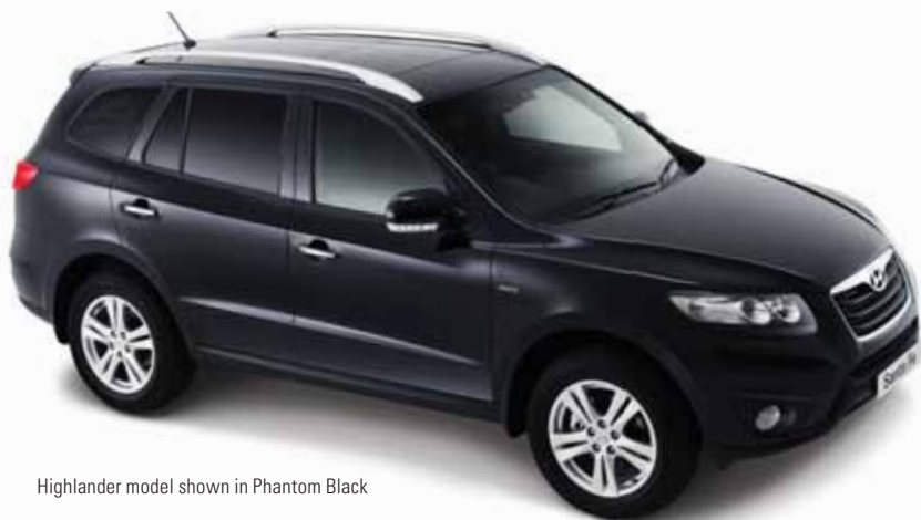
Highlander model shown in Phantom Black

An extensive dealer network and full warranty support means your confidence in your Hyundai need never be compromised.