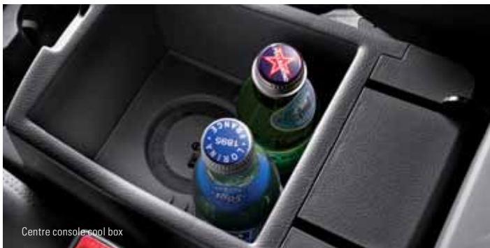
Centre console cool box