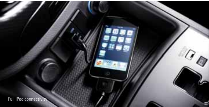
Full iPod connectivity