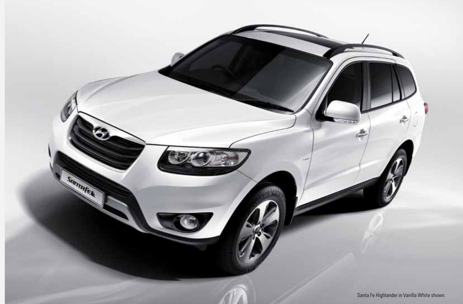
Santa Fe Highlander in Vanilla White shown.

Designed to fit the individual contours of your new Santa Fe R these tough, durable, acrylic Headlight Protectors ensure that chips and marks on your headlight lenses don't compromise your night-time driving safety. A Genuine Hyundai Bonnet Protector helps you maintain your Santa Fe R's pristine showroom looks by guarding against unsightly pitting from stone chips. Made from tough, durable, shock-resistant acrylic that's UV resistant to prevent cracking, fading and distortion they're also easily removed for cleaning, which simply requires hot soapy water.