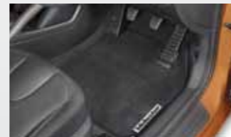
Tailored Carpet Floor Mats (set of 4) • Contoured • High Grade