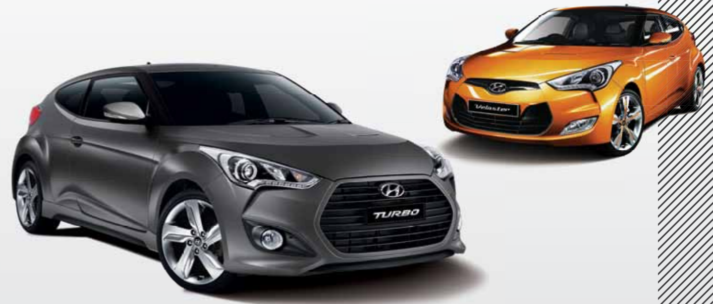
Hyundai Veloster SR Turbo featured above in Young Gun.