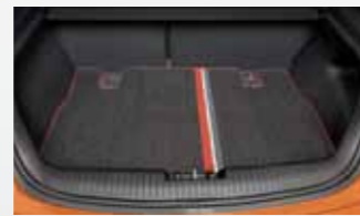
Cargo Liner (Fabric) • Contoured to fit your boot • High Quality Material