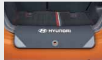
Fabric Rear Bumper Protector • Sturdy • Custom Designed