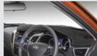
Dash Mat • UV Stabilised • Complementary Colour