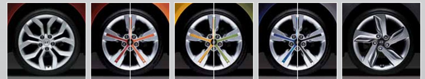
18-inch twin-spoke alloy wheels