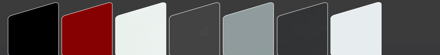
Phantom black MZH (Pearl) | Veloster red P9R (Pearl) | Storm trooper SW2 (Pearl) | Young gun S2G (Matte)* | Battle ship S62 (Pearl) | Petrol grey R62 (Matte)*^ | White crystal PGU (Solid)