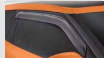
Tinted Stylevisors (set of 2) • Slimline • UV Resistant