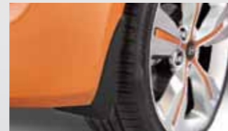
Front & Rear Mudflaps 3 sold separately (set of 4) • Tough Wearing • Protective