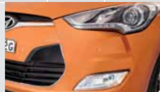
Front Park Assist 4 • Automatic Activation • Four Sensor System