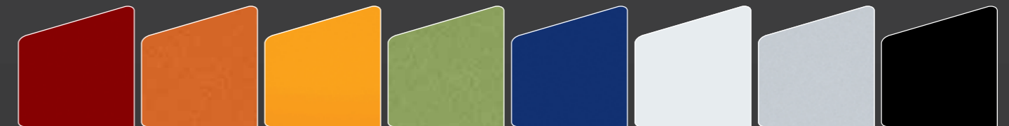
Veloster red P9R (Pearl) | Vitamin C R9A (Pearl) | Sunflower SY9 (Solid) | Green apple VE9 (Pearl) | Blue ocean UU9 (Pearl) | White crystal PGU (Solid) | Sleek silver RHM (Metallic) | Phantom black MZH (Pearl)