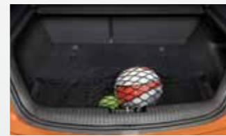
Luggage Net • Safely Secured • Easy to use