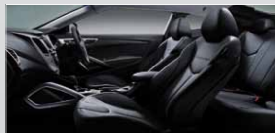
Veloster + interior shown